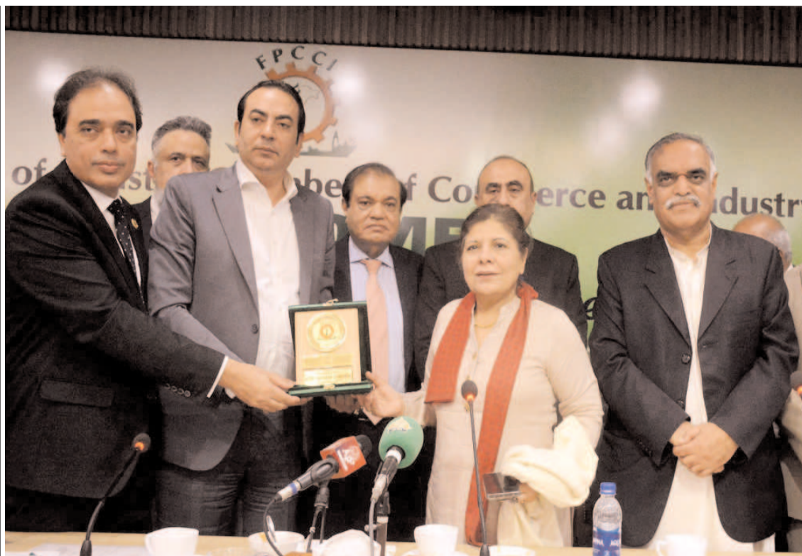
KARACHI: The Caretaker Federal Minister for Finance, Revenue, and Economic Affairs, Shamshad Akhtar addressing members of the Federation of Pakistan Chambers of Commerce and Industry (FPCCI).