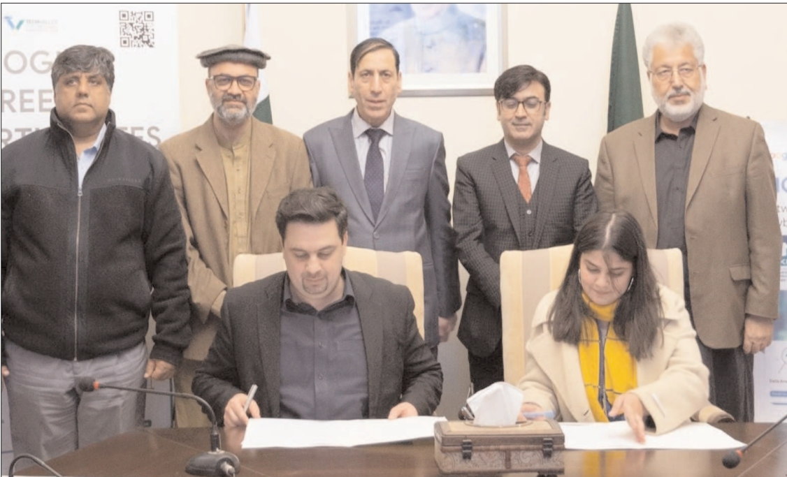
PESHAWAR: KP Caretaker Chief Minister, Justice (R) Syed Arshad Hussain Shah witnessing an MoU signing between KP Information Technology Board and Grow for Google Program.