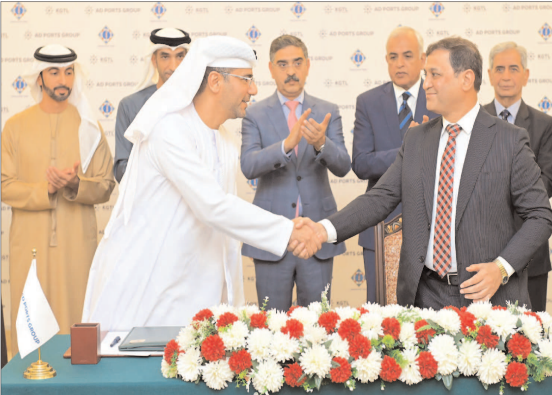
ISLAMABAD: Caretaker Prime Minister Anwaar-ul-Haq Kakar witnessing signing of a commercial agreement between the Authority of Karachi Port Trust, Pakistan and Abu Dhabi Ports Group, UAE.