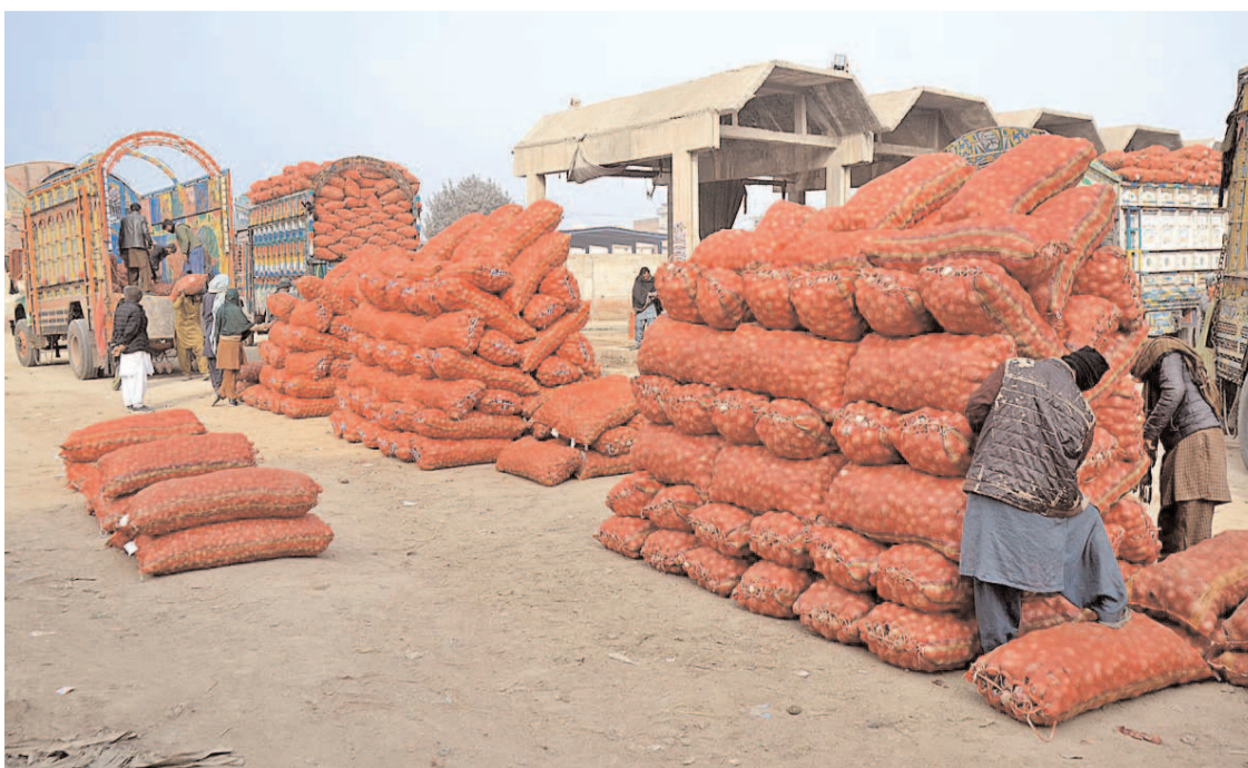
MULTAN: Labourers are busy in unloading sacks of onion from delivery trucks at Vegetable Market.

They're both members of a small group of Big Tech stocks known as the "Magnificent Seven" responsible for the majority of Wall Street's run to a record. Their huge gains have set expectations very high for their growth, which they need to meet to justify the big runs for their stock prices.