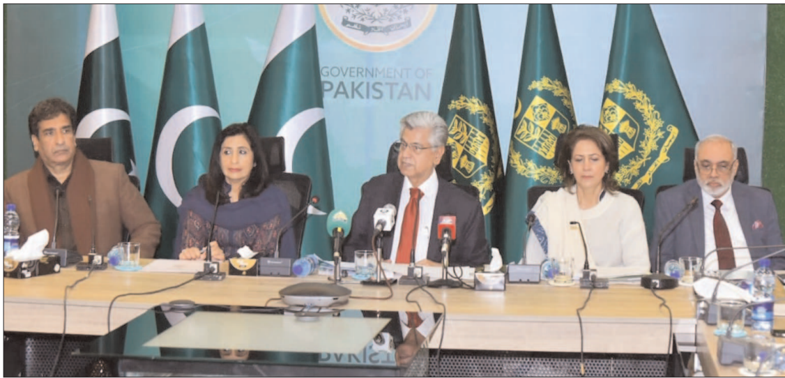
ISLAMABAD: The Federal Minister of Information, Broadcasting, and Parliamentary Affairs, Murtaza Solangi addressing a press conference along with Special Secretary ECP, DG Political Finance, Spokesperson MoFA, EDG External Publicity Wing and PIO, MOIB.