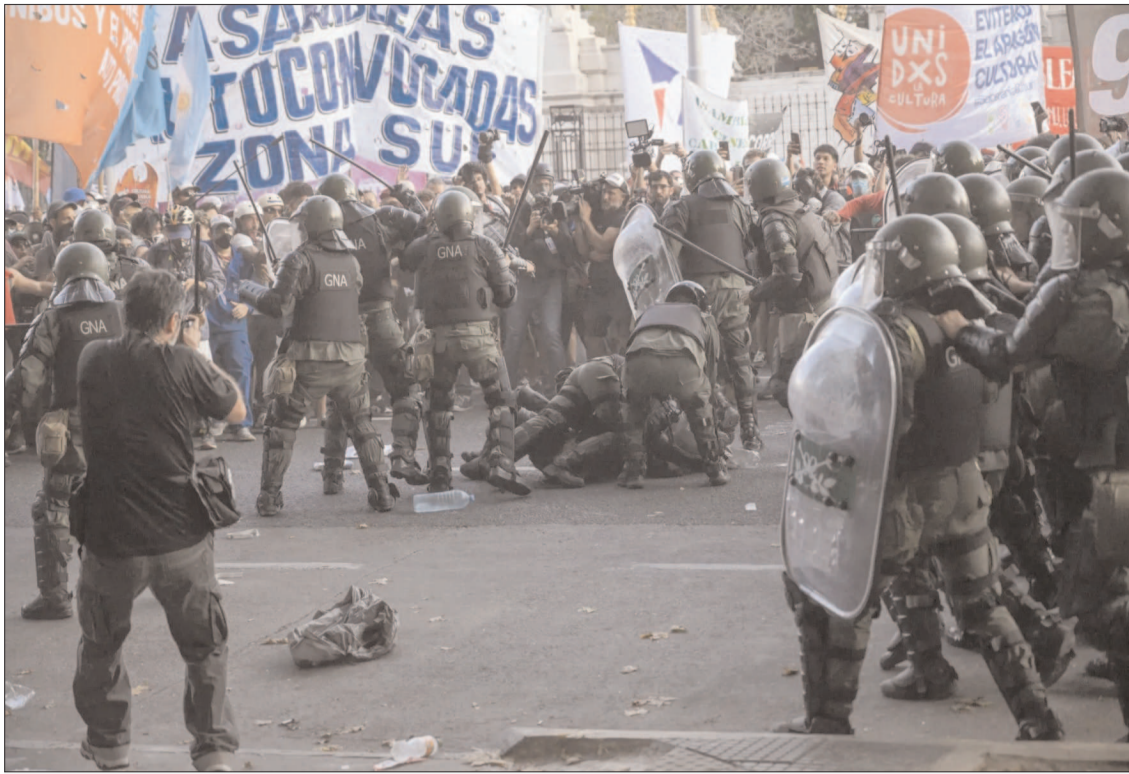
BUENOS AIRES: Police clash with protesters outside the Congress while lawmakers debate the so-called omnibus reform bill.

Passing its initial hurdle in the lower house of Congress, the legislation marks the president’s first major test since taking office in December after a shock election win for the economist who made his name as an acid-tongued TV pundit and campaigned with a chainsaw pledging to slash the size of the state. The vote followed a long and heated debate in the lower chamber, with deputies for the main center-left Peronist opposition bloc, Union por la Patria, voicing fierce rejection of Milei’s policies while supporters urged them not to obstruct the bill. Milei’s La Libertad Avanza party only holds a small number of seats in the 257-seat chamber, but was still able to muster enough support from likeminded allies including from the main center-right Juntos por el Cambio coalition of parties to advance the bill. Last week, Milei’s government yanked some divisive spending reforms contained within the fiscal section from the bill in what turned out to be a successful maneuver to boost support for it.