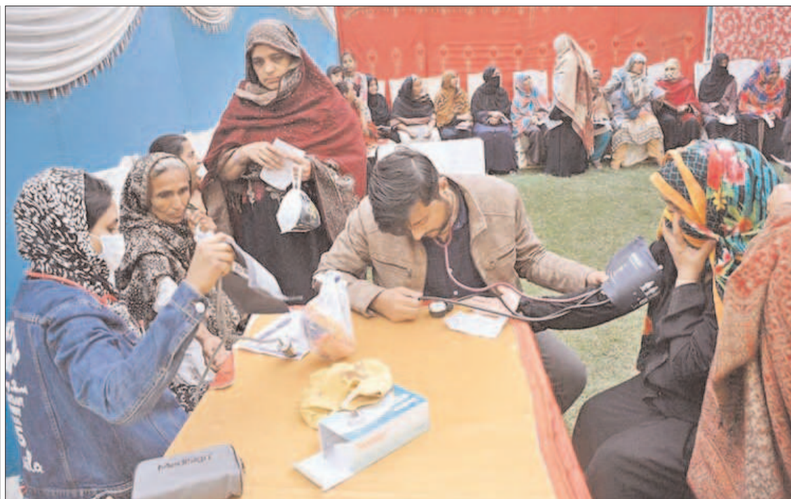
HYDERABAD: Doctors examining patients before eye operation during free eye camp organized by Hyderabad Host Lions Club at Police Line Ground.