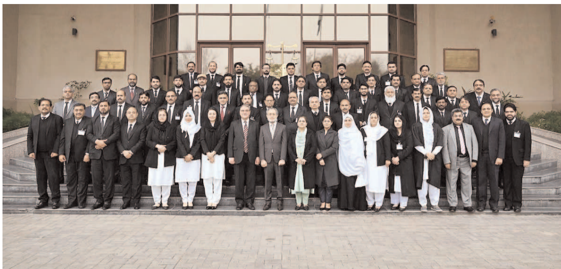
ISLAMABAD: District Judiciary Judges in a group photo with Hon'ble Mr. Justice Jamal Khan Mandokhail at the Federal Judicial Academy.

ISLAMABAD (Monitoring Desk): Celebrated singer and music composer Ali Zafar is gearing up to lend his vocals to the official anthem of PSL Season 9. The announcement, made on the PSL account, confirms that Ali Zafar has been working on creating the musical magic for this season.