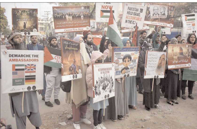
LAHORE: Members of civil society holding placards during protest against Israel attacks on Gaza.

The spontaneous and unscripted nature of this visit has garnered widespread appreciation, showcasing the Pakistan Army’s dedication to fostering community bonds and safeguarding the rich cultural heritage of Peshawar. Lt Gen Hassan Azhar Hayat’s tour stands as a testament to the army’s commitment to peace, security, and the well-being of the people it serves.