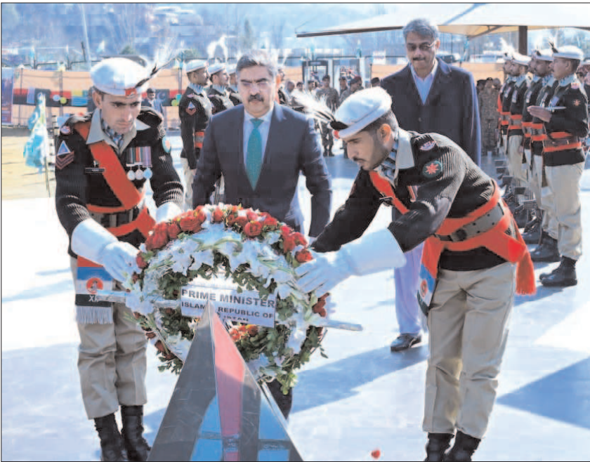
MUZAFFARABAD: Caretaker Prime Minister Anwaar-ul-Haq Kakar laid a floral wreath at the Martyres Monument on Kashmir Solidarity Day.