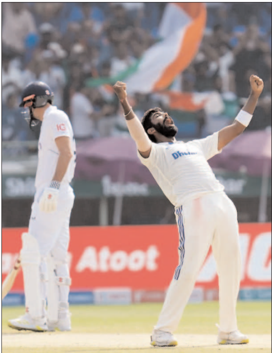
Jasprit Bumrah celebrates after taking the final wicket.

He said, sports coaches assist athletes in developing to their full potential. They are responsible for training athletes in a sport by analyzing their performances, instructing in relevant skills and by providing encouragement.