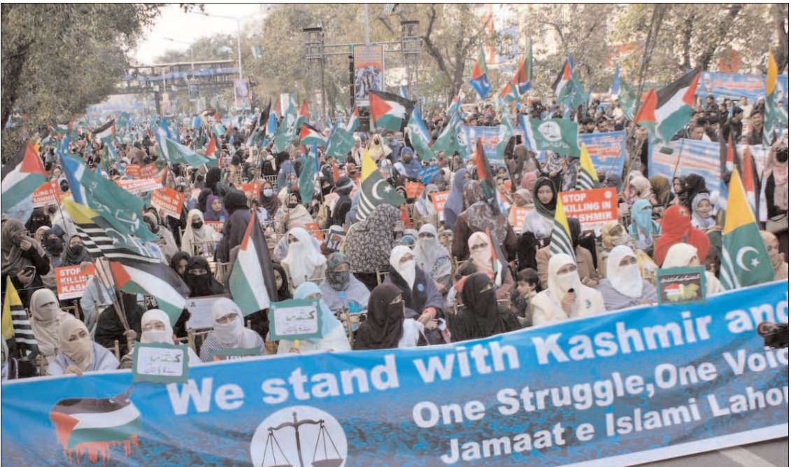
LAHORE: Women participating in rally on the occasion of Kashmir Solidarity Day at Mall Road.

He said Police and Rangers personnel would be deployed at all highly sensitive polling stations while Army soldiers would be deployed where the District Administration deemed it necessary.