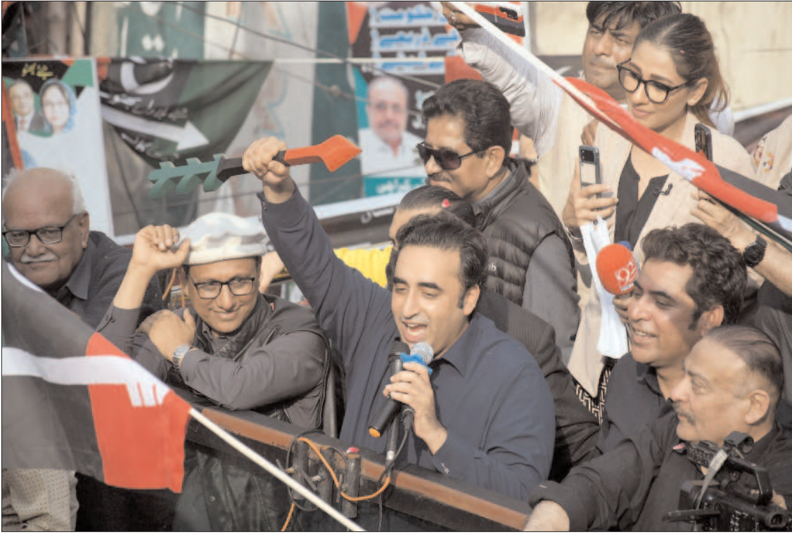
KARACHI: Chairman PPP Bilawal Bhutto Zardari waving to supporters during election campaign rally.