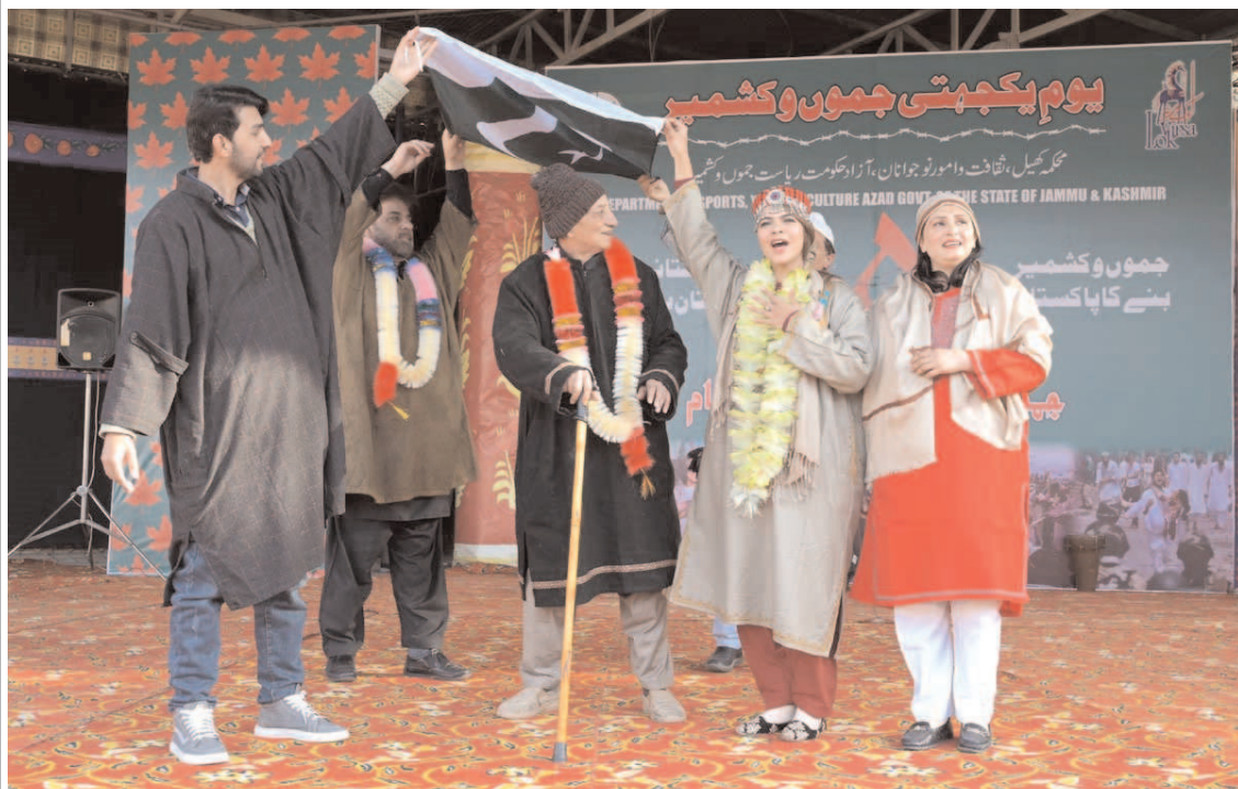
ISLAMABAD: Kashmiri artists performing on the stage during culture programme on the occasion of Kashmir Solidarity Day organized by Department of Sports, Youth and Culture of Azad Jammu and Kashmir at Lok Virsa.

solve long standing issues of people of this constituency. He said that the residents of several areas including Qasimabad, Naseerabad, Allahabad, Carriage Factory Colony, Misrial Road, Friends Colony, Dhoke Gujran, Chakra Road, Dhoke Bannaras, Afshan Colony, Chur Harpal, Range Road, Siham, Dhoke Mustaqeem, Tariqabad, Azizabad (Mughalabad), Abid Majeed Road, Tench Bhatta, Mohalla Hajian, Allama Iqbal Colony, Dispensary Ground, Mughalabad, Jan Colony, Rawal Town, Kamalabad, Dhoke Syedan, Bakra Mandi, Ghaziabad, Chamanabad, Afshan Colony, Dhoke Chudharian, Dheri Hasanabad, Tahli Mouri, and others were facing problems due to lack of basic facilities.