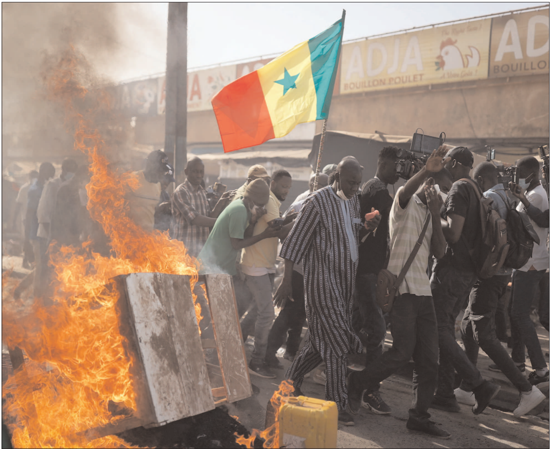
DAKAR: Police made arrests and fired tear gas at opposition supporters during protests against the decision by President Macky Sall to postpone Senegal's elections.