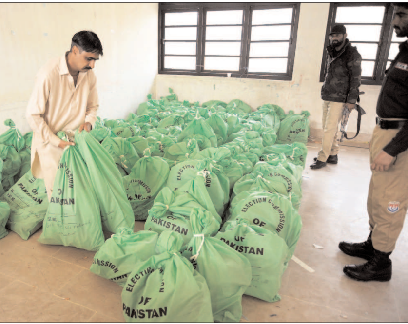
HYDERABAD: Workers of Election Commission and police officials busy in sorting and distribution of bags of election material.

Upon reaching the distressed Tug, PMSS KASHMIR secured the Tug alongside and after three hours of strenuous repair efforts the defect was rectified. Besides technical assistance, medical facilities, fresh water and cooked meals were also provided to the fatigued crew of the Tug. Upon completion of SAR operation, the tug successfully resumed its voyage towards next port of call at Sharjah UAE.