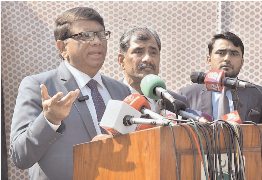
LAHORE: Provincial Election Commissioner Punjab Ijaz Anwar Chohan addressing a press briefing in the Provincial Election Office.

Responding to inquiries, Chohan confirmed the formation of a committee to investigate the NA-127 incident, underscoring the commission's independence and commitment to ensuring a level playing field for all parties. He reiterated the commission's dedication to upholding the integrity of the electoral process and pledged to take strict action against any interference in ensuring peaceful general elections