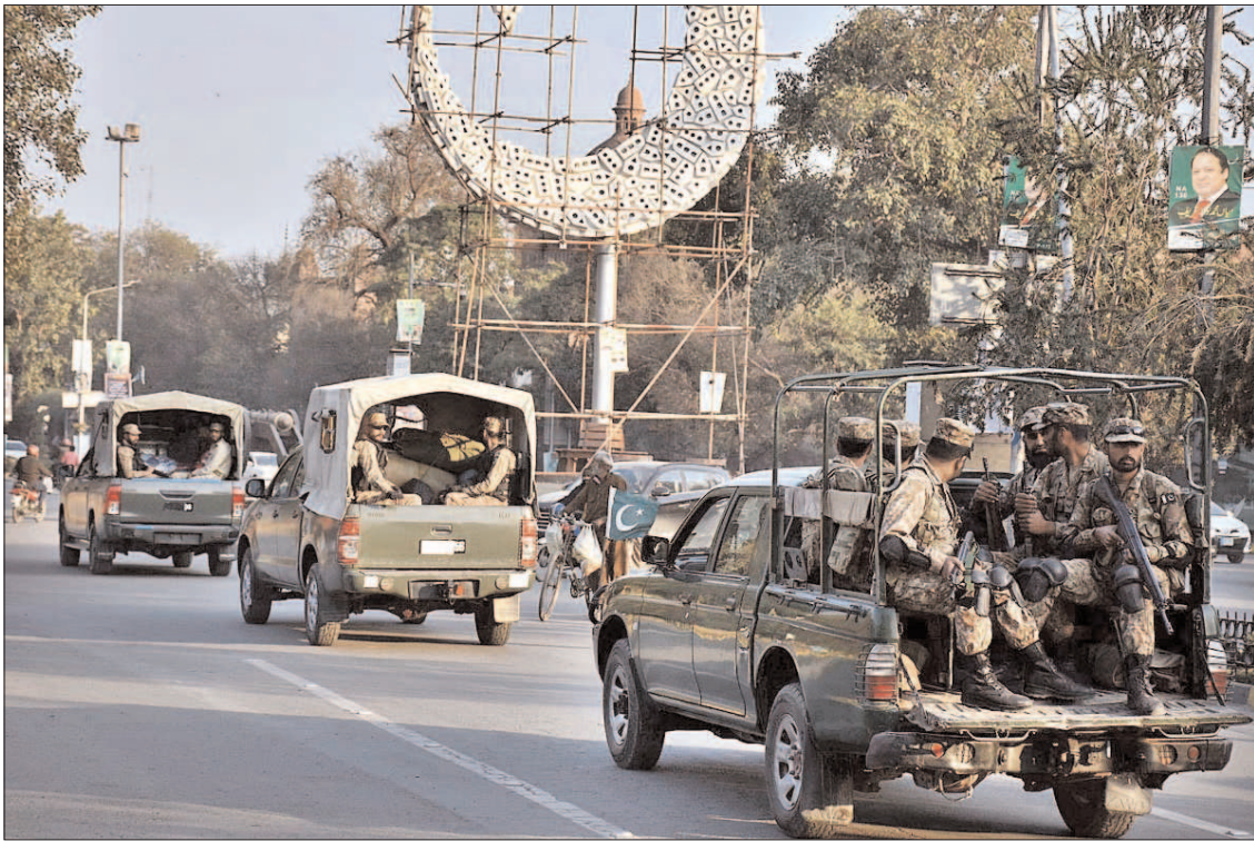
LAHORE: A convoy of army personnel patrols along a road in the city to develop a sense of protection among the masses and maintain law and order situation during the General Election 2024.