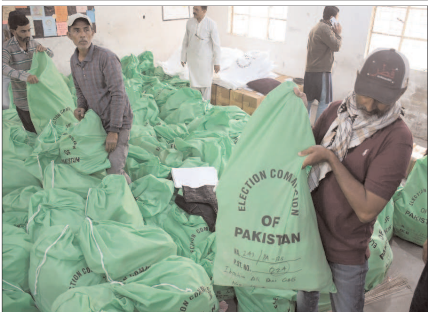
KARACHI: Election Commission officials busy in setting of election material ahead of general election.