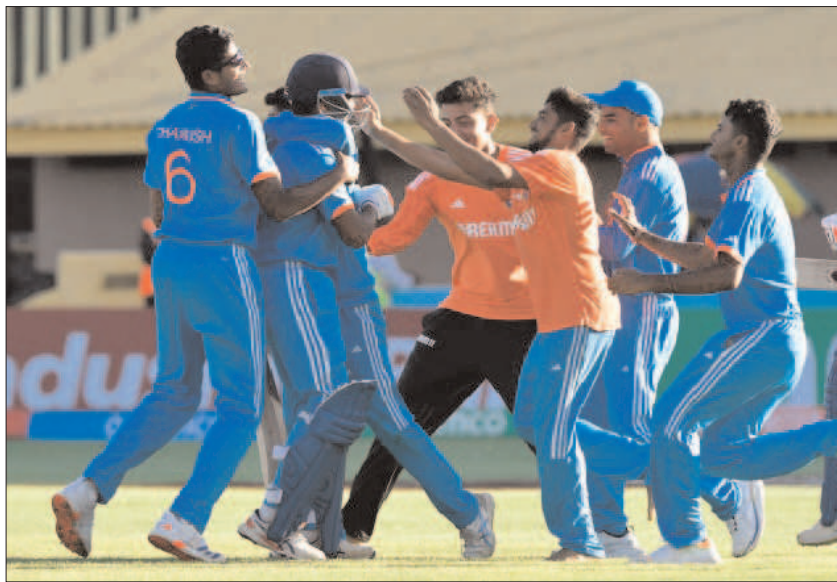
BENONI: Indian players celebrate their victory over South Africa while South African players show disappointment during the ICC U19 Men's World Cup 2024, Semi Final match between India and South Africa.

The biological passport system is designed for the long-term monitoring of an athlete's blood indicators with the aim of identifying irregularities that could indicate doping.