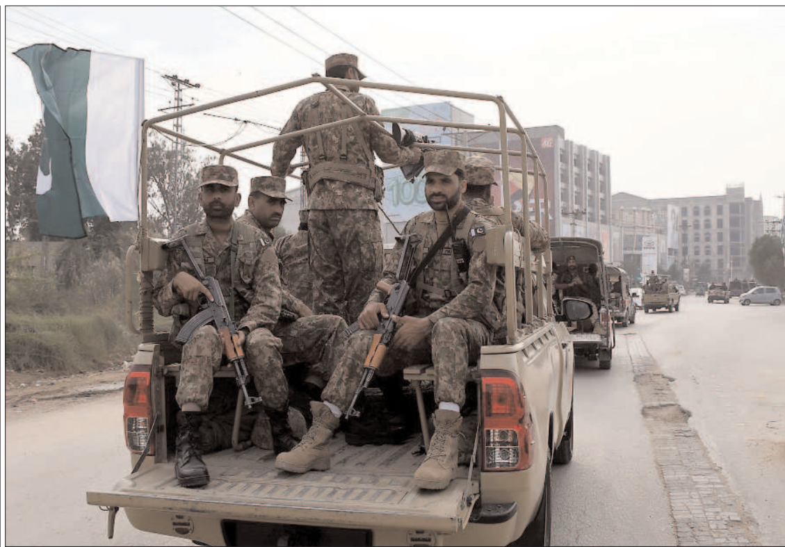
HYDERABAD: A convoy of security personnel patrolling in city ahead of upcoming general elections.