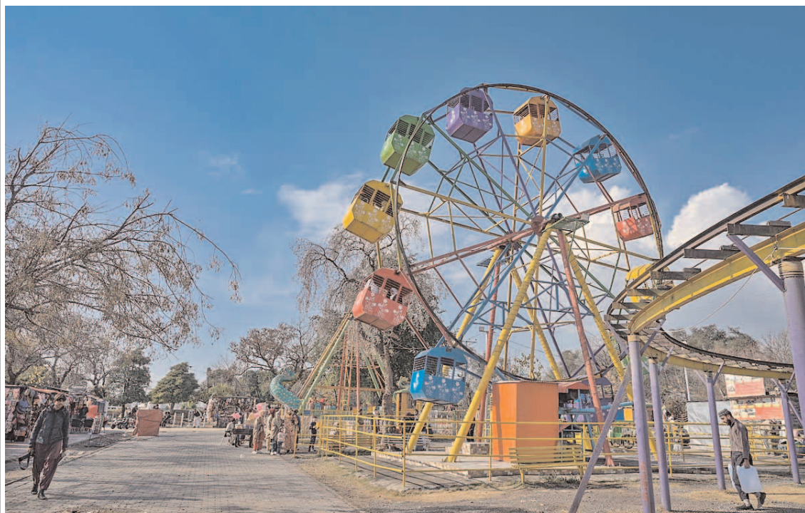
RAWALPINDI: A view of banners of candidates displayed at Committee Chowk in connection with upcoming General Election 2024.

The official said PR owned 167,690 acres of land across the country, of which 90,326-acre was in Punjab, 39,428-acre in Sindh, 28,228-acre in Balochistan, and 9,708-acre in Khyber Pakhtunkhwa.