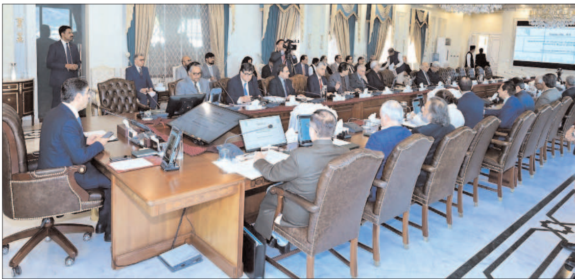
ISLAMABAD: Caretaker Prime Minister Anwaar-ul-Haq Kakar chairing a meeting of caretaker federal cabinet.

The decision was reached during the PCB Governing Board meeting held today at the National Cricket Academy. The eagerly awaited announcement came after a key gathering hosted at the prestigious National Cricket Academy, where representatives from diverse regions and organizations convened to participate in the electoral process.