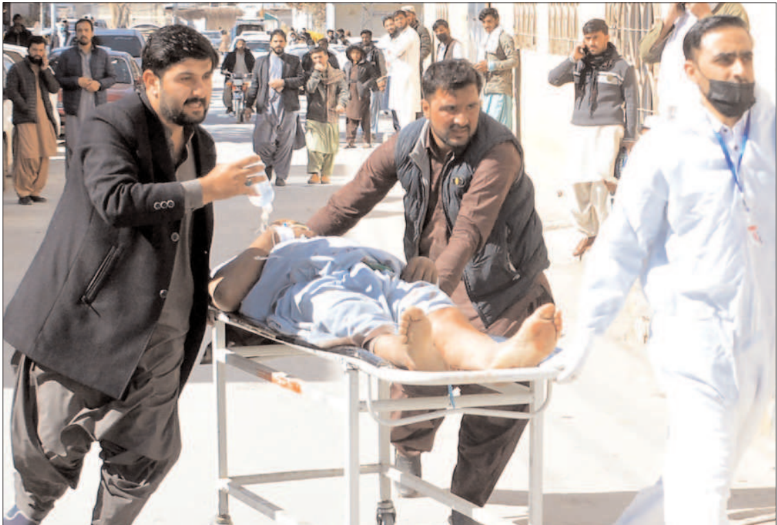
QUETTA: An injured person being shifted to hospital after bomb blast at the election office of an independent candidate in Khanozai Pishin.