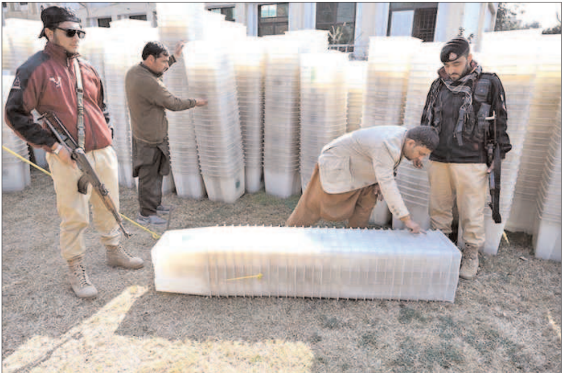
PESHAWAR: Workers of Election Commission Office sorting ballot boxes to be sent to polling stations for upcoming General Elections-2024 at Qayyum Sports Complex