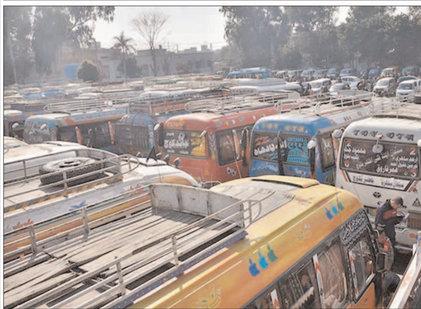
QUETTA: A view of large number of vehicles for delivering polling material in polling stations for General Elections 2024.