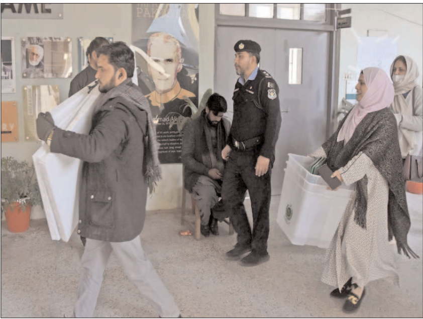
ISLAMABAD: Polling staff members leaving after collecting polling materials for general election.

The ECP has entrusted first class magisterial powers to the DROs and Returning Officers under Section 193 of the Elections Act 2017 "Some 111 political parties have nominated 280 women candidates to contest the elections on general seats, making up 4.6 percent of the total of 6,037 candidates they have fielded," the Free and Fair Election Network (FAFEN) said in a statement. According to Section 206 of the Elections Act, 2017 (Selection for Elective Offices), each political party is required to ensure at least five percent representation of women candidates while selecting candidates for general seats for elective offices, including membership of the Majlis-e-Shoora (Parliament) and Provincial Assemblies, through a transparent and democratic procedure.