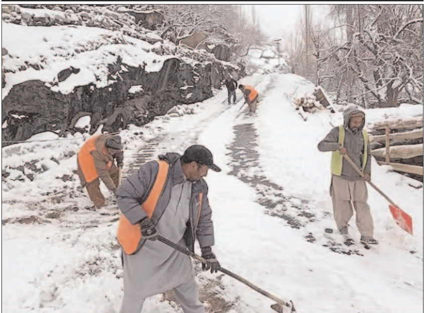
SKARDU: Workers busy removing snow on road to help smooth flow of vehicles at Olding area.

One hundred; In response to the question, caretaker Chief Minister Sindh said that the Election Commission has declared 86 polling stations as flood-affected, which need to be repaired, in addition to this, facilities need to be provided to 1182 additional polling stations. It was informed that political parties have been allowed to make banners, flyers, handbills and pamphlets of their specific size, while they have been prohibited from displaying banner posters on government buildings.