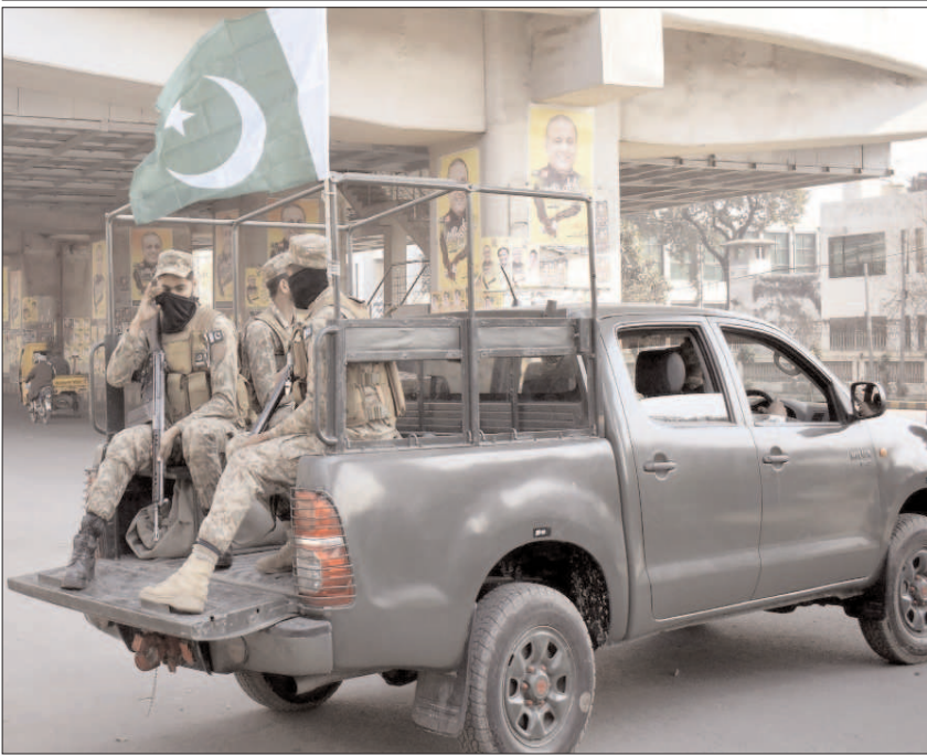
LAHORE: Pakistan Army soldiers patrolling to ensure security ahead of general election.

Its military intelligence said a Russian Tu-95 bomber, who had reportedly taken part in raids on Ukraine, was shot dead in Russia. Ukrainian hackers from the Prana Network broke into a Russian Defence Ministry server, stealing documents that revealed Russia had agreed to pay Iran $1.75bn for 6,000 Shahed drones. Russia kept those drones flying into Ukraine throughout the week, accompanied by missiles. — Aljazeera