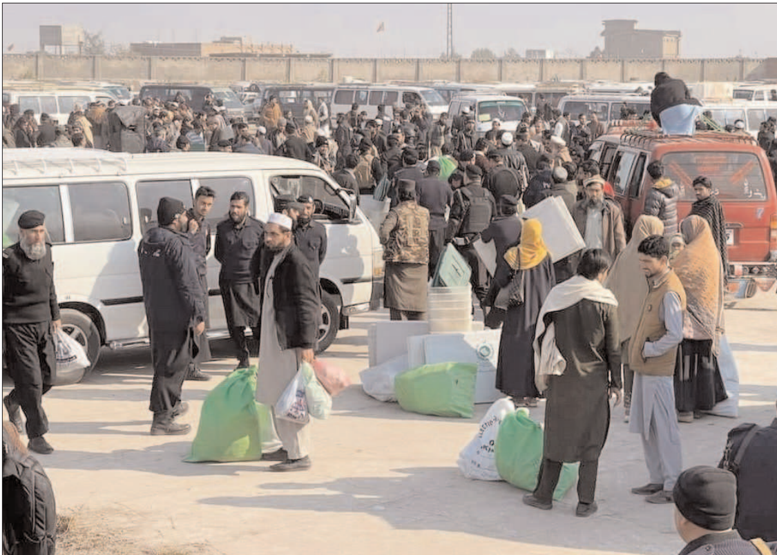
JAMRUD: President Officers receiving election equipments from district Election Commission.