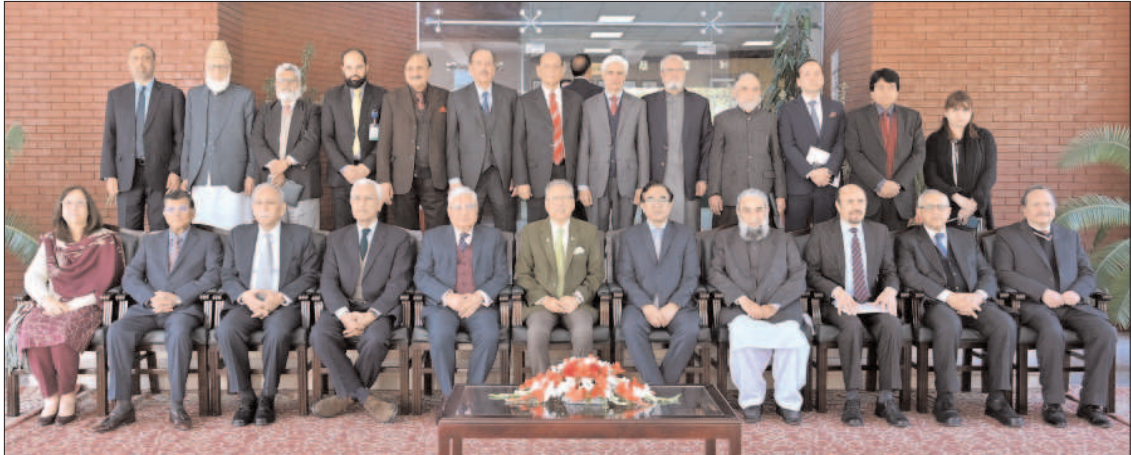
ISLAMABAD: President Dr Arif Alvi in a group photo during his visit to office of the Wafaqi Mohtasib.