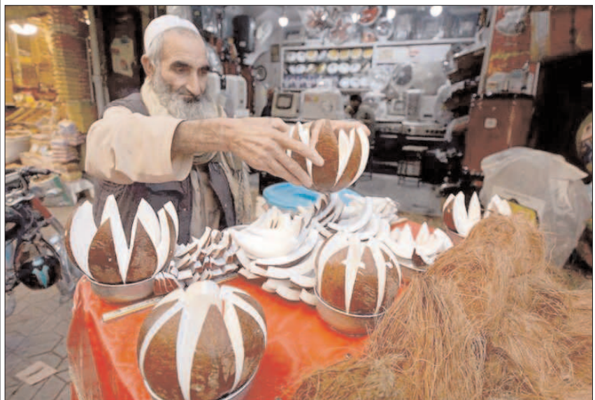
PESHAWAR: An aged man displaying coconuts to attract the customer at Sadar Road.

All support facilities including diagnostic and operation theatres, clinical, surgical and supporting staff in casualty will continue uninterrupted. Also, the IBP facility will remain closed only on February 8, 2024 due to Election Day. All these measures have been arranged only for the election days. After the election, Inshallah, all the services of the hospital will continue as normal on a daily basis.