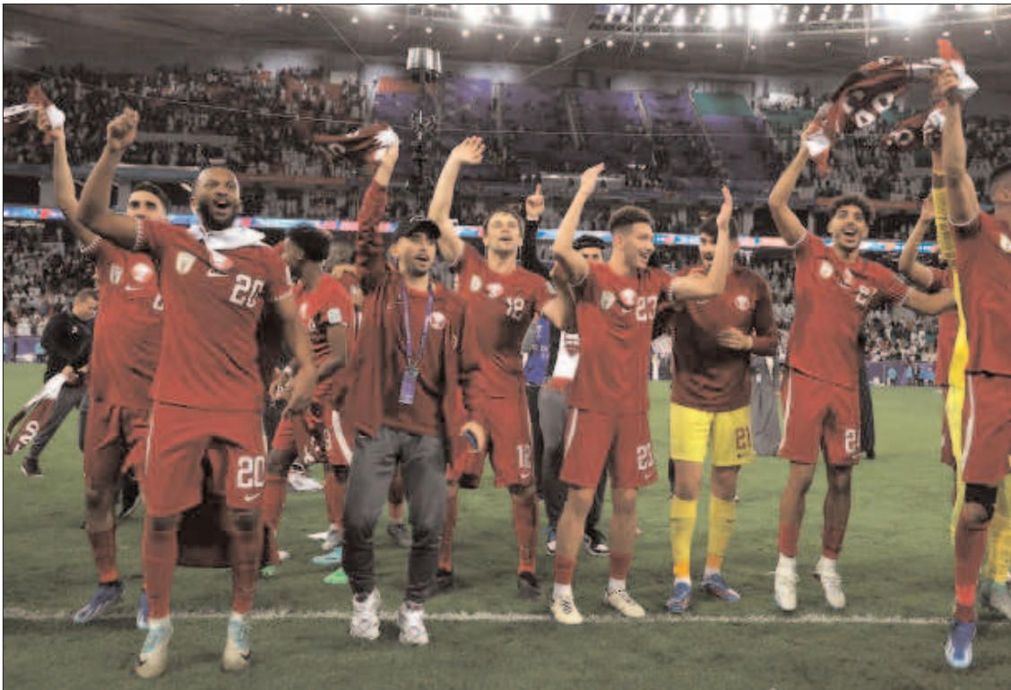
DOHA: Players of Qatar celebrate victory following the AFC Asian Cup Semi Final match between Iran and Qatar at Al Thumama Stadium.

ISLAMABAD (APP): Pakistan's largest homegrown OTT video streaming and entertainment platform, Tamasha was once again, bringing HD live streaming of the HBL Pakistan Super League 2024 (PSL 9). Cricket enthusiasts across Pakistan can now enjoy HD live streaming of all HBL PSL 9 matches on the Tamasha mobile app, said a press release. A signing ceremony between Tamasha and Walee Technologies leadership where Tamasha acquired digital broadcasting rights for the tournament, bringing HD live streaming of all HBL-PSL 9 matches straight to the smartphones of millions of Pakistanis, regardless of their network.