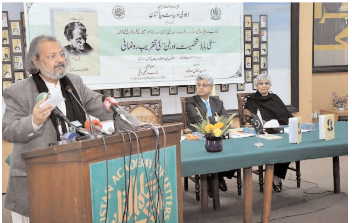
ISLAMABAD: Federal Education Minister Madad Ali Sindhi addressed the discussion forum for his book titled 'Pakistani Adab Kay Ma'maar'.

Implementation of the code of conduct issued by the Election Commission of Pakistan was being ensured at all cost, Syed Khalid Hamdani added. The law and order situation was being continuously monitored through a special control room set up in the police headquarters, the CPO said adding, that the peaceful conduct of elections was a top priority and all available resources were being utilized to ensure the peaceful conduct of general elections 2024.