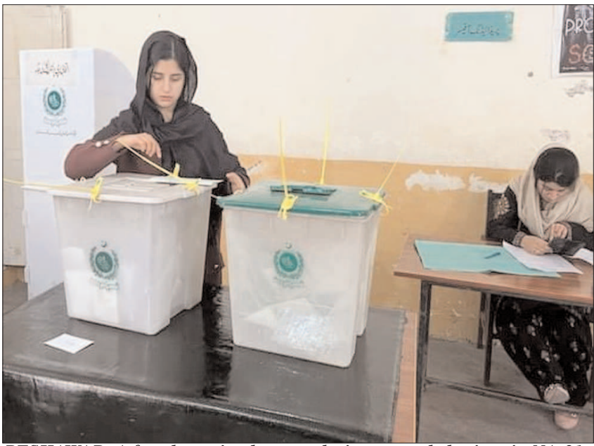
PESHAWAR: A female casting her vote during general elections in NA-31.

In the three main cities of the region, long queues of voters could be seen in polling stations while in the rural and hilly areas, voters came out a bit late.