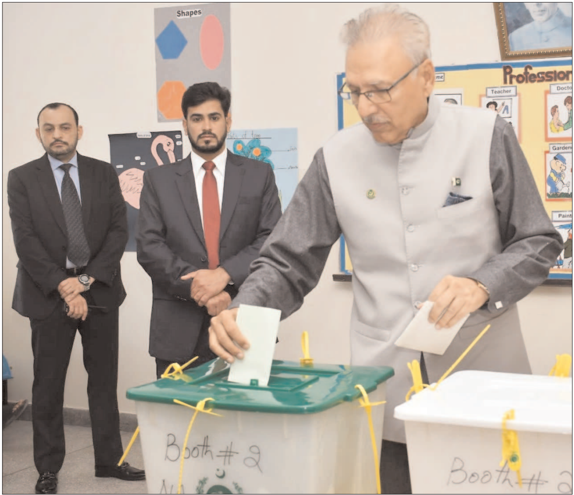
KARACHI: President Dr. Arif Alvi casting his vote in general elections.