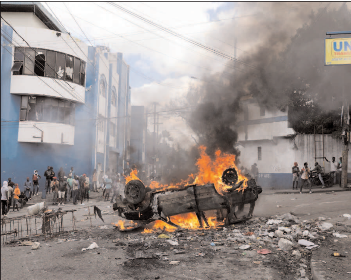
PORT-AU-PRINCE: People stand near a car set ablaze by protesters in Haiti.

Papua New Guinea, which is in a strategically important part of the South Pacific, struggles with tribal violence and civil unrest and wants to increase its police numbers from 6,000 officers to 26,000. Anger over high unemployment and cost of living led to rioting and looting last month in its two biggest cities. Papua New Guinea and Australia "reaffirmed their commitment to the region's existing security architecture as a key driver of security cooperation," a joint statement between Marape and Albanese said.