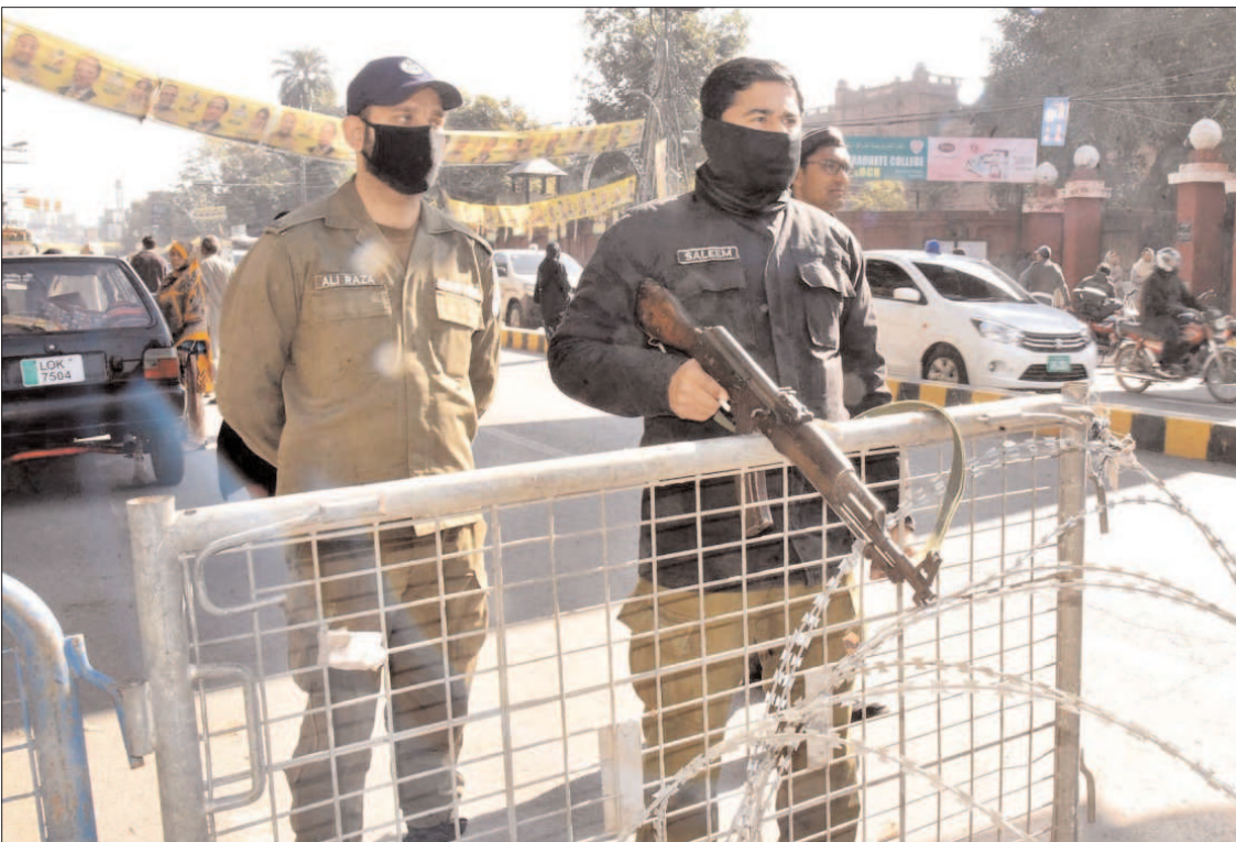
LAHORE: Police officials standing alert outside the polling station during General Election-2024.

According to a Rangers spokesperson, approximately 10,000 Rangers personnel were deployed across the province for security duties during the national general election, with around 6,000 personnel dedicated to Karachi alone.