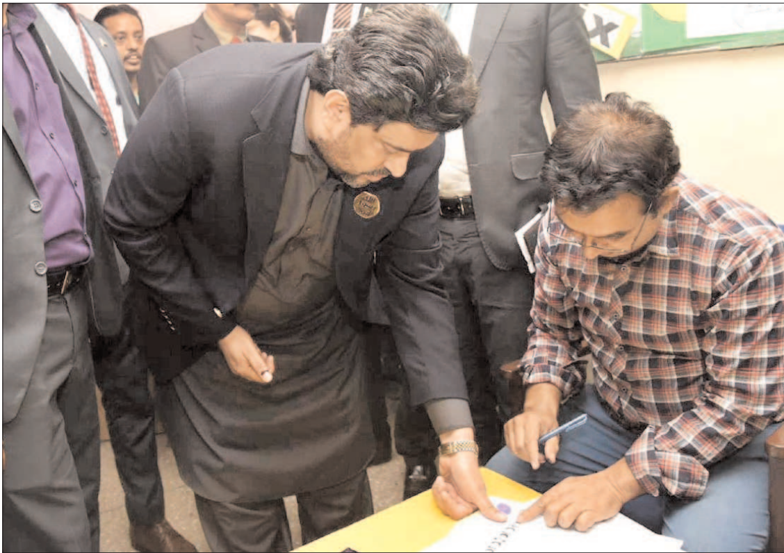
KARACHI: Governor Sindh Kamran Khan Tessori casts his vote at a polling station during General Elections 2024.