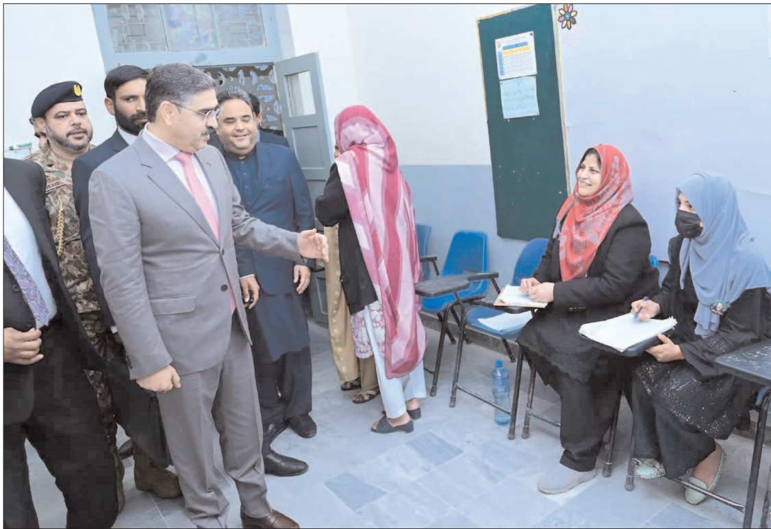
RAWALPINDI: Caretaker Prime Minister Anwaar-ul-Haq Kakar interacting with polling staff during his visit to polling station.

While Bilawal is banking on a divided mandate and get into a future coalition government, a confident Nawaz has completely opposite thoughts, as he on Thursday sought a clear mandate from the people. Asking the voters to reach polling stations, the former prime minister said no coalition government could tackle the challenges currently faced by Pakistan.