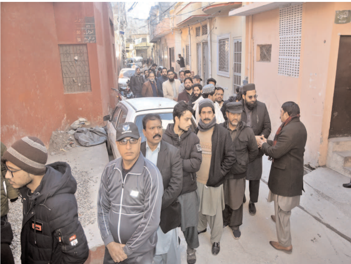
RAWALPINDI: A large number of voters in queue outside polling station during General Elections-2024.

She said that it is our national obligation to cast a vote for our country's progress.