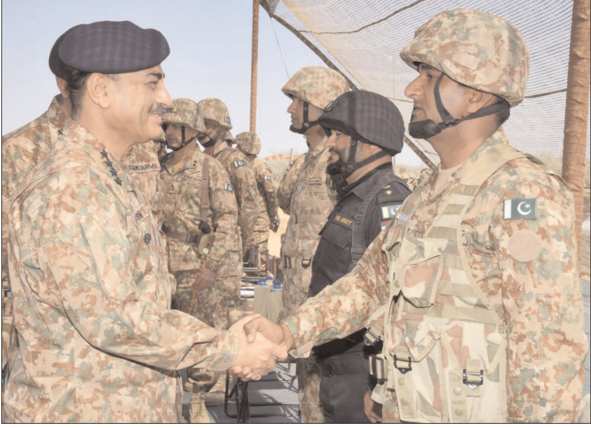
RAWALPINDI: Chief of Army Staff, General Syed Asim Munir shaking hands with a jawan during his visit to field exercise in training area near Rahim Yar Khan.