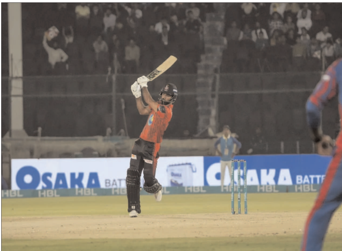
KARACHI: Fakhar Zaman slammed a quick half-century.

of his 37 points in the second half to fuel the turnaround. The Thunder put together a 17-0 scoring run early in the third quarter to take a 68-65 lead and never trailed again. Lakers hang on Elsewhere in the West, D'Angelo Russell scored the game-winner with 5.9 seconds left, lifting the Los Angeles Lakers to a 123-122 victory over the Milwaukee Bucks. The Lakers were without superstar LeBron James, who was sidelined with a sore ankle. Anthony Davis was slowed by an apparent shoulder injury in the second half, but Russell picked up the slack, scoring 21 of his season-high 44 points in the fourth quarter. "I just tried to do whatever I could do," Russell said. "Scoring, assisting, whatever it may be, whatever they need from me... Bron was out, so a lot of guys stepped up." The Lakers withstood Giannis Antetokounmpo's triple-double of 34 points, 14 rebounds and 12 assists. After trailing most of the game, Milwaukee took the lead on an Antetokounmpo jump shot with 2:53 to play.