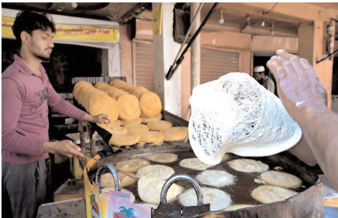
RAWALPINDI: Vendors preparing traditional food item Pheoni in connection with upcoming Holy Fasting Month of Ramadan at Banni Chowk.

ISLAMABAD (APP): LUMS and KPS Cadet School and College students visited the Punjab Safe Cities Authority here on Saturday. The delegation was given a detailed briefing on the PSCA work, and the shift commander showed it round various authority departments. The students were briefed about the Operations and Monitoring Center, 15 Emergency Call Centers, and the Electronic Data Analysis Center. The delegation was briefed on modern policing with the use of artificial intelligence. Safe City has developed AI-based software for automatic helmet and seatbelt detection and gun detection. It was informed to the delegation that facilities like live location of callers and conference calls with first responders have been introduced for those who call on 15. Smart Safe City projects are being implemented in 18 more cities in Punjab. The teachers and students said that the success of the modern Safe City project in Pakistan is a pride for them.