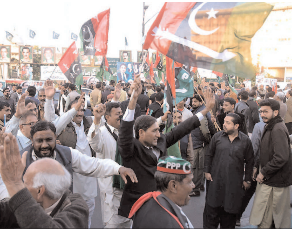
LAHORE: Workers of People's Party celebrating on the victory of President-elect Asif Ali Zardari outside Punjab Assembly.