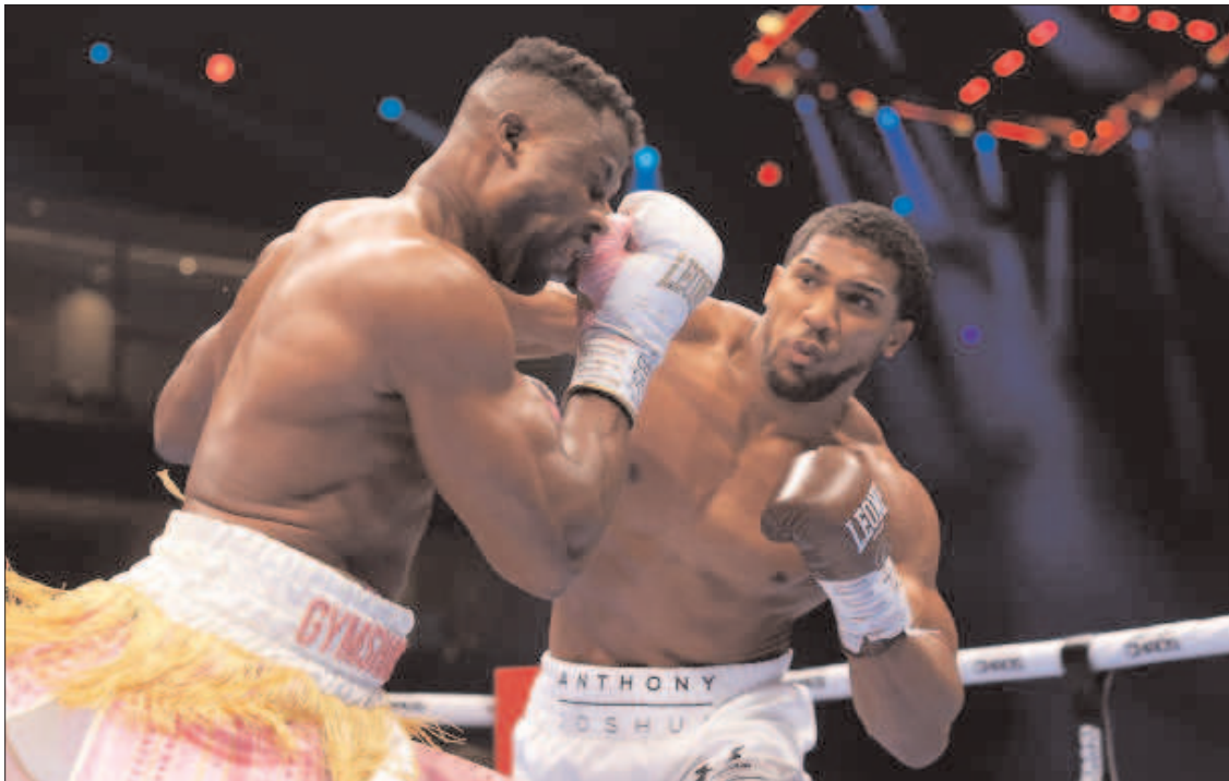
RIYADH: Anthony Joshua punches Francis Ngannou during the Heavyweight fight between Anthony Joshua and Francis Ngannou on the Knockout Chaos boxing card at the Kingdom Arena.

Bashir soon wrapped up the innings in the fifth over of the day when he got Bumrah stumped for 20, completing the 20-year-old's second five-wicket haul in his debut series. Rohit (103) and Shubman Gill (110) set up the huge victory on the second day with a 171-run second-wicket stand to put the England bowlers on the back foot. Rookie batsman Sarfaraz Khan (56) and debutant Devdutt Padikkal (65) also made useful contributions in India's sole innings in response to England's 218. India opener Yashasvi Jaiswal scored 57 and remained the leading batsman in the series with 712 runs, including double centuries in matches two and three. Yadav made his left-arm wrist spin count with his own five-wicket haul to bundle England out on day one after the visitors elected to bat first. England won the opener by 28 runs in Hyderabad with their attacking "Bazball" style of play, which came under fire by the critics in the next three losses, after they suffered regular batting flops.