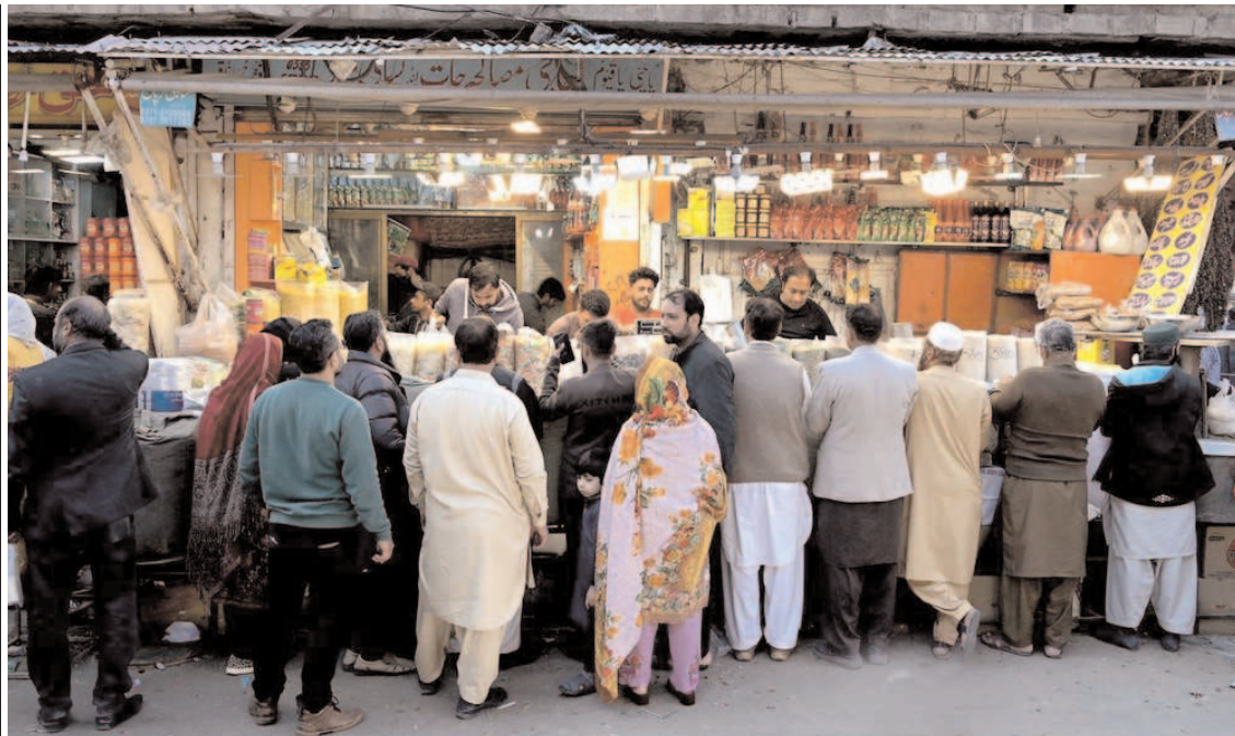
RAWALPINDI: People purchasing food items in connection with upcoming Holy Fasting Month of Ramadan at Banni Chowk.

Overall, the collaboration between CCP and FAS aligns with CCP’s broader objectives of enhancing its international presence and promoting a positive perception of Pakistan on the global stage as attractive marketplace for investors.