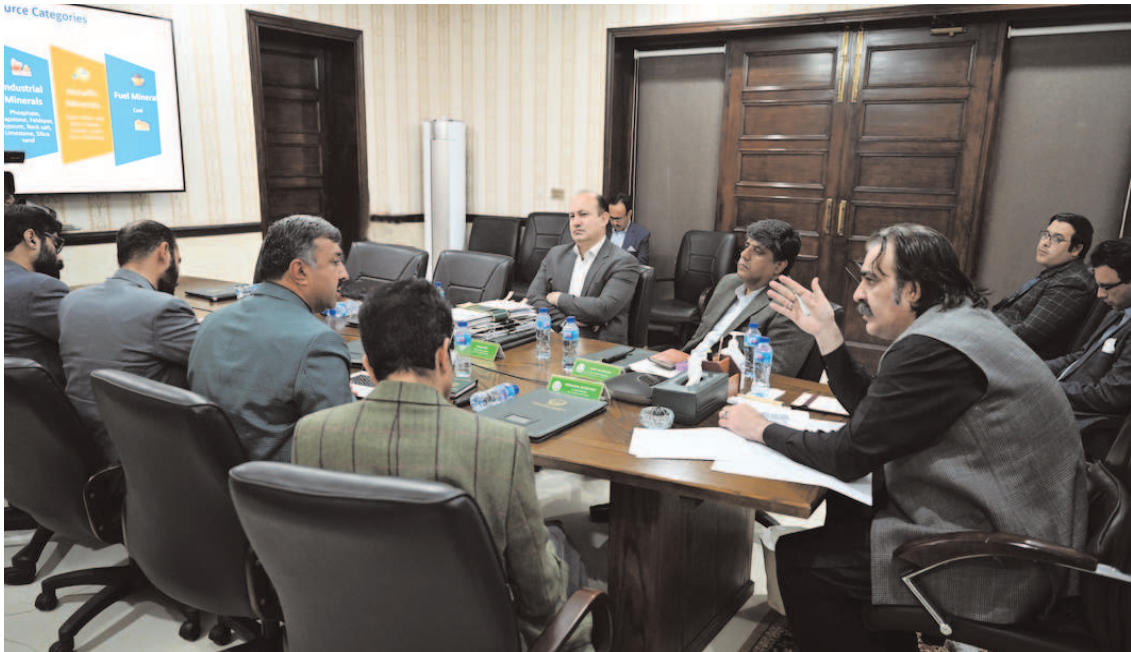
PESHAWAR: Chief Minister Khyber Pakhtunkhwa Ali Amin Gandapur chairing a meeting of Mines and Mineral Development Department.

PESHAWAR (APP): Khyber Pakhtunkhwa Chief Minister Ali Amin Gandapur on Saturday strongly condemned the incident of firing and killing of policeman in district Tank. In a statement issued here, the CM expressed grief over the martyrdom of the policeman and directed police chief to take necessary measures for immediate payment to bereaved family from Shaheed package. The Chief Minister also directed the IGP to take measures for the immediate arrest of the elements involved in the firing. He expressed condolences to the family members of the martyred official and prayed patience for them to bear the loss with fortitude. Gandapur said the KP police have made eternal sacrifices in line of duty and the provincial government would not leave the family of the martyr alone.