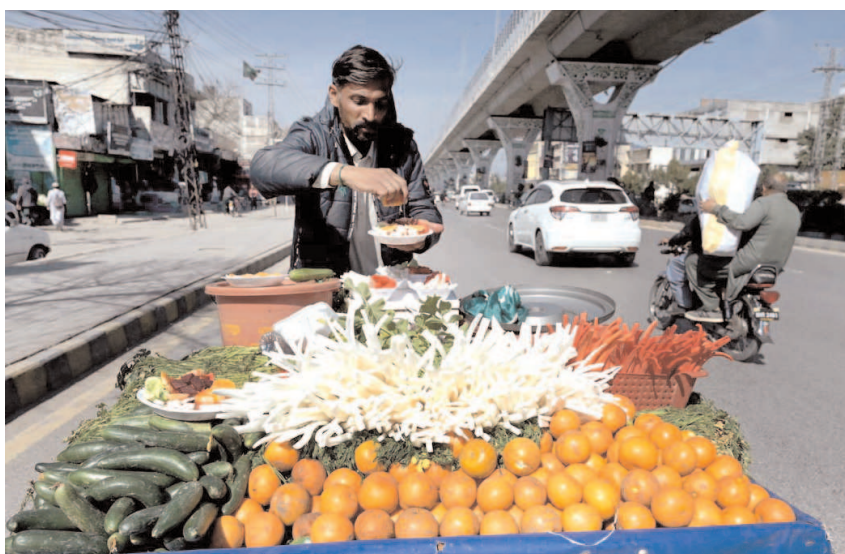
RAWALPINDI: A vendor selling fresh salad on his handcart at near Shamsabad.

While the tourists should plan their trip keeping in mind the weather conditions of the hilly areas. The tourists are also advised to keep the important numbers of the administration in the area with them where they intend to travel.