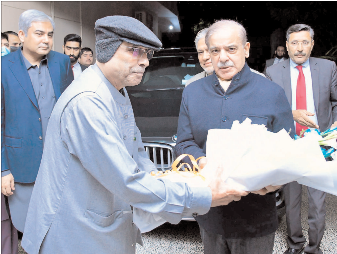
ISLAMABAD: Prime Minister Shehbaz Sharif being welcomed by President-elect Asif Ali Zardari upon his arrival at Zardari House.