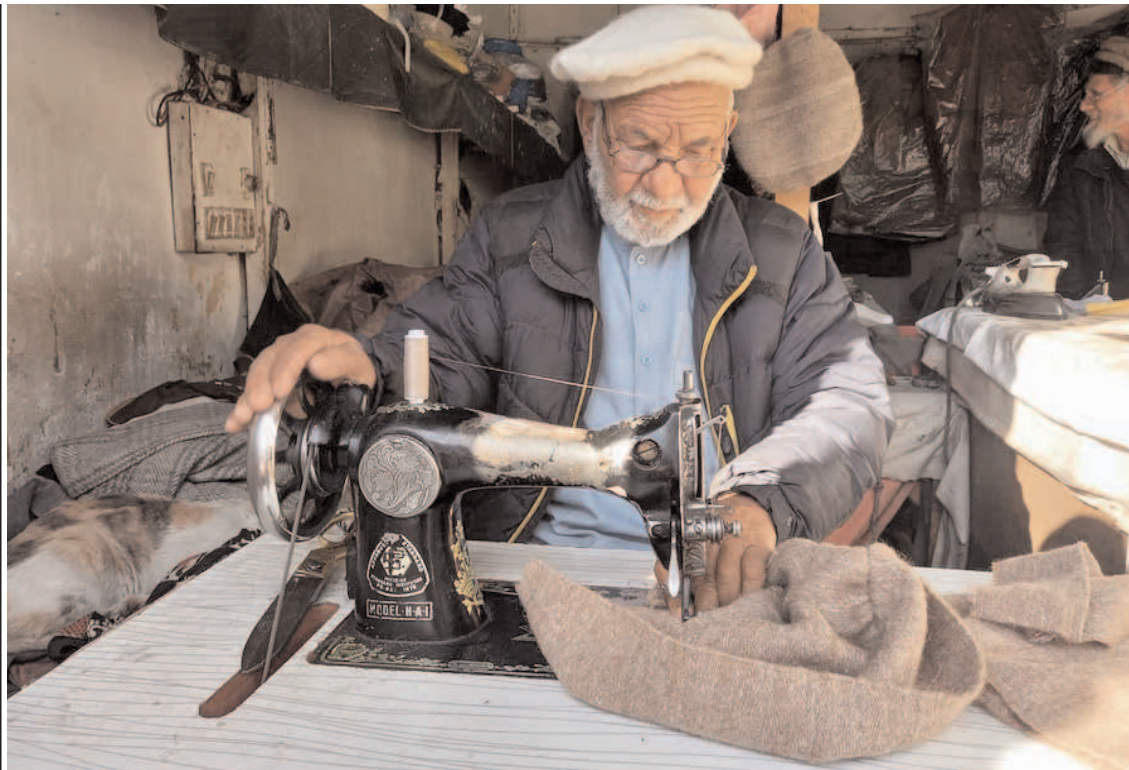
GILGIT: An elder tailor busy sewing traditional cap at his workplace.