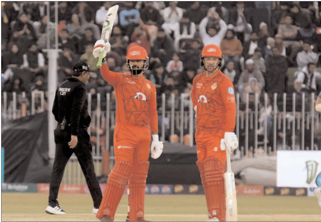
RAWALPINDI: Islamabad United batter Shadab Khan celebrates after scoring a (50 runs) during the Pakistan Super League (PSL 9) Twenty20 cricket match.