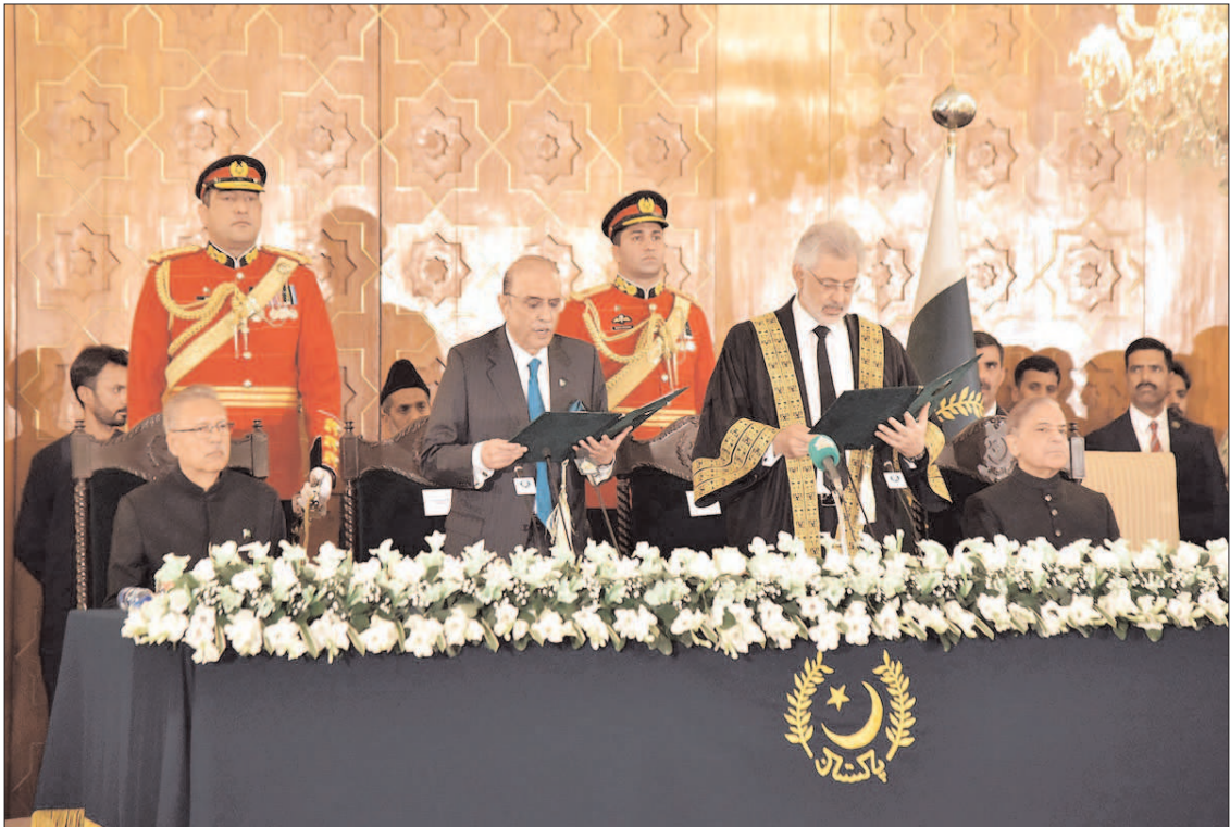
ISLAMABAD: Chief Justice of Pakistan, Justice Qazi Faez Isa, administering the oath of office of the President of Pakistan to Mr. Asif Ali Zardari, at Aiwan-e-Sadr, Former President Dr. Arif Alvi and Prime Minister of Pakistan, Mian Muhammad Shehbaz Sharif, were also present.

Vol. XXXIXI No. 49 Regd. No. 241 SHABAAN 29 1445 -- MONDAY, MARCH 11 2024 PESHAWAR EDITION 12 PAGES PRICE. 30