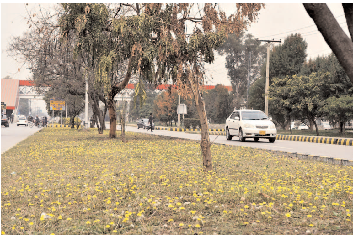
ISLAMABAD: A view of a blossoming and flourishing Yellow flowers on Green Belt Welcoming Spring in the Federal Capital.

RAWALPINDI (APP): Professional beggars rushed in markets ahead of Ramzan ul Mubarrak. An issue that has notably intensified this season. Among the beggars, eunuchs have become a common sight, seeking alms across various parts of the city, while the local authorities appear to remain passive observers amidst this growing concern. The streets and busy roadways of Rawalpindi are now scenes of persistent begging, with a notable presence of children, women, and the elderly employing various tactics to draw sympathy and donations from the public. These individuals often engage in activities such as offering to clean vehicle windows at traffic stops, actions that suggest coordination with the so-called 'beggar mafia.' Local citizens have expressed their dismay, highlighting that the rampant beggary tarnishes the image of a society that prides itself on civility and order. Criticism has been particularly directed towards the Child Protection Bureau, an entity that, despite its mandate to safeguard children's rights, seems to turn a blind eye to the exploitation of young beggars. Despite previous efforts by the police and other authorities to combat professional begging through targeted campaigns, these initiatives have largely failed to produce lasting solutions or significantly curb the practice.