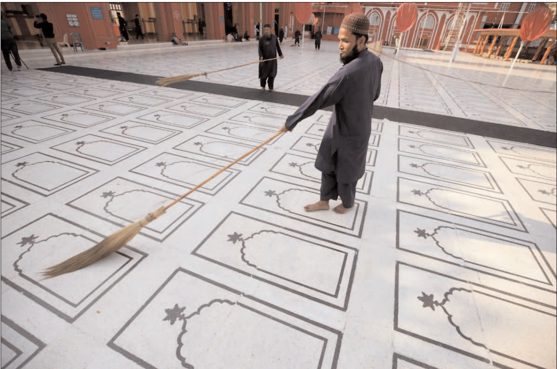
KARACHI: Volunteers cleaning Karachi's oldest new Memon Mosque ahead of holy month of Ramazan.

LAHORE (APP): A newly-constructed Jamia Masjid has been inaugurated in Komila city of Upper Kohistan district in Khyber-Pakhtunkhwa province. The mosque has been constructed by WAPDA at a cost of Rs 203.66 million under 'Local Area Development Programme' of Dasu Hydropower Project, according to WAPDA spokesman, here Sunday. He added that the scope of work included dismantling of the old structure and construction of a new building. A madrasa, adjacent to the mosque, has also been constructed for imparting Islamic education in the area. Construction of the mosque commenced in August 2021. Having a mesmerising view, the mosque is located in the heart of Komila city. He mentioned that WAPDA is spending Rs 17.35 billion for socioeconomic uplift of the locals in Dasu Hydropower Project area. These schemes relate to resettlement, social development and environmental management.