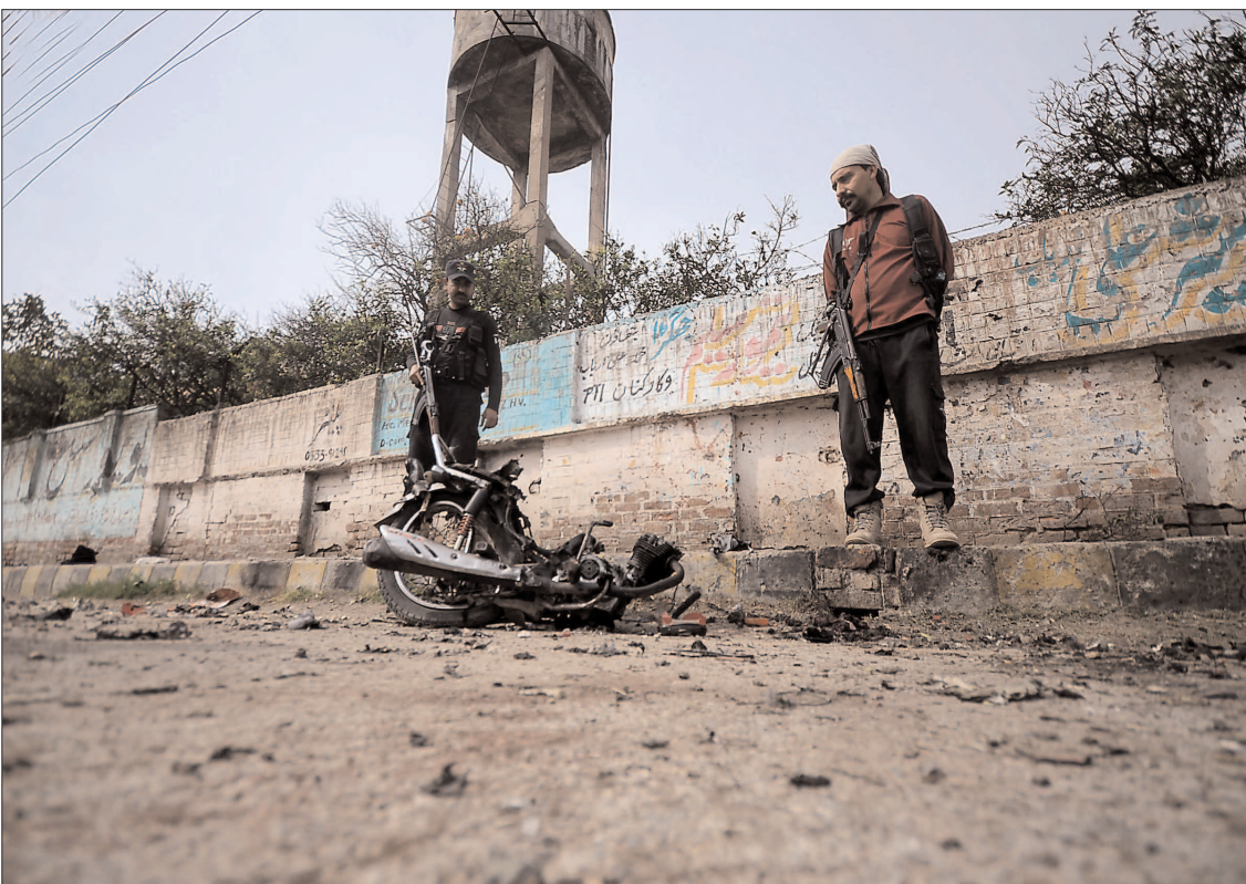
PESHAWAR: Two people were killed in a blast near Peshawar's Board Bazaar on Sunday morning.

refused to attend the oath-taking ceremony of Asif Zardari, labeling it a violation of the constitution to attend the ceremony of a candidate who won by undemocratic practices.