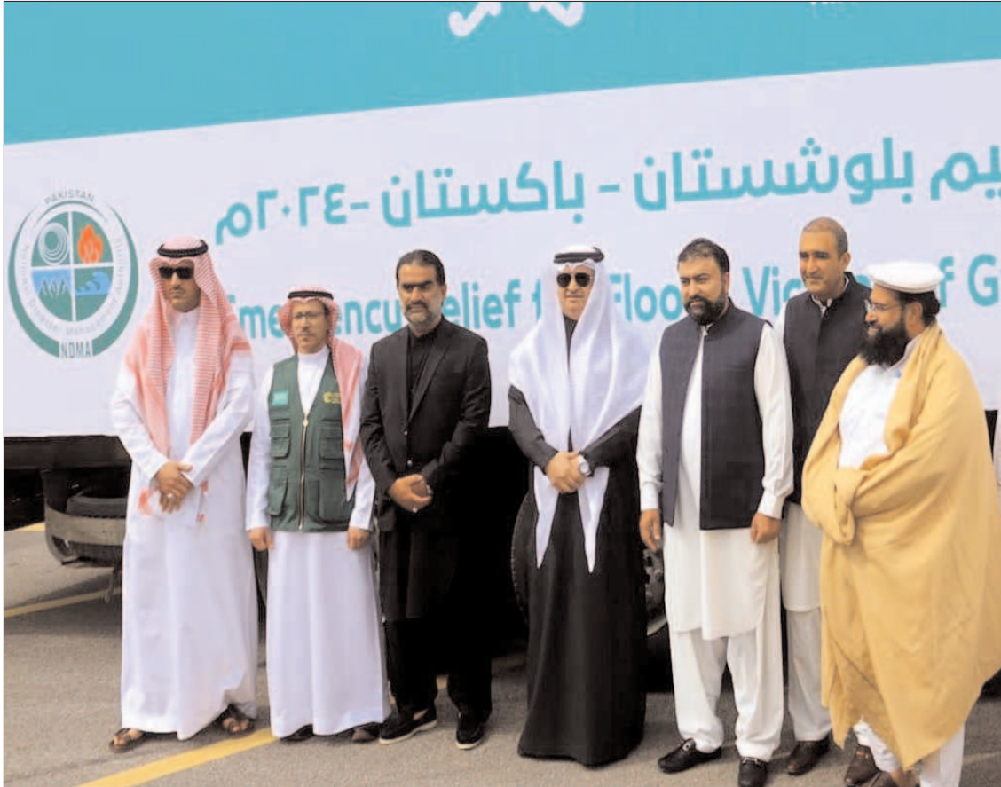
ISLAMABAD: Under auspices of NDMA, King Salman Humanitarian Aid and Relief Centre (KSrelief) Pakistan, has mobilized an emergency relief convoy to support the flood affectees of Gwadar.