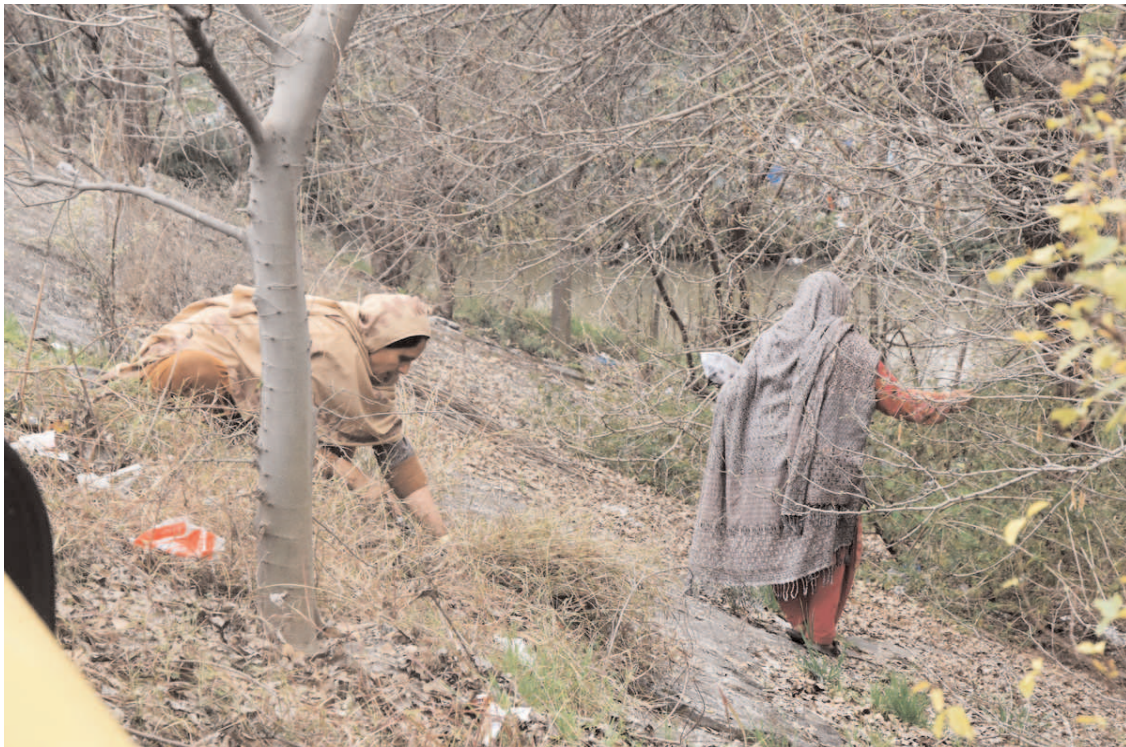
ISLAMABAD: Women busy cutting dry grass at roadside.

The officials concerned were also directed to keep a written record of all the burials in the graveyard.