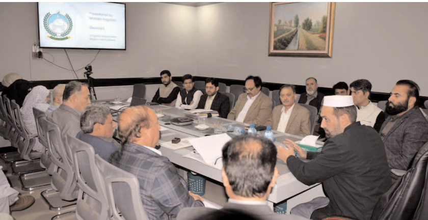
PESHAWAR: Provincial Minister Aqib Ullah presiding over a meeting.