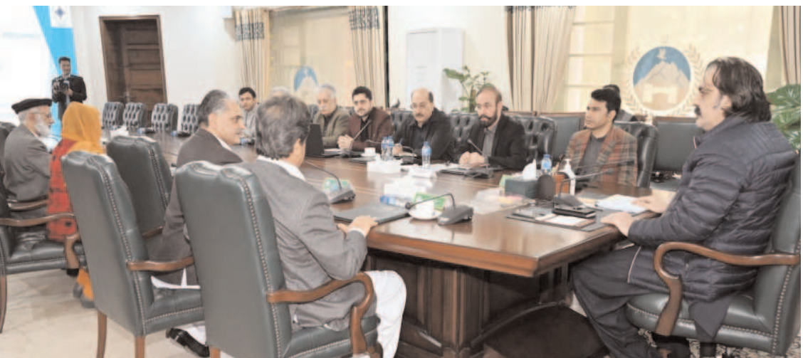
PESHAWAR: Chief Minister Khyber Pakhtunkhwa Ali Amin Khan Gandapur chairing a meeting of Local Govt Department.

Priority areas discussed included polio eradication, provision of free medicines, and the delivery of top-notch healthcare services, especially through Health Card, in remote regions. DG Health shared successful achievements in improving service delivery within the Health Department. Minister Syed Qasim Ali Shah expressed the importance of enhancing healthcare services, emphasizing the commitment to ensuring the availability of essential medicines in hospitals. The relentless pursuit of excellence in service delivery within the Health Department was commended.