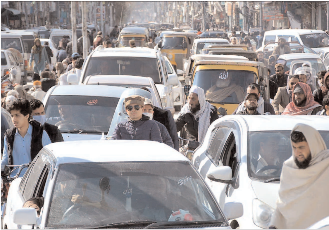
QUETTA: A view of traffic jam on roads as people busy in shopping for Ramadan.

QUETTA: Pakistan Army in collaboration with FC Balochistan organized free medical camps in different areas of Balochistan. According to a report on Monday, these camps were organized in remote areas of Qila Saifullah, Zhob, Dukki, Sibi, Badini, Sangan, and district Chaman. Over four thousand two hundred patients were provided medical treatment facilities including tests and medicines free of cost. Meanwhile, the FC Balochistan is also successfully running eighty three schools and colleges including twenty nine free shelter schools. More than fifteen thousand students are being provided education in these schools and colleges, while students are also being given books, uniform and stationery items free of cost. A Girls Primary School was also constructed in Tehsil Dobandi of district Qila Saifullah. The school will provide education to girls of the area free of cost. Similarly, supply of computers at Government Girls Degree College Noshki is also being carried out by FC. It is also busy in construction of boundary wall, and repair and maintenance of playground of the college. The FC Balochistan distributed free Ramadan Bags among deserved and needy people of Soghatpur, Chaman, Sangan, Qila Saifullah, and Kohlu.