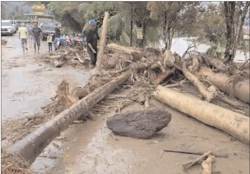
PADANG: A man attempting to remove logs that block a street following a flash flood in Langgai, West Sumatra, Indonesia.