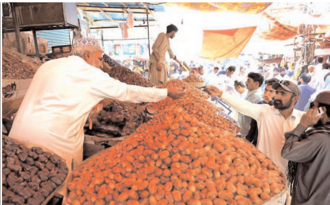
HYDERABAD: People selecting and purchasing dates at Tower Market.