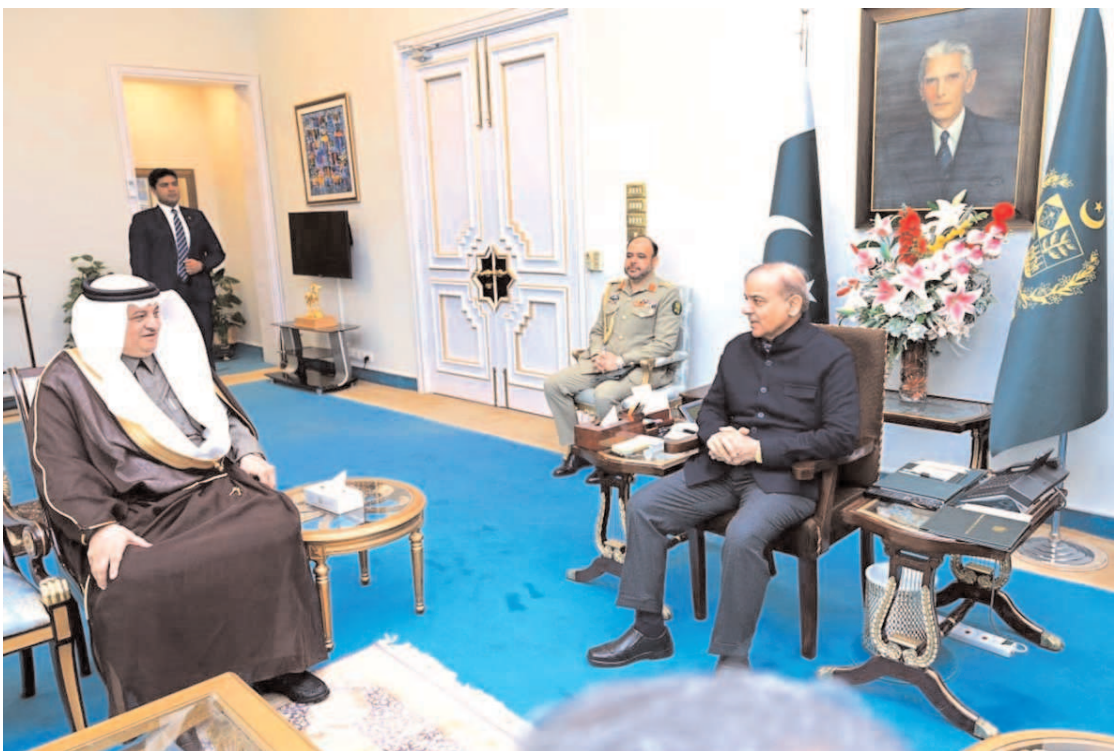
ISLAMABAD: H.E. Nawaf bin Saeed Ahmad Al-Malkiy, Ambassador of the Kingdom of Saudi Arabia to Pakistan calls on Prime Minister Muhammad Shehbaz Sharif.

RAWALPINDI (APP): The Rawalpindi Waste Management Company (RWMC), in its ongoing "Suthra Punjab" campaign set up a camp outside the Rawal Park to create awareness among the people about cleanliness. According to RWMC spokesman, the communication teams distributed pamphlets among the citizens who came to visit the park with messages and information about the preventive measures against various diseases. The teams also delivered a message about hygiene measures and appealed to them to keep their homes and workplaces dry and clean to avoid breeding and growing dengue larvae.