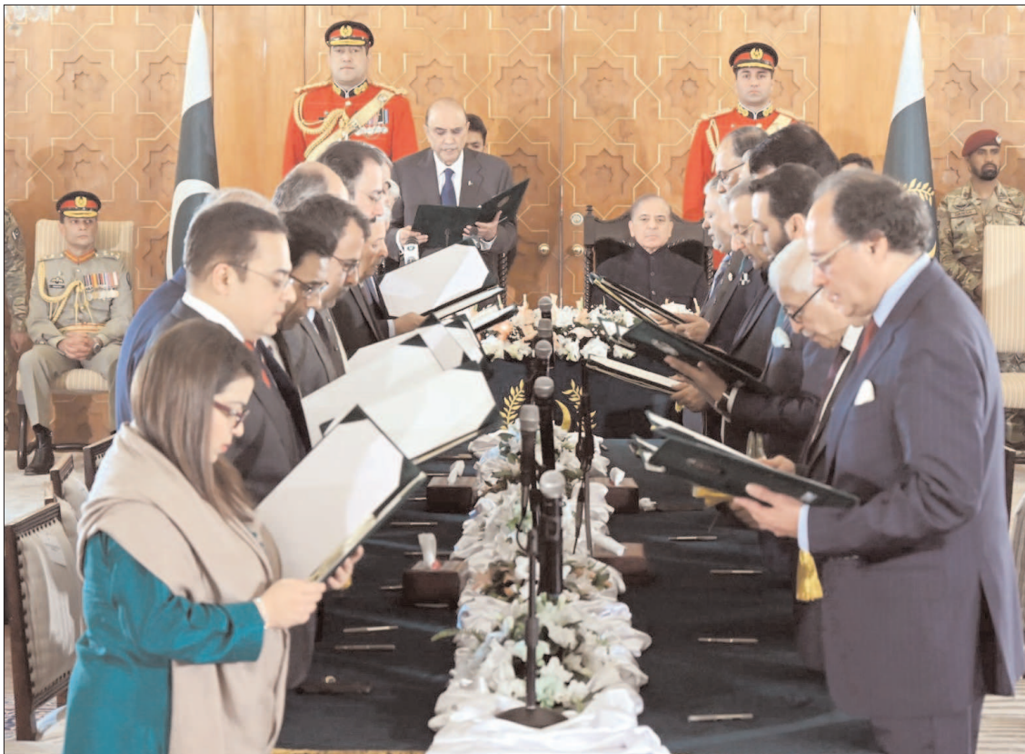
ISLAMABAD: President Asif Ali Zardari administering oath of office to members of Federal Cabinet at Aiwan-e-Sadr.