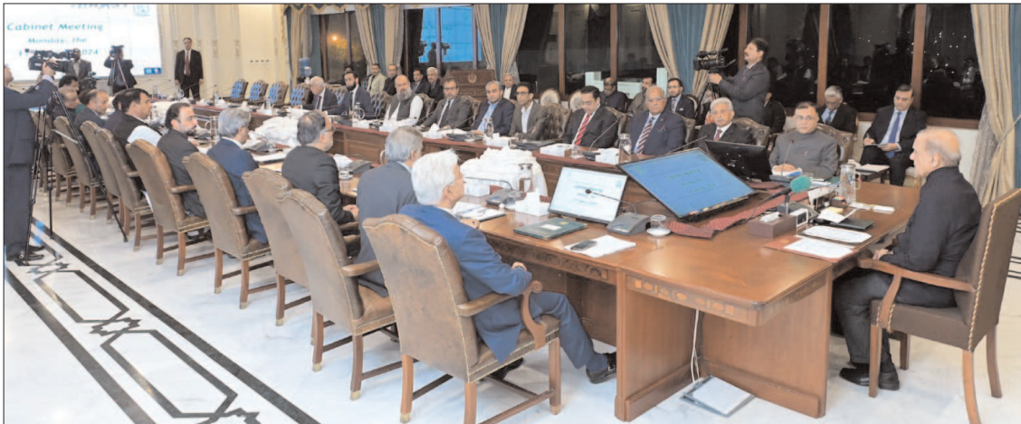
ISLAMABAD: Prime Minister Shehbaz Sharif chairing inaugural meeting of federal cabinet.