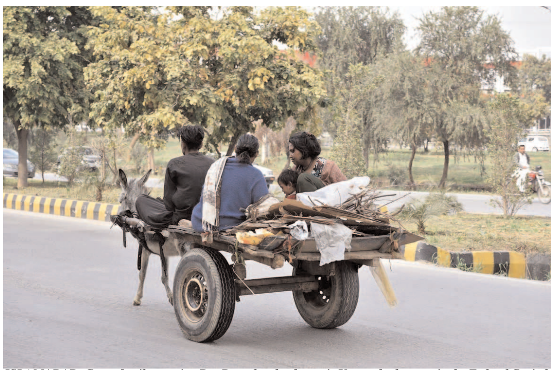
ISLAMABAD: Gypsy family carrying Dry Branches for domestic Use on donkey cart in the Federal Capital.