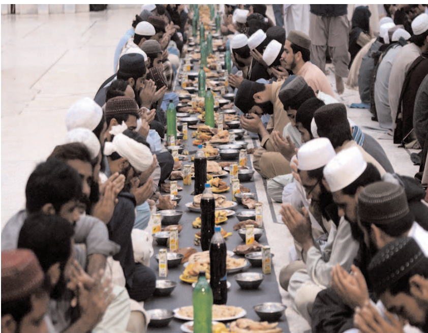
PESHAWAR: People sit and wait for Iftar to break fast at a mosque.