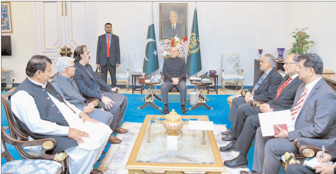
ISLAMABAD: Chief Minister of Khyber Pakhtunkhwa, Ali Amin Gandapur called on Prime Minister Shehbaz Sharif.

Vol. XXXIXI No. 52 Regd. No. 241 RAMAZAN 03 1445 -- THURSDAY, MARCH 14 2024 PESHAWAR EDITION 12 PAGES PRICE. 30