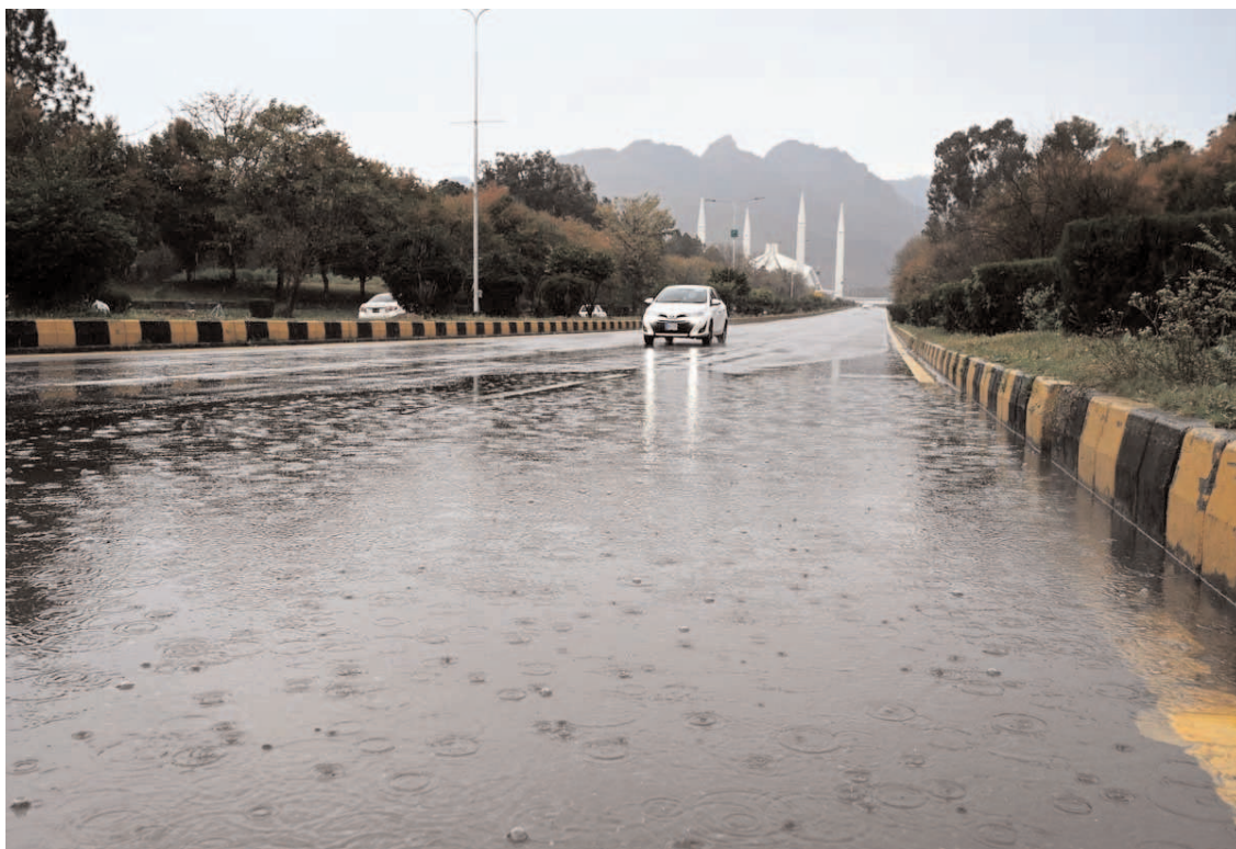
ISLAMABAD: A beautiful view of Faisal Mosque during rain in the Federal Capital.