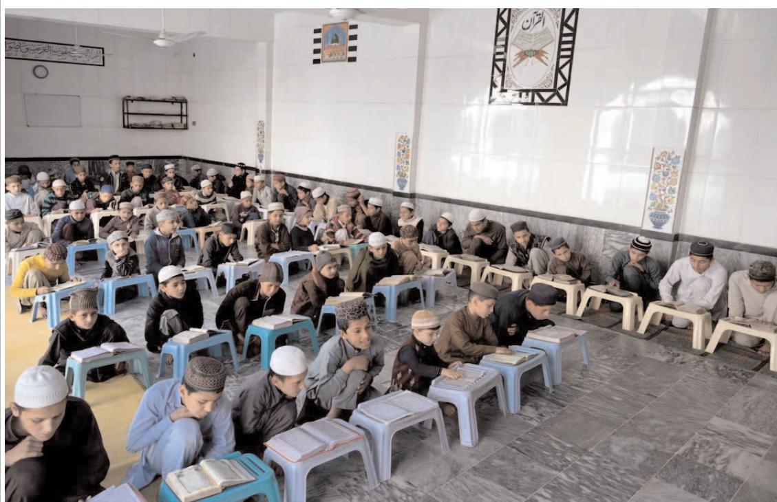
RAWALPINDI: Madrasa Students reciting Quran e Pak during Holy Fasting Month of Ramadan at Jamia Masjid Qazi Nizamuddin near Bani Chowk.

He said children with a nicotine dependency may have difficulties concentrating in class, difficulty sleeping, anxiety, irritability, restlessness, frustration, anger and strong cravings to relieve symptoms with repeat nicotine exposure. "Academics and policymakers must gather data and should conduct research to show a causal relationship between e-cigarette experimentation by the youth and later tobacco addiction in the context of Pakistan," he demanded. "There is not much awareness of teachers and Parents where we need for a massive campaign against e-cigarettes like the campaign against sheesha and vape pen use", he added. We have decided to involve the civil society in order to raise awareness," he added. Replying a question, he said chemicals in vaping fluid also can cause acute lung injuries and contribute to lung and cardiovascular disease down the line. He added more rigorous anti-tobacco campaigns that focused on tobacco cigarettes and on the rising trend of e-cigarettes among youth to create awareness about the harmful effects of smoking.