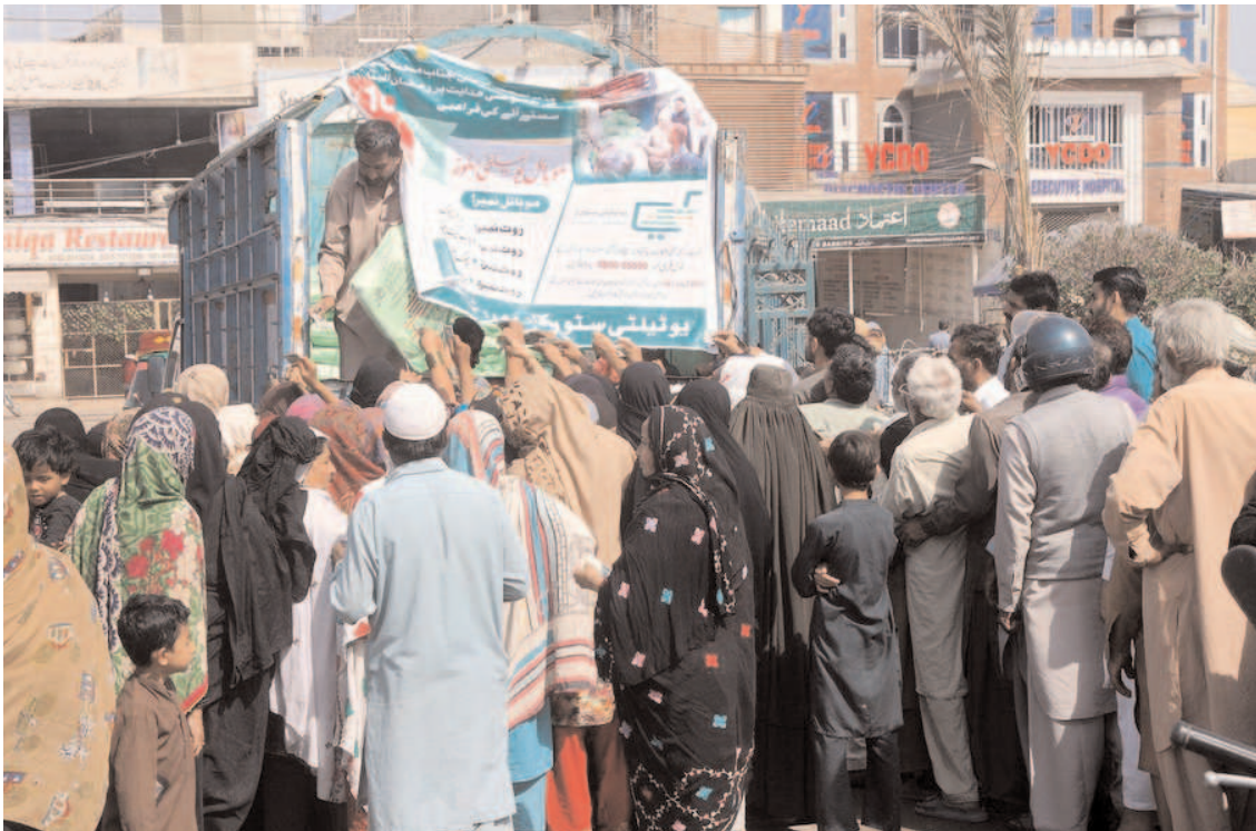
MULTAN: A large number of people in a queue to get flour on government subsidized rates from mobile Utility Store.