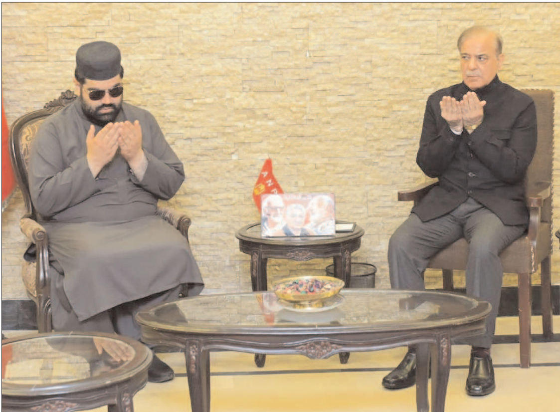
CHARSADDA: Prime Minister Muhammad Shehbaz Sharif offering condolence over the demise of wife of Asfand Yar Wali, President of Awami National Party.

NANKANA (INP): Two under custody robbers were killed after their accomplices attacked police van near Kale Mor in Nanakana Sahib. According to details, a police van taking two under custody robbers for recovery of cell phones and arms was ambushed by cohorts of the detainees. As a result of firing, both under custody robbers were killed on the spot and the attackers fled the scene after retaliatory firing of the police. The killed robbers were wanted by police in more than 20 cases of robberies and other crimes in Nankana and Sheikhpura.