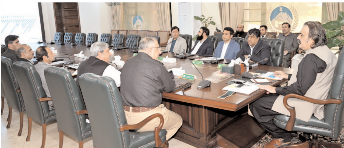
PESHAWAR: Chief Minister Khyber Pakhtunkhwa Ali Amin Khan Gandapur presiding over a meeting regarding law and order situation.