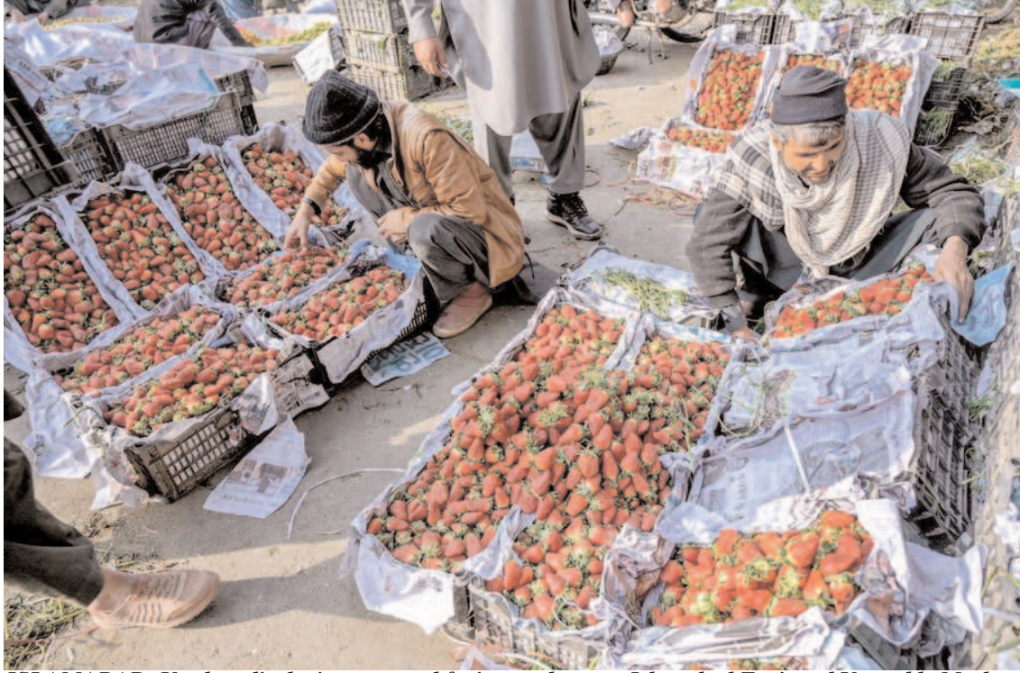
ISLAMABAD: Vendors displaying seasonal fruit strawberry at Islamabad Fruit and Vegetable Market.

Gold rates up by Rs.250 to Rs 228,550 per tola The per tola price of 24 karat gold in the local market increased by Rs.250 and was traded at Rs.228,550 on Thursday as against its sale at Rs. 228,300 on the last trading day. The price of 10 grams 24 karat gold also increased by Rs.215 to Rs195,945 from Rs. 195,735 whereas that 10 gram 22 karat gold increased to Rs.179,616 from Rs.179,420, the All Sindh Sarafa Jewellers Association reported. The price of per tola and ten gram silver witnessed no change and was traded at Rs2,600 and Rs2,229.08 respectively. The price of gold in the international market increased by $9 and was traded at $2,188 from $2,179, the Association reported.