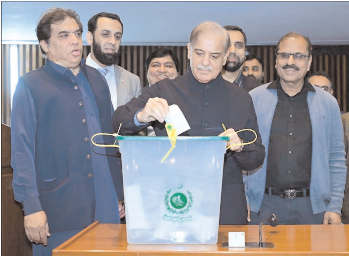
ISLAMABAD: Prime Minister Shehbaz Sharif casting his vote in Senate by-elections at Parliament House.