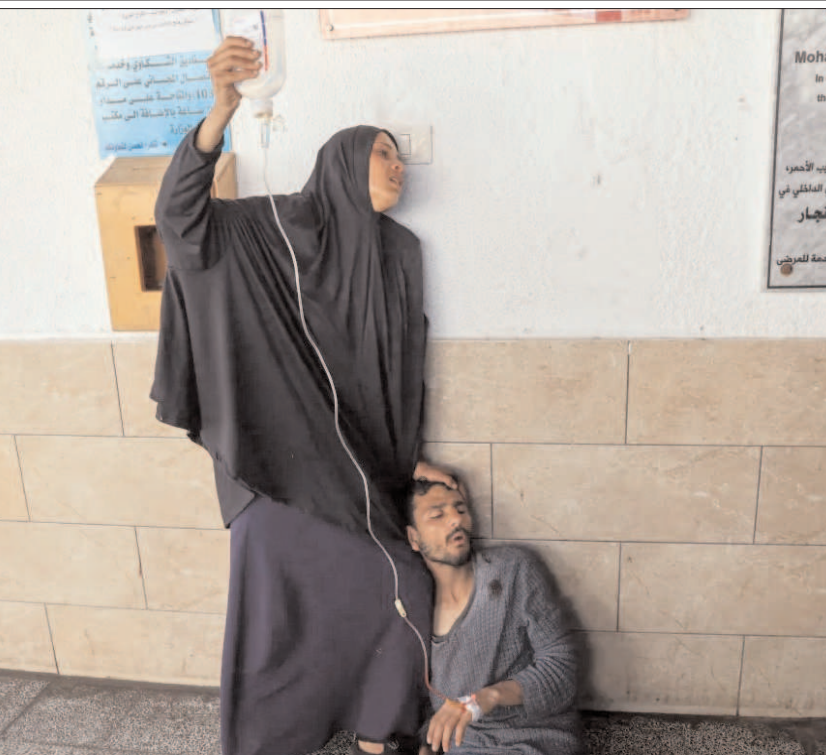
GAZA: A Palestinian woman assists an injured man outside al-Najjar Hospital in Rafah.

To a query, he said independent elected members were given three days to join a party in the House while the reserved seats were only allocated to the political parties of the House. A party that had not participated in the election was not entitled to the reserved seats, he added. Had the independent candidates joined a party in the House, the situation would have been different, he said while asking whether the Sunni Ittehad Council had released any list of reserved seats before the election.