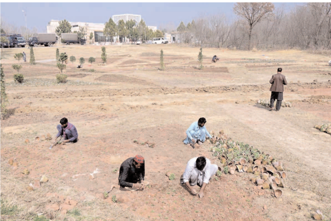
ISLAMABAD: CDA workers busy in planting sepals at F-9 Park in the Federal Capital.