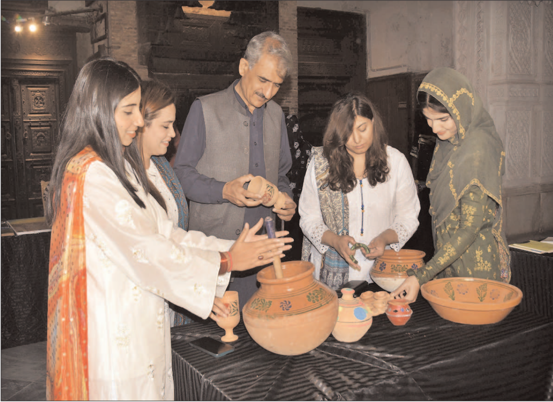
LAHORE: On the occasion of Punjabi Cultural Day, women looking at the traditional dishes of Punjab at the stall in Lahore Museum.

The discussion ended up with formulation of establishing a working group to develop concrete action plan. This meeting signifies a significant step forward in the educational partnership between CUI and Türkiye. Both institutions are committed to working together to create meaningful opportunities for students, faculty, and researchers, contributing to the advancement of knowledge and mutual understanding.