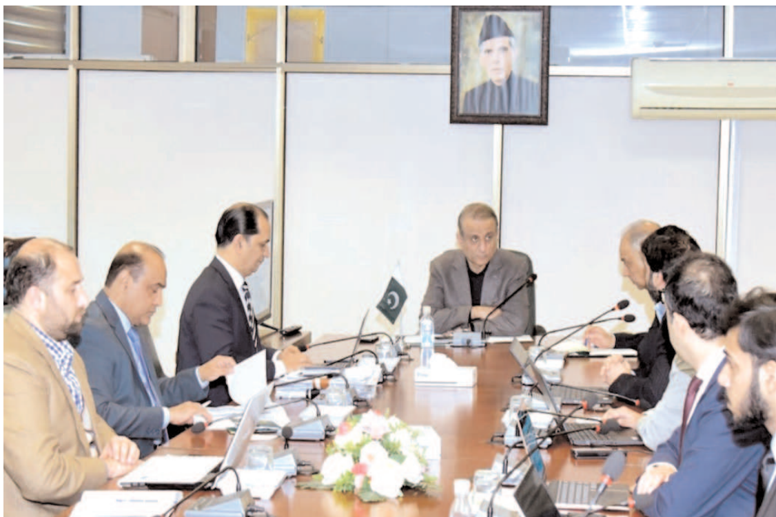
ISLAMABAD: Federal Minister for Privatisation, Abdul Aleem Khan chairing a meeting with the financial advisors for divestment of PIACL.