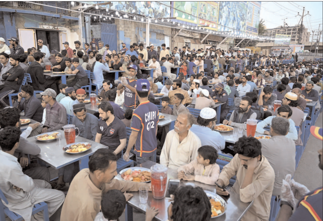
KARACHI: A large number of needy people are being serving Iftar at Chhipa Head Office.

The visit concluded on a positive note, with both sides expressing a shared desire to strengthen cultural ties and facilitate further collaboration in the future. The delegation departed with a newfound appreciation for Lahore’s cultural vibrancy and a deepened understanding of its artistic heritage.