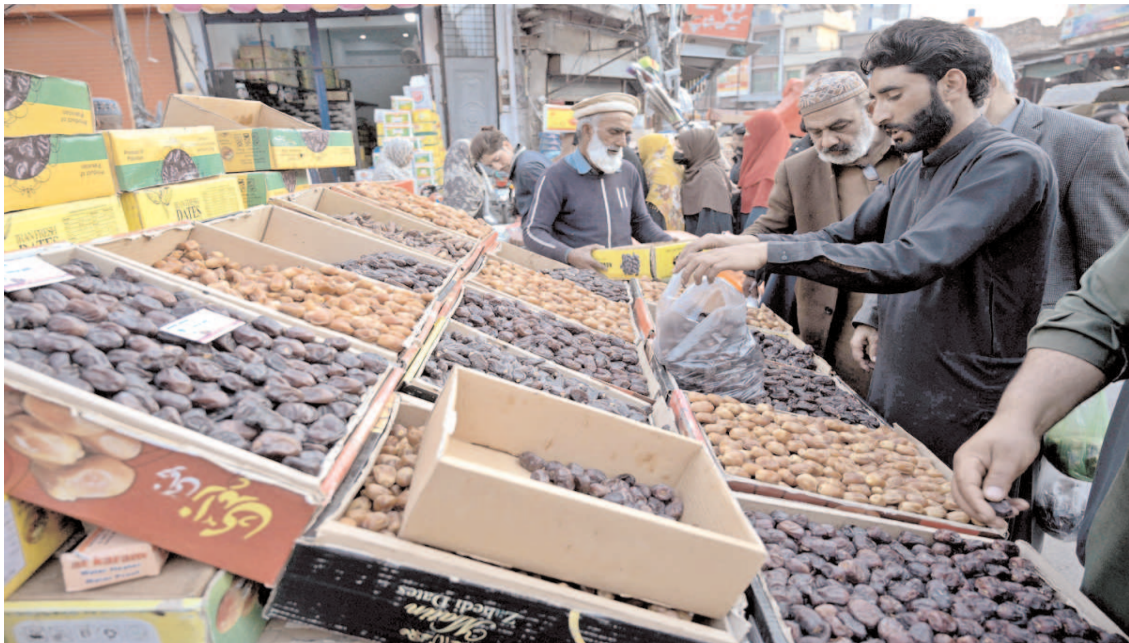
RAWALPINDI: Customers busy in purchasing dates for Iftar during the holy month if Ramazan at Raja Bazaar market.

aluminum industry, offering a wide array of products from windows and doors to curtain walls and customized projects. With a relentless commitment to research and development, Alcoa has consistently led the market in introducing state-of-the-art solutions that cater to the evolving needs of modern construction.