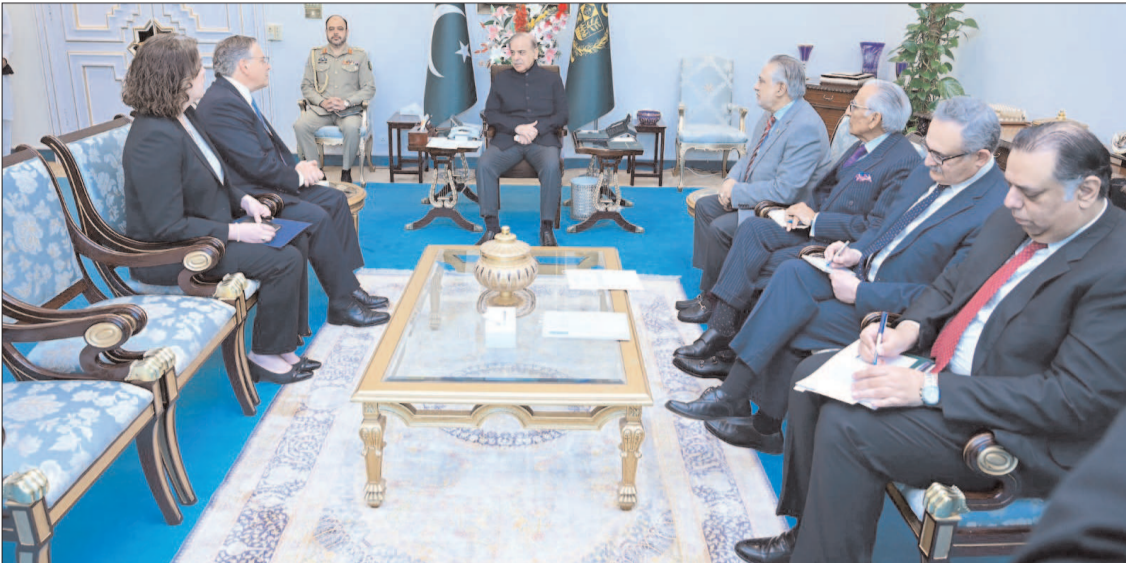
ISLAMABAD: Ambassador of US to Pakistan, Donald Blome, called on Prime Minister Shehbaz Sharif.