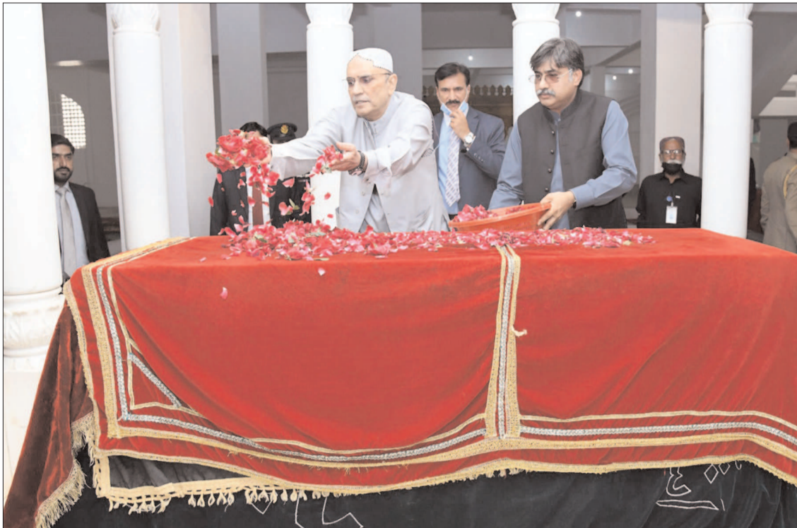
LARKANA: President Asif Ali Zardari showering flowers on the grave of Shaheed Mohtarma Benazir Bhutto at Garhi Khuda Bakhsh.