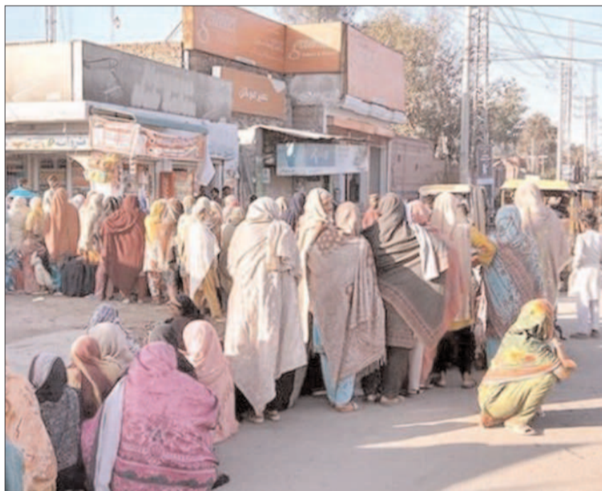
CHINIOT: Women in long queues of at main Jhang Road to receive cash payment of BISE programm.

DC disclosed that she herself was monitoring distribution of Ration bags and other all initiatives of the Chief Minister of the Punjab Maryam Nawaz Sharif. Earlier, DC visited Ramazan Bazar and fair price shops setup at Model Bazar and checked quality, availability of essential commodities to the consumers. She said that more than 13 edibles items were being sold at fair price shops on 25 percent discount prices.