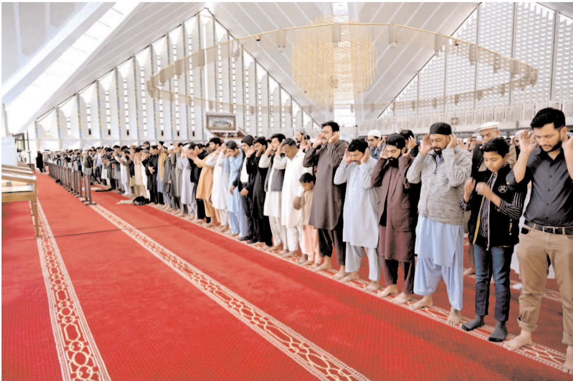
ISLAMABAD: A large number of people offering Congregation Prayer (Friday Prayer) at Faisal Masjid in the holy fasting month of Ramzan.