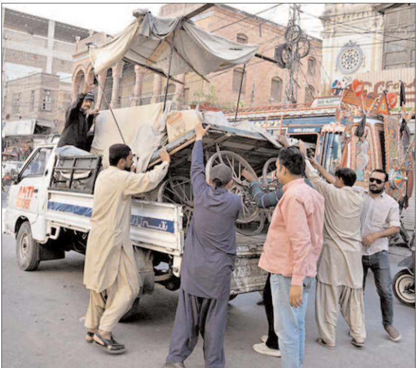
HYDERABAD: Anti-encroachment staffer loading roadside vendors handcart to their vehicle for clearing encroachments from Station Road.

PPP Chairman Bilawal Bhutto Zardari has requested the Sindh CM Syed Murad Ali Shah that the new VC of the university should issue the three-month wages of 500 employees at once so that the employees can take a breath of fresh air. Otherwise, they will continue the protest and go on strike.