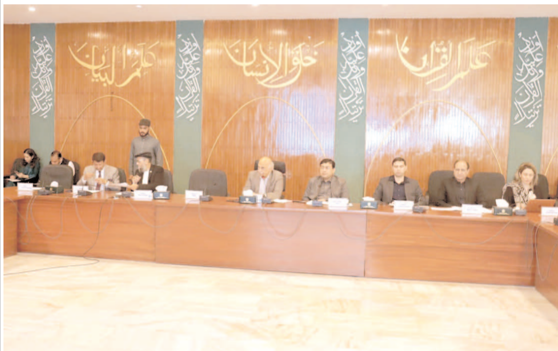
ISLAMABAD: The CDWP meeting presides over by Deputy Chairman Planning Commission Mohammad Jehanzeb Khan, approves 2 development projects with a cost of Rs.7.87 million after the detail discussion.

The participants appreciated the decision taken by the Punjab government on the cultural day and urged to take more steps for the promotion of Punjabi language. A large number of people belonging to the literary circles participated in the mushaira.