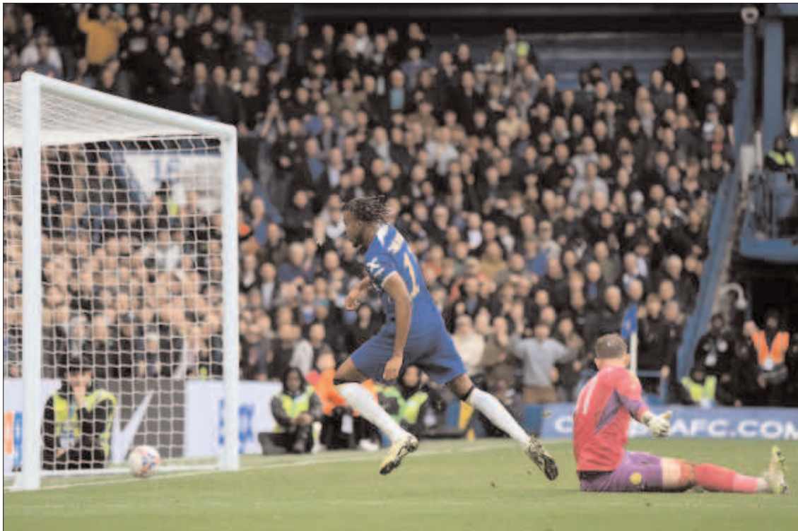
LONDON: Carney Chukwuemeka of Chelsea scores his team's third goal past Jakub Stolarczyk of Leicester City during the Emirates FA Cup Quarter Final.

To his credit, Sterling didn't hide and he set up Palmer's goal on the stroke of half-time. Sterling raced into the area and delivered a low cross that Palmer deftly slotted home from close-range. Disasi gave Leicester a lifeline in the 51st minute as the centre-back panicked under pressure from Daka and hacked a misjudged backpass past stunned keeper Robert Sanchez into his own net from 30 yards. Weaving into the Chelsea area as the anxious Blues defence backed off, Mavididi curled a blistering finish into the top corner in the 62nd minute. Chelsea thought they had been given a penalty in the 73rd minute when Doyle tripped Jackson. VAR ruled the offense was just outside the area, but that didn't save Doyle from a red card. Sterling was booed by Chelsea fans after a woeful free-kick, while Pochettino also copped it with chants of "you don't know what you're doing" when he substituted Mudryk.