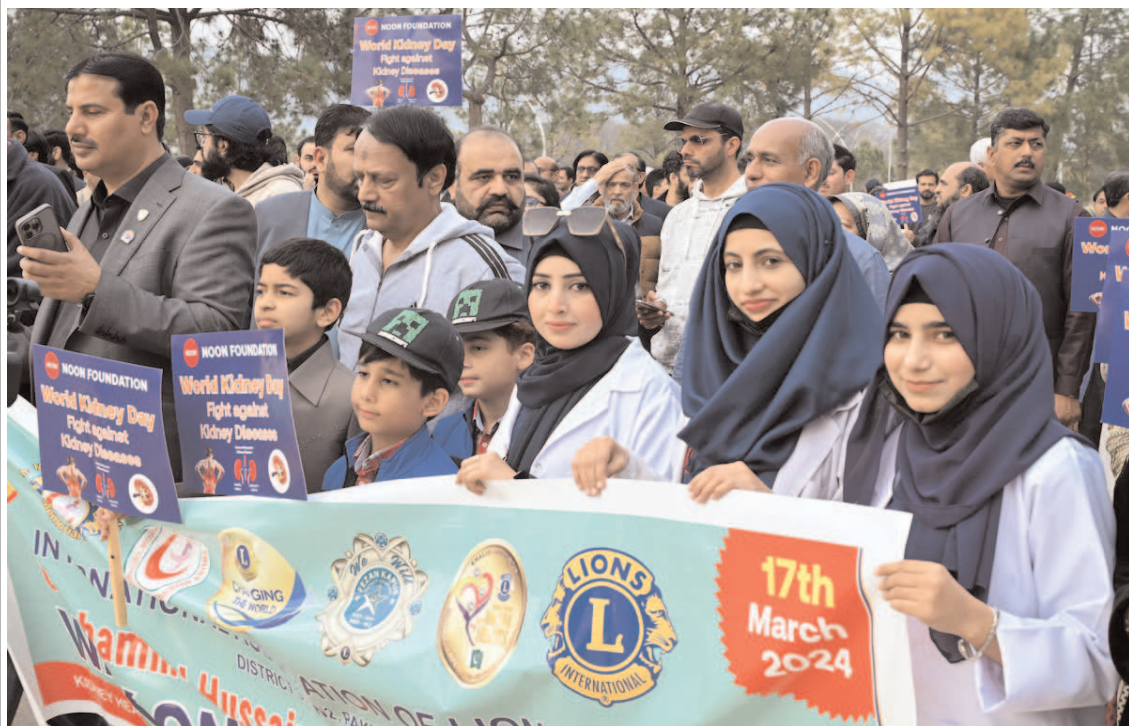
ISLAMABAD: Large number of people participating in a Walk to "Raise Awareness About Kidney Diseases Their Precautions & Treatment in Pakistan" at Mehran Gate F-9 Park.

market in Islamabad which is controlled by the Islamabad administration, he said and informed that a market had recently been established in Rawat where the prices of vegetables and fruits were being monitored to provide relief to the citizens. Agriculture Fair Price Shop and wholesale market had also been established on the special instructions of the Punjab Government to facilitate the people, the DC added.