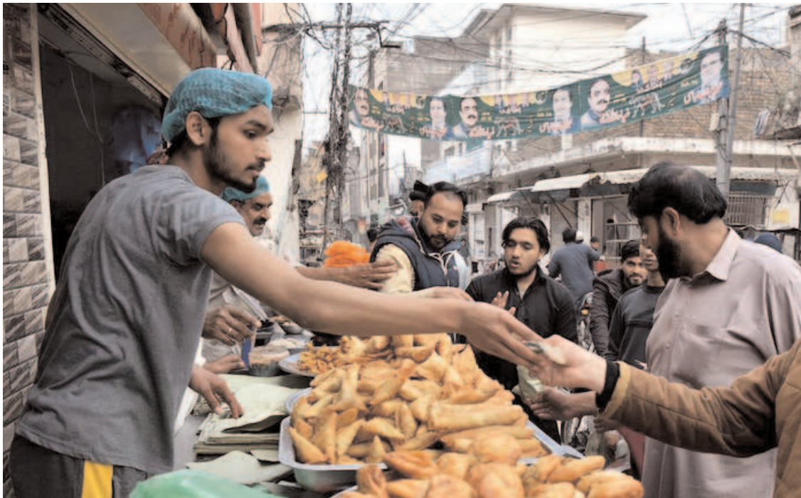
RAWALPINDI: People purchasing traditional food items for iftar.

Faheem Saigol mentioned that the new elected government will have to take joint action to combat currency smuggling and narrow the difference in dollar rates between official and open markets. It is the fact that the interim government has undertaken various initiatives for the betterment of the country. The trade deficit narrowed by 3.6 percent to $1.3 billion in December 2023 compared to $1.9 billion in the same period of 2022, demonstrating positive progress. Additionally, he expressed optimism that the government's efforts would lead to an expansion in export potential and the export market.