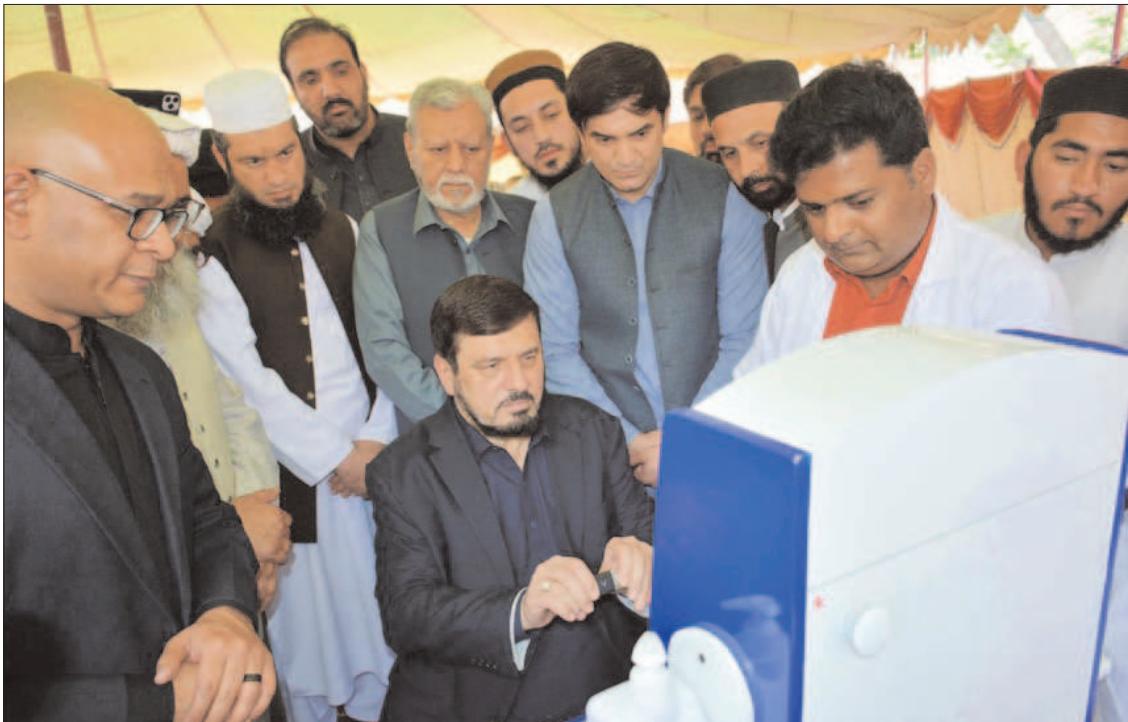
PESHAWAR: Governor Khyber Pakhtunkhwa Haji Ghulam Ali being briefed about the online system after inaugurating Shifa Digital Clinic.