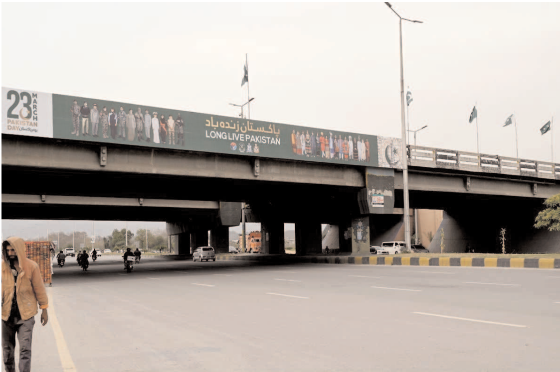
ISLAMABAD: National flags flutter cover a billboard installed on Faizabad Bridge ahead of Pakistan day on 23 March 2024.