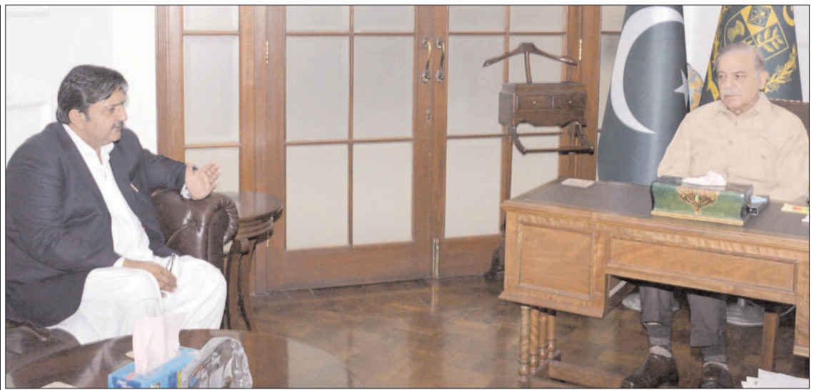
LAHORE: Speaker of Punjab Assembly Malik Muhammad Ahmad Khan called on Prime Minister Shehbaz Sharif.

Governor Khyber Pakhtunkhwa, Haji Ghulam has condemned attack of terrorists in North Waziristan and expressed grief over the killing of five security personnel including a lieutenant colonel and captain.