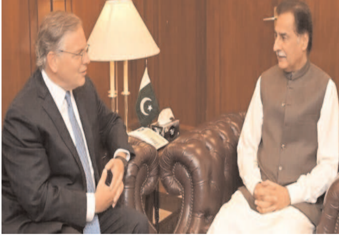
ISLAMABAD: US envoy Donald Blome calls on NA Speaker Ayaz Sadiq.