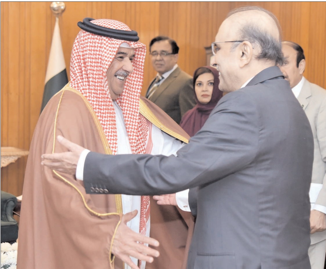
ISLAMABAD: President Asif Ali Zardari welcoming Commander of Bahrain National Guard, General Sheikh Mohammad bin Isa bin Salman Al-Khalifa, at Aiwan-e-Sadr.