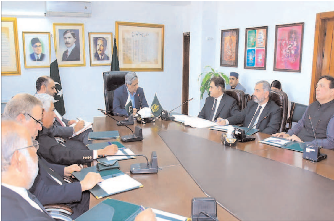
ISLAMABAD: Minister for Law and Justice Azam Nazir Tarar convened and chaired a meeting of Appellate Tribunal Inland Revenue at Law Ministry.

sale of essential commodities at more than the fixed prices was not acceptable in any case. He said that special inspections should be carried out on the identification of special branches. He also asked the price magistrates to remain active in the field and take stern action against overcharging. The chief secretary also issued instructions to speed up supply of ration bags to the deserving people in Gujranwala, Sialkot, Gujarat, Sargodha, Mianwali, and said that the deserving people should get their right at their doorsteps as soon as possible. The secretaries of industries and agriculture gave a detailed briefing at the meeting. They said that 3.8 million ration bags had been delivered to the deserving people under the Nighaban Ramzan package. A day before, one lac 13 thousand consumers benefited from the agriculture fair price shops established in Ramzan bazaars. A subsidy of Rs 20 million was being given daily on 13 items at these fair price shops, they concluded.