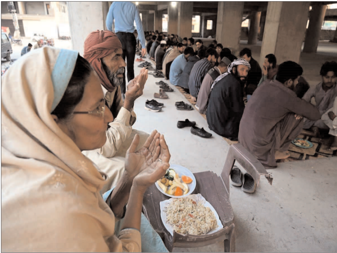
ISLAMABAD: A large number of people breaking fast (Iftar) during the holy month of Ramazan ul Mubarak.

a treasure trove of railway artefacts, including ancient steam engines and heritage railway kitchens. Following this immersive heritage tour, the Safari Train will stop at the Attock Khurd's Station, offering passengers the opportunity to explore the captivating beauty and entertainment spots along the Indus River. The train itself has undergone a stunning makeover, both internally and externally, with meticulously designed interiors, delectable onboard cuisine, and arrangements for high tea. Luxurious seating arrangements and newly constructed washrooms add to the passengers' comfort and convenience, they added. The sources said the preparations for the Safari Train are in the final stages and likely to be completed next week, whereas the official date of the journey would be announced in due course of time. The departures of the Safari Train are scheduled every Sunday at 9 am, with return trips from Attock at 6:30 pm and the ticket prices vary according to the type of accommodation, with special discounts available for students from educational institutions.