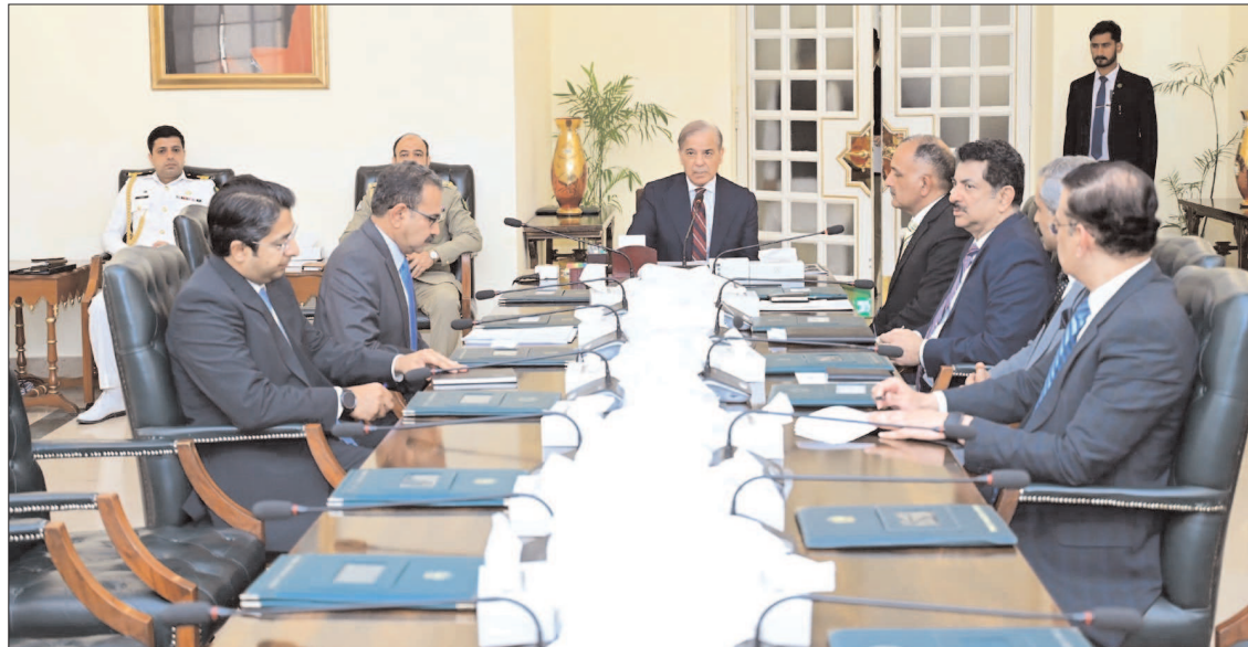
ISLAMABAD: Prime Minister Shehbaz Sharif being briefed about relief and rehabilitation activities in wake of recent torrential rains as well as weather forecast and preparedness.

QUETTA: Three jawans of Frontier Corps Balochistan on Tuesday sustained injuries in a blast near a check post of security forces in Kuchlak, a suburb area of Quetta. According to SSP Operations Quetta Jawad Tariq, the explosion carried out with a cracker near the FC check post in Kuchlak, resultantly, three jawans of Frontier Corps Balochistan sustained injuries.