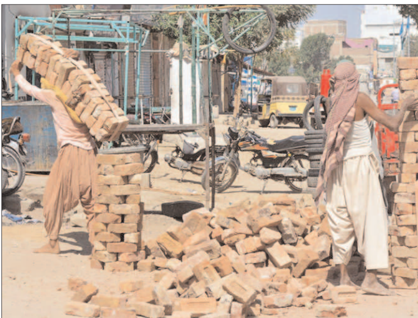
HYDERABAD: Labourers busy shifting bricks during construction work of a house at Latifabad.

According to the official price list issued here on Monday, potato is to be sold at Rs 70 per kilogram, onion at Rs 220, tomato Rs 120, ladyfinger Rs 330, bangles Rs 180, cauliflower Rs 130, spinach Rs 50, cucumber Rs 100, garlic Rs 200, lemon Rs 200, peas Rs 150, carrot Rs 70 per kg while apple at Rs 220, Iranian apple Rs 300, banana Rs 250, strawberry at Rs 550, kino Rs 220 per dozen, orange at Rs 400 per dozen and pomegranate is sold at Rs 500 per kilogram.