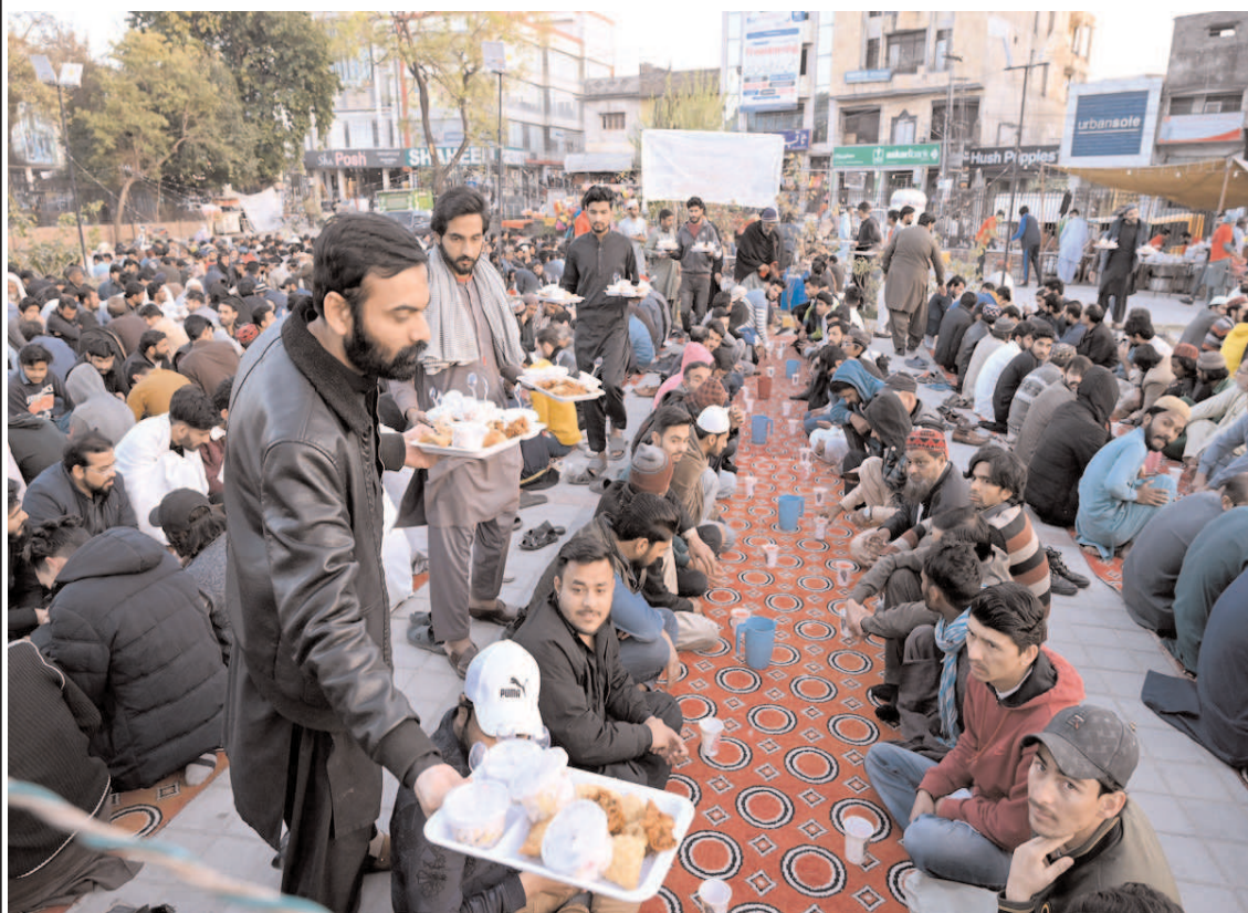
RAWALPINDI: Volunteers distribute food among the people in fast during the Holy Month of Ramadan at Satellite Town.

parts of the country at large to enjoy their trip. The plantation drive would not only further enhance its beauty, but also encourage the tourists throng to Murree to observe the nature, said a press release issued here. Deputy Commissioner Murree, Agha Zaheer Abbas Shirazi inaugurated the plantation campaign, adding that all the plants have been donated by a charitable organization.