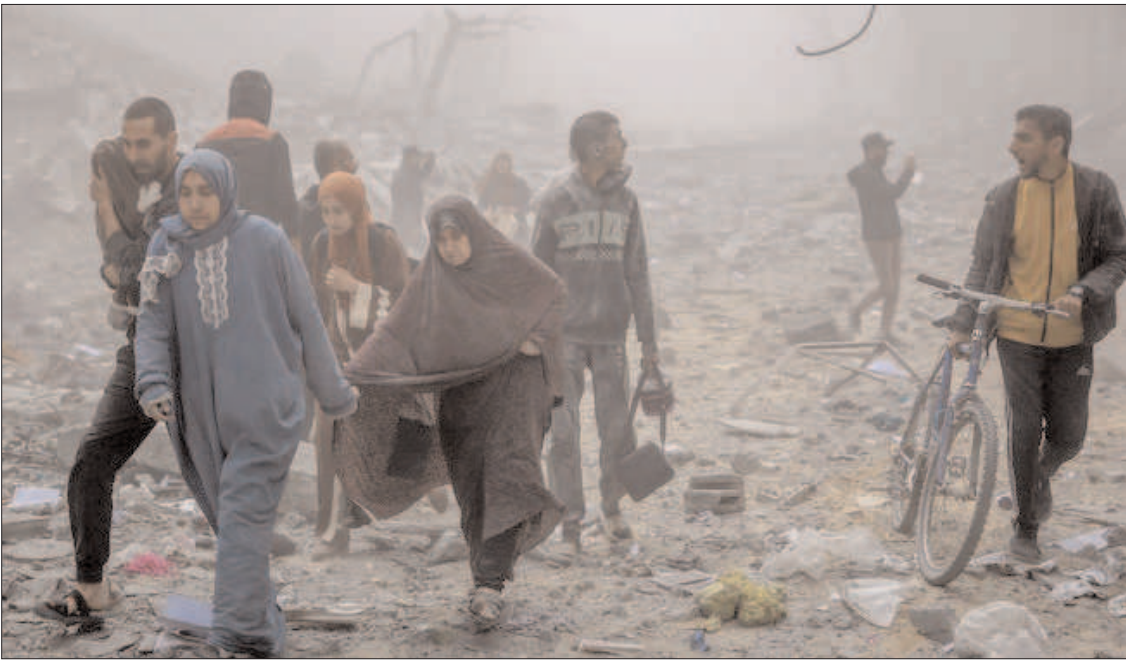
GAZA CITY: Palestinians flee the area after Israeli bombardment.

"The United States is not behind these protests in Cuba and the accusation of that is absurd," Patel said. Meanwhile, the US embassy in Havana said in a post on X that it had received reports of protests in Bayamo, Granma and other locations. It urged the government "to respect the human rights of the protesters and address the legitimate needs of the Cuban people". The protests in Santiago were peaceful as demonstrators shouted, "Down with communism. Down with Díaz-Canel." Videos on social media showed no signs of scuffles or arrests. A large number of state security forces were also in attendance. However, internet services were down, according to some reports. Havana cracked down heavily on large protests in July 2021, the widest demonstrations seen in Cuba since Fidel Castro's 1959 revolution. The response was criticised by the international community. Since 1960, the US has maintained an economic embargo on Cuba, which restricts trade between the countries. — Aljazeera