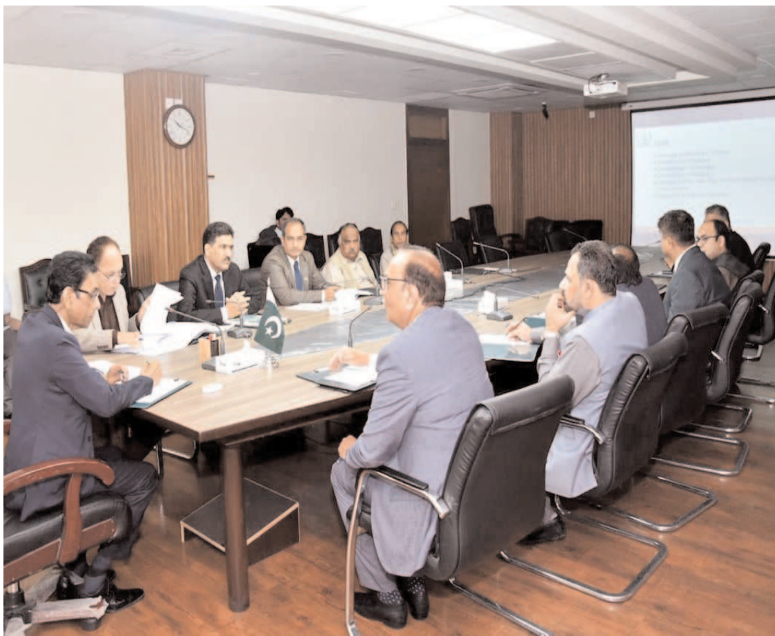
ISLAMABAD: Federal Minister for Science and Technology, Dr. Khalid Maqbool Siddiqui chairing a meeting.