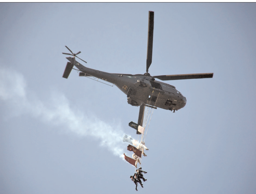
ISLAMABAD: Soldiers hanging with the help of rope from helicopter flying during rehearsal of Pakistan Day parade.

Owing to the alarming situation, the government even imposed a lockdown in multiple cities across Punjab in the wake of thick smog that engulfed several districts. In December 2023, Lahore even witnessed the country's first-ever artificial rain after planes equipped with cloud-seeding equipment flew over the city's 10 areas to battle the dangerous air quality levels in the metropolises. Pakistan's average PM2.5 levels are only exceeded by Bangladesh's 79.9µg/m³. Meanwhile, India is ranked third with 54.4µg/m³ PM2.5 levels. — Agencies