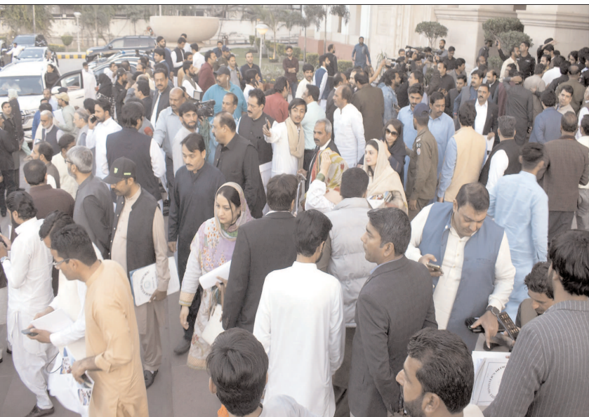
LAHORE: Members of Punjab Assembly leaving after attending budget session.