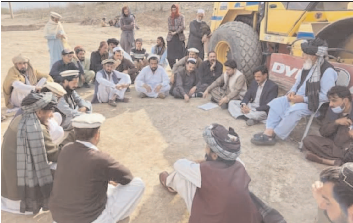
KALAYA: Local administration holding jirga between Boland Khel tribe of Upper Orakzai and North Waziristan District.