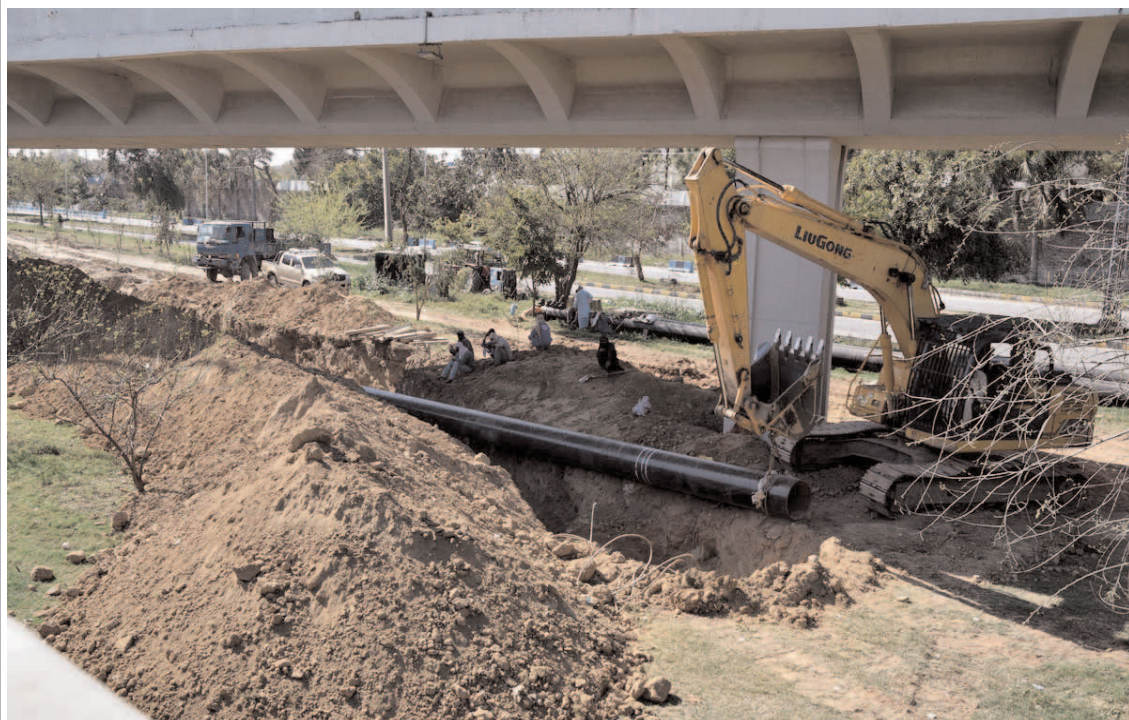
ISLAMABAD: Labourer busy installing underground main Gas pipe line with the help of crane at G-9 Peshawar More.

Jinnah Avenue, Red Double Line, so that the passengers leaving the metro bus could also use the cycling track. Similarly, under this project, every sector of Islamabad would be connected with a cycling track. Moreover, 150 parking stands will also be constructed under the Bicycle Lab Project (BLP) so that the citizens can benefit from the facilities like bikes on cheap rent.