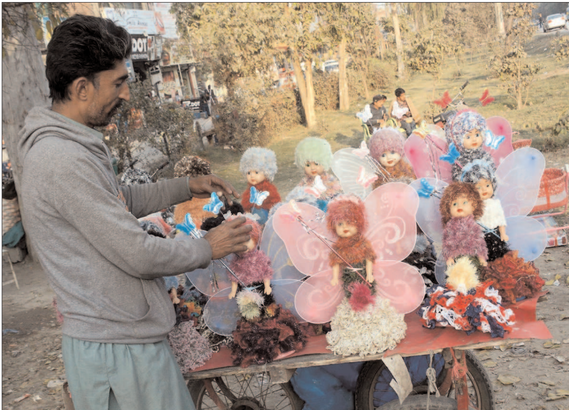
LAHORE: Vendor busy in arranging and displaying beautiful dolls to attract the customer at his roadside setup.

He said that people gradually understand the benefits of safety measures at work and hoped that with the training the staff, students, and teachers of the campus would learn a lot about the importance of bio-safety, bio-security, and risk management.