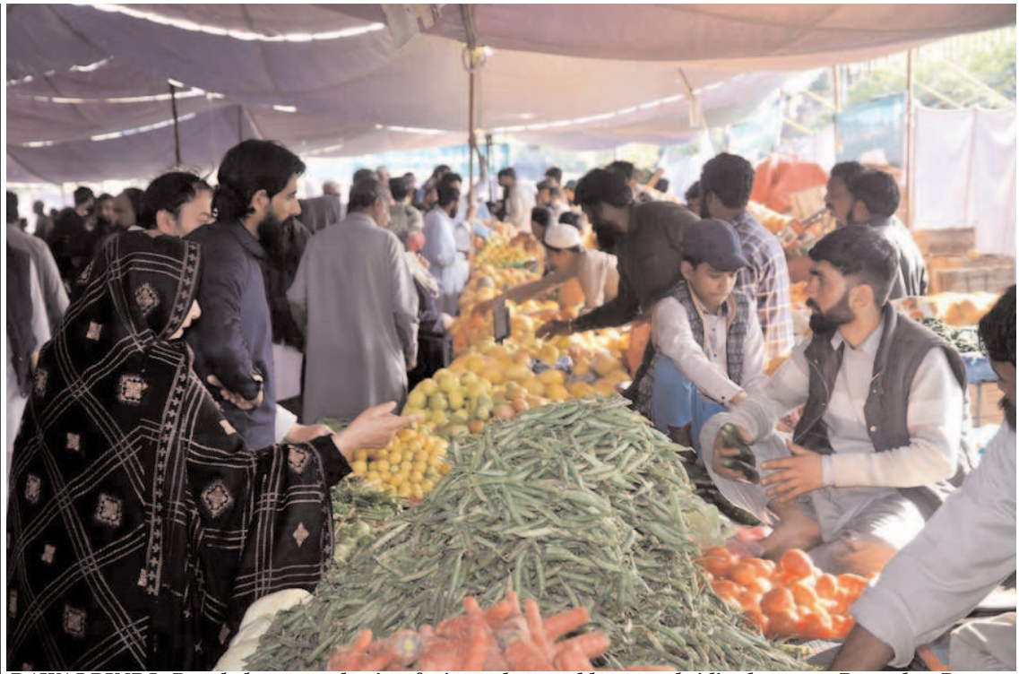
RAWALPINDI: People busy purchasing fruits and vegetables on subsidized rates at Ramadan Bazaar.

improvement in the employment situation in big cities and the stability of the job market for rural migrant workers. Last month, the surveyed urban unemployment rate for 31 major Chinese cities stood at 5.1 percent, down 0.6 percentage points year on year. The figure for rural migrant workers hit 4.8 percent, dropping 1.2 percentage points on a yearly basis, according to the NBS spokesperson.