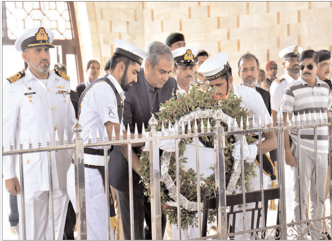
KARACHI: The Federal Minister for Interior Syed Mohsin Raza Naqvi lays flower wreath at the mausoleum of Quaid-e-Azam Mohammed Ali Jinnah.