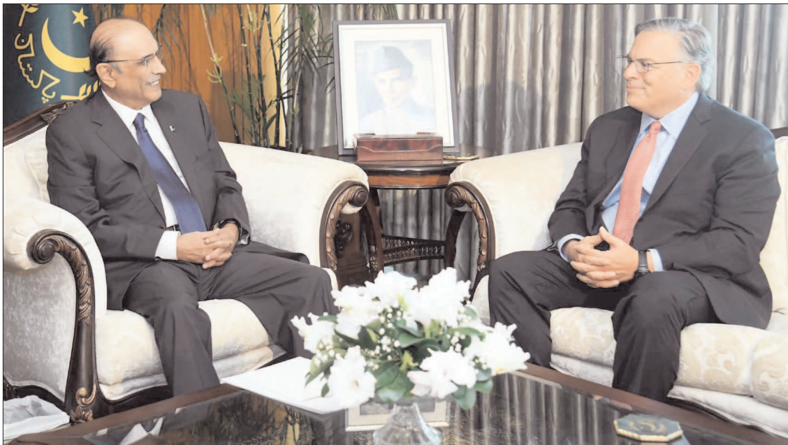
ISLAMABAD: Ambassador of United States of America to Pakistan, Donald Blome called on President Asif Ali Zardari, at Aiwan-e-Sadr.