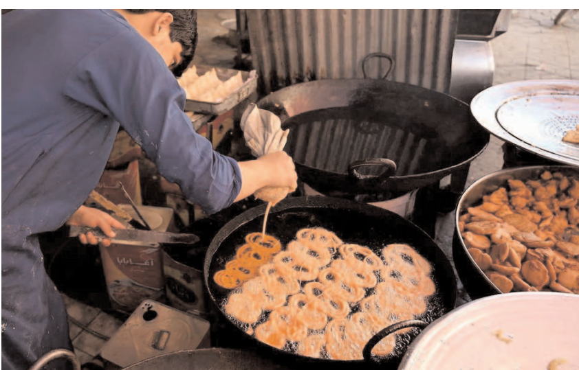
PESHAWAR: Vendor busy in making traditional sweet item Jalebi for customers during Ramadan.

by politicians, hindering the effectiveness of the democratic process. Media influence, marked by censorship and accusations of biased reporting, further complicates the democratic landscape. A free flow of information is essential for an informed electorate and robust democratic functioning, but challenges in the media environment limit these crucial elements. In conclusion, the struggles of democracy in Pakistan are multifaceted, intertwined, and deeply rooted in historical, political, social, and economic factors. Addressing these challenges comprehensively, fostering good governance, promoting the rule of law, and encouraging civic participation are crucial steps towards establishing a resilient and successful democratic system in the country.