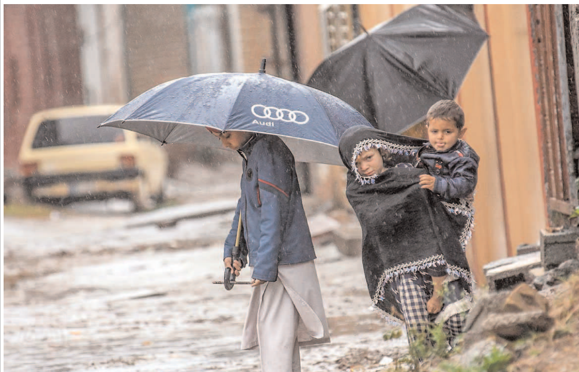
ISLAMABAD: A girl on the way carrying her younger brother during rain that experienced the Federal Capital.

Additionally, he said that the tobacco epidemic required comprehensive strategies encompassing public health interventions, strong tobacco control policies, and awareness campaigns. By tackling tobacco use, Pakistan can mitigate economic losses associated with smoking-related illnesses, potentially alleviate the burden on its healthcare system, and keep youth safe from the harms of tobacco use.