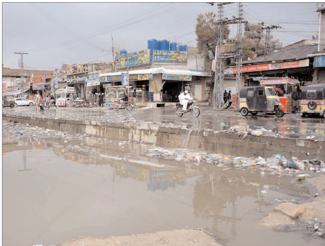
QUETTA: A view of accumulated water on Imdad Chowk after heavy rain.