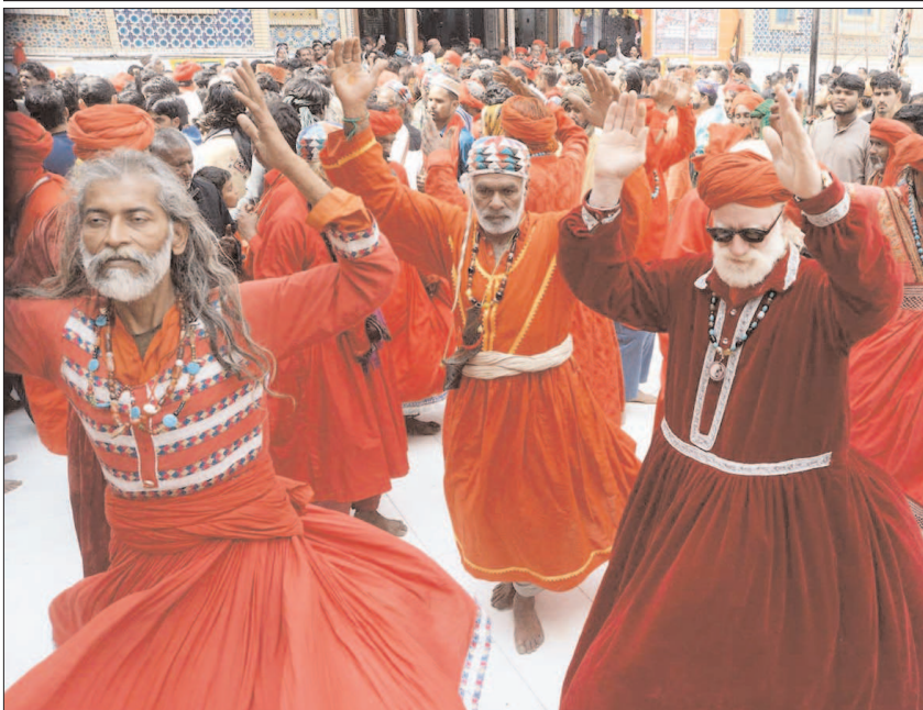
SEHWAN: Devotees presenting Dhammal at Shrine of Hazrat Lal Shahbaz Qalandar during Urs.

LODHRAN (INP): Culprits shave off head of a woman over property dispute here Friday. Police arrested three accused including husband of woman and his two brothers. According to details, one kanal land was transferred in the name of a woman of Lodhran at time her nikkah some 10 years earlier.