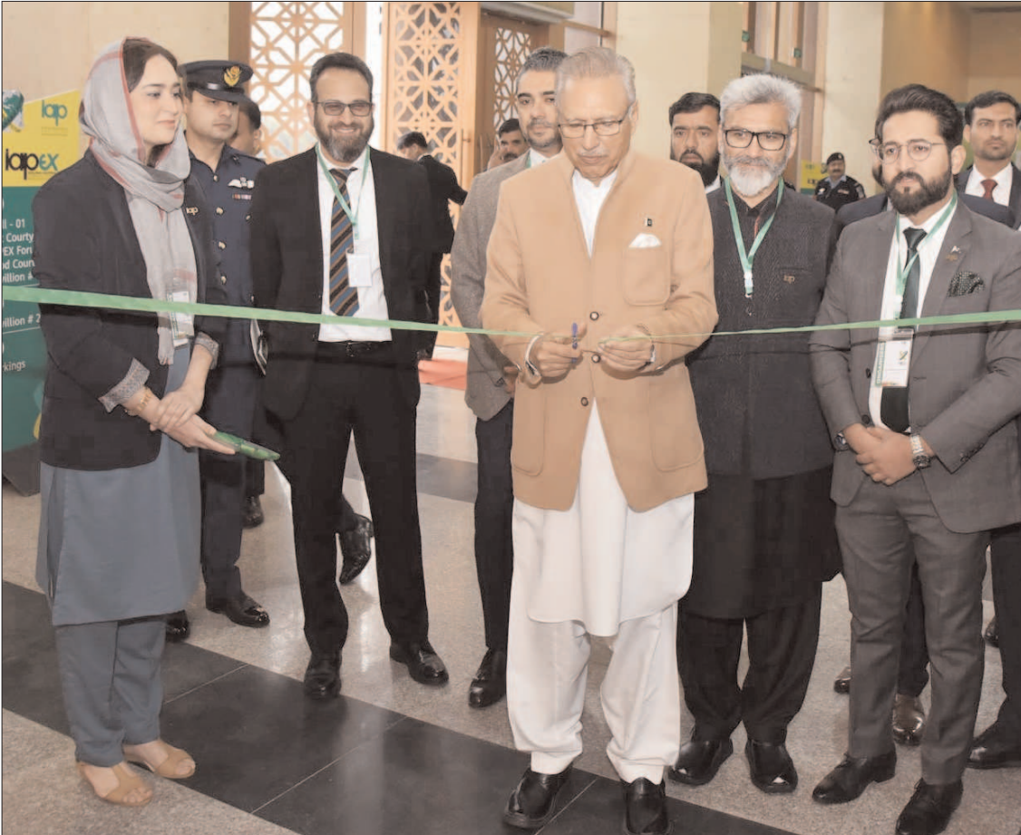
ISLAMABAD: President Dr. Arif Alvi inaugurating Building Material Exhibition and conference organized by Institute of Architects of Pakistan, at Aiwan-e-Sadr.