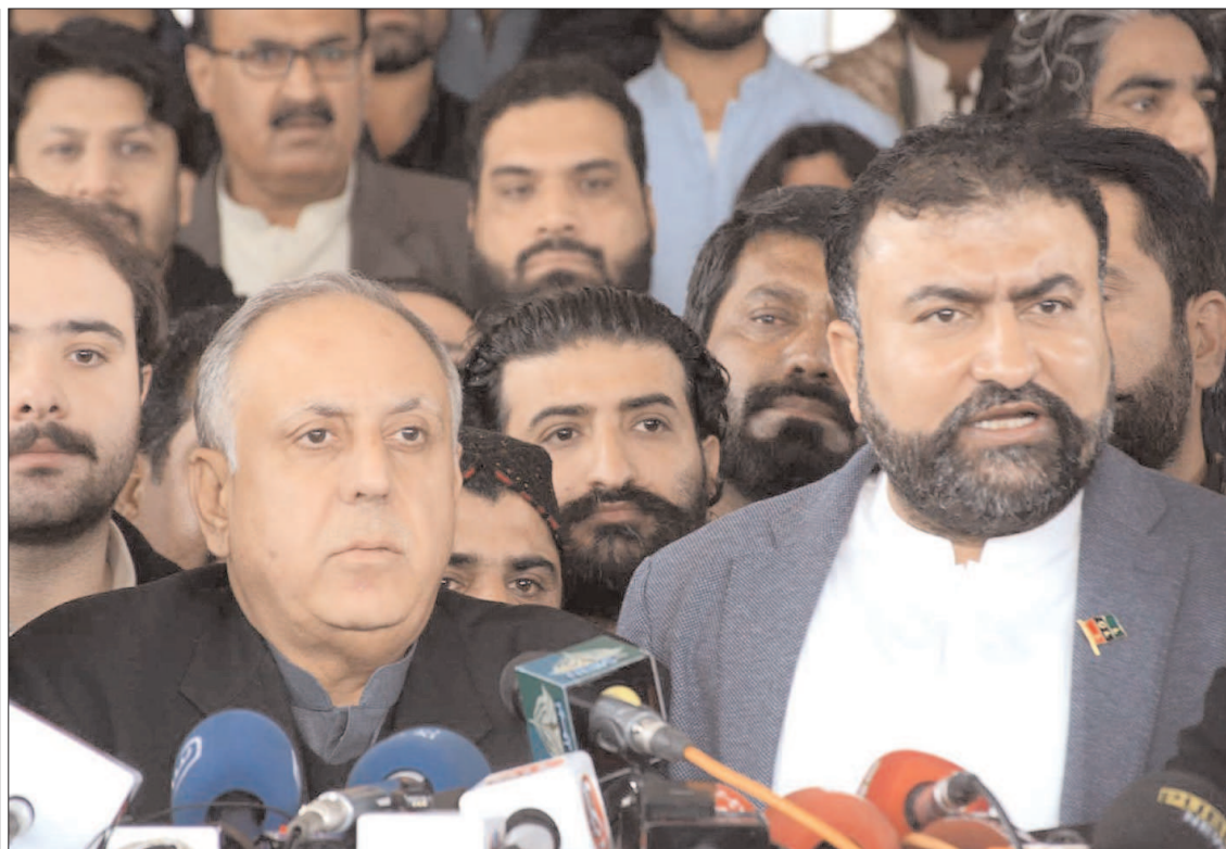
QUETTA: Unopposed elected Chief Minister of Balochistan, Mir Sarfaraz Bugti talking to media persons.