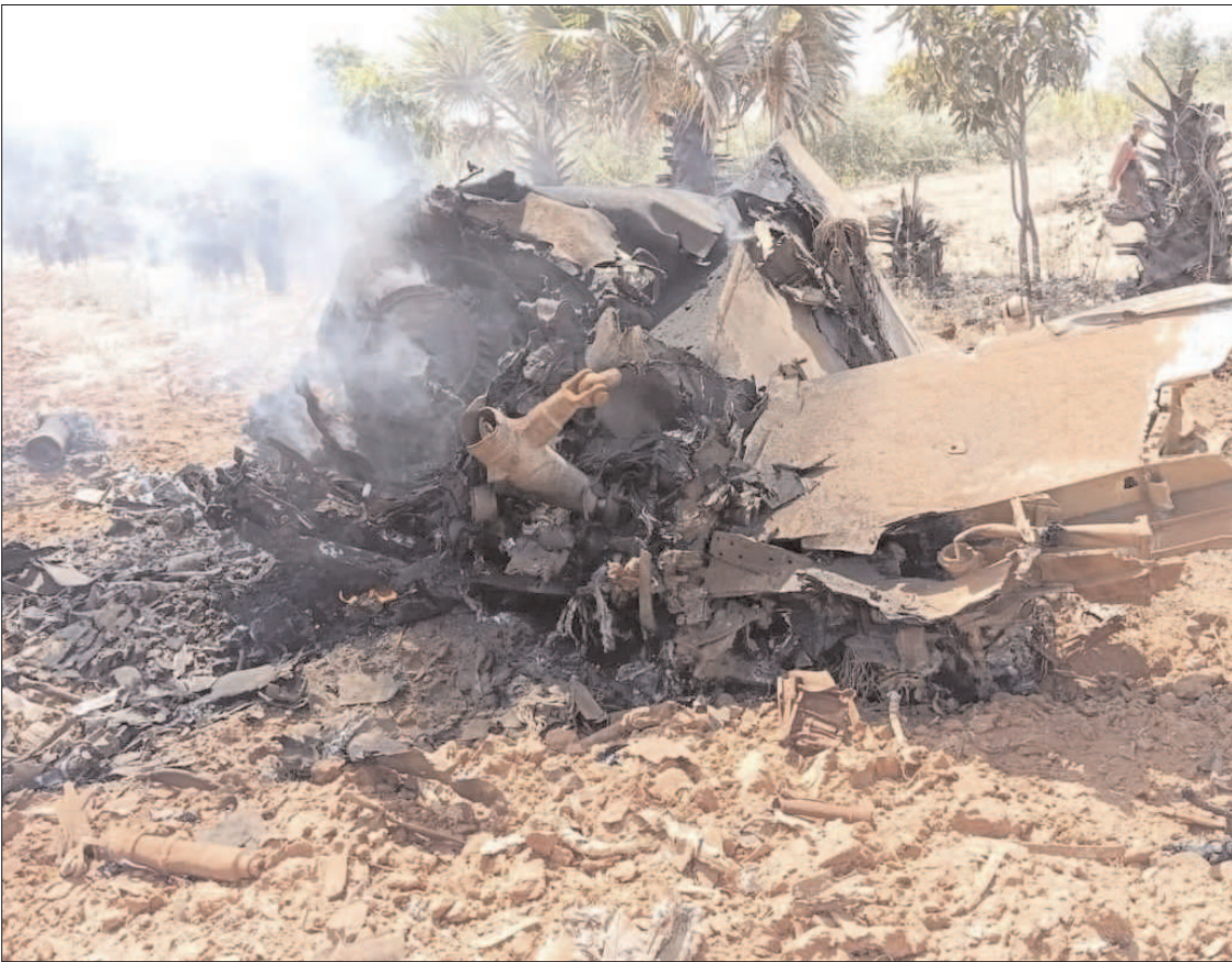
BANGKOK: Smoking wreckage of the jet fighter that crashed in a field is seen near Kyo Wun village, Salin township in Magway region, Myanmar.