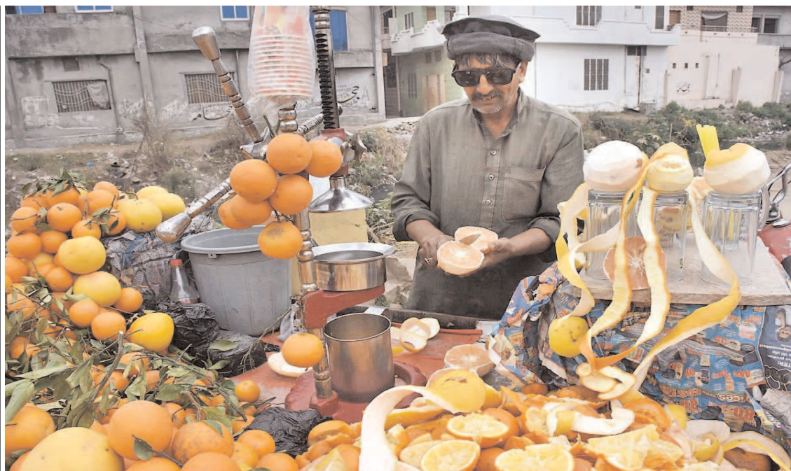
SIALKOT: A vendor extracting orange juice for customers at his roadside setup.

Hashoo Group is Pakistan's premium conglomerate with a diversified business portfolio spanning national and international markets. The Group owns and operates the Pearl-Continental Hotels & Resorts, PC Legacy, and Hotel One brands in Pakistan and has business interests encompassing Hashoo School of Hospitality Management - Pakistan's premier hospitality and tourism education institution, information technology, investment, travel & tourism, and real-estate sectors.