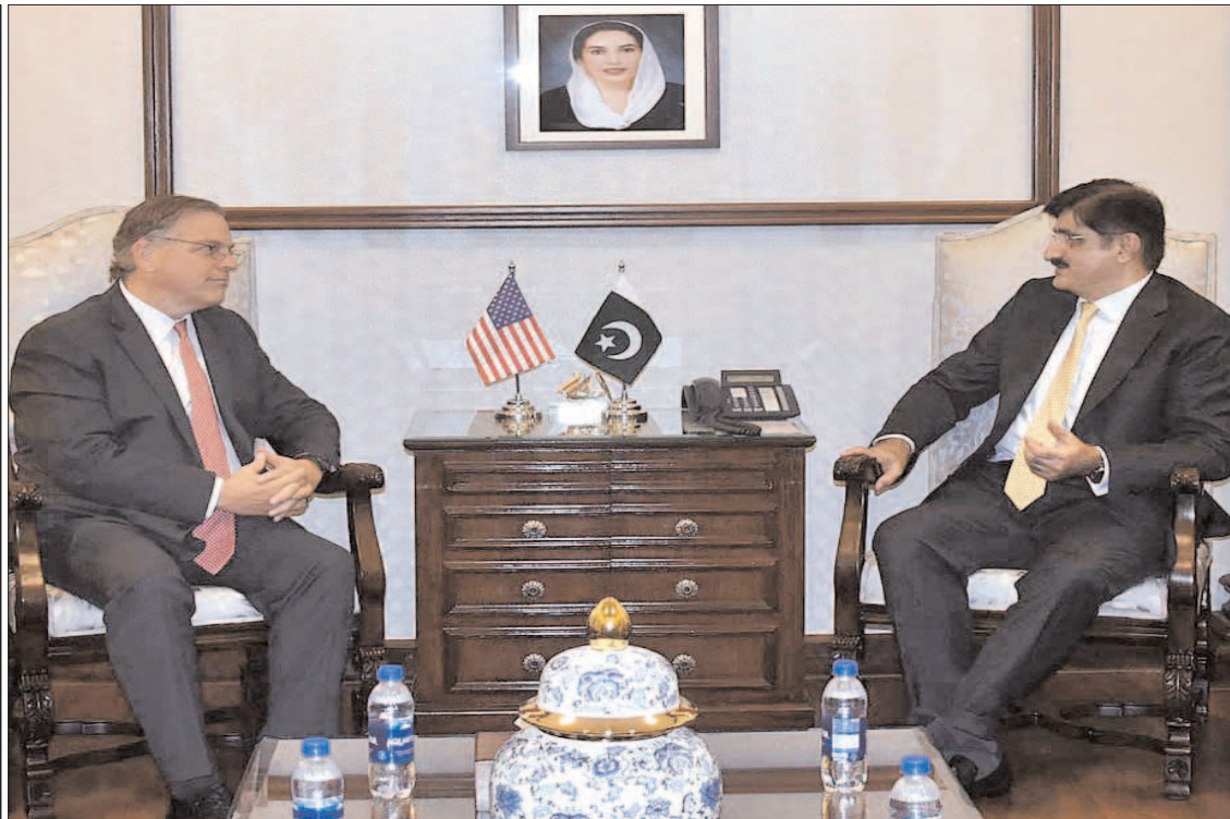
KARACHI: Sindh Chief Minister Syed Murad Ali Shah meets American Ambassador Donald Blome at CM House.