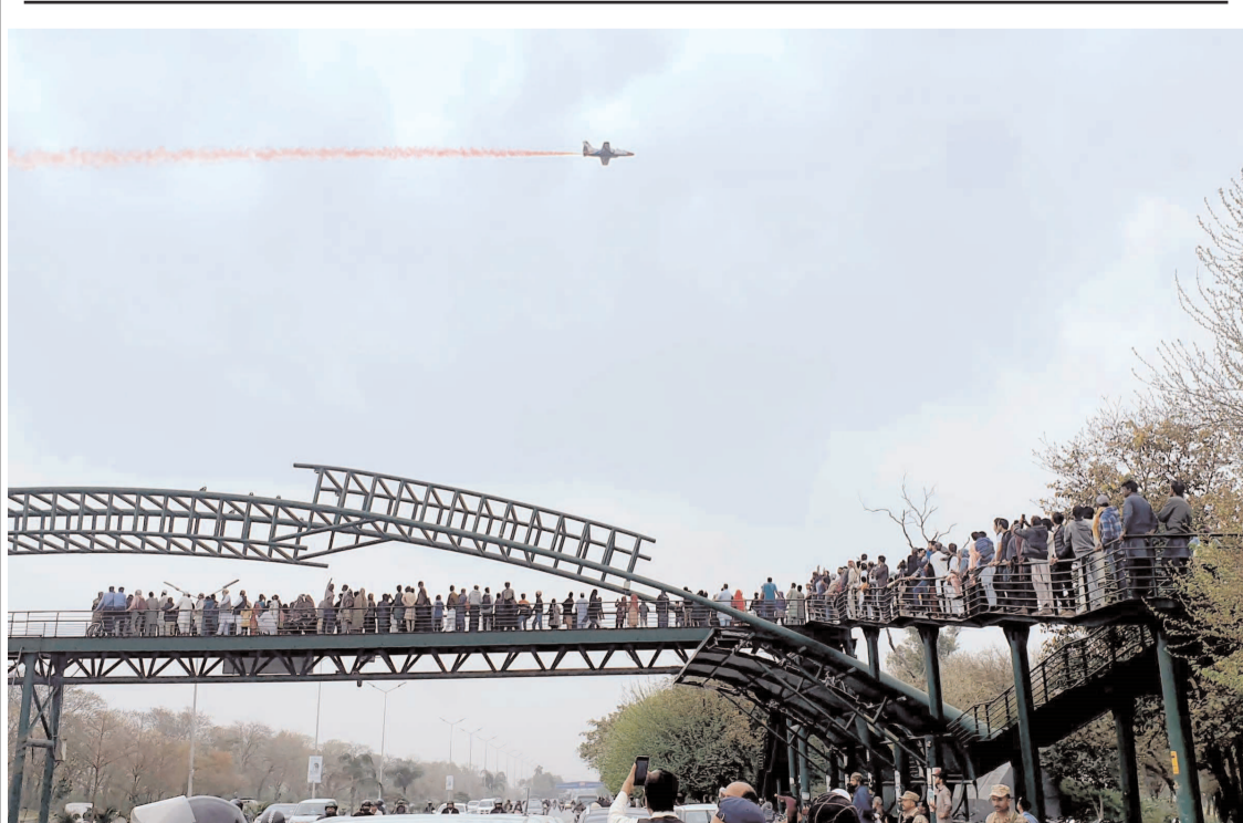
RAWALPINDI: People watching Aerobatic aircrafts taking part in a rehearsal for Pakistan Day celebration show at Shakarparian area in the Federal Capital.

The Ministry has directed the Federal Directorate of Education to ensure compliance with the disciplinary measures and submit a report within 48 hours.