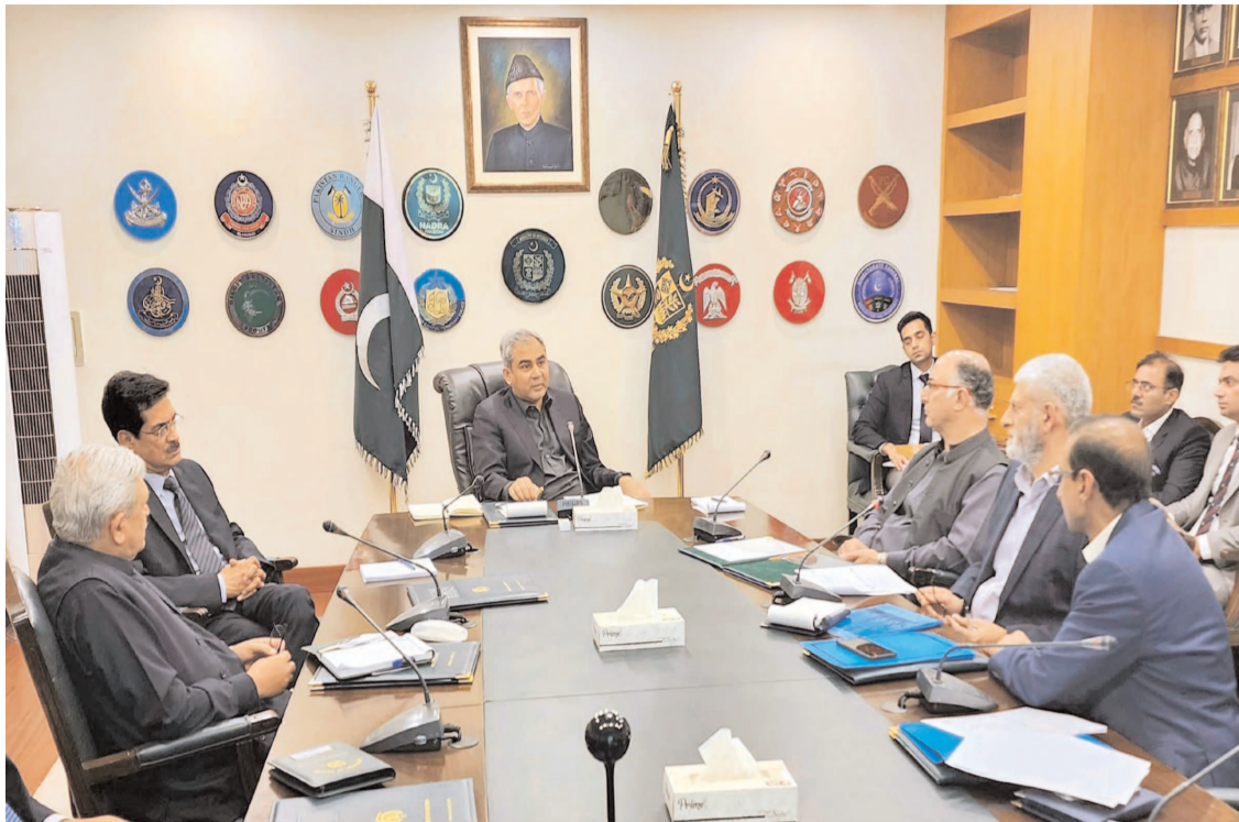
ISLAMABAD: Federal Minister for Interior Mohsin Naqvi chairing a meeting on matters related to Federal Investigation Agency.