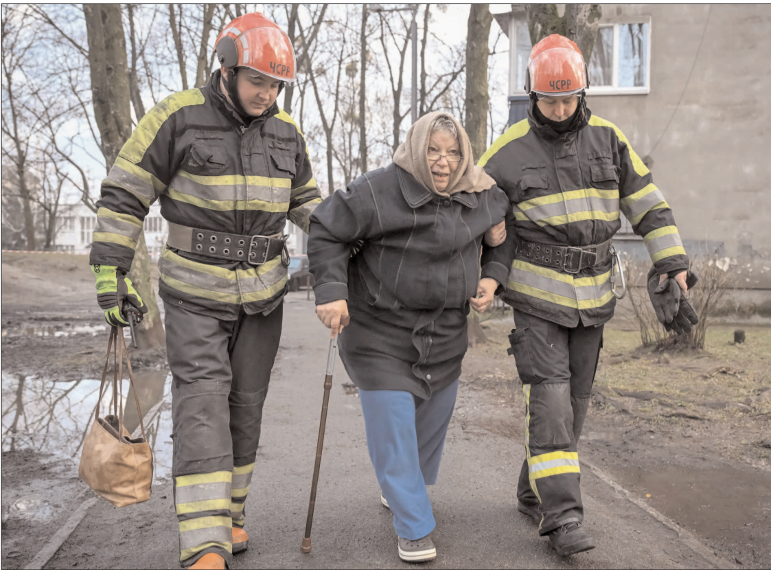
KYIV: Rescuers help a resident evacuate the site of a residential building damaged by a Russian missile attack.