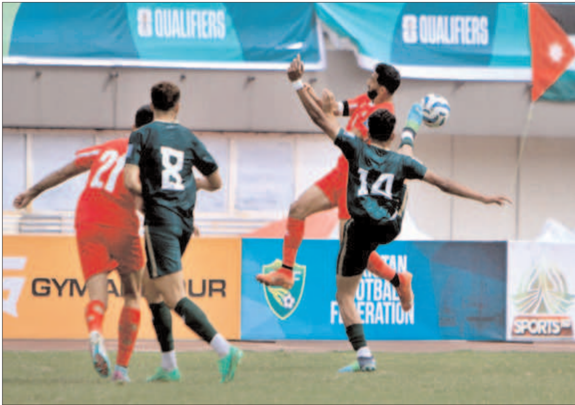
ISLAMABAD: FIFA World Cup 2026 qualifier football match is being played between Pakistan and Jordan teams at the Jinnah Sports Stadium. A