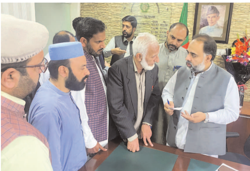
PESHAWAR: Provincial Minister for Health Syed Qasim Ali Shah listening people's issues.

pose, acquiring a paper degree is not enough, but the students under the training of technical institutions in the industry and all other technical fields must be exposed to practical training, for which the new proposed project is very important. He directed implementation of the project to make it fruitful and useful in all aspects and it should be placed in the board of TEVTA for its approval and courses with demand and industries and technical fields should be included while a reasonable and transparent procedure should be devised for the selection and classification of students to benefit all the districts of the province. He also directed the TEVTA authorities to generate income from their institutions and machinery to utilize them usefully and also introduce various models in this regard.