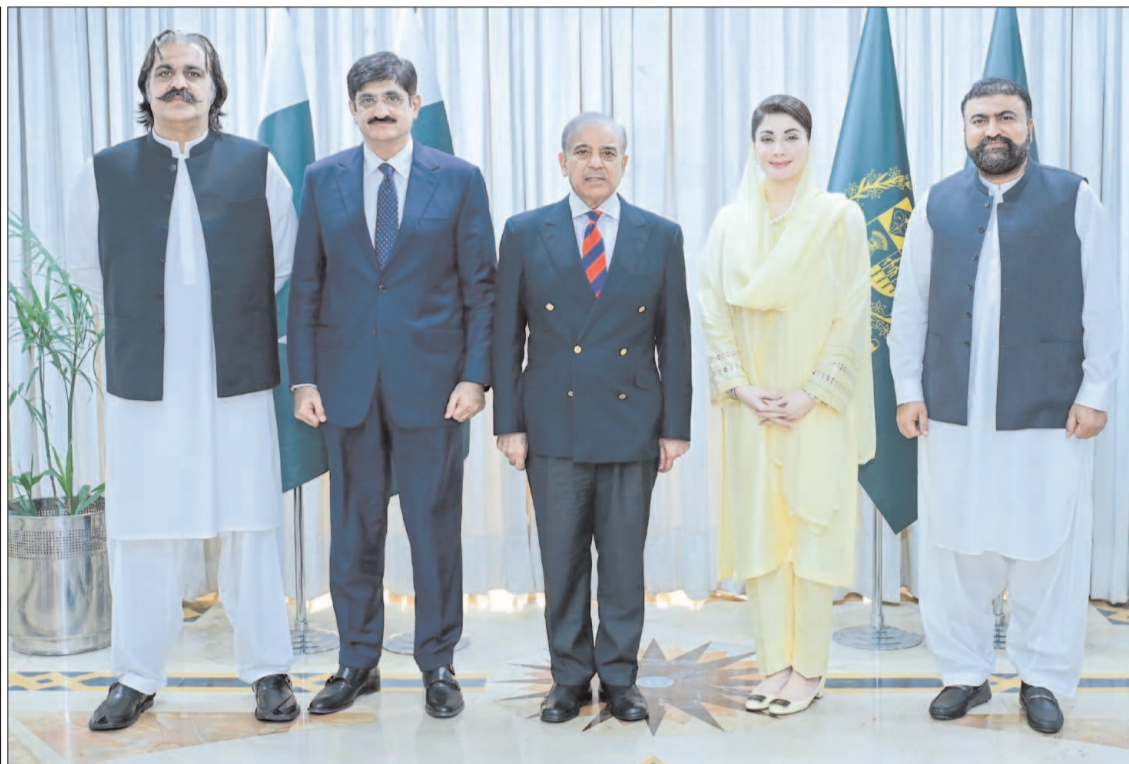
ISLAMABAD: Prime Minister Shehbaz Sharif in a group photo with Chief Ministers of all provinces.

The prime minister highlighted that annually hundreds of billions of rupees were lost in the State Owned Enterprises as PIA alone owed debt worth of Rs 825 billion. Likewise, he said that the interim government also signed many important agreements with different countries to bring investment in the country including that with the United Arab Emirates (UAE) valuing $10 billion.