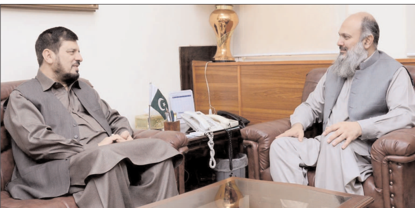
ISLAMABAD: KP Governor, Haji Ghulam Ali called on Federal Minister for Commerce, Jam Kamal Khan.

These all projects and initiatives once completed, will not only provide conducive residential facilities to the people, rather will also result in substantial increase in the revenue of the provincial government, through generating investment and economic activities in the province.