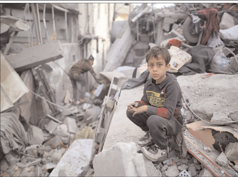
GAZA STRIP: A boy sitting on the debris of destroyed house after Israeli forces bombardment on their area.