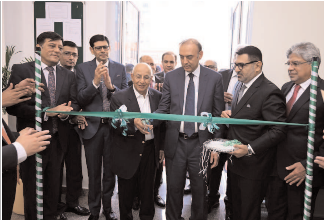
KARACHI: Governor State Bank of Pakistan Jameel Ahmad cutting a ribbon to inaugurate main branch of AL Habib Exchange.

The price of gold in the international market increased by $7 to $2,200 from $2,193, the Association reported.