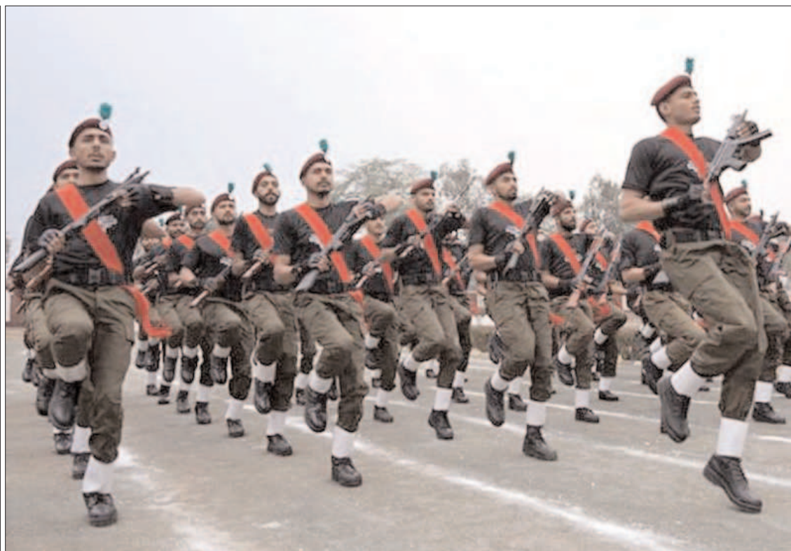
SARGODHA: Police personnel performing parade during Passing Out Parade 'Basic Recruit Class Course' held at Police Training School.