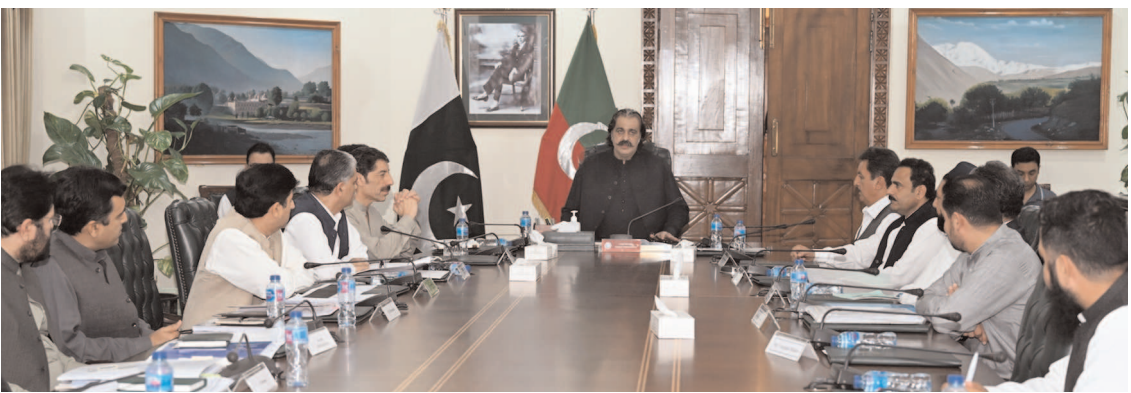
PESHAWAR: Chief Minister Khyber Pakhtunkhwa Ali Amin Gandapur chairing a meeting regarding housing societies in province.