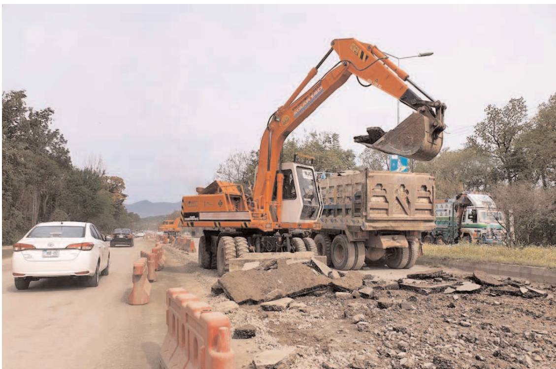
ISLAMABAD: Heavy machinery being used to expand a road at Chak Shahzad in the Federal Capital.

All the stakeholders agreed that concerted efforts should be made and a collective campaign should be launched to deal with the issue. The meeting also discussed several aspects including reduction in drug supply and demand for the implementation of the plan. The DG ANF assured all possible support and assistance from ANF to all the agencies and departments for the successful conduct of the national campaign.