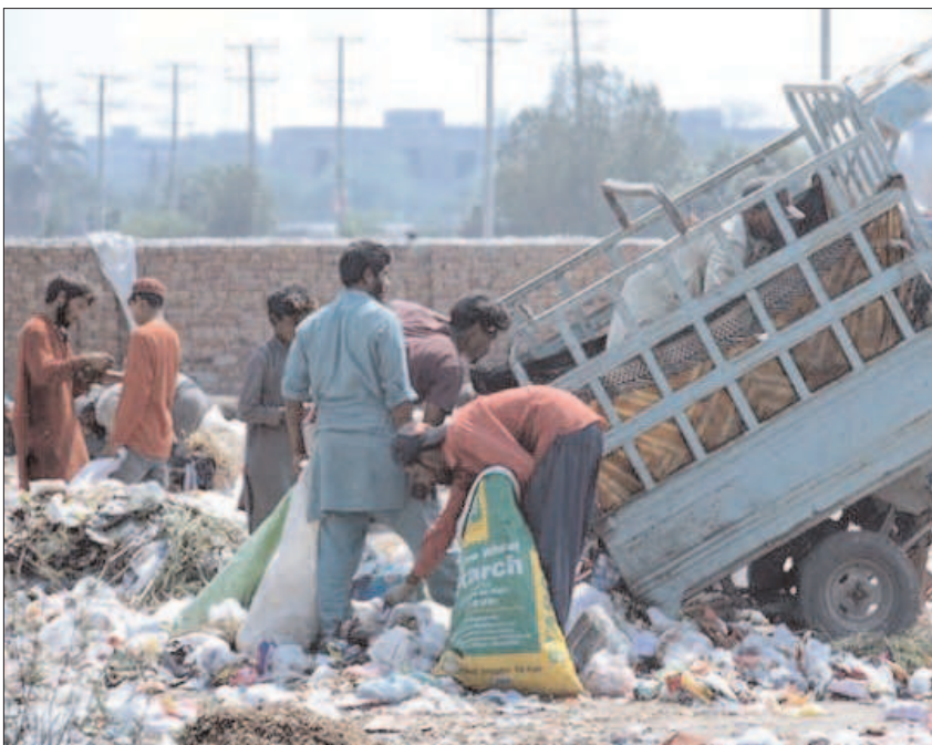
FAISALABAD: Gypsy youngsters searching and collecting recycle items from heap of garbage.

We have all seen the horrific consequences of those who have adopted illegal paths in the past. Most of these individuals' dreams shatter when they lose their lives due to accidents, and their lives become a victim of human smugglers' deceit. And among them, a few individuals who manage to reach their destination through dangerous and extremely difficult circumstances, there awaits a mountain of new challenges. The 'SAFE' project, funded by the European Union, is addressing these issues by guiding young people on these topics.