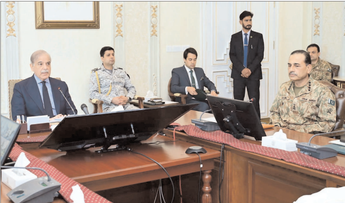
ISLAMABAD: Prime Minister Shehbaz Sharif chairing a high level security meeting.

The army chief said that the nation had steadfastly fought the war on terror for the last two decades and had defeated the nefarious designs of Pakistan's adversaries. Noting the recent surge in terrorist incidents, COAS Munir remarked that the enemies of Pakistan had once again "underestimated the resilience and grit of the state and the people of Pakistan". He added: "We shall fight terrorism till every terrorist casting an evil eye on Pakistan, its people and their guests, is eliminated; we shall not leave any stone unturned to ensure that every foreign citizen, especially the Chinese nationals, contributing to the prosperity of Pakistan, is safe and secure in Pakistan. We shall fight terrorism with all our might, to the very end."