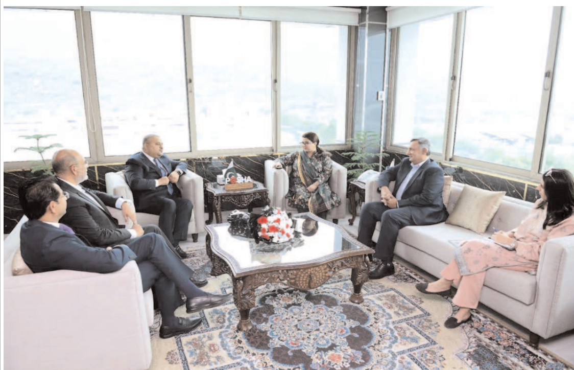
ISLAMABAD: Minister of State for IT and Telecommunication Shaza Fatima Khawaja in a meeting with delegation of Pakistan Software Houses Association (P@SHA).

Organized in the backdrop of the International Women's Day, the webinar held special significance for the member states as these are striving to overcome identical challenges particularly with regard to women empowerment and protection. So far, the Wafaqi Mohtasib Secretariat has received nearly 75 confirmations to attend the Webinar online. The nominations received from the AOA members included, the People's Republic of China, Thailand, Japan, Azerbaijan, Islamic Republic of Iran, Korea, Türkiye and Indonesia, apart from the Provincial Ombudsmen in Pakistan and representatives from the regional offices of the Wafaqi Mohtasib.