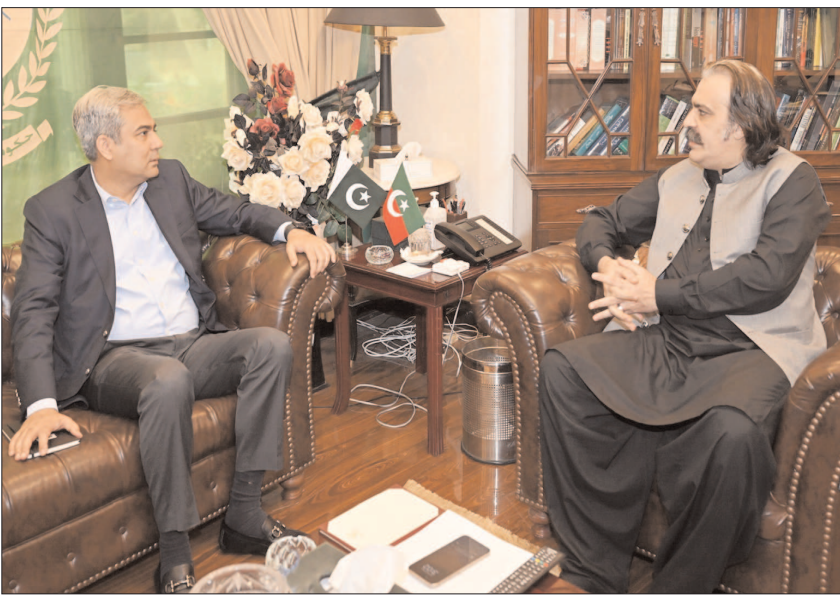
PESHAWAR: Chief Minister of Khyber Pakhtunkhwa, Ali Amin Gandapur called on by Federal Minister for Interior, Mohsin Raz Naqvi.

Touching upon the priorities of his government regarding development of newly merged districts, the chief minister said that Khyber Pakhtunkhwa especially merged areas had been affected badly during the war against terrorism.