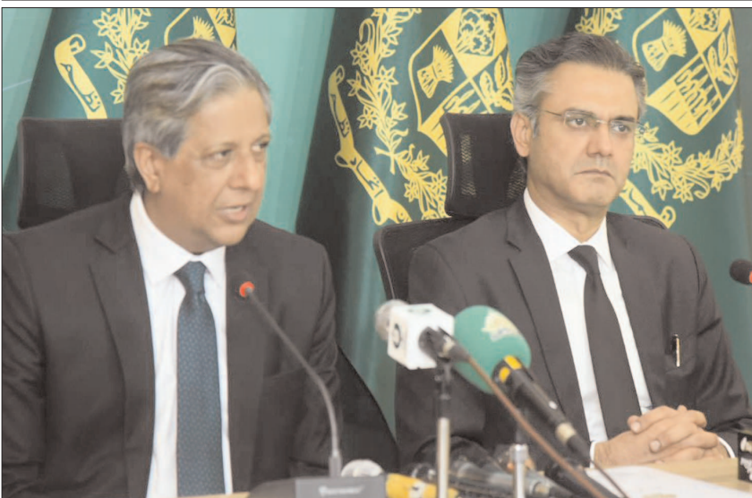
ISLAMABAD: Federal Minister for Law and Justice, Azam Nazeer Tarar and Attorney General of Pakistan, Mansoor Awan, addressing a press conference.

The counsel added that non-cadre officials granted additional charges of Additional Sub-Registrar which is unfair. PHC’s divisional bench issued notice to Advocate General Khyber Pakhtunkhwa and stopped Inspector General Revenue from further postings and transfers.