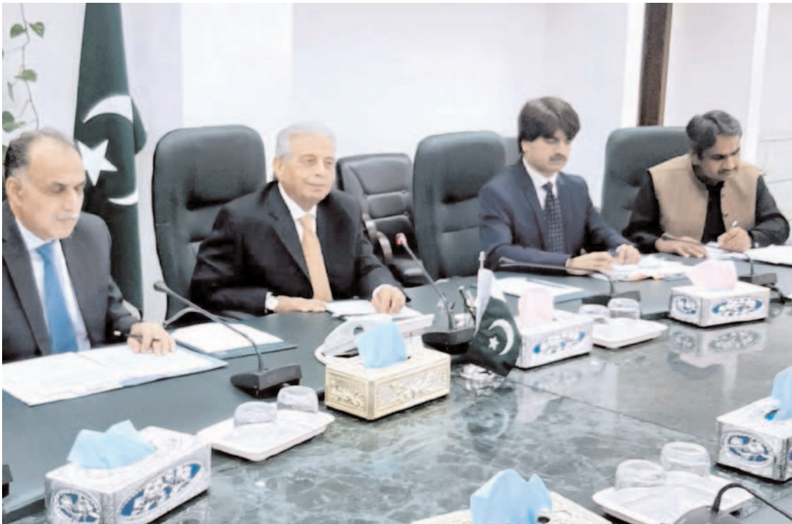
ISLAMABAD: Federal Minister for Industries and Production Rana Tanveer Hussain chairing a meeting at Ministry Industries and Production.