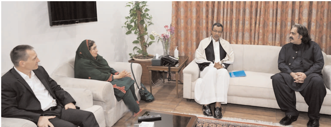
PESHAWAR: Delegation of UNICEF meeting with Chief Minister Khyber Pakhtunkhwa Ali Amin Khan Gandapur.