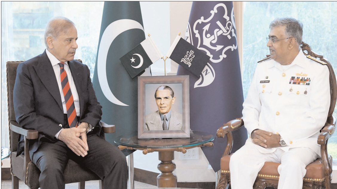
ISLAMABAD: Prime Minister, Shehbaz Sharif exchanging views with Chief of the Naval Staff, Admiral Naveed Ashraf at Naval Headquarters.