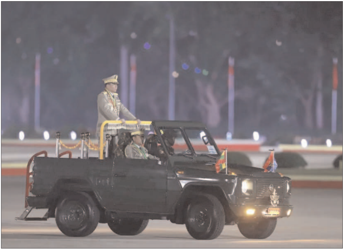
BANGKOK: Senior Gen. Min Aung Hlaing, head of the military council, stands on a military truck as he inspects officers during a parade to commemorate Myanmar's 79th Armed Forces Day, in Naypyitaw.