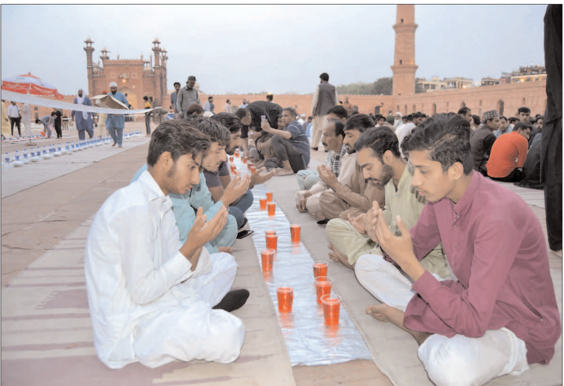
LAHORE: A large number of people offers Dua before break their fast during the holy month of Ramadan at the Badshabad Shahi Mosque.