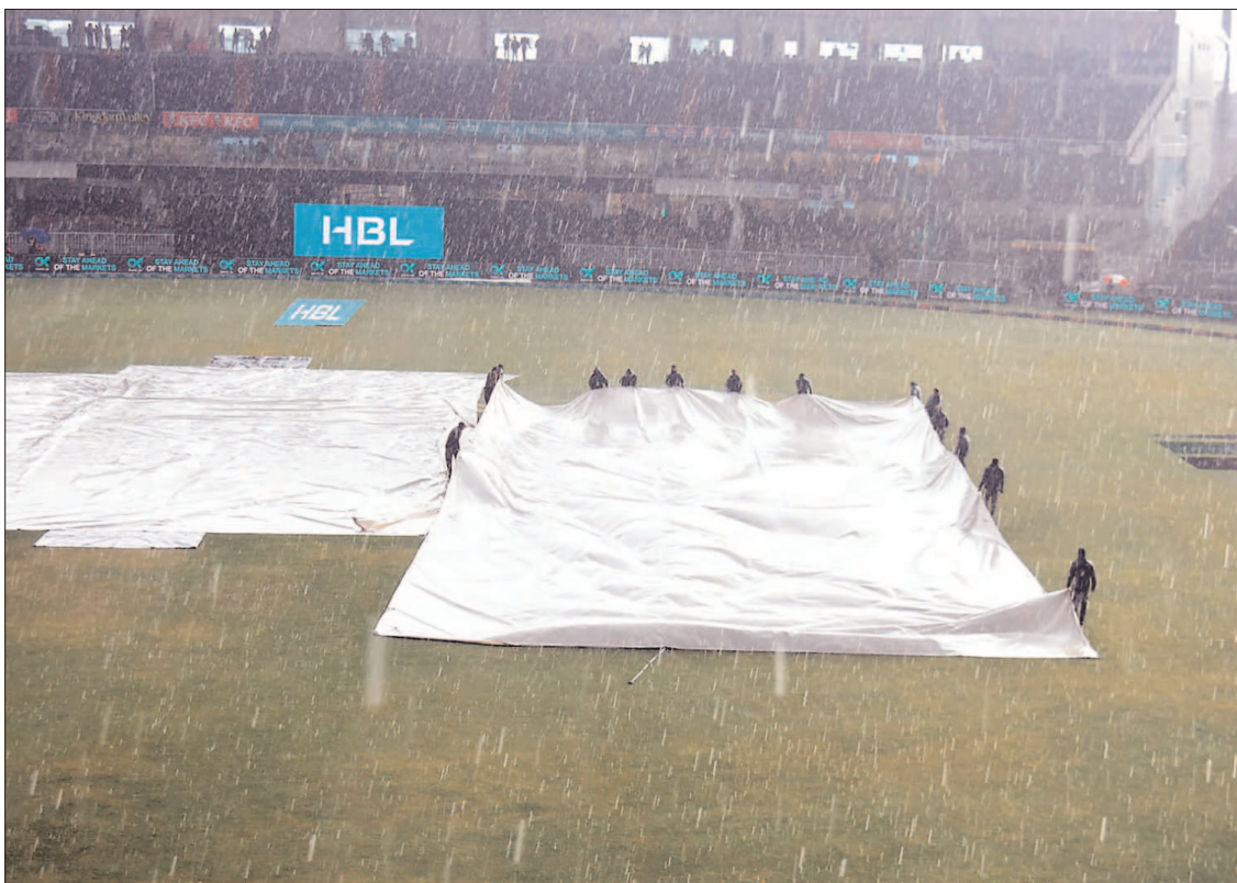
RAWALPINDI: Staffers busy covered pitch due to rain during PSL-9 at Rawalpindi Cricket Stadium.

David Moyes' men move up to seventh and within just two points of the top six.