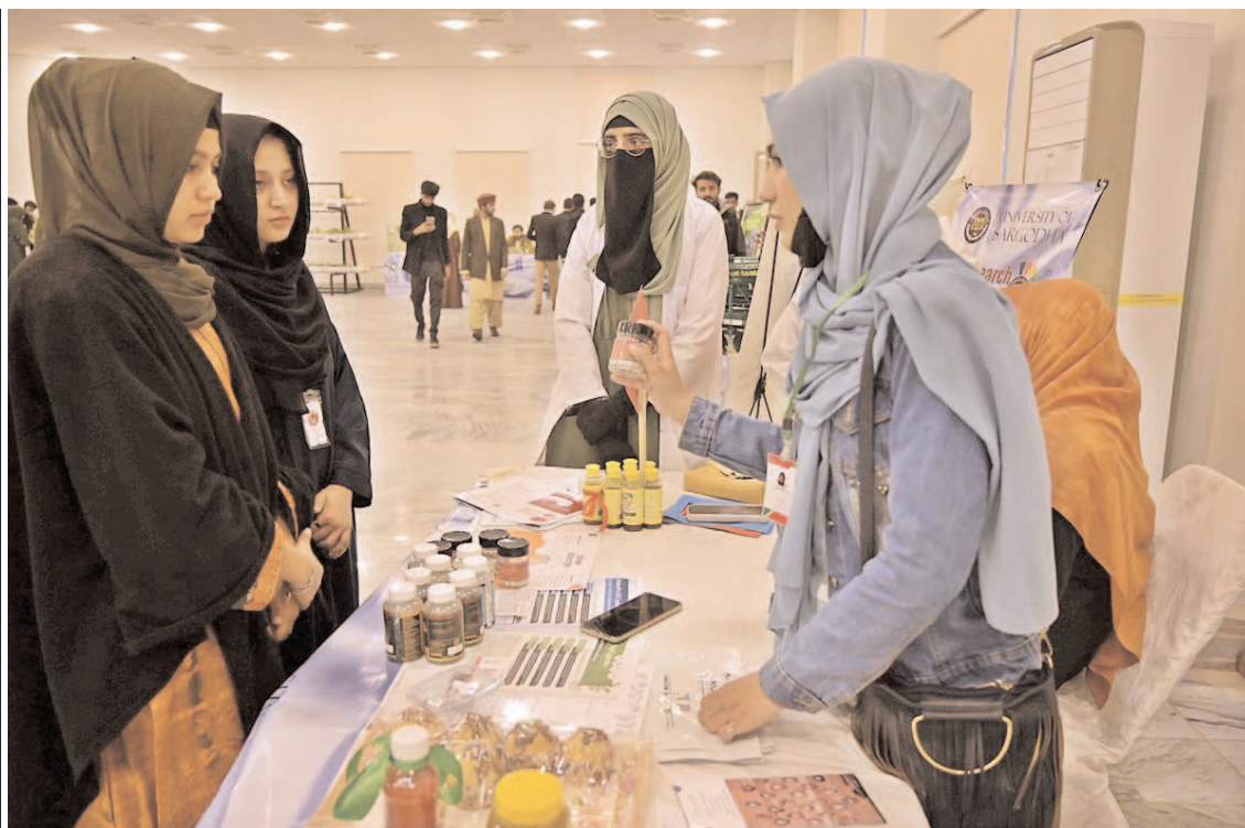
SARGODHA: Students visiting different stalls during Research Arena Exhibition.