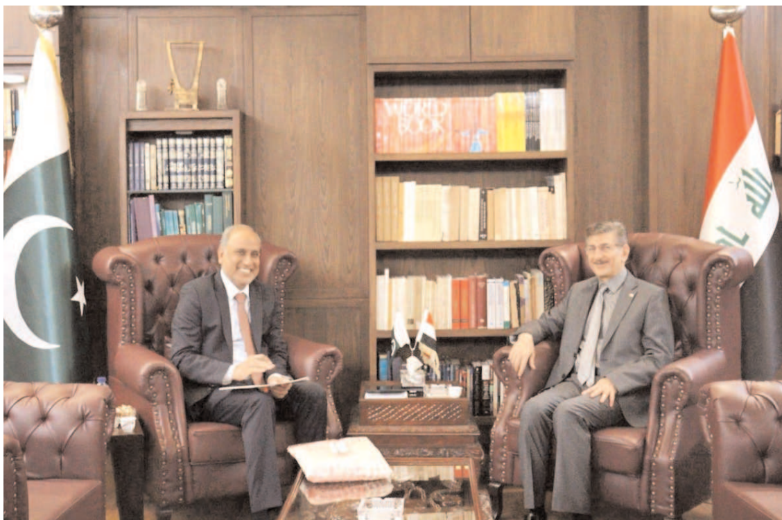
ISLAMABAD: Managing Director Pakistan Bait-ul-Mal Syed Tariq Mahmood-Ul-Hassan called upon H.E. Hamid Abbas Lafta, Ambassador Republic of Iraq in Pakistan.

RAWALPINDI (APP): Rescue 1122 averted a major tragedy when a water tanker hit electric poles and gas pipeline in Gulzar-e-Quaid area here Saturday. According to the Rescue 1122 spokesman, the incident took place when a water tanker hit electric poles of high transmission line and putted the naked wires down on the road. The tanker hit the gas pipeline which resulted in gas leakage. According to details, fire broke out in the gas pipeline which was timely extinguished by Rescue 1122 firefighters and prevented it from further spreading. The area was saved by the timely action of the Rescue personnel. Initially no casualty was reported. The Rescue personnel cordoned off the area. Power and gas departments were also informed.