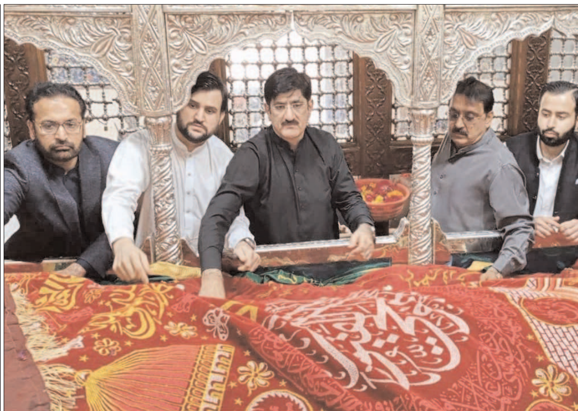
SEHWAN: Chief Minister Sindh Syed Murad Ali Shah laying wreath on the grave of Hazrat Lala Shahbaz Qalandar on the occasion of 772nd Urs celebration on last day.

Plagiarism, fraudulent publications, or other misrepresentation in an application will lead to disqualification at any stage of the program.