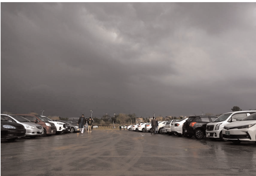
ISLAMABAD: An attractive view of thick clouds hovering over the skies of Federal Capital.

Dr. Fai remarked that the extremism exhibited by the Modi government in different manifestations in Jammu and Kashmir would inevitably have repercussions, as the realities of Kashmir as a region and its significance in global history cannot be erased.