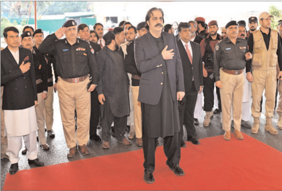
PESHAWAR: Newly elected Chief Minister of Khyber Pakhtunkhwa being presenting guard of honour on his arrival at CM's Secretariat.