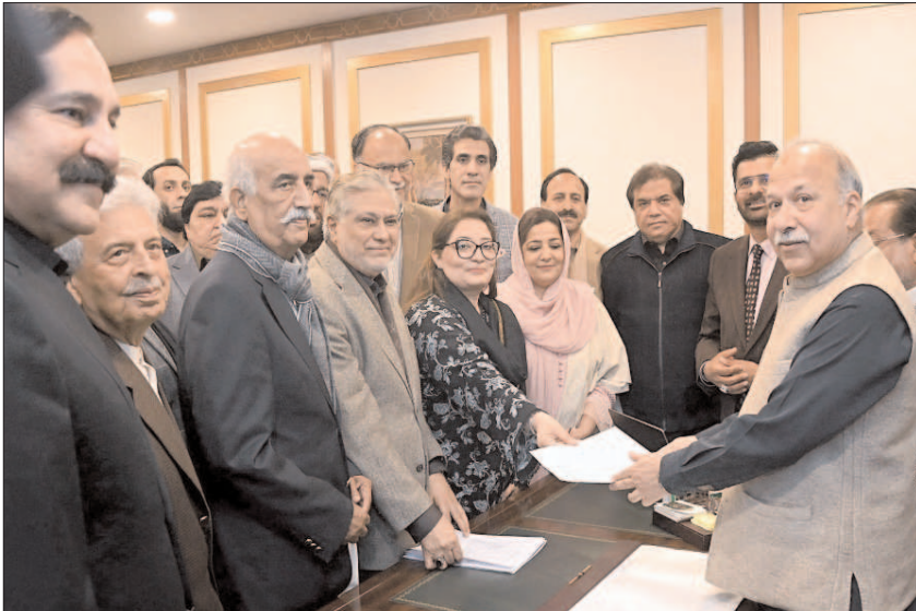
ISLAMABAD: Senator Ishaq Dar along with others Parliamentary leaders submitting nomination papers of Shahbaz Sharif for Prime Minister's slot to secretary National Assembly.

Following the prime minister's election, the newly-elected lawmakers will also elect a new head of the state on March 9, marking an end to the tenure of PTI-backed President Arif Alvi. However, PML-N and PPP's estranged ally Jamiat Ulema-e-Islam-Fazl (JUI-F) chief Maulana Fazlur Rehman, whose party has eight seats in the National Assembly, raised reservations over the polls and said that they would not vote for the president and prime minister. Although the PML-N had Friday expressed hope for a breakthrough after the party's top brass met the JUI-F leadership, no positive news has come out yet.