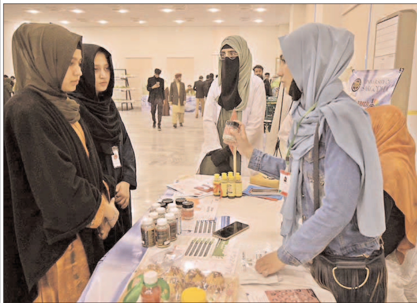
SARGODHA: Students visiting different stalls during the Research Arena exhibition held at the University of Sargodha.

Baloch Culture Day serves as a crucial reminder of the importance of cultural preservation and appreciation. It fosters a sense of unity and pride among the Baloch people, both within Pakistan and across the globe.