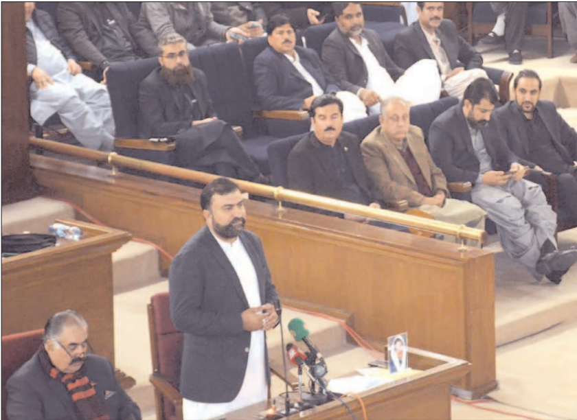
QUETTA: Unopposed elected Balochistan Chief Minister, Mir Sarfaraz Bugti addressing assembly session.

Since the snowfall began, the Pakistan Army teams, in collaboration with the district administration, have been actively working to restore traffic flow on impacted roads. They are utilizing heavy machinery to expedite the process and ensure a swift return to normalcy.