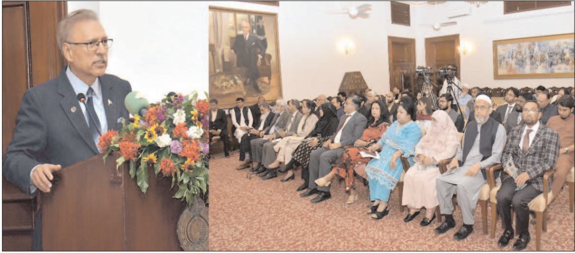
KARACHI: President Dr. Arif Alvi addressing the first Karachi festival of books and libraries.