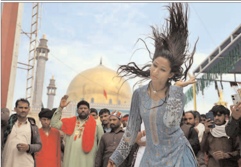
SEHWAN: Devotees performing dhamaal at the shrine of Hazrat Lal Shahbaz Qalandar on the occasion of 772nd urs celebration.