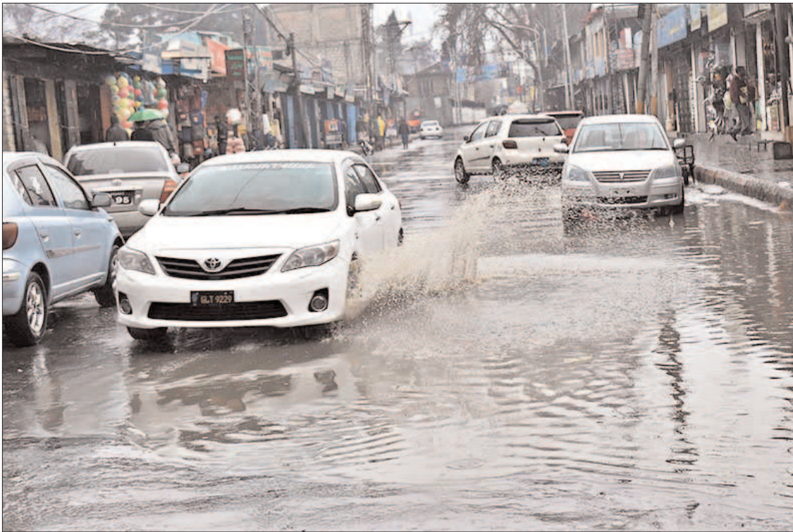
GILGIT: Vehicles passing through stagnant rain water accumulated on road during heavy rain that experienced the city.