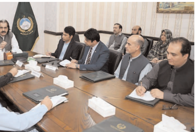
PESHAWAR: Chief Minister Khyber Pakhtunkhwa Ali Amin Khan Ghandapur chairing a meeting of Information Technology Department.