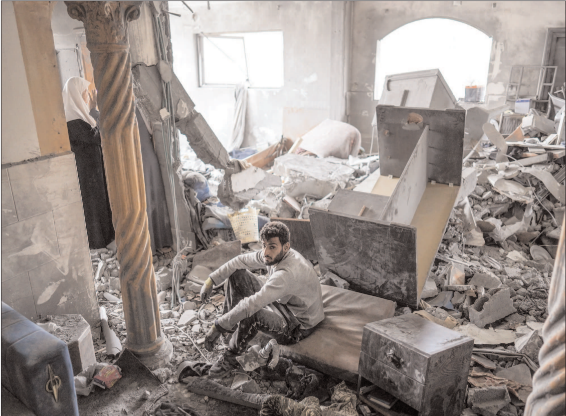
GAZA STRIP: A Palestinian man inspecting the rubble in a house following Israeli bombardment in Maghazi camp for Palestinian refugees.