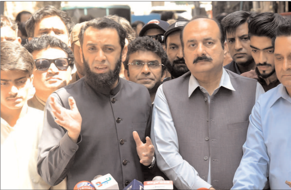
LAHORE: Federal Minister for Information and Broadcasting, Attaulah Tarar is talking to the media at Gwalmandi.

The chief minister said 500,000 farmers will be given loans of Rs150 billion in a year on easy terms through Kisan Card.