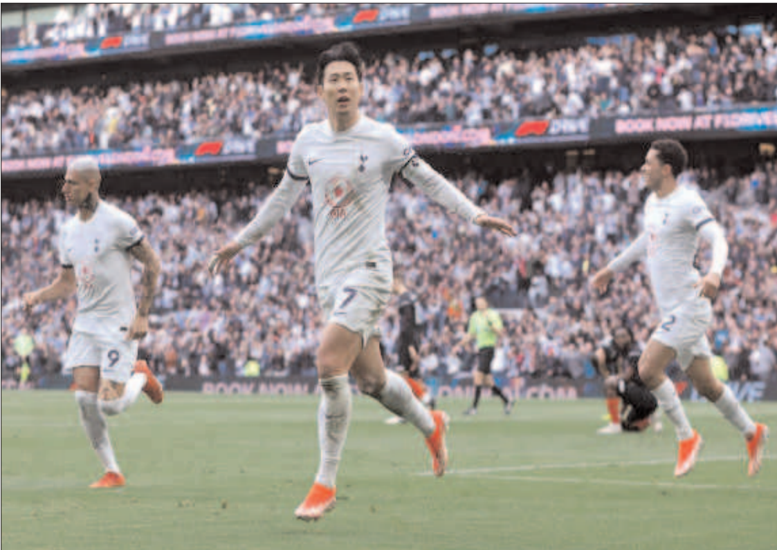
LONDON: Heung-Min Son of Tottenham Hotspur celebrates scoring their teams second goal during the Premier League match between Tottenham Hotspur and Luton Town at Tottenham Hotspur Stadium on March 30, 2024 in London, England.

Nikola Jokic had 32 points and 10 rebounds and Aaron Gordon and Michael Porter Jr scored 14 each for the Nuggets, who have lost two in a row at home for the first time this season and slip to third in the West, behind Minnesota and the Oklahoma City Thunder.