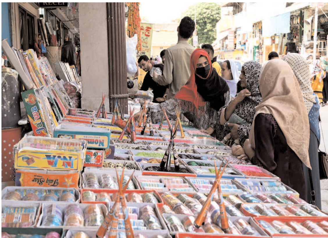
ISLAMABAD: Women purchasing bangles and henna for upcoming Eid ul Fitr Festival.

ISLAMABAD (APP): The International Day of Zero Waste was observed globally including Pakistan on Saturday. On 14th December 2022, the United Nations General Assembly adopted a resolution to proclaim 30th March as International Day of Zero Waste. The day highlighted both the importance of bolstering waste management globally and the need to promote sustainable consumption and production patterns. The waste pollution significantly threatens well-being of humans and their economic prosperity. It accelerates the triple planetary crisis of climate change, nature and biodiversity loss, and pollution.