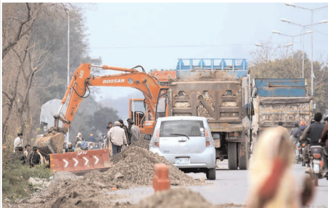
ISLAMABAD: Heavy machinery being used to expand Chak Shahzad Road in the Federal Capital.

She said the country is facing serious climate catastrophes that have been triggered due to global GHG emissions leading to a climate crisis.