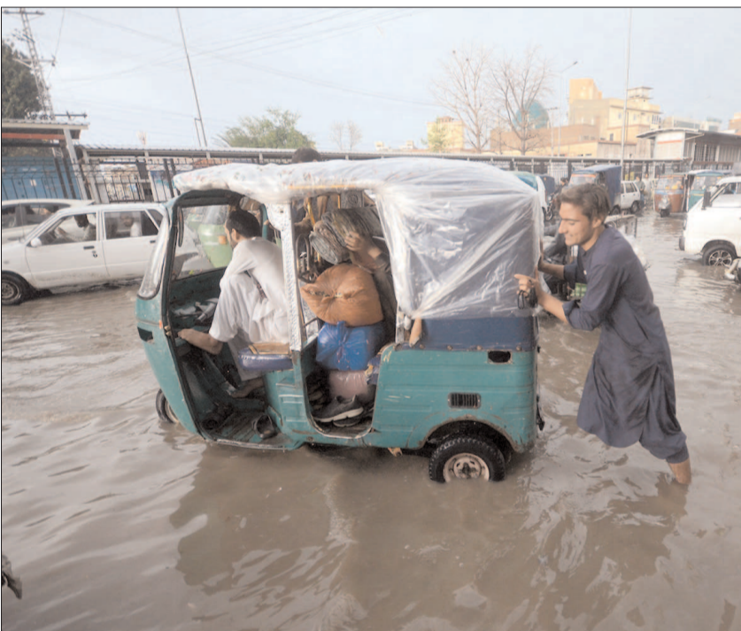
PESHAWAR: A man pushing out of order auto rickshaw at flooded road during heavy rain in the City.

Bukhari's decision underscores the importance of party unity within PTI. By prioritizing the party's well-being over personal ambition, Bukhari exemplifies the party's dedication to its core principles. While this development necessitates strategic adjustments for the upcoming elections, Bukhari's actions demonstrate the unwavering commitment within PTI's ranks.