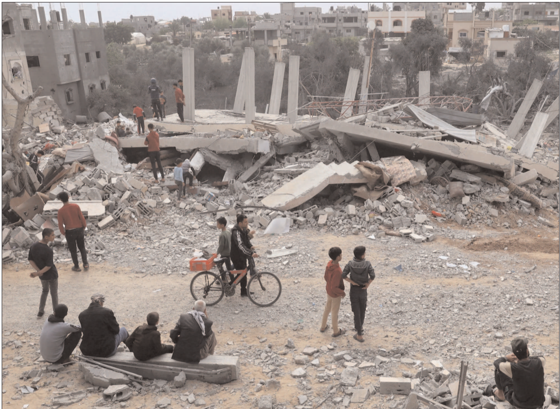
GAZA STRIP: Palestinians inspecting the damage to a building after overnight Israeli bombardment in Rafah.