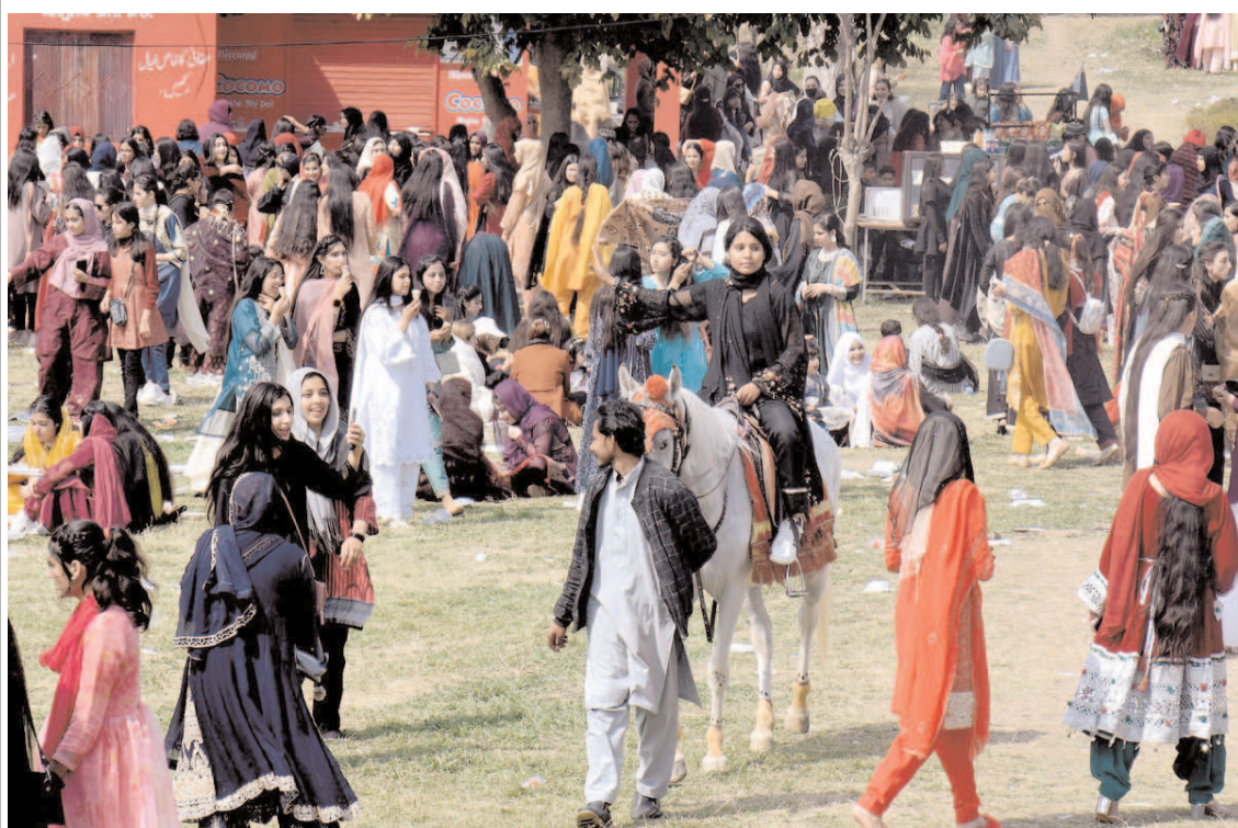
ISLAMABAD: Students enjoy horse ride during Annual Funfair at Model College G10/4.