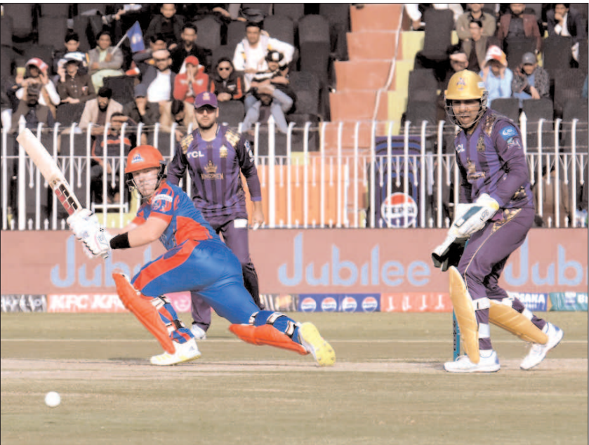
RAWALPINDI: Pakistan Super League (PSL) Twenty20 cricket match playing between Karachi Kings and Quetta Gladiators at Pindi Stadium.

deliveries which featured four boundaries and a six. Zaman led the bowling attack for the Qalandars with 4/37, followed by Afridi, who bagged two wickets. Put into bat first, the defending champions, who are yet to win a match in the ongoing tournament could manage a subpar total despite Rassie van der Dussen's half-century. The visitors had a disappointing start to their innings as they lost their openers Sahibzada Farhan (2) and Fakhar Zaman (10) inside the batting powerplay with just 16 runs on the board. The Qalandars then sustained another blow to their batting charge when Shai Hope (6) perished in the sixth over, bringing them down to 30/3 in the seventh over.