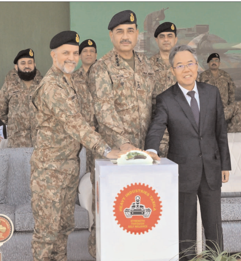
TAXILA: Chief of Army Staff (COAS), General Syed Asim Munir visiting Heavy Industries Taxila at the rollout ceremony of Haider Tank (Pilot Project).