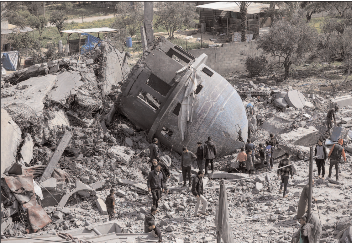
GAZA: People look for salvageable items amid the rubble of Al-Bukhari Mosque that was destroyed in Israeli attacks in Deir el-Balah.

Despite the damage from Ukrainian attacks, the Black Sea fleet remains a powerful force and is still capable of launching long-range cruise missile strikes at Ukraine. Russian air bases in Crimea also have remained operational, hosting warplanes that have continued flying combat sorties to support its ground operations in the region. Russian military bloggers reported that the head of the Black Sea fleet, Adm. Viktor Sokolov, was dismissed last month following the latest losses of warships. There was no official confirmation of his ouster.