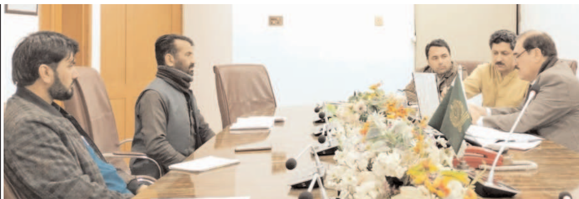
PESHAWAR: Right to Information Services Commission solving people's complaints.

PHC order submission of deal report about national debts in both domestic& dollar as well as provision of income along with expenditure of natural resources on daily, weekly, monthly and annual record for public domain. Early hearing in the upcoming days is expected on the plea in larger public interest.