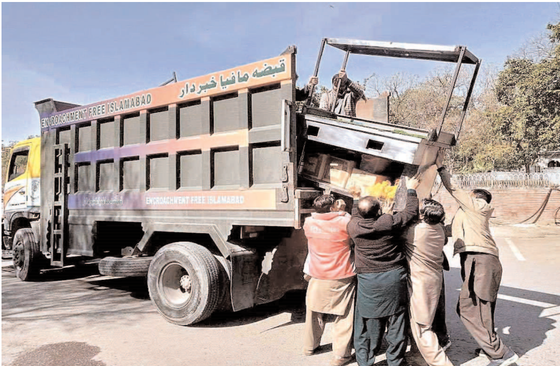
ISLAMABAD: CDA workers lift ups vendor's setup during an anti-encroachment campaign at F-7 Markaz.