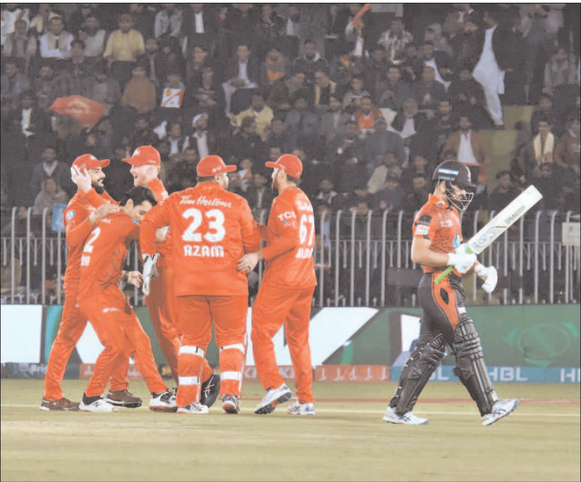
MULTAN: Pakistan Super League (PSL) Twenty20 cricket match playing between Islamabad United and Lahore Qalandars at Pindi Stadium.

ISLAMABAD (APP): The International Hockey Federation (FIH) and International Olympic Committee (IOC) unveiled the competition schedule for hockey at Paris 2024, to be played from July 27 to August 9. The schedule was revealed by IOC President Thomas Bach and FIH President Tayyab Ikram, said a press release. The hockey tournaments of the XXXIII Olympiad would be played in Yves-du-Manoir Stadium – an Olympic Games arena in 1924 – in Colombes, near Paris. A total of 12 men's and as many women's national teams would compete to clinch the highly coveted Olympic medals, including Dutch women and Belgian men who will compete in the event as the reigning gold medalists from the Olympic Games Tokyo 2020. Both men's and women's hockey tournaments at Paris 2024 would get underway on July 27. The first match of Hockey at Paris 2024 would be an all-European affair with Great Britain taking on Spain in the men's Pool A match. The women's competition would begin on the same evening with silver medalists from Tokyo 2020, Argentina, beginning their quest to go one step further this time, against USA in the women's Pool B encounter. The pool stages in both tournaments would be played till August 3, followed by knockout matches starting August 4.