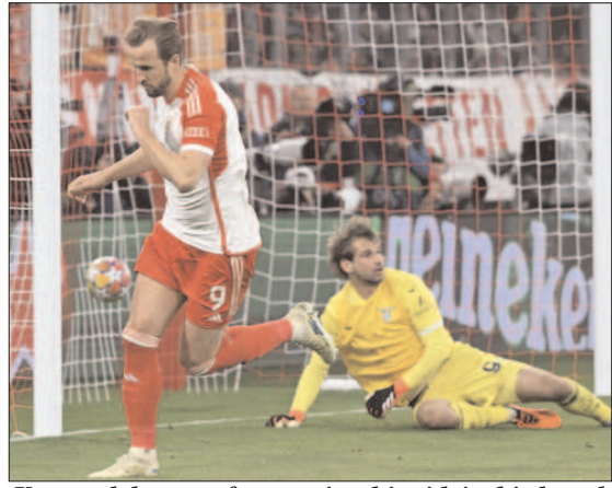
Kane celebrates after scoring his side's third goal.

second time in the past 13 seasons. Three straight losses including the 1-0 defeat in the first leg in Rome amounted to Bayern's worst run since 2015, costing Tuchel his job less than a year after arriving in Munich. With Tuchel allowed to keep the seat warm until the summer, the coach promised to be more "ruthless." On Tuesday, he benched big-money signing Kim Min-jae for Eric Dier, while moving Joshua Kimmich — a fixture in midfield for Bayern and Germany — to right-back. Bayern pushed Lazio back early with the fit-again Sane and Jamal Musiala going close. Scorer of the first leg's only goal, Ciro Immobile had a golden chance to