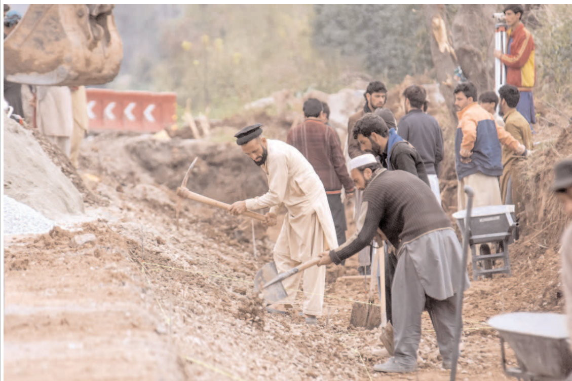
ISLAMABAD: Labourers working on expansion of Chak Shahzad Road in the Federal Capital.