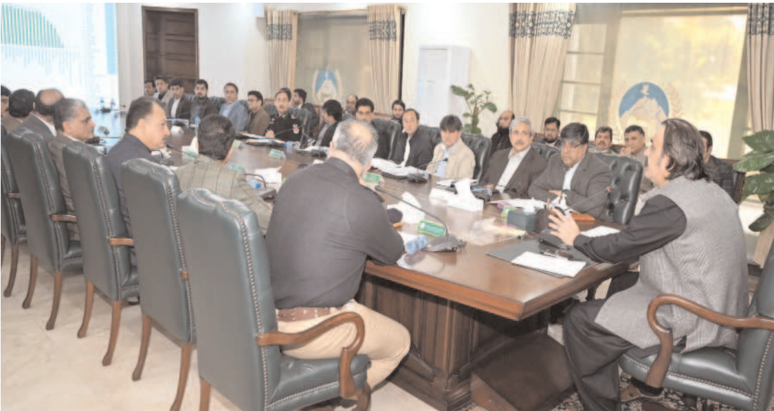
PESHAWAR: Chief Minister Khyber Pakhtunkhwa Ali Amin Khan Gandapur chairing a meeting regarding price control of essential commodities during holy month of Ramadan.

human life easier. Haji Ghulam Ali urged the youth to keep their access to modern sciences including engineering, technology and to deal with the challenges of the present era, there was a need for practical research in engineering, technology and other modern sciences. Modern research in all fields can lead to progress, he said adding that all educated youth, including the engineering department, were the bright future of the nation. The Governor Khyber Pakhtunkhwa, Haji Ghulam Ali said that our youth were not less capable in any field than the youth of other countries. At the end convocation, Haji Ghulam Ali also held a meeting with the students in joy and appreciated them for their academic success.