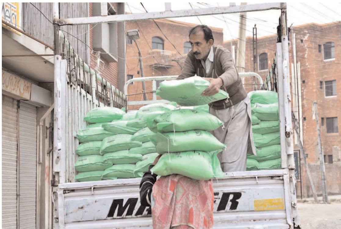
RAWALPINDI: Workers off-loading Prime Minister Ramadan Relief Package Flour Bags at a Utility Store on Eid Gah Road.