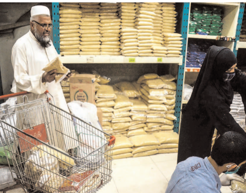
PESHAWAR: People buying grocery on ahead of Ramazan ul Mubarak.