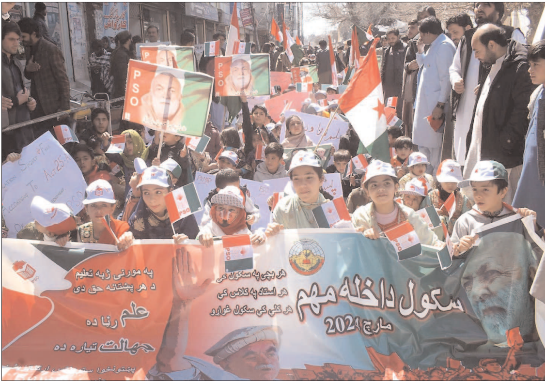
QUETTA: Activists of Pashtunkhwa Students Organization holding education rally.