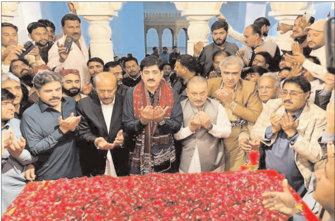
LARKANA: Sindh Chief Minister Syed Murad Ali Shah along with other PPP leaders offering fateha on the grave of Shaheed Zulfiqar Ali Bhutto.