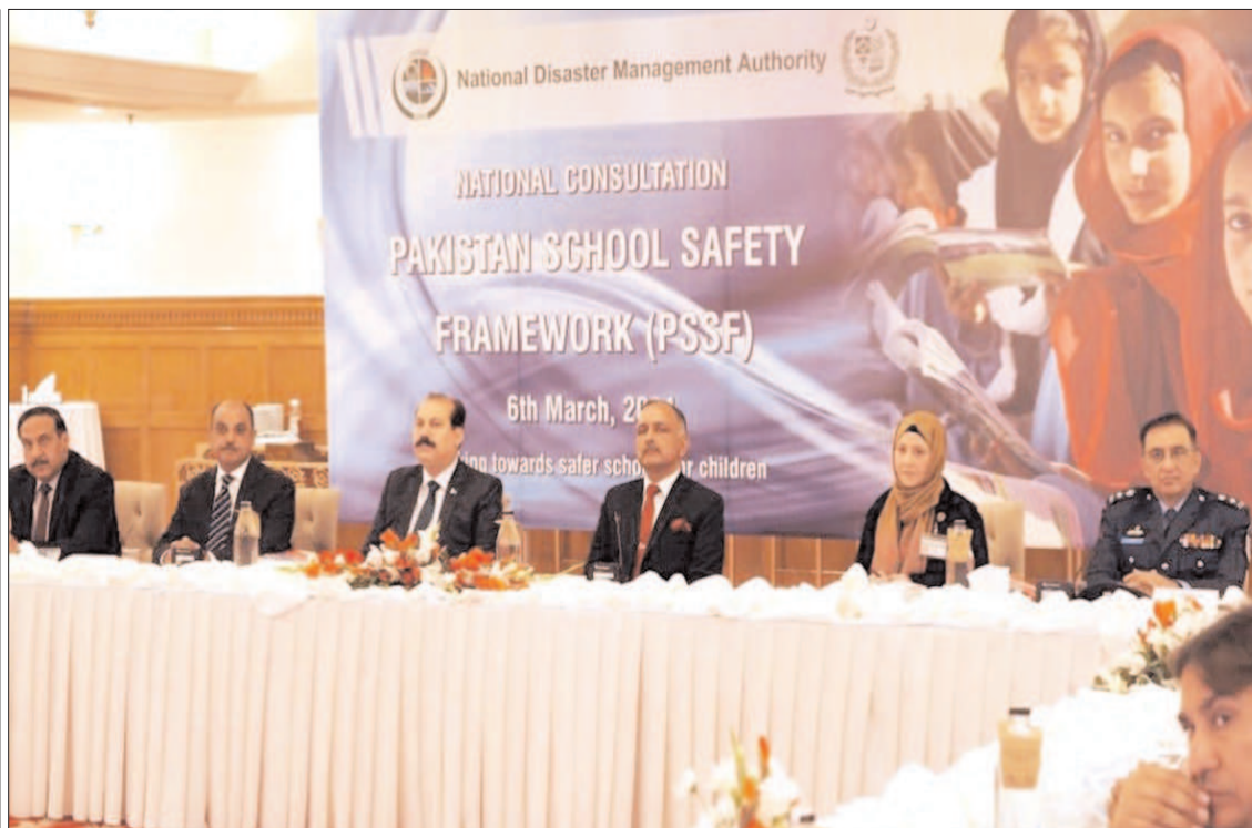
ISLAMABAD: NDMA holds consultation session on Pakistan School Safety Framework at a local hotel.