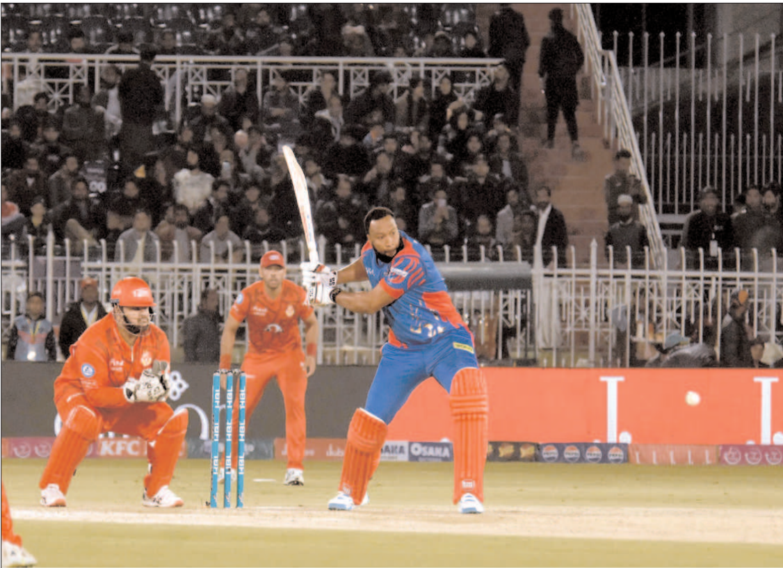
RAWALPINDI: Karachi Kings batter, Kieron Pollard plays shot during the Pakistan Super League (PSL) Twenty20 cricket match at the Rawalpindi Cricket Stadium.

India, led by Rohit Sharma, lost the opening Test but hit back to take an unbeatable 3-1 lead in the five-match series.