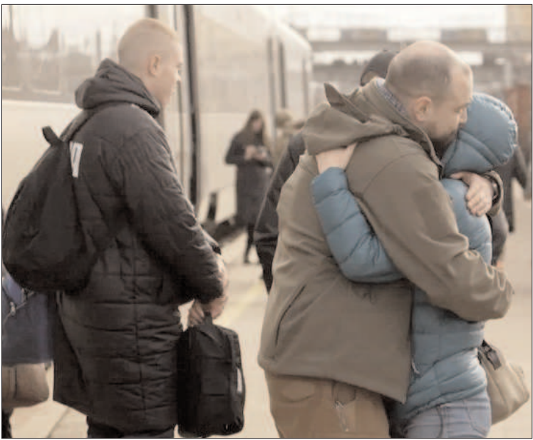
Horlivka, which it's controlled since 2014.

While the whole of Ukraine is a war zone, the Donetsk region - along with four others - is a battlefield. When you weave through its dense forest and expansive, rugged terrain, you always feel like you're approaching the coal face of this conflict. You can hear heavy fire from as far as 40 km away, so the distant sound of artillery is constant. From one vantage point you can see the erosion of Ukrainian territory. Plumes of smoke come from the directions of Avdiivka, a town Russia has recently taken, and