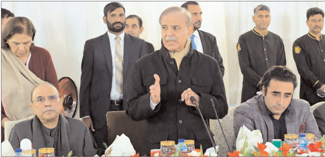
ISLAMABAD: Prime Minister Shehbaz Sharif addressing parliamentarians at a banquet.