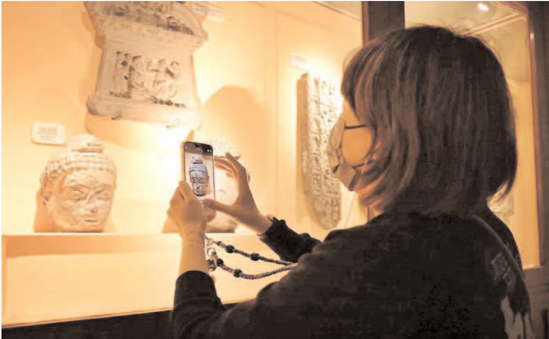
PESHAWAR: A tourist taking picture of a Budha statue her visit to Peshawar Museum.

The Speaker of the Assembly stated that the protection of workers' rights and providing maximum relief to the labor class in the current difficult situation are among their priorities.