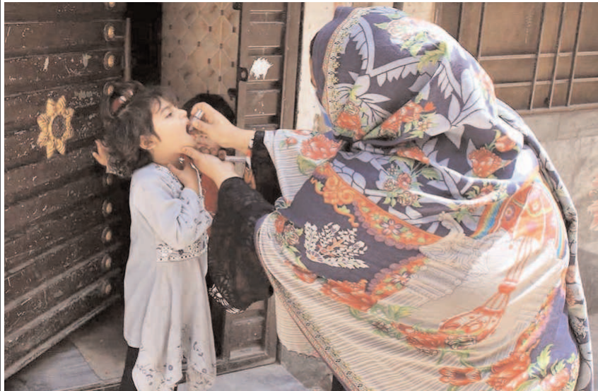
PESHAWAR: Lady Health Worker administering polio drops to a child during anti polio campaign at Dalazak Road.