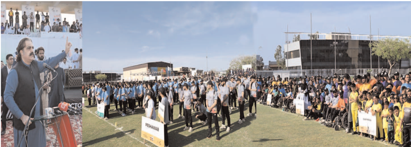
PESHAWAR: Khyber Pakhtunkhwa Chief Minister Sardar Ali Amin Gandapur addressing the inaugural ceremony of Inter-Madaris Games 2024.