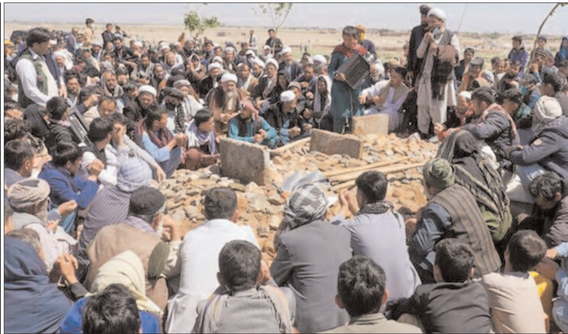
HERAT: Afghans mourning at a burial ceremony of slain Shias after gunmen attacked a mosque in Guzara district, Afghanistan.

He said the wheat procurement was yet to begin and the financial condition of the masses was pathetic. The former federal minister reiterated that the innocent people having no connection with crimes should be released from jails. He asked the National Accountability Bureau (NAB) to take notice of the wheat scandal immediately. He urged the government to review its policies as next two months would be crucial for the politics of Pakistan.