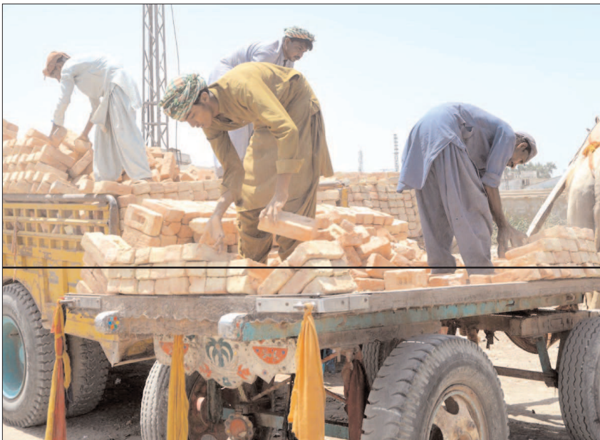
HYDERABAD: Labourer busy in work on the eve of International Labour Day.