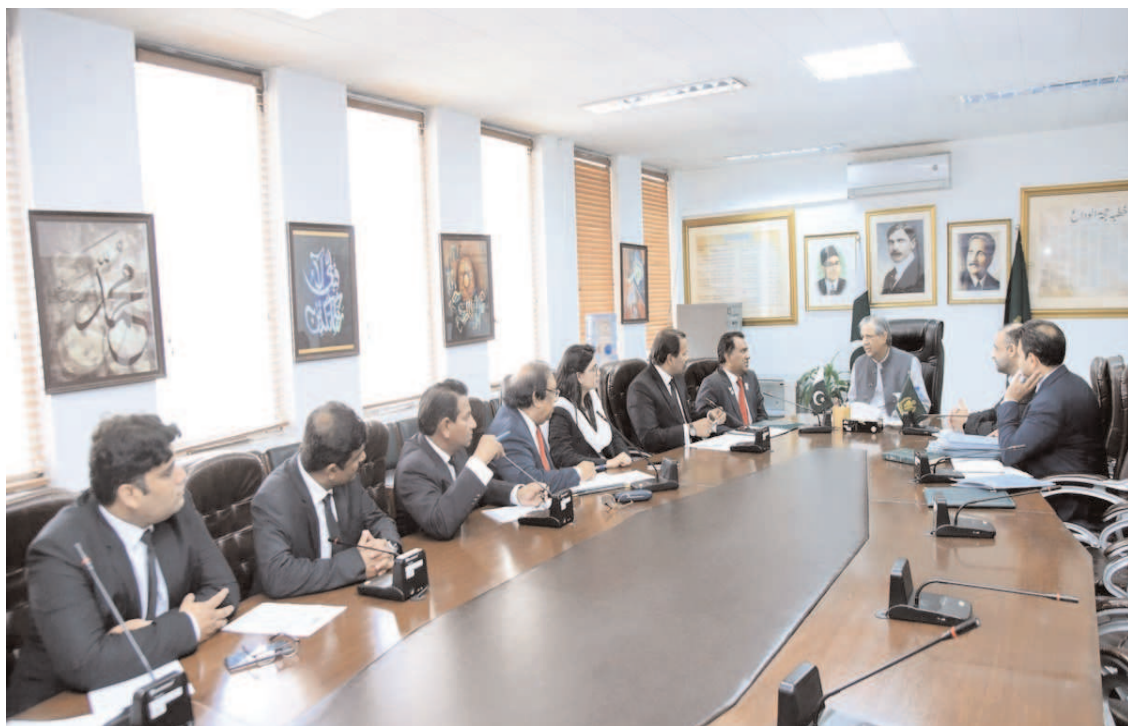
ISLAMABAD: A delegation from the Implementation Minority Rights Forum (IMRF) and the Christian Lawyers Association Pakistan had a meeting with Federal Minister for Law and Justice Senator Azam Nazeer Tarar.

Furthermore, the official said that the CDA places great importance on offering healthy pursuits to citizens, particularly youth, as a top institutional priority. While tirelessly striving to provide optimal citizen services, he said the authority is equally committed to fostering wholesome activities.