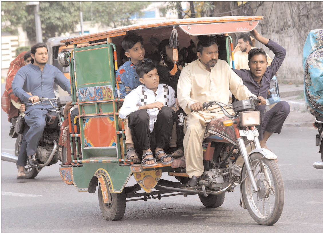
LAHORE: An over loaded motor rickshaw book by a family in risky way traveling on a busy road.

According to the data, 2022 motorbikes, 104 auto-rickshaws, 254 motorcars, 43 vans, 15 passenger buses, four trucks and 183 other types of auto vehicles and slow-moving carts were involved in these road traffic accidents.