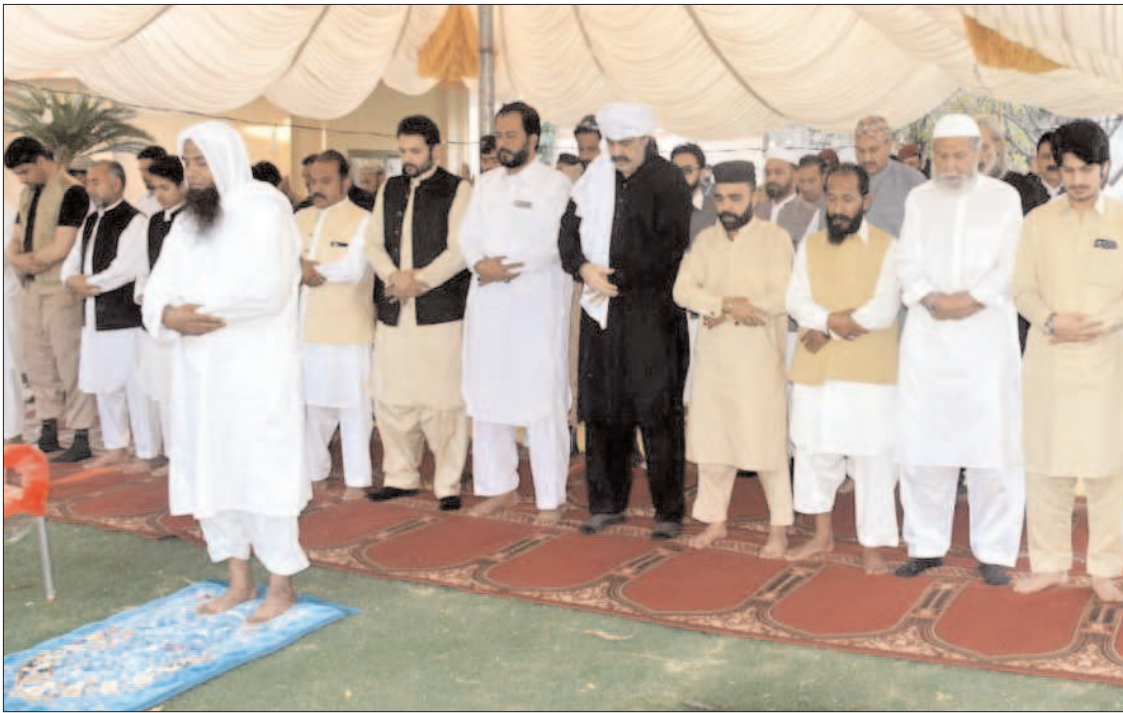
D I KHAN: Chief Minister of Khyber Pakhtunkhwa, Ali Amin Gandapur offering Eid prayer at his native town.

MALAKWAL: Over a dozen people were hospitalized when a swarm of honey bees attacked them in Punjab town of Malakwal. The victims were enjoying picnic on the second day of Eidul Fitr in Nawaz Sharif Park when bees targeted them. The injured with multiple bit marks were rushed to a hospital for treatment.