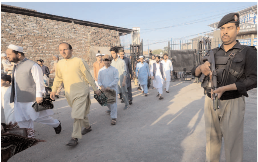
PESHAWAR: Policeman stand alert during Eid prayer in City.

Film expert Aijaz Gul said that screening of four Pashto films on the occasion of Eid-ul-Fitr is very positive news which will revive the ailing regional film industry through providing a spice of entertainment and a blend of emotions to the cinegoers.