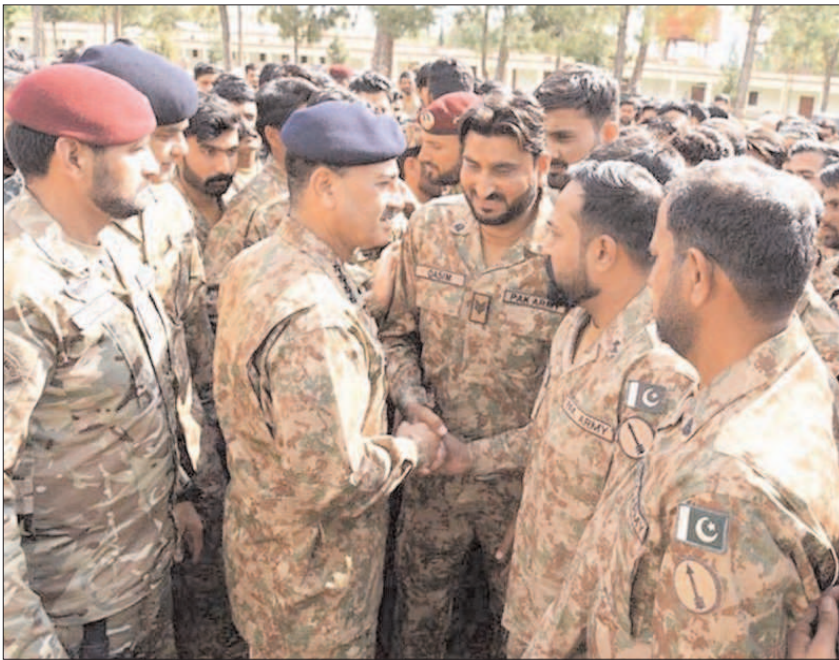
MIRAN SHAH: General Syed Asim Munir, NI (M), Chief of Army Staff conveying heartfelt Eidul Fitr greetings to the troops, commending their unwavering dedication and service to the nation.

Emphasizing the adverse impact of terrorism upon development, COAS underscored the collective imperative to safeguard the hard-earned peace. He urged all stakeholders, especially the local populace, to remain vigilant against adversarial elements seeking to destabilize the region. "Maintain unwavering focus on your professional duties in service to the nation," COAS concluded. Earlier, on arrival, COAS was warmly received by Commander Peshawar Corps.