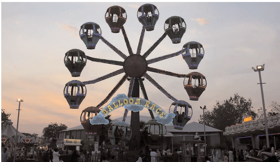
ISLAMABAD: People enjoying electric swing during Visiting at Lak View Park.