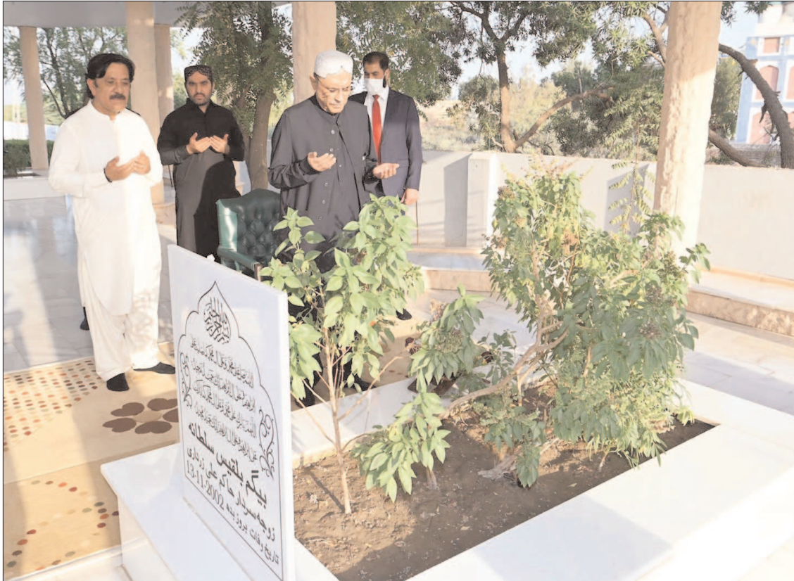
SHAHEED BENAZIRABAD: President Asif Ali Zardari offering fateha over the graves of his parents and relatives.