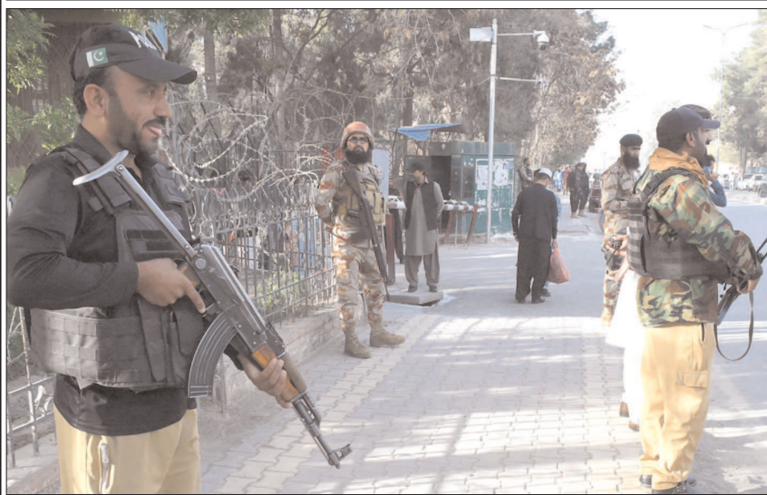
QUETTA: Security personnel standing alert to avoid any untoward incidents during Eid holidays.

dengue or dengue hemorrhagic fever (DHF). Worldwide, 100-400 million dengue infections occur annually. Out of them, 70% cases occur in Asian countries including Pakistan. DHF is a leading cause of death among children. No specific treatment (only symptomatic treatment) is available.