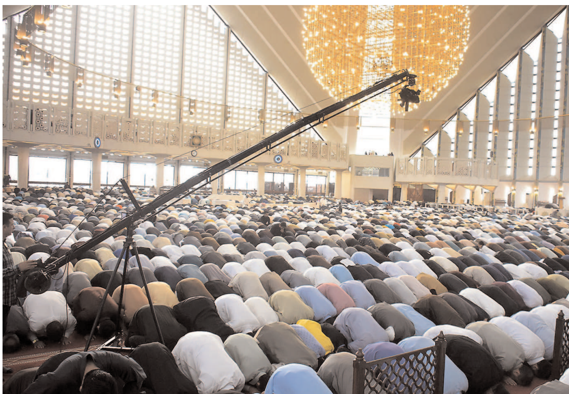
ISLAMABAD: People offering Eid ul Fitr Prayer at Faisal Mosque.

Four Eid holidays were announced by the government from Wednesday, April 10 to Saturday, April 13.