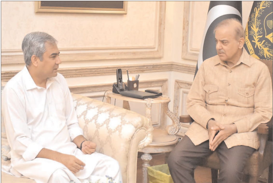
LAHORE: Federal Minister for Interior and Narcotics Control Syed Mohsin Raza Naqvi called on Prime Minister Muhammad Shehbaz Sharif.

Vol. XXXIXI No. 80 Regd. No. 241 SHAWWAL 04 1445 -- SATURDAY, APRIL 13 2024 PESHAWAR EDITION 12 PAGES PRICE. 30