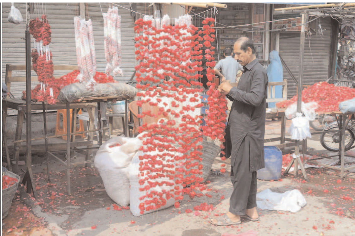
MULTAN: A vendor preparing flower garlands to attract customers at his roadside setup.

Dimming hopes for rate cuts continued to support the dollar, which surged to another 34-year high above 153 yen, putting Japanese officials in the spotlight after they said they were ready to intervene in markets to support their currency.