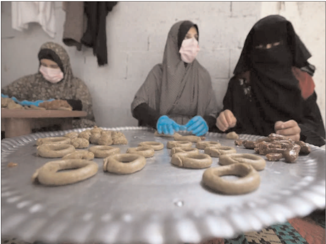
GAZA: Palestinian women volunteer in a charity initiative to prepare traditional cookies in Rafah.