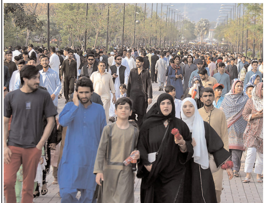
ISLAMABAD: People Visiting Lak View Park on 1st day of Eid ul Fitr.

Dr. Al-Issa's visit resonated deeply with the values of empathy and kindness, underscoring the importance of collective efforts in creating a brighter future for all.