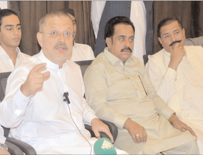
HYDERABAD: Sindh Information Minister, Sharjeel Inam Memon addressing a press conference.

Passenger buses and trucks are frequently crammed to capacity and seatbelts are not commonly worn, meaning high death tolls from single-vehicle accidents are common. According to the World Health Organisation estimates, more than 27,000 people were killed on Pakistan's roads in 2018. In January last year, 41 people were killed when their passenger bus, which was also loaded with containers of flammable oil, plunged into a ravine in Balochistan and burst into flames.