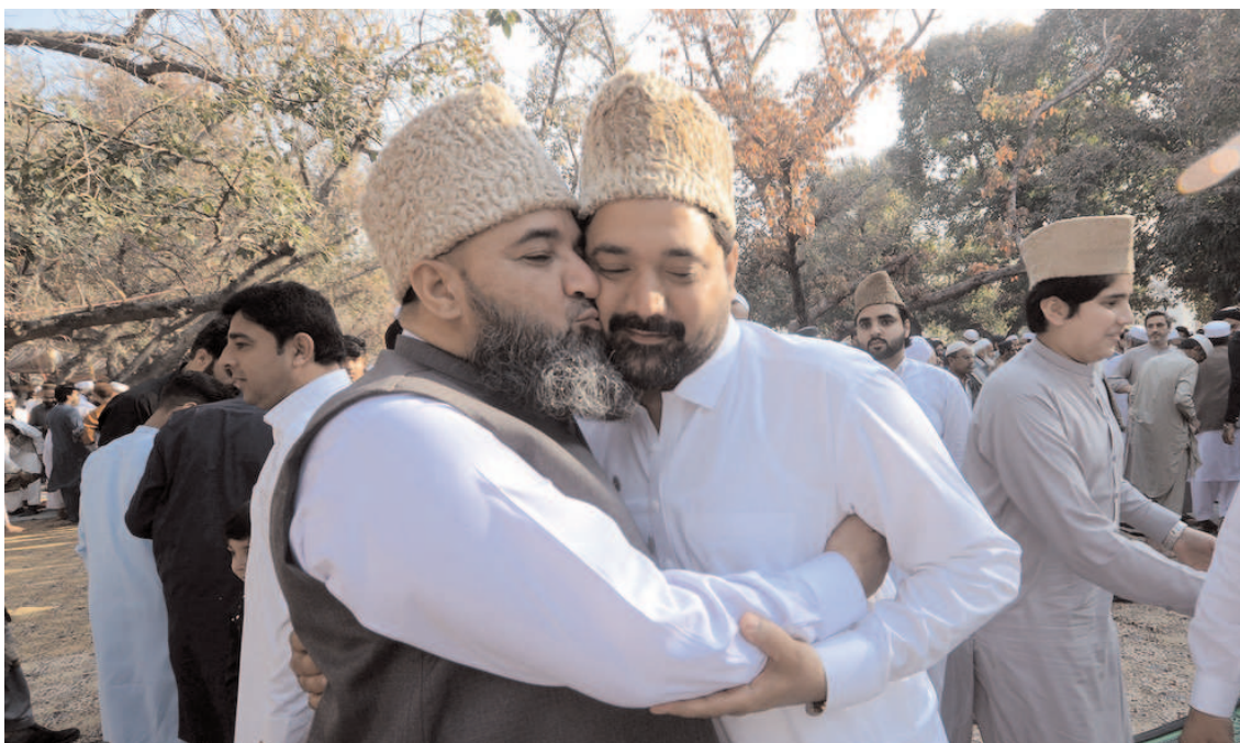
PESHAWAR: People exchanging Eid greetings to each other.

19 people died in various incidents while providing medical aid to 1499 people and transferring many people to hospital for further treatment.