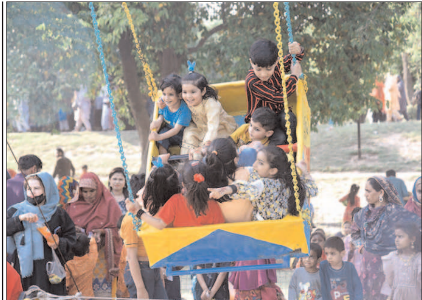
LAHORE: Children enjoy swings in Gulshan-e-Iqbal Park on the 2nd day of Eid-ul-Fitr celebrations.

The robbers fled to unknown destination after swift operation.