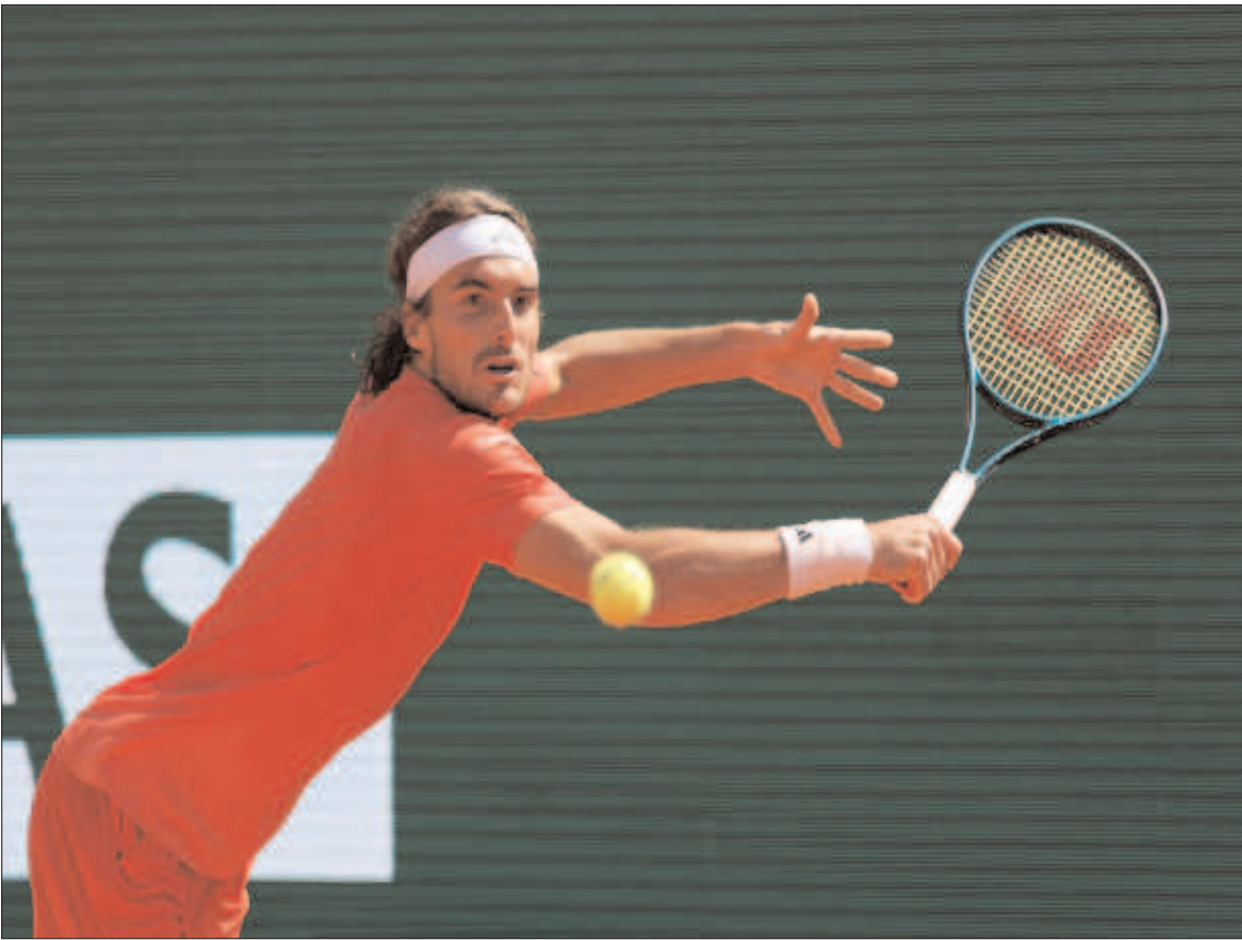
MONTE-CARLO: Stefanos Tsitsipas of Greece prepares for a backhand shot against Karen Kchachanov during the quarter-final match on day six of the Rolex Monte-Carlo Masters.

serve at 1-1 in the second set -- but he saved a break point and then held. However, it was a very unhappy Khachanov who returned to his chair at the next change over as a series of errors gave his Greek rival the break at 3-2. The 27-year-old Russian flung his racket angrily to the ground as he took his seat. Tsitsipas did not ease up winning 11 points in a row to surge to a 5-2 lead and served out easily for a place in the last eight. He admitted the tournament brought out the best in him though it is yet to lead to him winning the big one on clay, The French Open. "I would lie if I said it did not bring out the best in me," he said grinning. "There are many good memories and stepping out here and coming back here it revives those good memories. "It brings me alive."