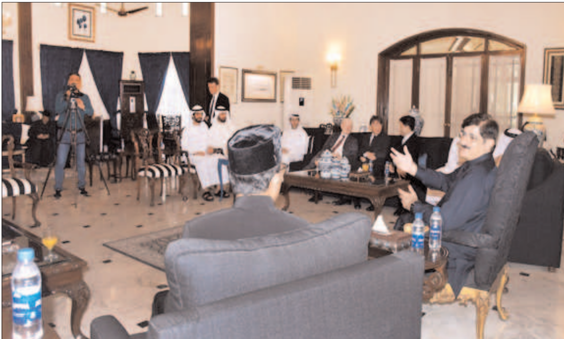
KARACHI: Sindh Chief Minister Syed Murad Ali Shah meets with Consul Generals of different countries to exchange Eid greetings at CM House.