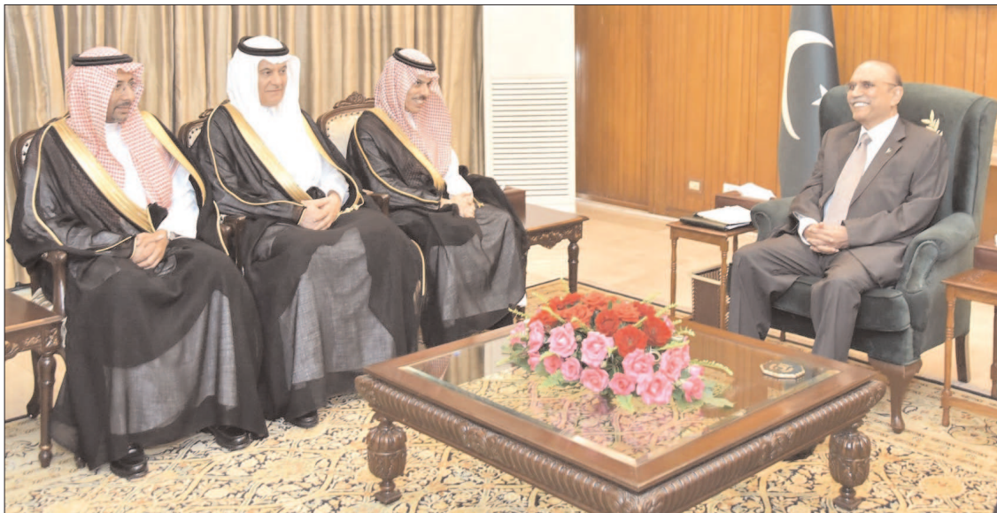
ISLAMABAD: Foreign Minister of Saudi Arabia, Prince Faisal bin Farhan al-Saud, along with his high level delegation, called on President Asif Ali Zardari, at Aiwan-e-Sadr.