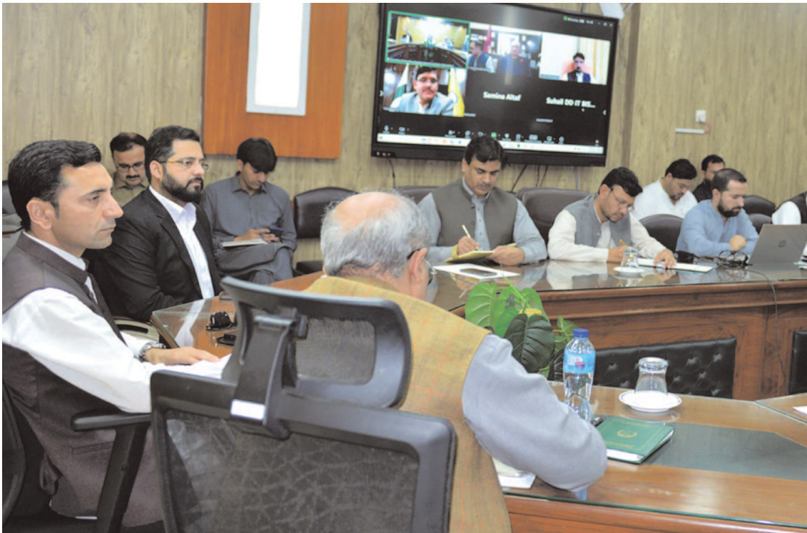
PESHAWAR: Minister for Education Faisal Khan Tarakai chairing meeting of the heads of educational boards.