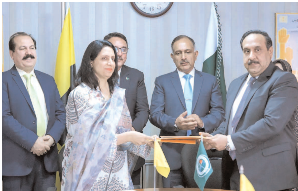
ISLAMABAD: NDMA & IRC representatives exchanging documents after signing LoU for Cooperation on Disaster Resilience & Preparedness at IRC Headquarters.