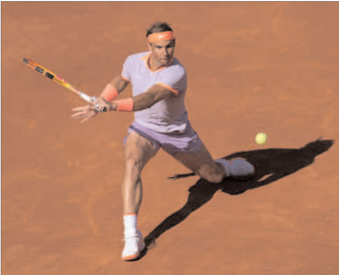
BARCELONA: Rafael Nadal of Spain in action against Flavio Cobolli of Italy during Second Round of Barcelona Open Banc Sabadell 2024 at Real Club De Tennis Barcelona.

NEW DELHI (Agencies): Australia all-rounder Glenn Maxwell has opted to take an indefinite mental and physical health break during the Indian Premier League. Maxwell, 35, only scored 32 runs in Royal Challengers Bengaluru's first six games and asked the management to be left out of Monday's 25-run defeat by Sunrisers Hyderabad. He also took a break to protect to his mental health in 2019. "For me, personally, it was a pretty easy decision," said Maxwell. "I went to [captain] Faf du Plessis and the coaches after the last game and said I felt it was probably time we tried someone else. 'I have been in this situation in the past where you can keep playing and get yourself deeper into a hole.' Maxwell, who has taken four wickets this season, came into the tournament in good form with the bat, averaging 42.26 in 17 T20s since November at a strike-rate of 185.85. He scored the fastest century in 50-over World Cup history against the Netherlands and then made a maiden double century against Afghanistan as Australia went on to win their sixth title.