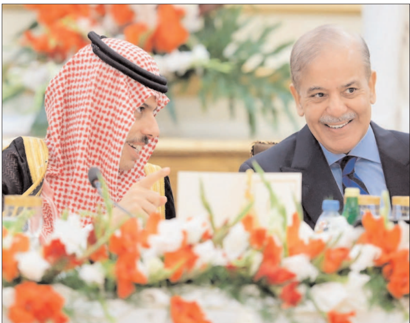
ISLAMABAD: Prime Minister, Shehbaz Sharif hosted a banquet in honour of Foreign Minister of Saudi Arabia, Prince Faisal bin Farhan al-Saud.