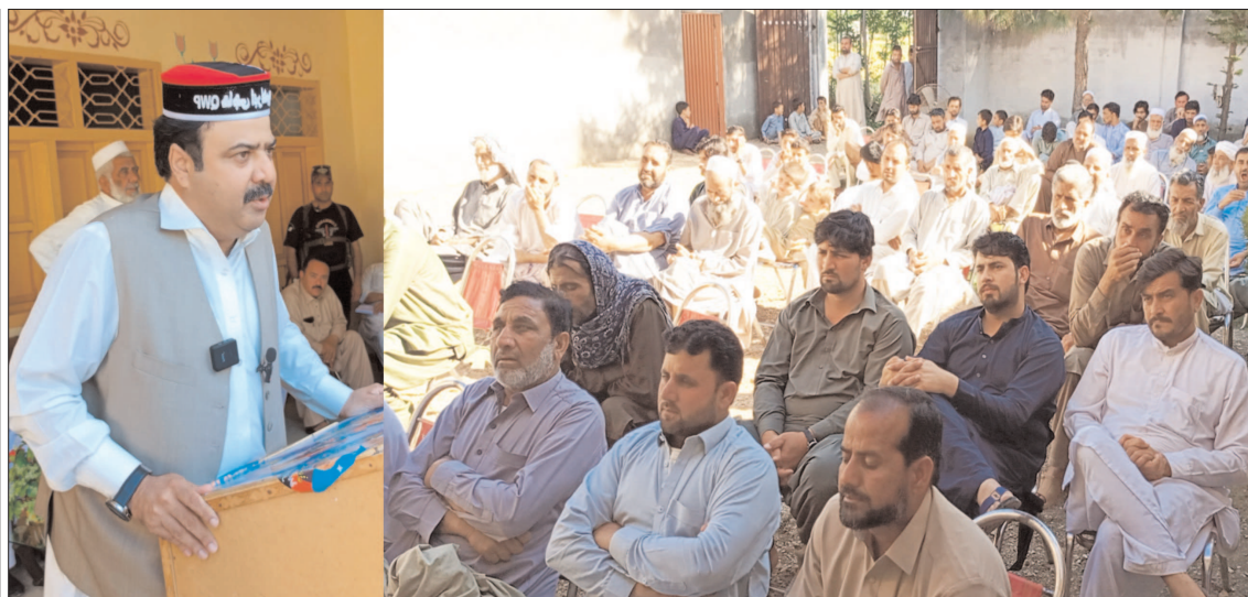
CHARSADDA: Provincial president of Qaumi Watan Party, Sikandar Hayat Khan Sherpao addressing party workers at UC Gandheray.

The 18th Amendment led to the increase in fiscal allocation to provinces' share in the NFC Award on the basis of population. Some experts opine that it needs to be revisited by laying emphasis on other indicators like women empowerment and their contribution to generate financial revenue. Moreover, focus should be to impart skills to the population to make them productive in and out of the country.