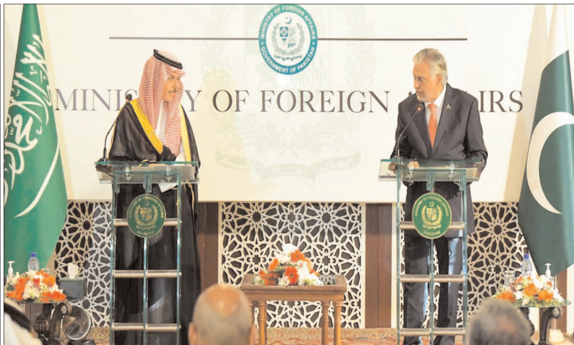
ISLAMABAD: Foreign Minister, Ishaq Dar and Foreign Minister of Saudi Arabia, Prince Faisal bin Farhan al-Saud holding a joint press conference.

Two more children identified as Nasinullah 10 and Aleema Bibi 12 were killed while three others were injured when roof of a house owned by one Nazir collapsed due to torrential rains at the Sakhawono village of Asbanr here on Monday night, residents said.