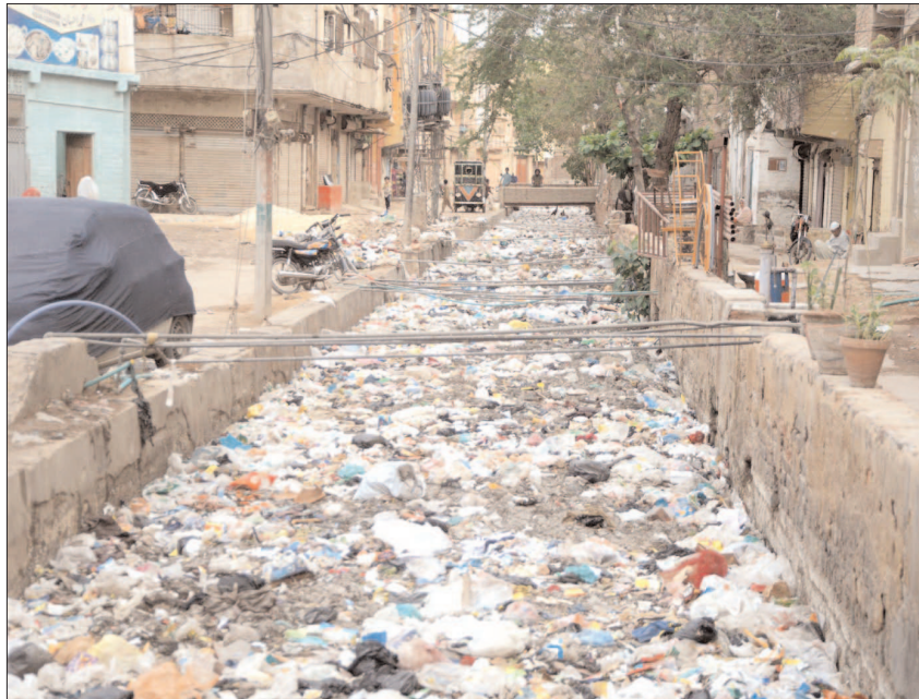
HYDERABAD: Main drain of city filled with garbage showing apathy of civic bodies.