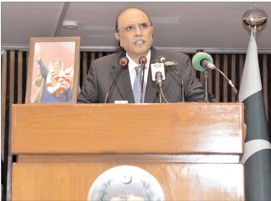
ISLAMABAD: President Asif Ali Zardari addressing the joint session of Parliament.