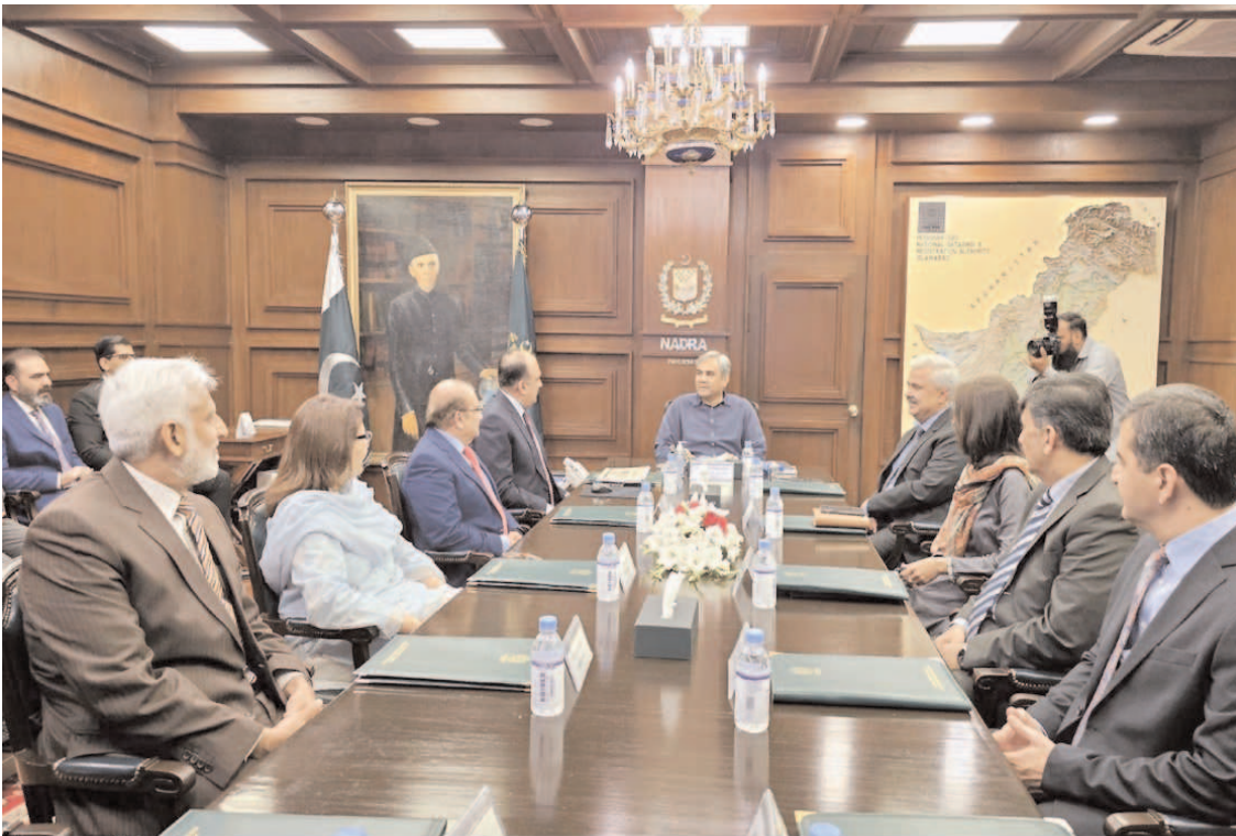
ISLAMABAD: Interior Minister Mohsin Naqvi chairing a meeting at NADRA Headquarters.

ISLAMABAD (APP): Indus River System Authority (IRSA) on Thursday released 182,100 cusecs water from various rim stations with inflow of 263,800 cusecs. According to the data released by IRSA, water level in River Indus at Tarbela Dam was 1431.38 feet and was 33.38 feet higher than its dead level of 1,398 feet. Water inflow and outflow in the dam was recorded as 43,500 cusecs and 5,000 cusecs respectively. The water level in River Jhelum at Mangla Dam was 1122.70 feet, which was 72.70 feet higher than its dead level of 1,050 feet. The inflow and outflow of water was recorded 58,200 cusecs and 15,000 cusecs respectively. The release of water at Kalabagh, Taunsa, Guddu and Sukkur was recorded as 108,300, 74,500, 35,300 and 7,800 cusecs respectively.