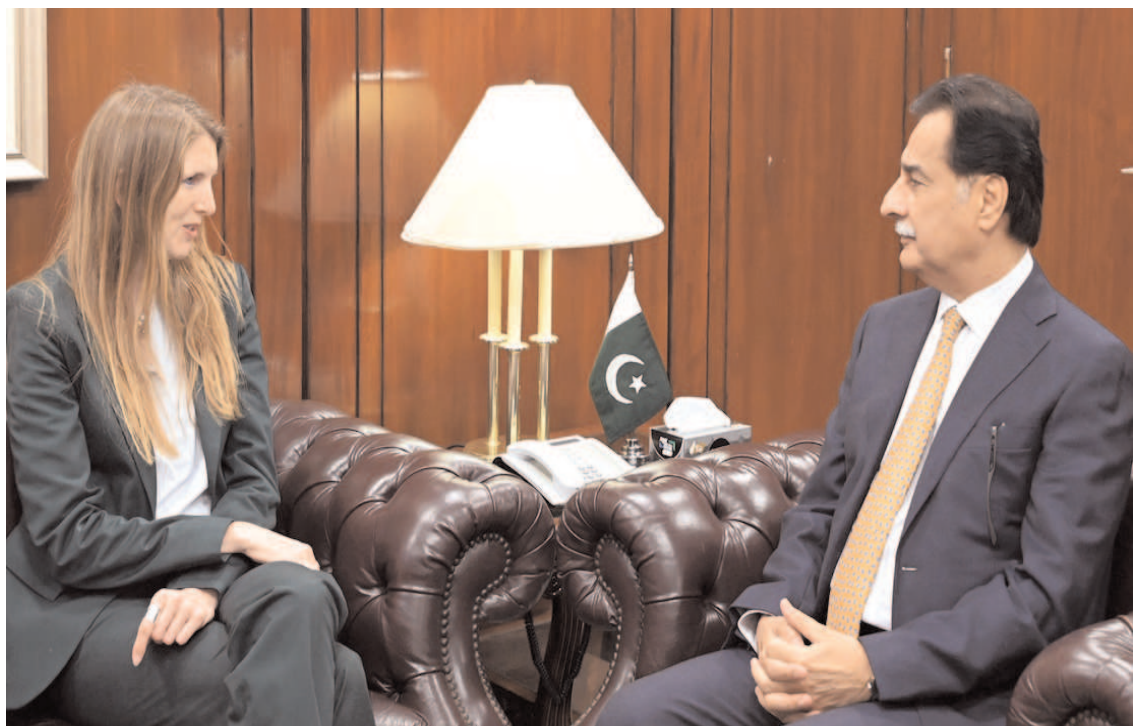
ISLAMABAD: British High Commissioner Ms. Jane Marriot called on Speaker National Assembly Sardar Ayaz Sadiq at Parliament House.

The Federal Minister welcomed the initiative from the British Council and expressed a deep desire to enhance collaboration between the British Council and Pakistan, especially concerning increasing educational outreach programmes for slums in the metropolitan cities of the country.