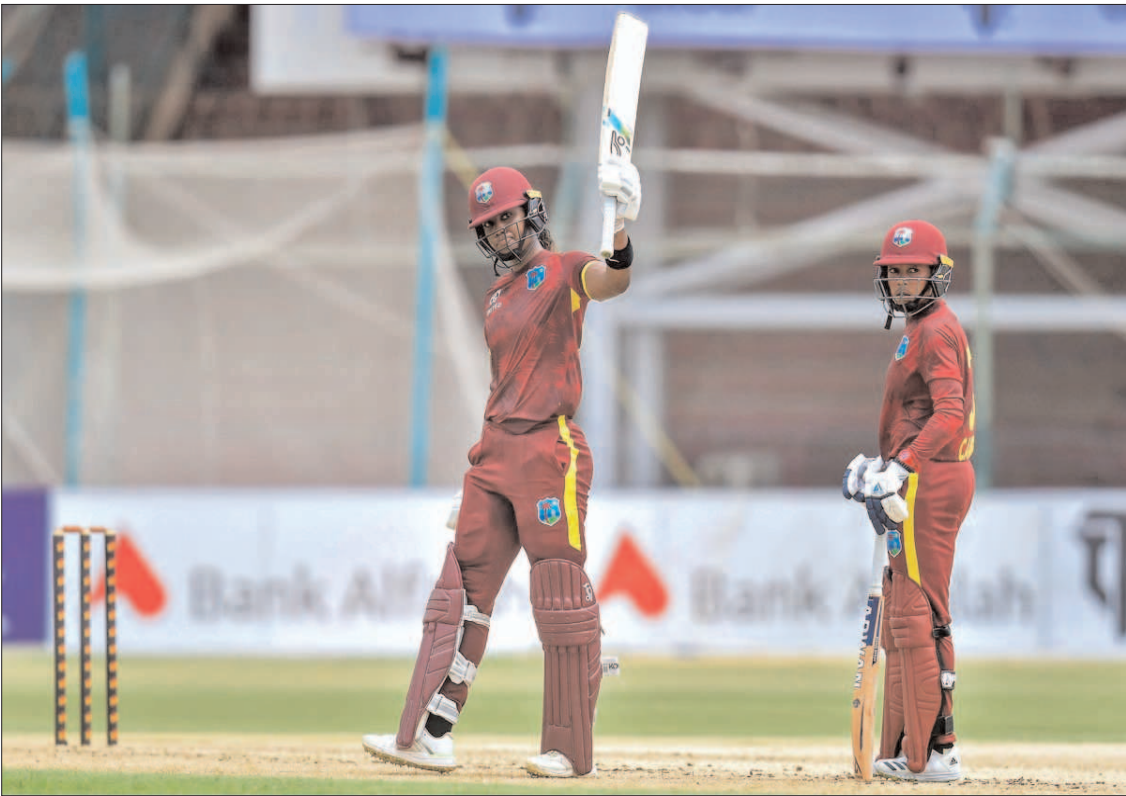
KARACHI: West Indies batter celebrates her century score during First ODI cricket match playing between Pakistan Women's Cricket team and West Indies Women's cricket team at National Bank Stadium.

press conference but pausing often to choose the right words, Momota said he had no regrets about retiring from top-level badminton. "There was a lot of hardship and it wore me down, but I didn't want to blame the tough times on the accident," he added. "I wanted to bounce back from it and that attitude along with the support of people around me at least allowed me to get a foothold." Viktor Axelsen, who supplanted Momota as the best men's player in the world, said "it has been an absolute pleasure sharing the court with you." "I feel lucky to have been able to compete with a player of your calibre," the reigning number one wrote on X. Momota had targeted this summer's Paris Olympics but his national ranking was not good enough to earn him a spot in Japan's team.