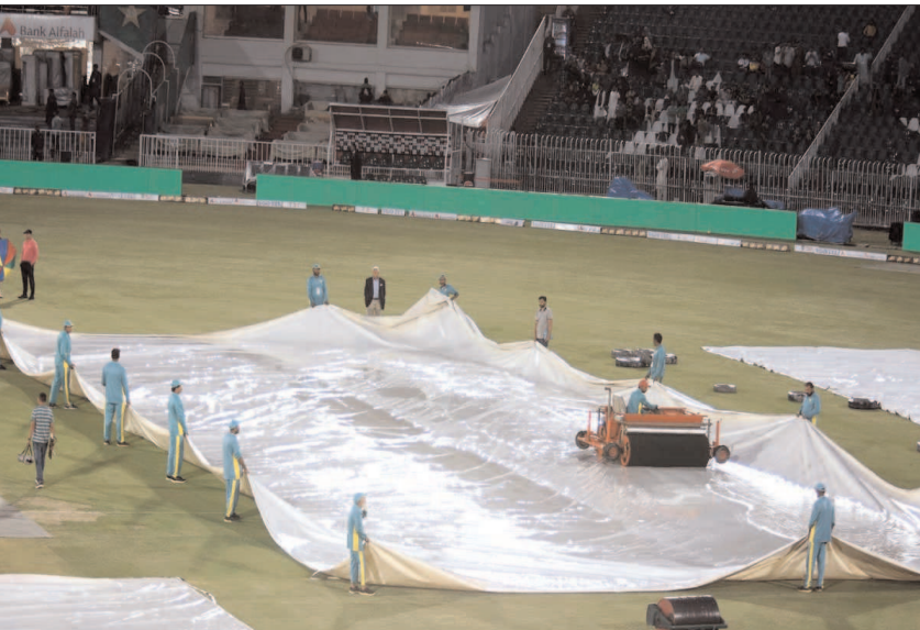
RAWALPINDI: Ground workers struggling to dry the pitch as rain interrupts first T20 Cricket match between Pakistan and New Zealand at Pindi Cricket Stadium.

et administrators have previously responded to by saying the call of resuming bilateral ties with Pakistan was subject to permission from Indian government. "Yeah, I would love to," Rohit said responding to Vaughan's query on whether as India Test captain he would want to play regularly against Pakistan outside of ICC tournaments. "At the end of the day, we want to be in contest and I think it will be a great contest between the two sides. We anyway play them in ICC trophies, so it doesn't really matter. It's just pure cricket that I'm looking at. I'm not interested in anything else. It's pure cricket, game between bat and ball. It'll be a great contest."