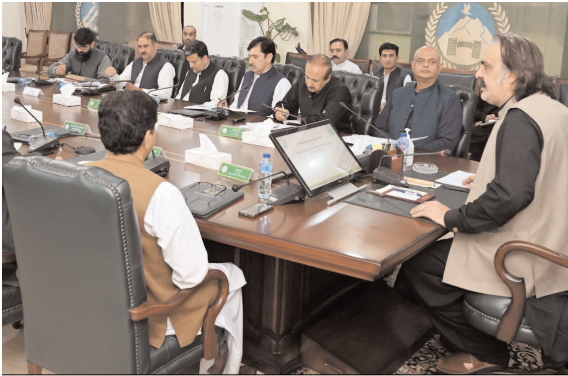
PESHAWAR: Khyber Pakhtunkhwa Chief Minister Ali Amin Gandapur chairing a meeting of food department.

Pakhtunkhwa wherein about 893,000 registered students would appear. According to education department, 422,000 female students and 471,000 male students had submitted their documents for SSC final exam. As many as 3,528 examination halls had been established across KP while 23,996 invigilator would perform exam duty. Chairman Peshawar Board Professor Nasrullah Yousafzai said that 178,335 students would appear in the exam under Peshawar Education Board, adding 61,879 female students were among the students. He said all the examination halls were equipped with hidden cameras for strict monitoring of the examination.