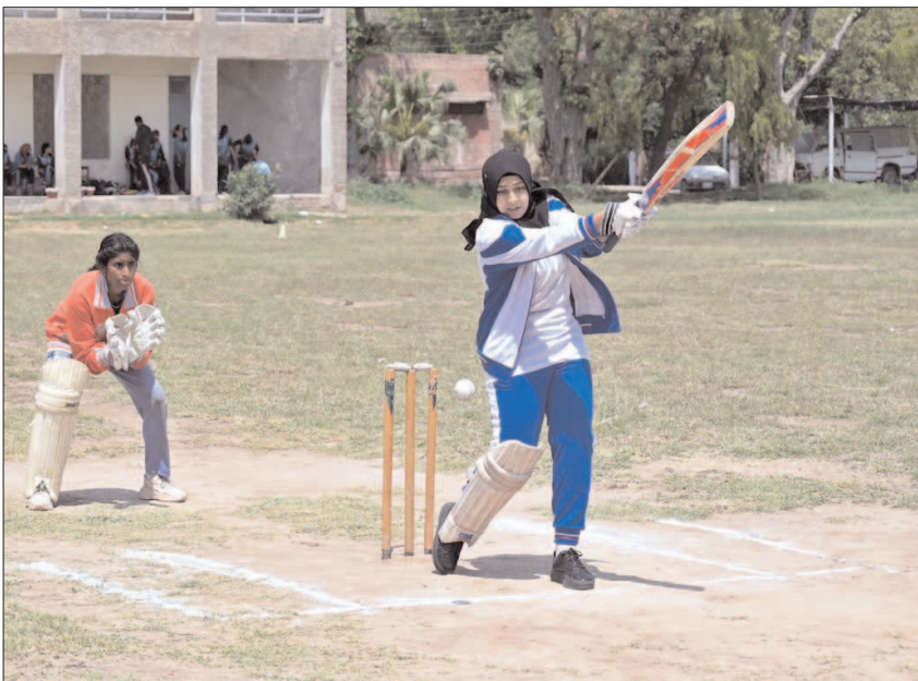
SARGODHA: A view of cricket match played between Government Women College Farooq Colony and Iqra Girls College teams during Inter Girls Collegiate Cricket Tournament organized by Education Board Sargodha.

"I know it is a very big task for us," Athapaththu said. "Every team is really good and every game is really important for us. We will focus on one game at a time."