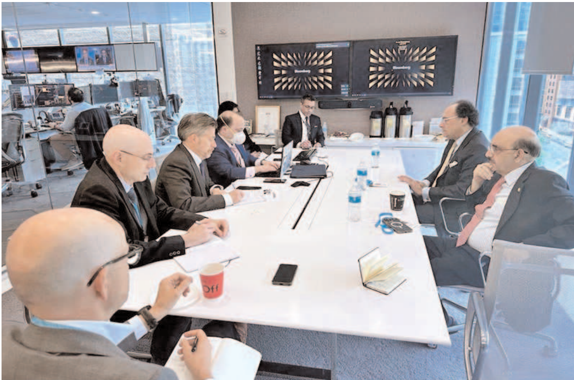
WASHINGTON: Finance Minister Muhammad Aurangzeb in a Round Table Meeting with Bloomberg.