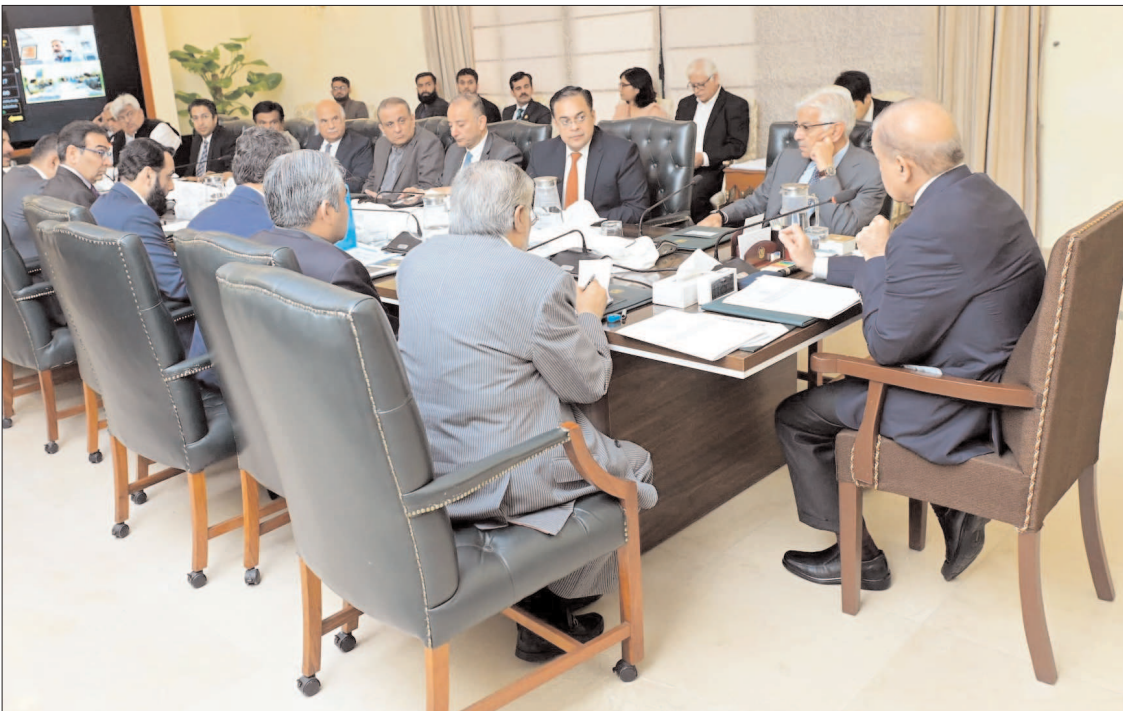
ISLAMABAD: Prime Minister Shehbaz Sharif chairing a meeting regarding power sector.

stated. "When you don't provide electricity, people will not pay the bill." The petitioner, facing immense difficulties due to the prolonged power outage, expressed his desperation and even mentioned feeling suicidal. PHC directed PESCO for submission a report on the matter by the next hearing, scheduled for 30th April.