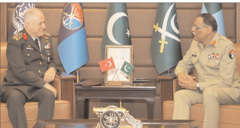
RAWALPINDI: General Metin Gürak, Chief of Turkish General Staff called on General Sahir Shamshad Mirza, Chairman Joint Chiefs of Staff Committee, at Joint Staff Headquarters.

He said Pakistan was strategically located at the crossroads of the world which was a source of pride for the nation. He said that the Government of Pakistan as a policy encouraged innovation and investment in the country which this summit was offering precisely - a collaboration between public and private sector. He said that the federal cabinet meeting on Wednesday had approved a public private partnership policy framework to eventually facilitate investment in the country.