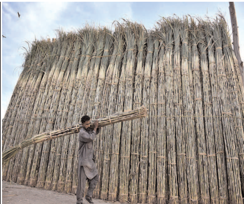
LAHORE: Labourer shifting bundle of sugarcane for supply at the bank of River Ravi near the Vegetable Market in Provincial Capital.