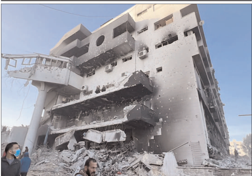
GAZA: Palestinians gathered around the burned and destroyed al-Shifa Hospital after Israeli forces withdrew.

The insurgent groups, BLA, BLF, BRAS and SRA claimed responsibility for 18 attacks (three times more than the claims of the militant groups) this quarter causing 42 fatalities and 40 injuries. The prime targets of the insurgent groups were the security and government installations including Gwadar Port Complex, Mach Jail and Turbat Naval Base.