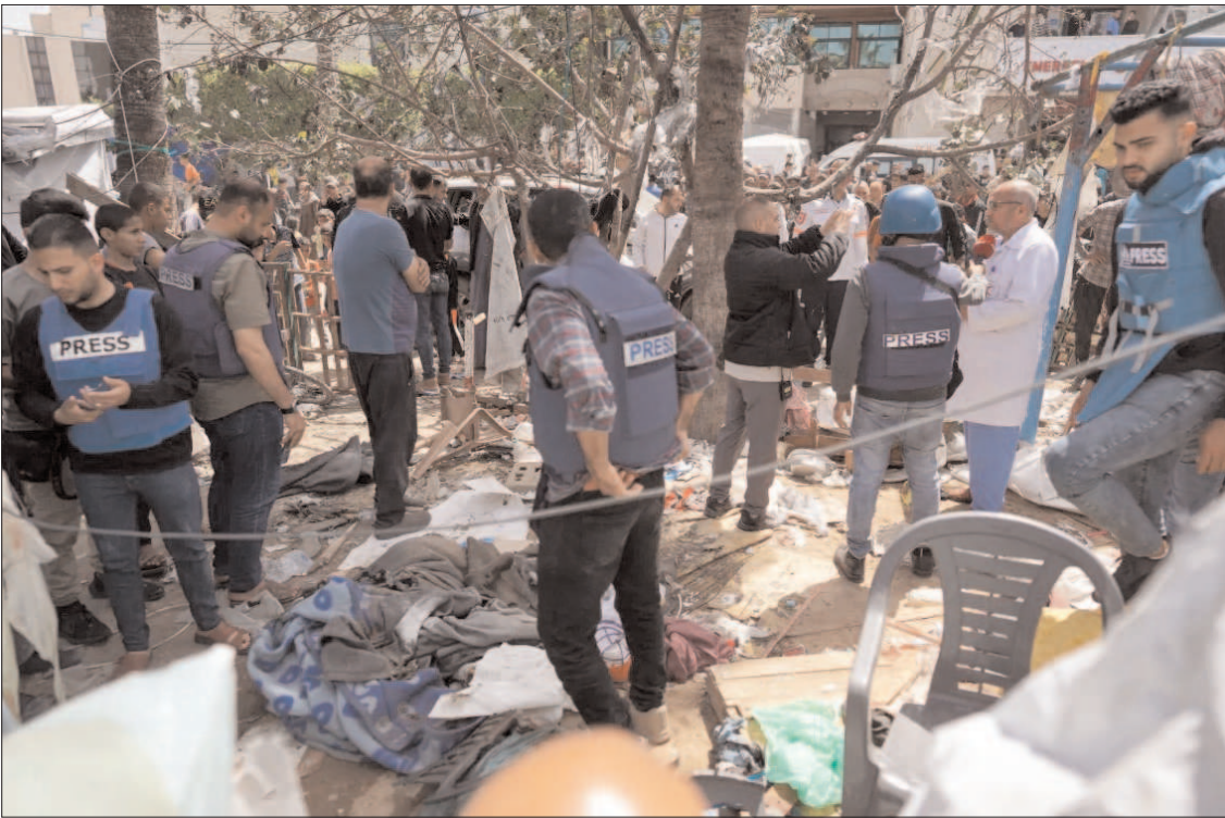
GAZA STRIP: Palestinians and local members of the media checking the damage at a makeshift camp for displaced people in front of the Al-Aqsa Martyrs Hospital in Deir el-Balah, after it was hit by Israel bombardment.

The government has ordered a review of the approval system for health products in response to the supplement-related illnesses. A report is due in May. A Chinese consumers association urged consumers to stop usage, saying it was concerned about the risk of Kobayashi products, state media reported. — Aljazeera