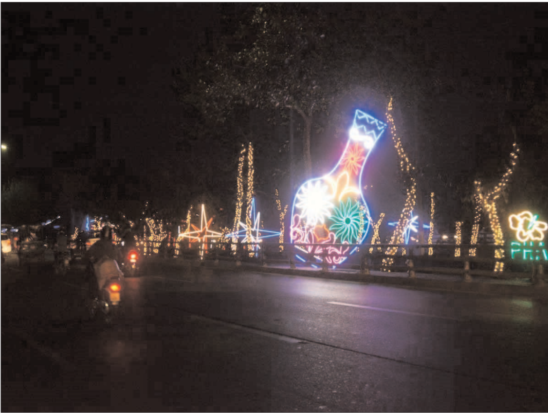
LAHORE: A beautifully decorated view of Canal Road at night.