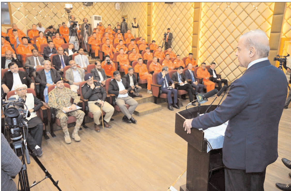
DASU: Prime Minister Shehbaz Sharif addressing Chinese engineers and government officials at Kass camp of China Gezhouba Group Company.