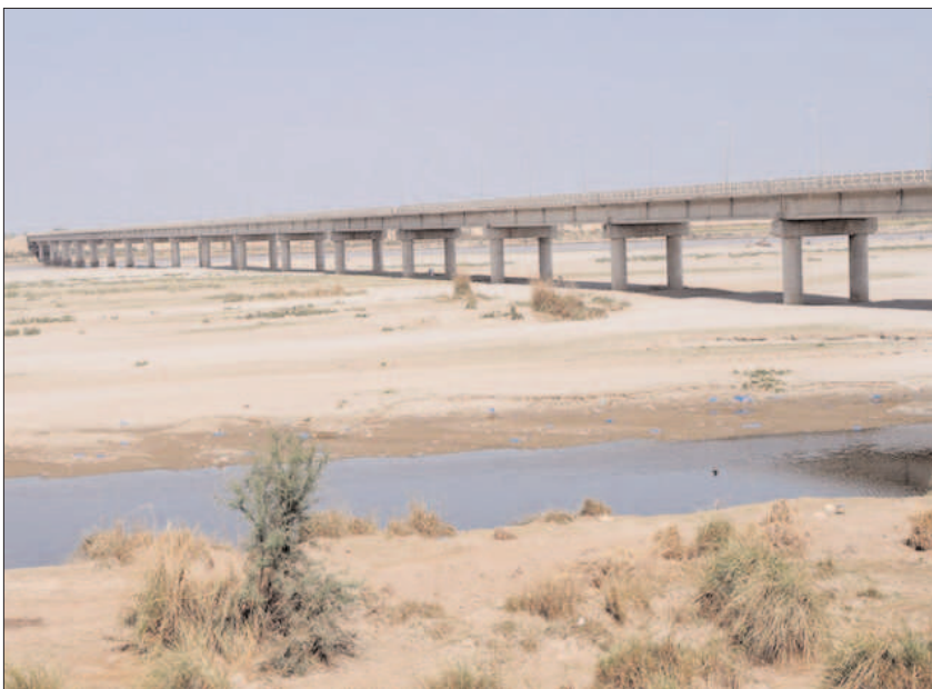
MULTAN: A view of dry bed of Chenab River at Head Muhammad Wala.

The local police told the media that the crude hut-like houses of workers, laborers, and farmers caught fire.