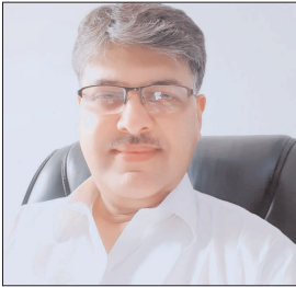
Often when you think you're at the end of something, you're at the beginning of something else." — Fred Rogers