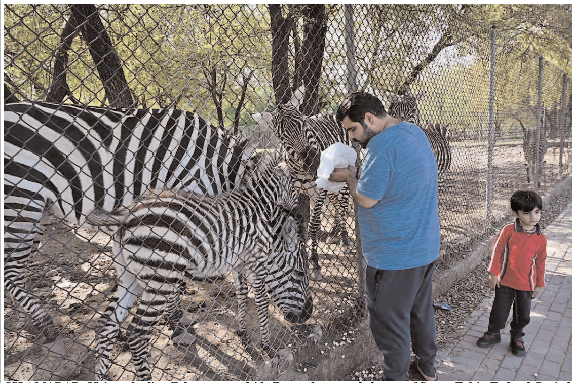
ISLAMABAD: Visitors feeding Zebras on roadside Zoo at the green belt area of Sector F-8 in Federal Capital.

He advised the eye patients to use eye drops provisionally to treat severe chronic ocular allergies while prolonged use of these drops can lead to negative effects.