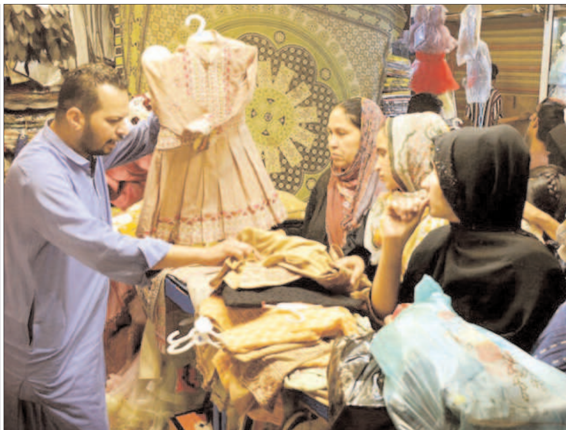
HYDERABAD: Women busy in Eid shopping at Resham Bazaar during upcoming Eidul Fitr celebrations.