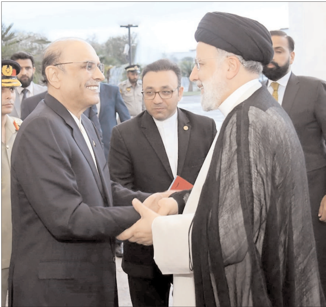
ISLAMABAD: President Asif Ali Zardari welcoming Iranian President Dr. Seyed Ebrahim Raisi upon his arrival at Aiwan-e-Sadr.

An important meeting of the National Action Plan Implementation Review Committee was held at NACTA headquarters here on Friday under the chairmanship of the Interior Minister which was attended by Interior Secretary, Head NACTA, DG FIA, Punjab, Sindh, KP, Balochistan, Azad Kashmir and Gilgit-Baltistan.