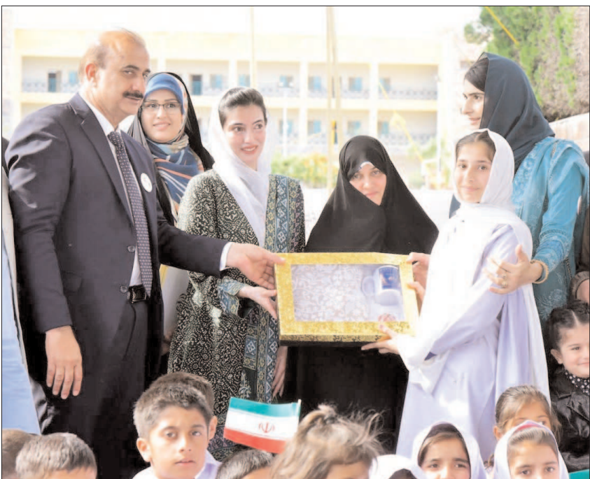
ISLAMABAD: Dr. Jamileh Alamolhoda, wife of Iranian President paid a visit to Pakistan Sweet Home, MNA Aseefa Bhutto Zardari also present.

Visiting Sikh pilgrims from India have expressed gratitude to Pakistan for providing the best security, accommodation and medical facilities during their ten-day pilgrimage. Sikh pilgrims said that they got respect and love and Pakistanis have won their hearts. Sikh pilgrims said their Gurdwaras are beautifully decorated and Sikh community living in Pakistan is enjoying all rights. They will leave for India via Wagah border tomorrow.