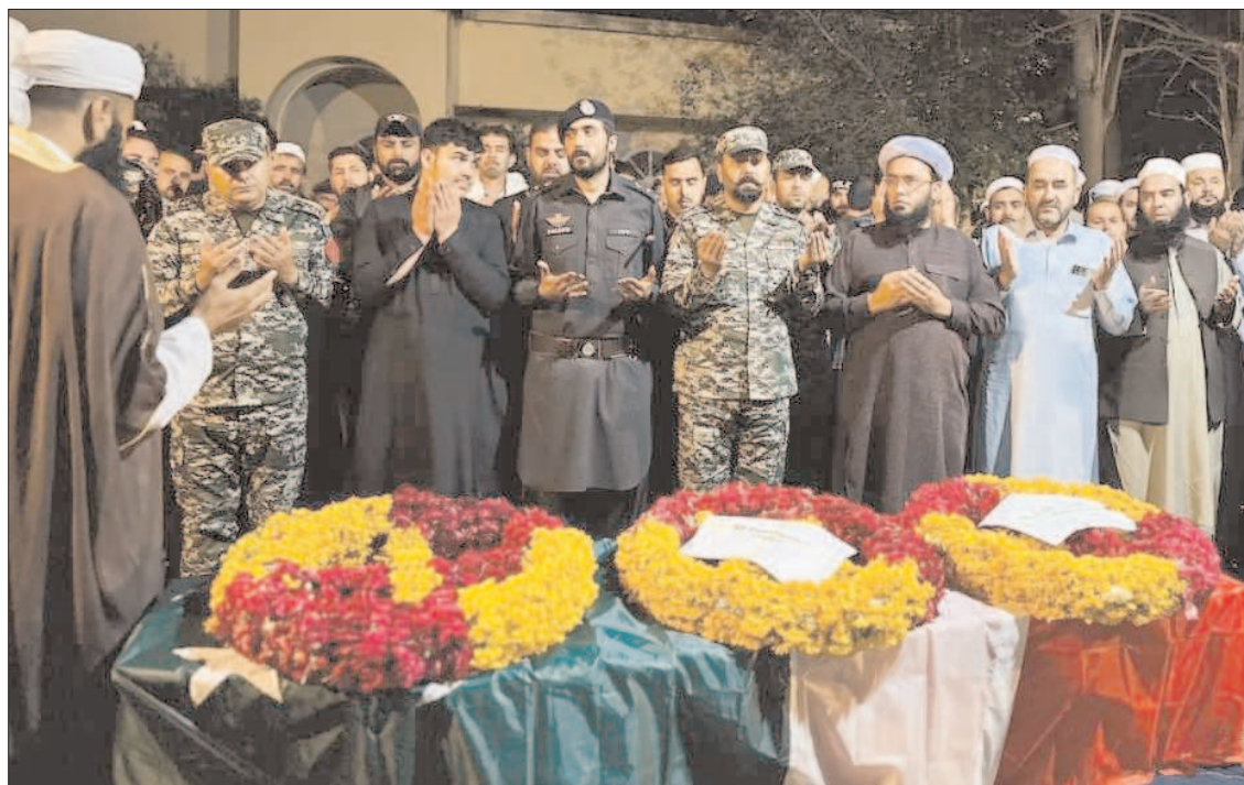
LANDI KOTAL: Civil and military officials offering dua after funeral prayers of Shaheed constable.