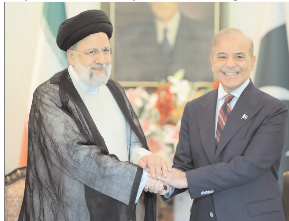
ISLAMABAD: Prime Minister Shehbaz Sharif shaking hands with Iranian President Dr. Eseyed Ebrahim Raisi prior to a meeting.

Pakistan relations across various sectors, underscoring the significance of fostering stronger ties between the two nations. Key areas of discussion included strategies to augment trade volumes and bolster communication networks, reflecting a shared commitment to advancing economic collaboration. Prime Minister Shehbaz Sharif highlighted the historical significance of President Raisi's visit, marking it as the first head of state visit to Pakistan following the February 2024 general elections, a gesture warmly embraced by the Pakistani nation.