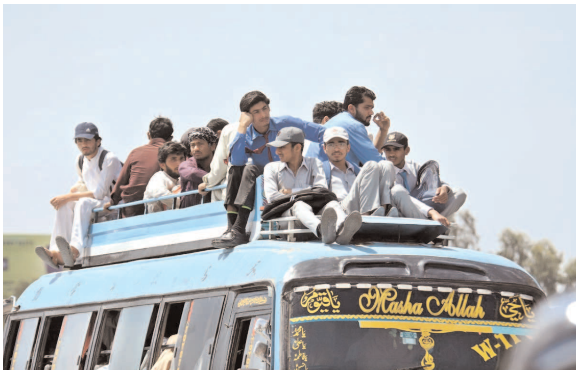
ISLAMABAD: People travelling on the top of a passenger bus at Khanna Pul may cause any mishap and needs the attention of concerned authorities.

To a query, he said District administration caught minor beggars and handed over to shelter homes and Edhi centers but later they gave affidavit or fine to authorities and went Scot-free. On the directions of Deputy Commissioner Islamabad, he said that crack down against the professional begging would be continued by the ICT administration in the Federal Capital till the elimination of alms-seekers from our society.