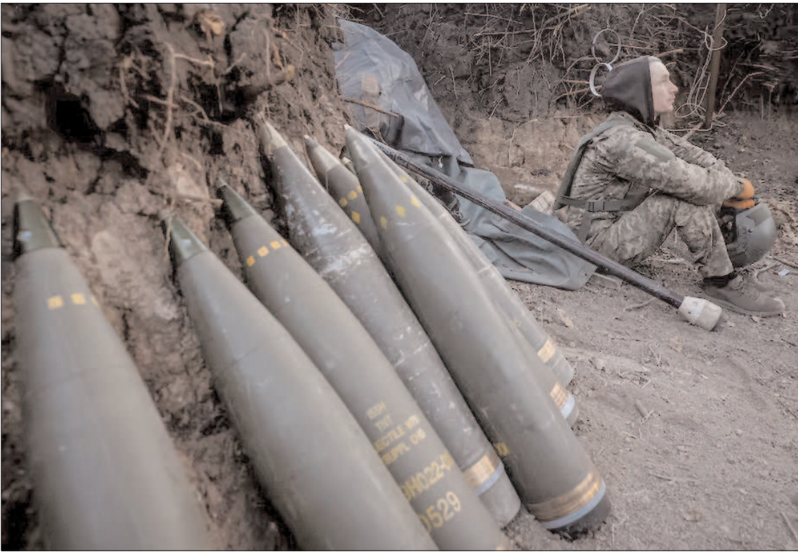
DONETSK: A serviceman of the 1148th separate artillery brigade of Air Assault Troops of Ukraine prepares a M777 howitzer to fire towards Russian troops, amid Russia's attack on Ukraine.

The president said that the bill "will keep the war from expanding, save thousands and thousands of lives, and help both of our nations to become stronger". In an interview with NBC's Meet the Press programme, Zelenskyy said the passage of the aid bill would send a powerful message to Russia that Washington stands by Kyiv and that it would not be "a second Afghanistan". "I think this support will really strengthen the armed forces of Ukraine and we will have a chance for victory," Zelenskyy said through an interpreter. He repeatedly urged US lawmakers to take swift action to pass the bill in the Senate. He said Ukraine urgently needed US long-range weapons including ATACMS (Army Tactical Missile Systems) and air defence systems to fight off the invasion by Russia that began in February 2022. "This is crucial. These are the priorities now," Zelenskyy said. The US House of Representatives, with broad bipartisan support, passed a $95bn legislative package providing security assistance to Ukraine, Israel and Taiwan. Aid for Ukraine had been held up for months, because of the opposition of Republican presidential candidate Donald Trump, who urged Republican lawmakers to block it.