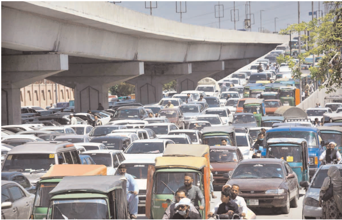
PESHAWAR: A view of massive traffic jam in front of High Court.

They said users must be sensitized to understand the gravity of this looming issue for which role of media was key and urged consumers to buy and use biodegradable plastic and clothes bags and ensure its proper disposal to make the planet a peace living abode for upcoming generation.