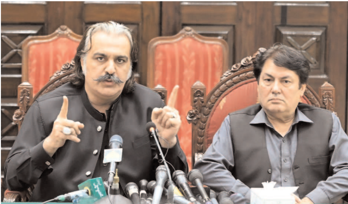
PESHAWAR: Khyber Pakhtunkhwa Chief Minister Ali Amin Gandapur addressing a press conference.