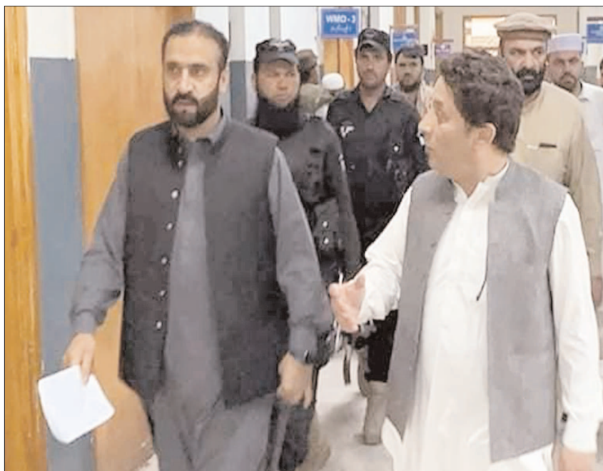
KOHAT: KP Minister for Law, Aftab Alam Afridi visiting District Headquarters Hospital during his surprise visit.

Aftab Afridi assured that the PTI government will give ideal system of Check and Balance to the people and they will feel it themselves. He also warned the government functionaries to mend their ways otherwise be ready for strict action.