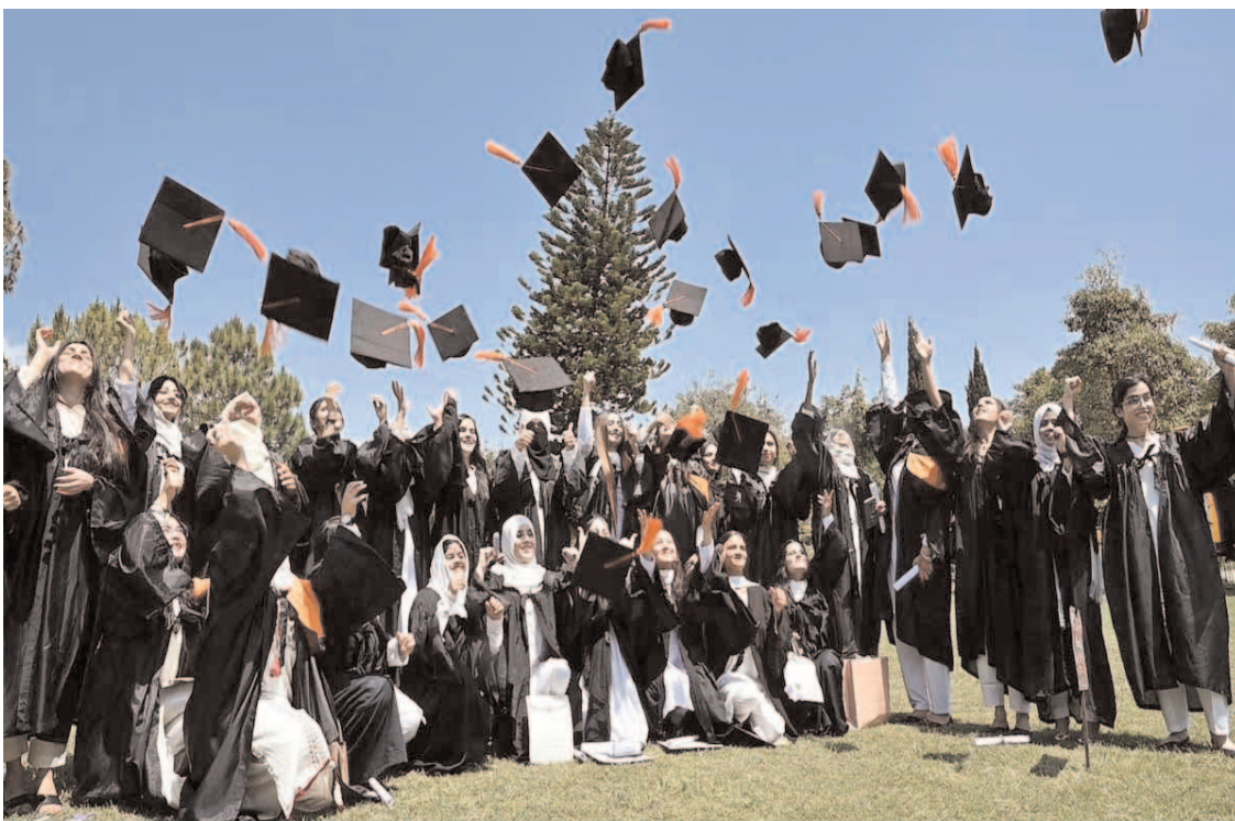
ISLAMABAD: Students throwing caps in the air in traditional way during 22nd convocation of Model College G-10/4.

RAWALPINDI (APP): In a recent move aimed at ensuring food safety, the Punjab Food Authority (PFA) has intensified its operations against substandard juices and food items in Ganjmandi. On the direction of DG Punjab Food Authority Asim Javed, food safety teams have been conducting inspections to curb the sale of counterfeit products. During these operations, the food safety teams made a significant discovery - fake juices bearing the name of a renowned brand and 600 liters of adulterated juices was destroyed. The packaging of these counterfeit products was found to be misleading, with improper labeling and misrepresentation of the brand. Such deceptive practices not only jeopardize consumer health but also undermine the trust in reputable brands. Acting on confidential information, the PFA swiftly took action against the vendors involved in selling these fake juices. A fine of Rs 15,000 was imposed on the violators as a penalty for their infringement of food safety regulations. PFA warned those engaged in the production and sale of counterfeit goods will have to face strict action without any discrimination.