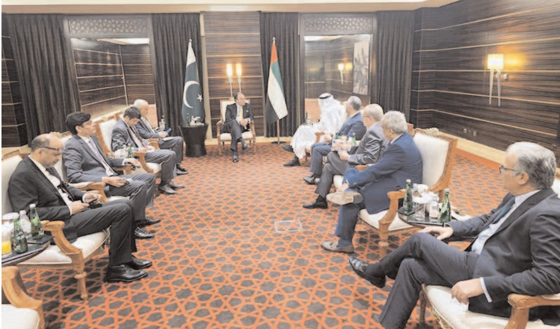
DUBAI: Finance Minister Muhammad Aurangzeb in a Meeting with Senior Officials of Mashreq Bank and First Abu Dhabi Bank.