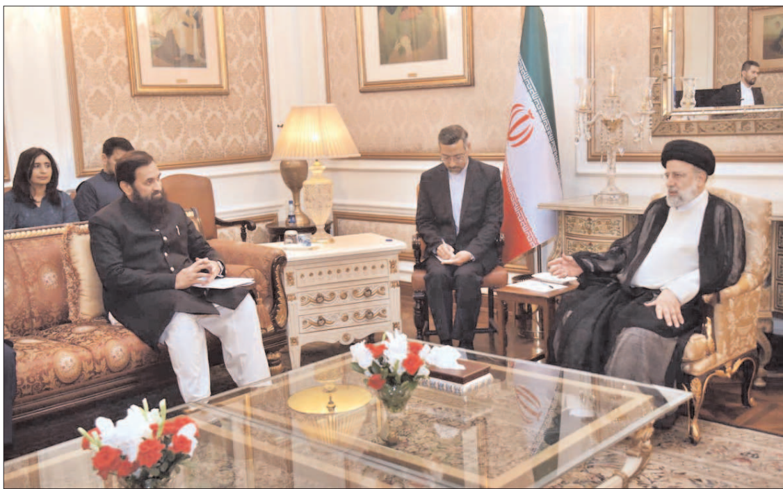
LAHORE: Punjab Governor, Muhammad Balighur Rahman meets with President of the Islamic Republic of Iran Dr. Seyyed Ebrahim Raisi at Governor House.

In Faisalabad the team disconnected 1 connection on illegal use of gas while imposing fine of Rs 0.02 against gas pilferers. The regional team of Mardan disconnected 5 connections on illegal use of gas and also imposed fine of Rs 0.1 million against gas theft cases.