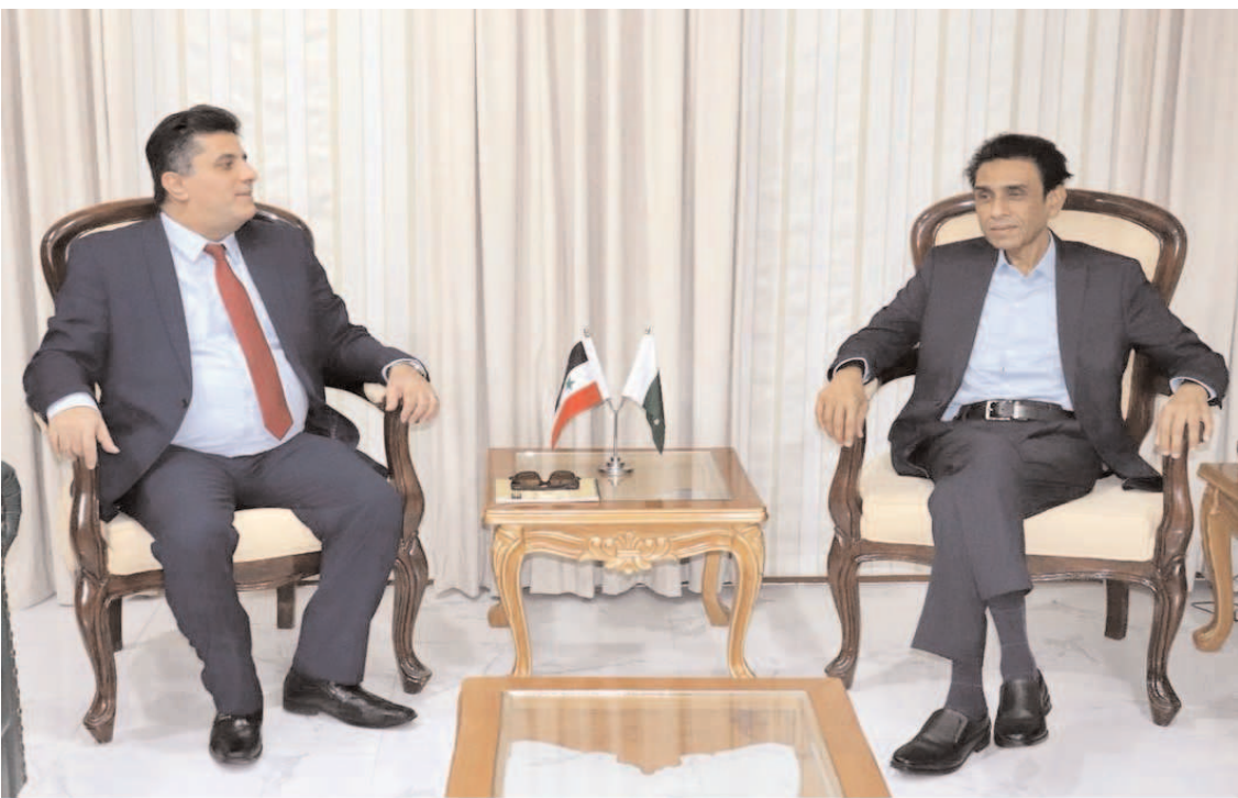
ISLAMABAD: Syrian Ambassador to Pakistan Ramiz Al-Rai called on Federal Minister for Education Dr. Khalid Maqbool Siddiqui.

Saudi Arabia has recently unveiled a "passenger without a bag" service at all its airports as the kingdom seeks to nurture its tourism industry and attract more holidaymakers. The service allows the passengers to finalise all travel procedures from their residency and ship the luggage ahead of the flight, whether domestic or international.