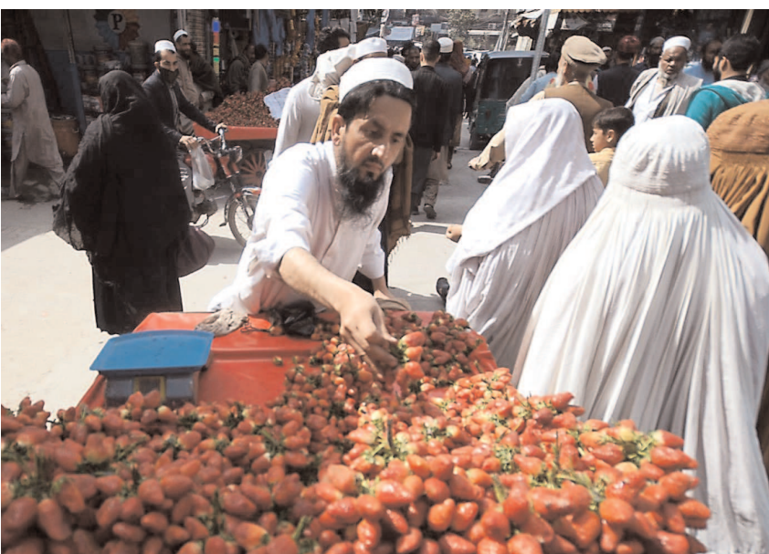
PESHAWAR: A man selling strawberries on his cart in Ghanta Ghar market.