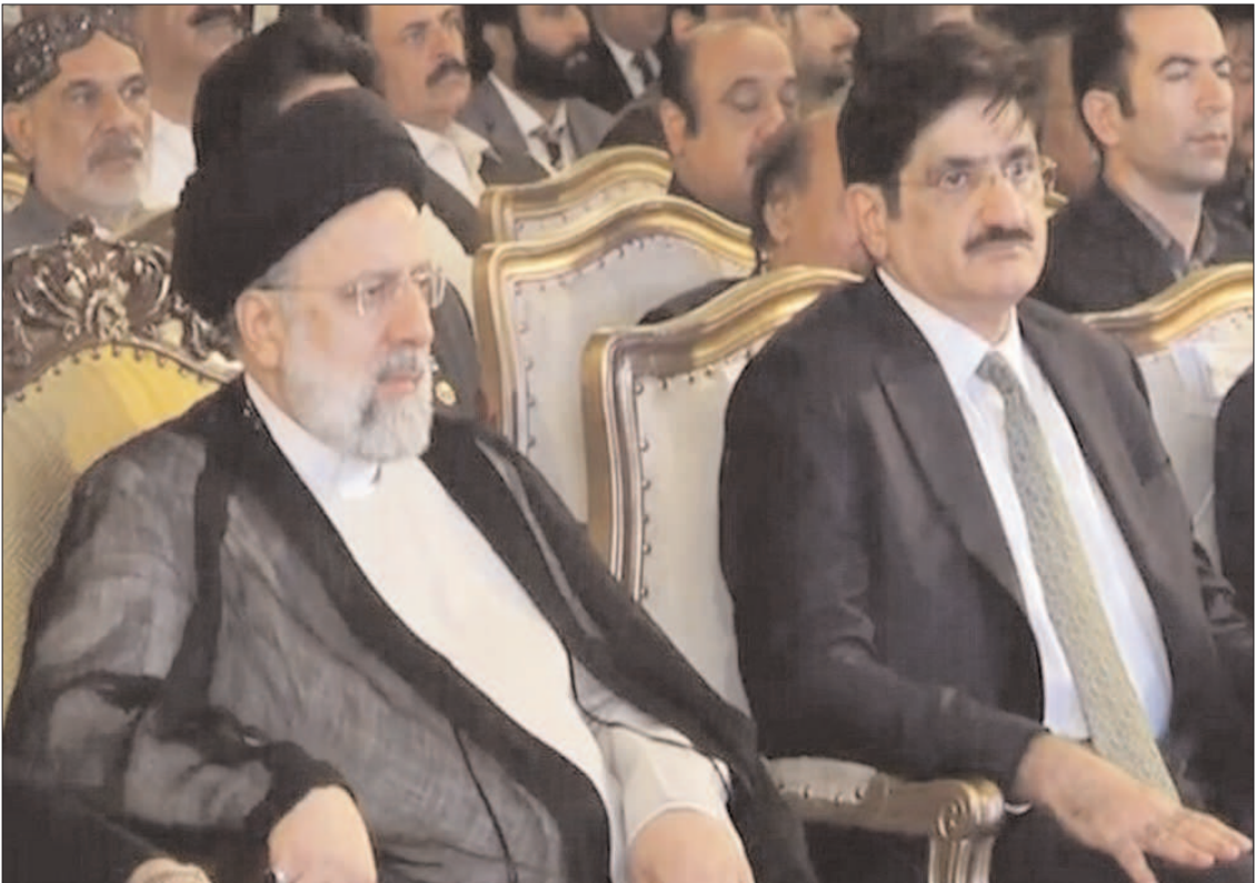
KARACHI: Iranian President Ebrahim Raisi and Sindh Chief Minister Murad Ali Shah attending a ceremony.