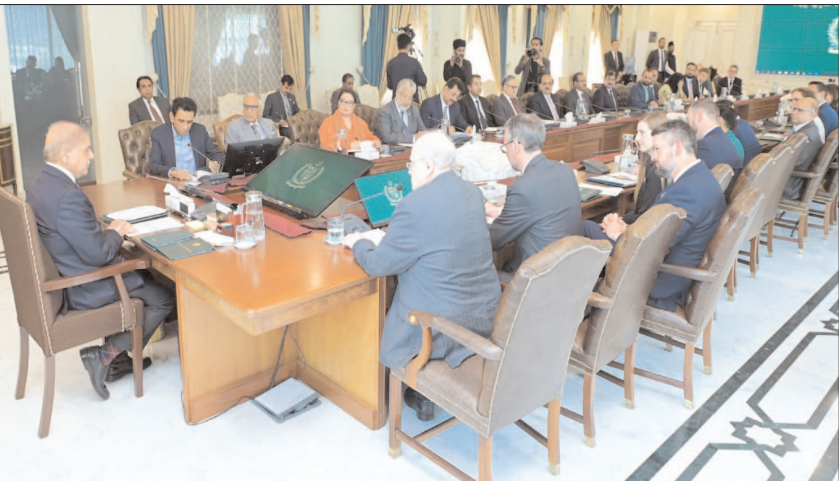
ISLAMABAD: A delegation of representatives of leading universities of United Kingdom called on Prime Minister Shehbaz Sharif.

He said that reports of missing persons were also not 100% correct every time. Two people were facing jail sentences in various cases while one was found among the attackers of Gawadar attack, he said. The Pakistan army and people, he said, have lost number of lives in the incidents of terrorism in the country. He said that there was a need to get a political solution along with the legal efforts, adding that if anyone was found involved in a crime he must be prosecuted.