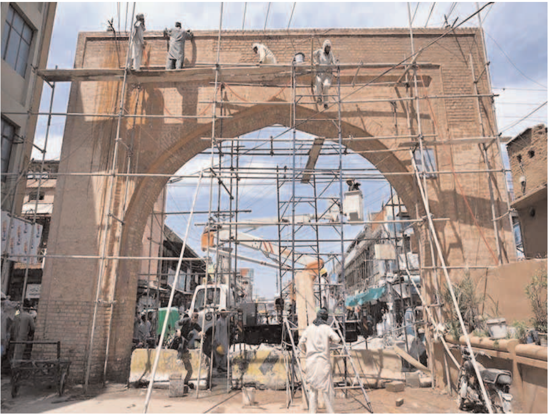
PESHAWAR: Labourers busy in renovation work of historic Qissa Khawani Bazaar Gate.