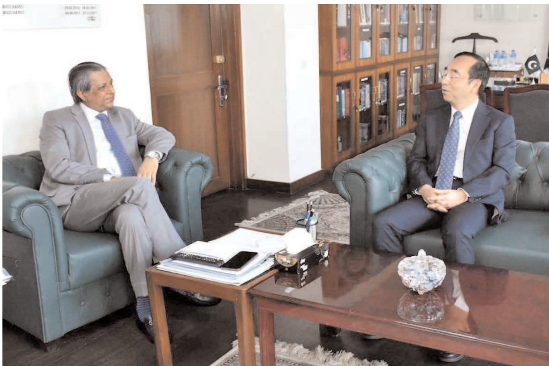
ISLAMABAD: H.E. WADA Mitsuhiro, Ambassador of Japan to Pakistan paid a courtesy call to Minister for Law and Justice Senator Azam Nazeer Tarar.

ISLAMABAD (APP): Islamabad Electric Supply Company (IESCO) on Tuesday issued a power suspension programme for Wednesday for various areas of its region due to necessary maintenance and routine development work. According to IESCO Spokesman, the power supply of different feeders and grid stations would remain suspended for the period from 07:00 AM to 1:00 PM, Islamabad Circle, Alipur, Islamabad Club, I. Shahzad Town / Mahfooz Shaheed, Scheme II, Filtration Plant, Bani Gala, Athal, Shahpur, Treat, T&T, Bhara Kho-I-II, NIH Feeders, Rawalpindi City Circle, Top City, Mumtaz City, F-17/I&II, Nogzi, Kamalabad, National Market, Gulzar Quaid, Sector-IV, APHS Feeders, Rawalpindi Cantt Circle, Fuji Foundation, Mohera Nagyal, Mehboob Shaheed, AOWHS, Wilayat Complex.