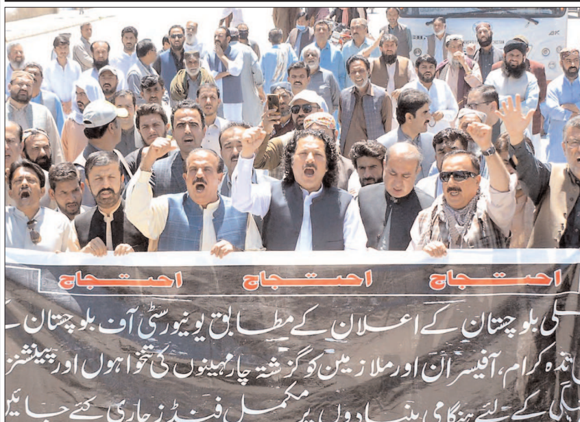
QUETTA: Activists of Joint Action Committee holding a banner during a protest for acceptance of their demands.

Later, Ulema and elders prayed collectively for maintaining such a brotherly atmosphere in Waziristan, and at the same time, the scholars and national elders appealed to all Ahmadzai wazir 9 tribes to change the old enmity into friendship, so that Almighty Allah will bless you in the life after here.