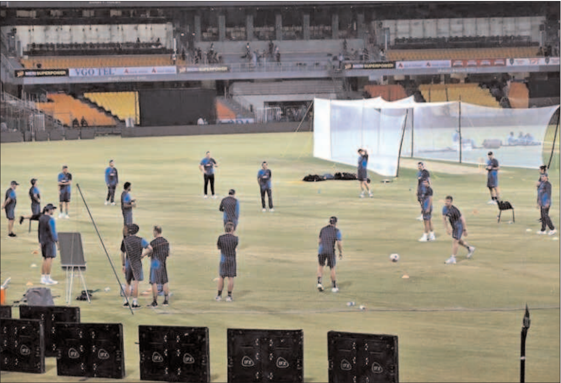
LAHORE: New Zealand Cricket Team players warm up during a practice session at the Qaddafi Cricket Stadium during the Five-Match T20 series.