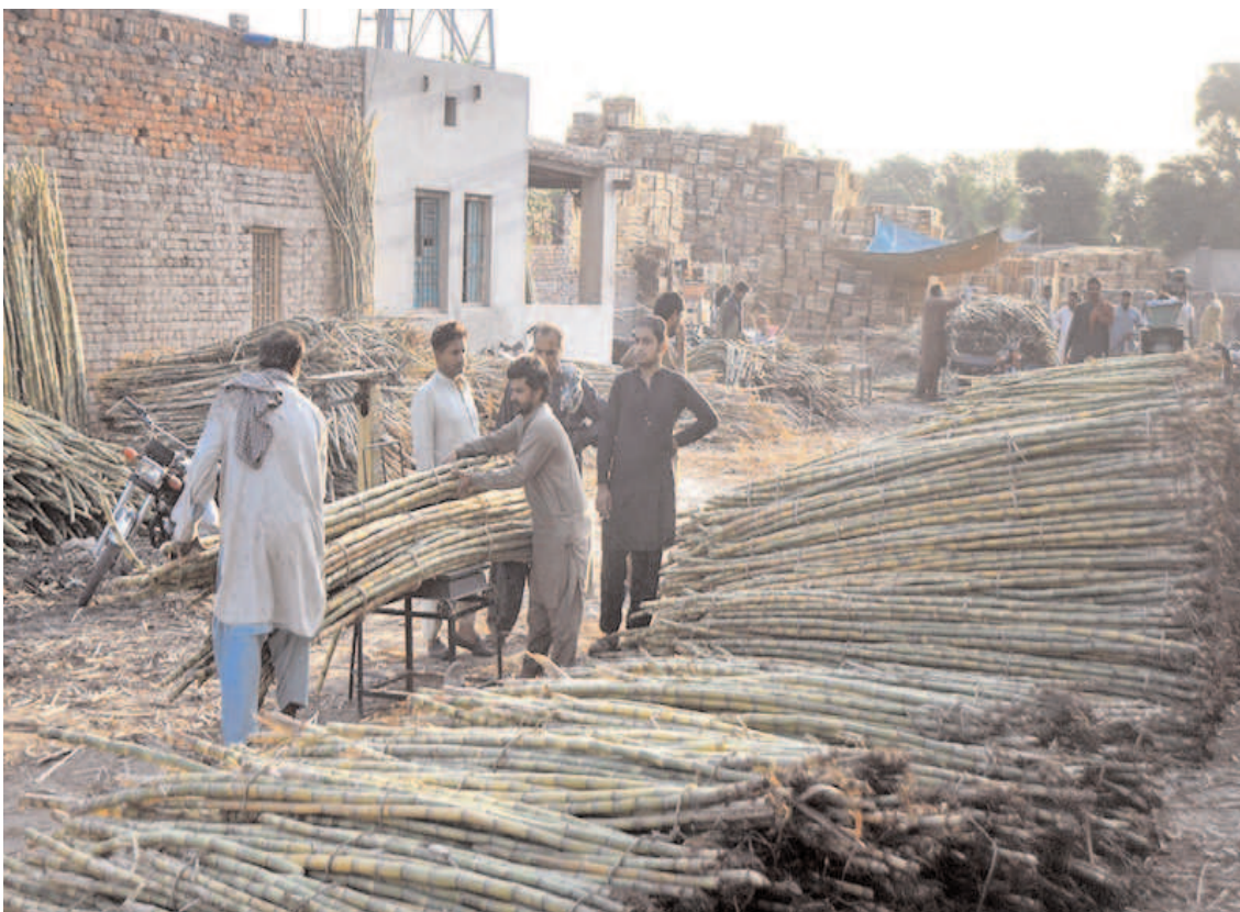
MULTAN: Vendors displaying sugarcane to attract the customers at Fruit Market.