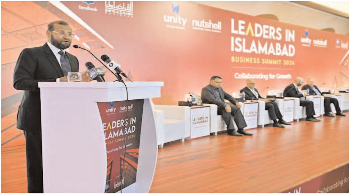
ISLAMABAD: Air Chief Marshal (Retd) Sohail Aman deliver closing remarks during the ‘Leaders in Islamabad Business Summit 2024’ Collaborating for Growth.