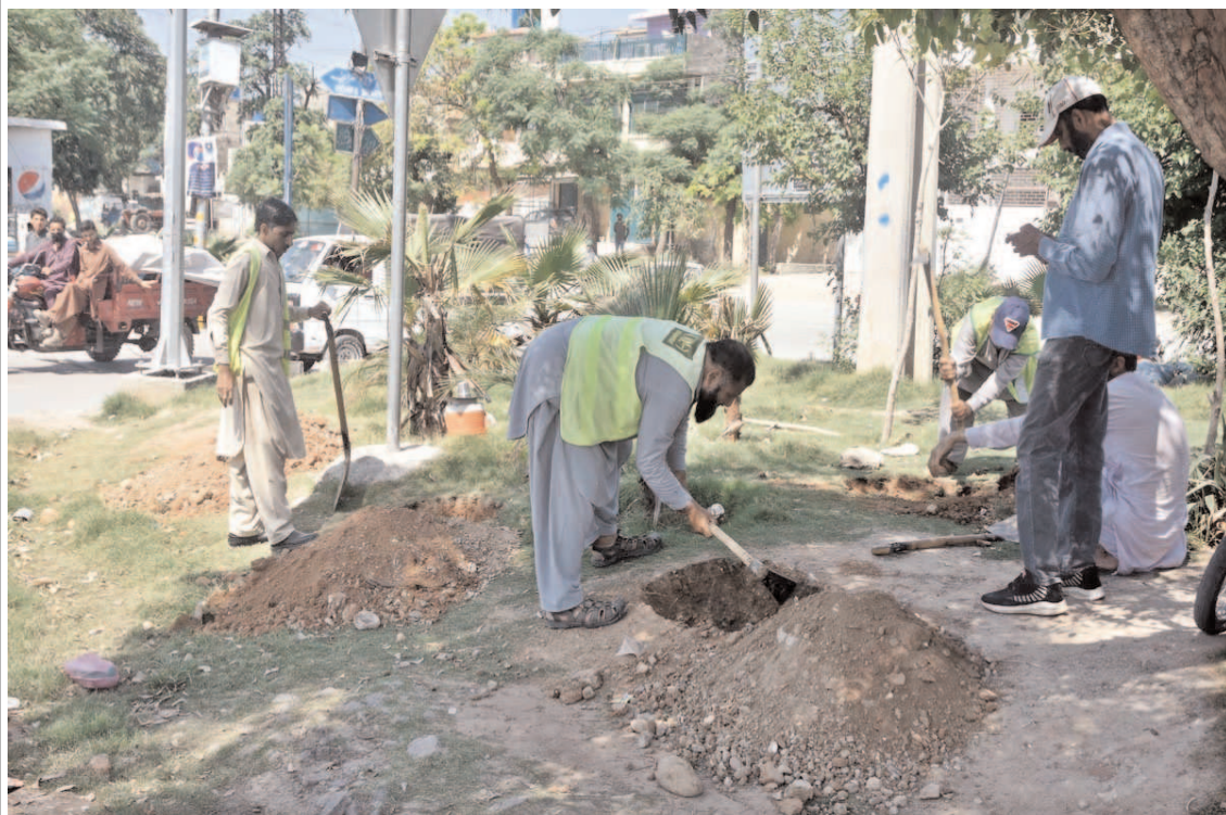
ISLAMABAD: CDA workers busy in digging the place for plantation in greenbelt along IJP Road.

Besides students, the session was attended by EPA Officials, civil society reps and others.