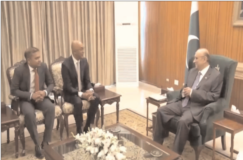
Zardari encouraged investors to take advantage of the investment opportunities available in the Pakistan Stock Exchange. The delegation briefed the President on AirAsia Aviation Group and its flight operations.

He said that Pakistan, being a large market, holds immense potential for tourism, particularly religious tourism. Additionally, there are excellent investment opportunities available in the Pakistani stock market. President Asif Ali