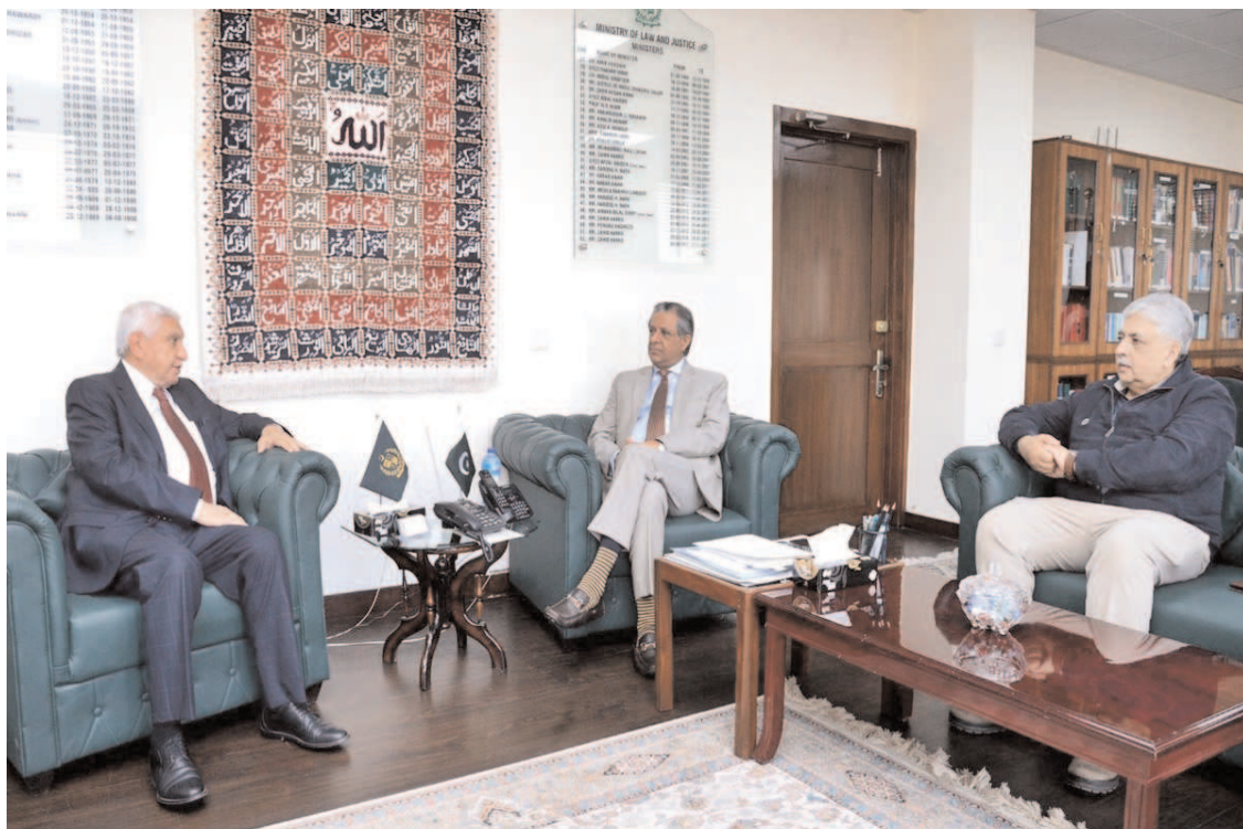
ISLAMABAD: Federal Minister for Law Azam Nazeer Tarar in a meeting with International Parliamentarians Congress Delegation.