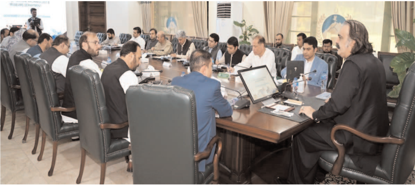
PESHAWAR: Khyber Pakhtunkhwa Chief Minister Ali Amin Gandapur chairing a meeting of the tourism department.

He has directed to increase the number of private members in the boards of semi-government entities administered by the tourism department, and added that the professionals should be included in the boards. Necessary amendments in the relevant legal framework be proposed for this purpose, he directed.