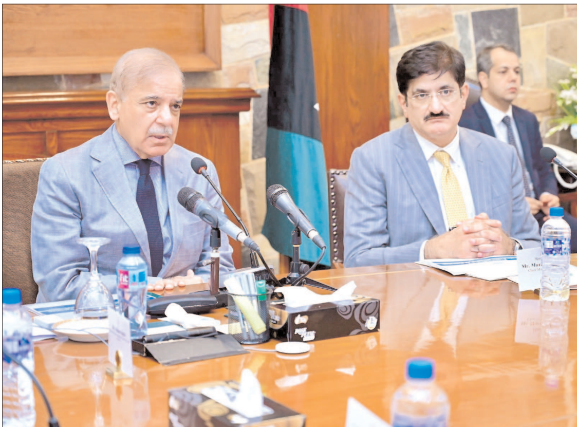
KARACHI: Prime Minister Shehbaz Sharif addressing business community during his visit to Port City.

He said after arrival in Karachi he visited Mazar-e-Quaid and paid rich tribute to the father of the nation. Sindh Chief Minister Syed Murad Ali Shah congratulated Shehbaz Sharif on assuming office of the prime minister for second term. Federal Minister for Information and Broadcasting Attaullah Tarrar, Federal Ministers Ahsan Iqbal, Dr Khalid Maqbool Siddiqui, Jam Kamal, Qaiser Shaikh and members of the provincial cabinet also attended the meeting.