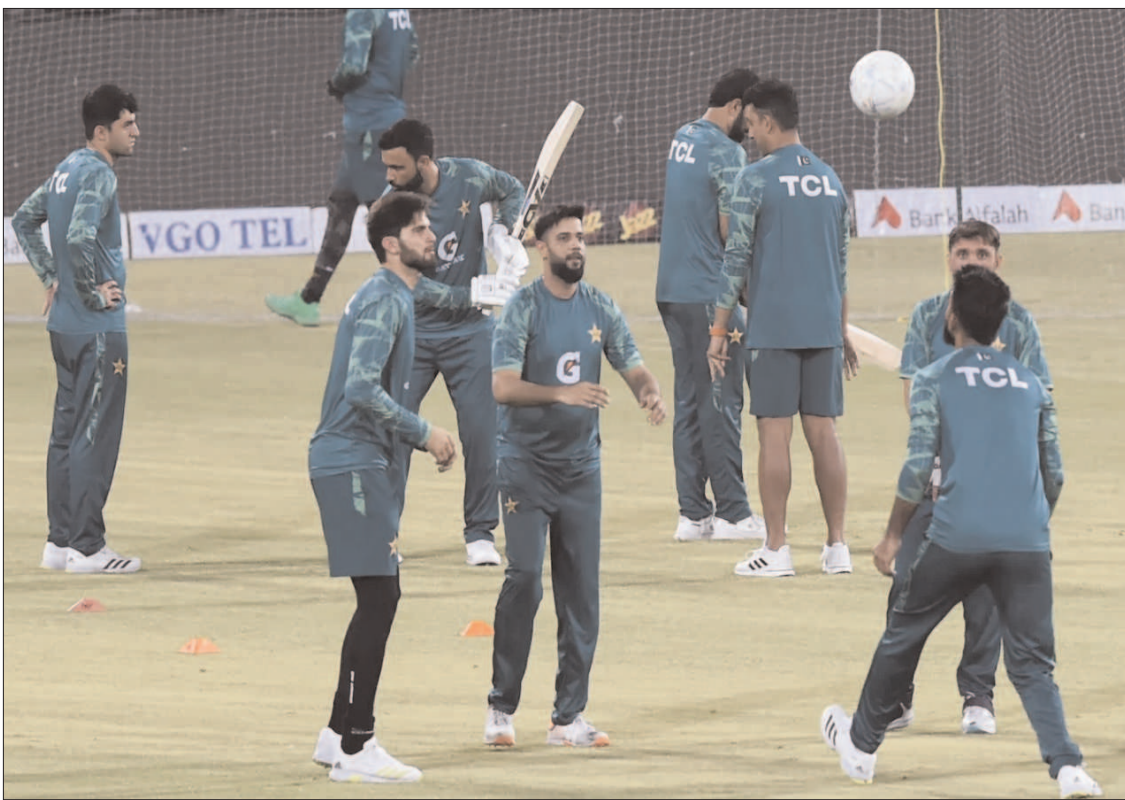
LAHORE: Pakistan players warm up with football.

KARACHI (PPI): The President's Cup 50-over tournament commenced with a thrilling tied match between Water and Power Development Authority (WAPDA) and Khan Research Laboratories (KRL) at the Shoaib Akhtar Cricket Stadium in Rawalpindi on Wednesday. Batting first, WAPDA posted 258 for six in their allotted 50 overs. In turn, KRL needed two runs off the final delivery for victory, but managed only one run to finish at 258 for eight. As there was no Super Over, points were equally shared between the two sides. The other match at the Abbottabad Cricket Stadium was rained off without a ball being bowled.