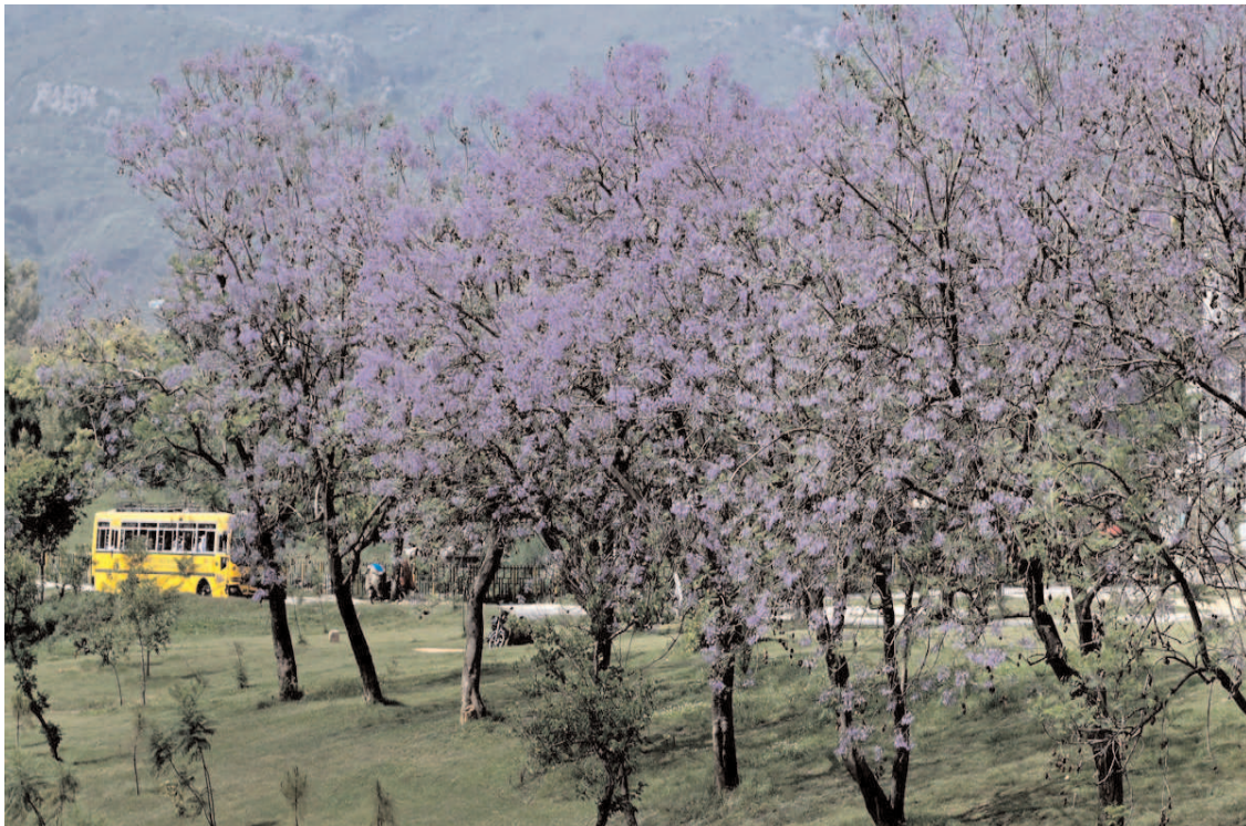
ISLAMABAD: An attractive and eye catching view of flowers blooming on trees in the Fedearl Capital.

5 kg hashish was recovered from a parcel sent to Lucky Marwat at courier office in Sukkur and an accused was also arrested. Cases under the Anti-Narcotics Act have been registered against the arrested accused and further investigations are under process.