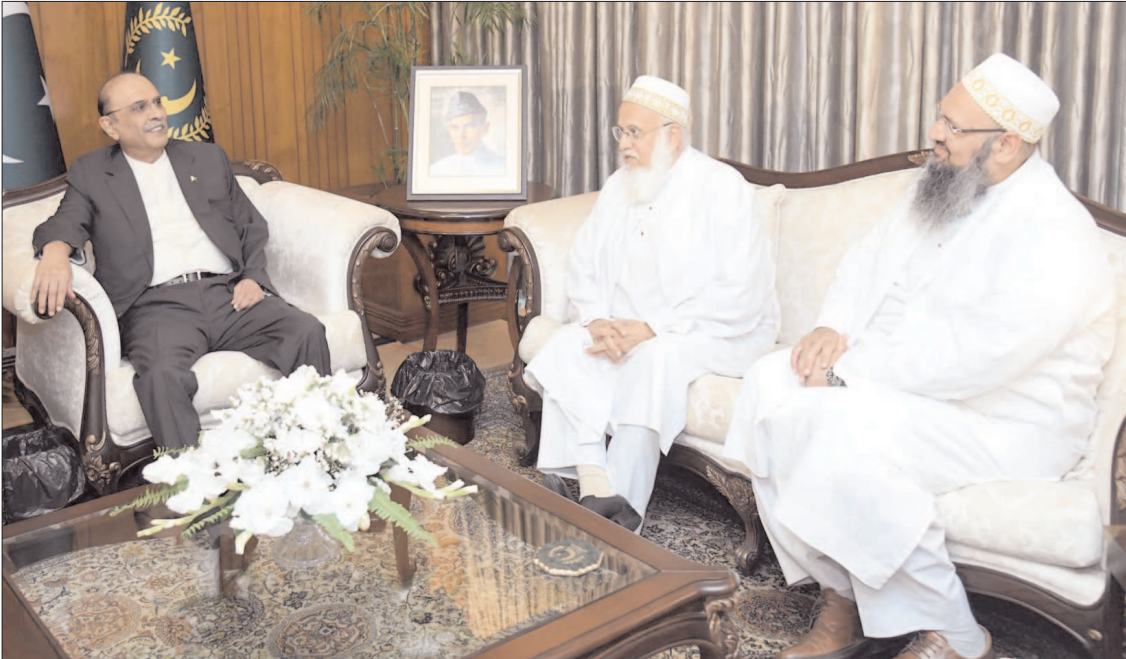
ISLAMABAD: A delegation of Dawoodi Bohra community called on President Asif Ali Zardari, at Aiwan-e-Sadr.

According to the details, the NA Secretariat said that it has not been conveyed by the Election Commission by the Election Commission (ECP) about independent MNAs joining the SIC. "The PTI-backed lawmakers would be considered independents until the National Assembly Secretariat receives the party affiliation notification from the ECP," the secretariat said in a statement. On February 18, the PTI, whose candidates contested the February 8 general elections 'independently', decided to form an alliance with the SIC. Previously, the PTI had also announced to form a coalition in Centre and Punjab with the Majlis Wahdat-e-Muslimeen (MWM) but the move faced backlash by some party members.