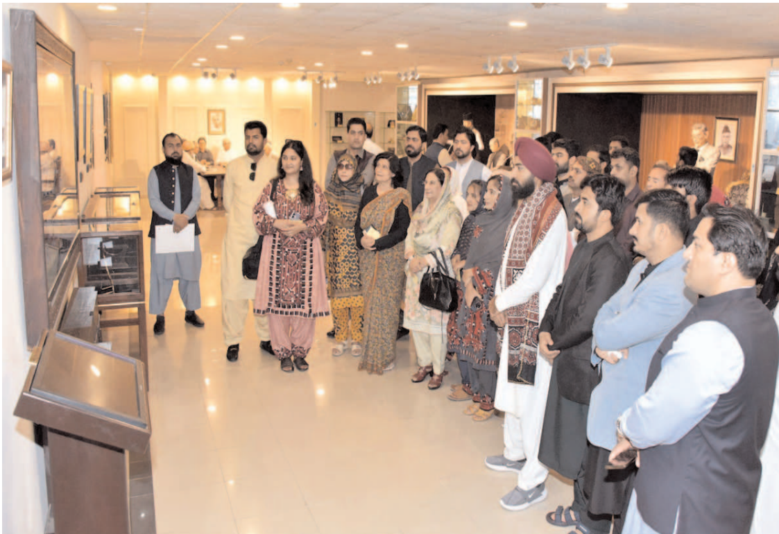
ISLAMABAD: Students of Mehergarh's youth leaders visiting Senate Museum at Parliament House.

ISLAMABAD (APP): Indus River System Authority (IRSA) on Friday released 113,600 cusecs water from various rim stations with inflow of 178,100 cusecs. According to the data released by IRSA, water level in River Indus at Tarbela Dam was 1448.73 feet and was 34.73 feet higher than its dead level of 1,398 feet. Water inflow and outflow in the dam was recorded as 30,800 cusecs and 5,000 cusecs respectively. The water level in River Jhelum at Mangla Dam was 1142.65 feet, which was 92.65 feet higher than its dead level of 1,050 feet. The inflow and outflow of water was recorded 63,700 cusecs and 25,000 cusecs respectively. The release of water at Kalabagh, Taunsa, Guddu and Sukkur was recorded as 43,000, 56,000, 58,800 and 19,800 cusecs respectively.