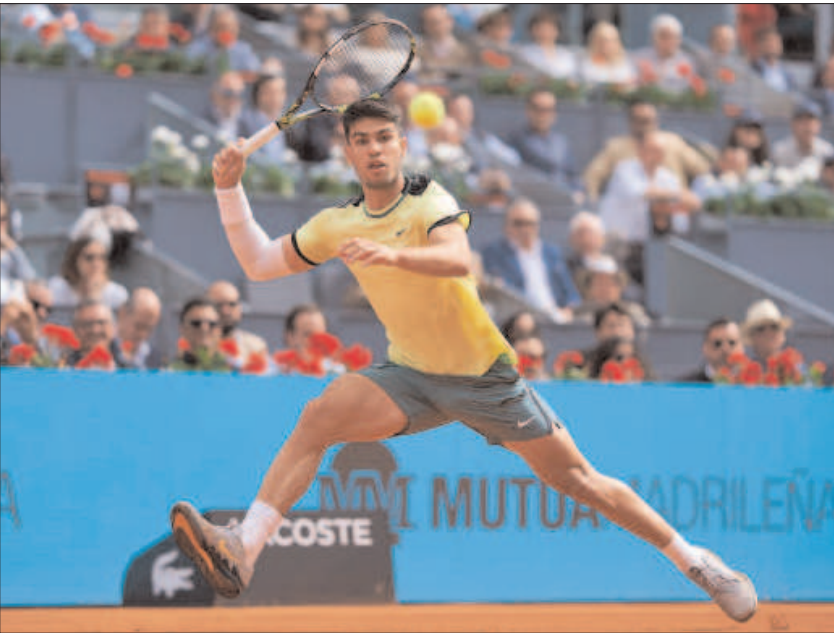
MADRID: Carlos Alcaraz plays a forehand against Alexander Shevchenko during their Men's Singles Round of 64 match on Day Four of the Mutua Madrid Open.