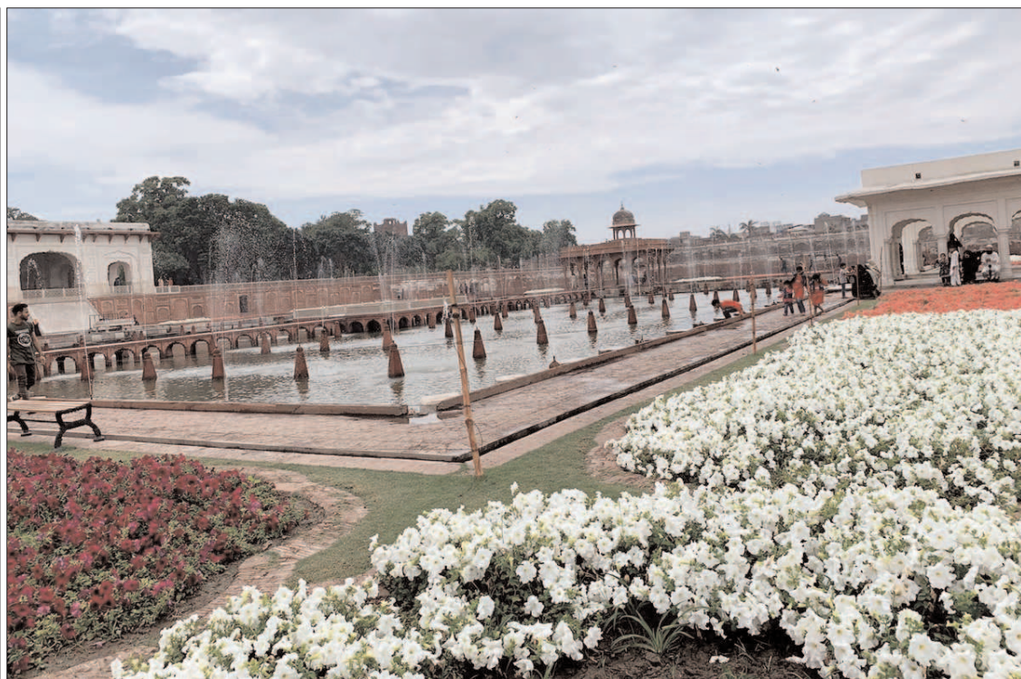
LAHORE: A beautiful view of historical Shalamar Bagh in the Provincial Capital.

Strengthening of Academic and Professional Facilities at University of Peshawar; Email: mp4@uop.edu.pk Project Assistant: +92-91-334-9143744