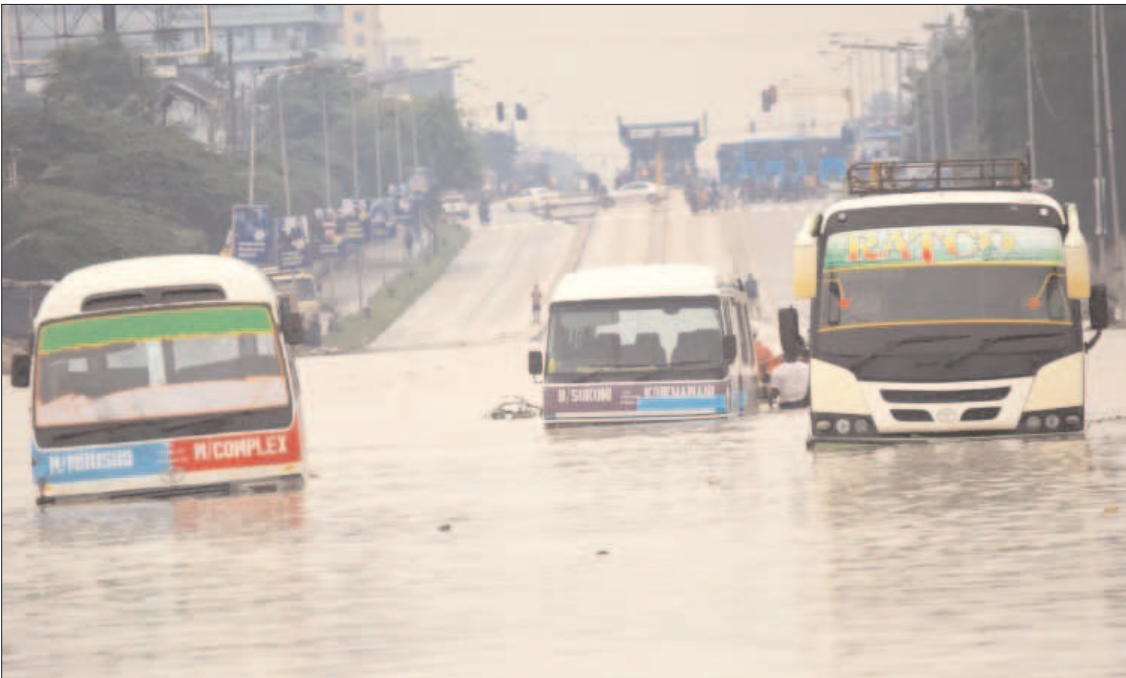
DAR ES SALAM: Public mini busses are submerged in the flooded streets in Tanzania.

Lukashenko added that neighbouring Poland - to the country's west - should not expect aggressive actions from Belarus, the report said. The updated document listed the countries from which threats emanate, the range of internal and external threats to military security, and the position on the use of tactical nuclear weapons, the report said without elaborating on the countries named. Lukashenko, a key ally of Russian President Vladimir Putin, has frequently talked up the dangers of an attack by NATO or Ukraine as justification for maintaining his military and security apparatus on a constant state of high alert. The military doctrine declared Belarus's readiness to act as a platform for the peaceful resolution of conflicts and its openness to cooperation in the military sphere with any states, including NATO, RIA reported. Russian state news agency TASS quoted Lukashenko as saying there could be an "apocalypse" if Russia used nuclear weapons in retaliation for Western actions. Russia has deployed tactical nuclear weapons, missiles and troops in the country. At VNS meeting, Lukashenko alleged that the opposition planned to seize a district in the west of the country and request support from NATO troops, according to RIA. — Aljazeera