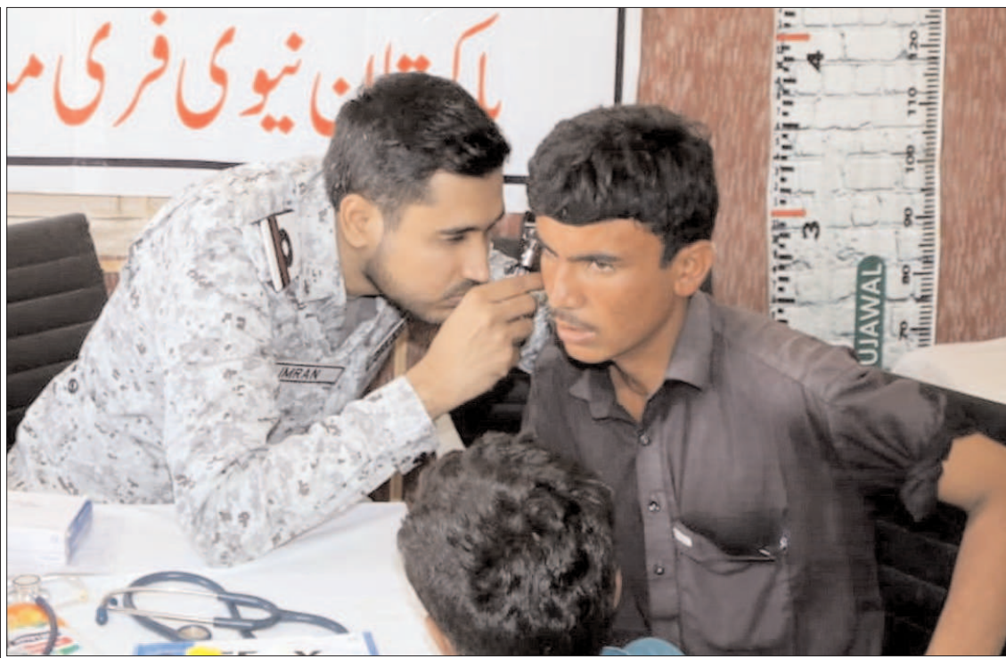
SUJAWAL: A doctor examining patient at a free medical camp arranged by Pakistan Navy at Jungo Jalbani.

The officers in the circles and police stations should provide justice to the citizens at the earliest opportunity. He issued instructions to the SDPOs and SHOs and said that the problems of the people should be solved at their doorsteps so that they can avoid travel addiction. This is the first duty of the police.