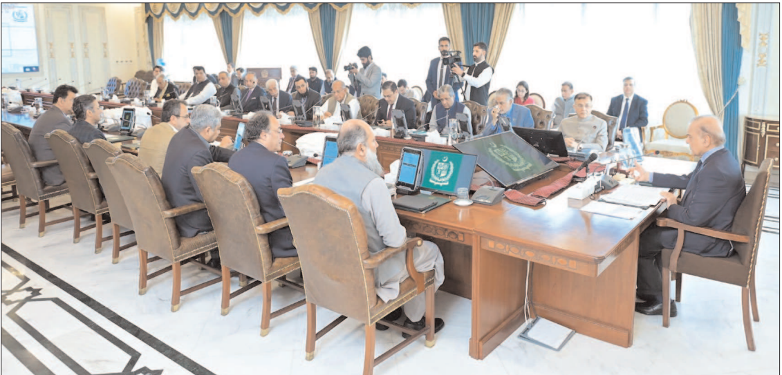
ISLAMABAD: Prime Minister Shehbaz Sharif chairing meeting of federal cabinet.

the meeting, the Federal Secretary for the Interior briefed the cabinet on the progress of the Federal Investigation Agency's (FIA) operations. The Secretary of Aviation, filled in the meeting on the recent measures taken to improve the facilities at Pakistan's airports, particularly Lahore and Karachi. The meeting was informed that the service counters at the airports had been increased and the facilities were being upgraded. The meeting was told that the advertisements inviting expressions of interest were published in national and international newspapers on April 2, with the last date being May 3, and so far several companies had expressed keen interest in PIA. The meeting also gave the go-ahead to the appointments of four ex-officio members of the Institute of Cost and Management Accountants (ICMA) and approved the decisions taken by the Cabinet Committee on Legislative Cases on April 18, 2024.