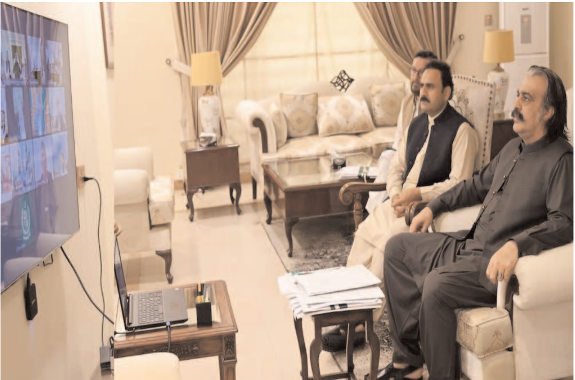
PESHAWAR: Khyber Pakhtunkhwa Chief Minister Sardar Ali Amin Gandapur attending a meeting of Climate Change council via video link. The meeting was chaired by Prime Minister Shahbaz Sharif.