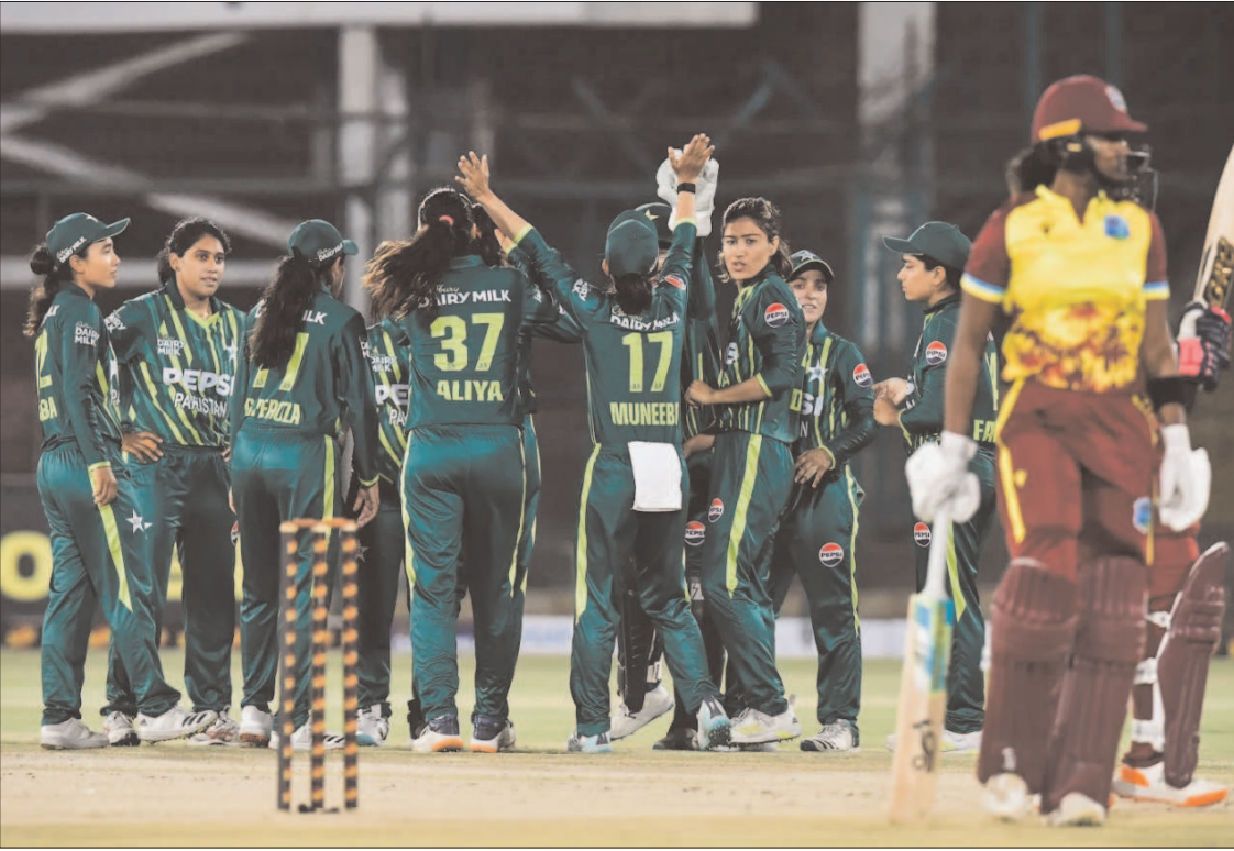
KARACHI: Pakistan dismissed Hayley Matthews in the first over, Pakistan vs West Indies, 1st Women T20I.

Regarding the team dynamics and the infusion of young talent, Azam commented will be jointly hosted by the budding bowlers while acknowledging the necessity for squad alterations due to injuries. Despite the setbacks, Azam remains optimistic about the team's potential to bounce back and deliver stronger performances in the remainder of the series.