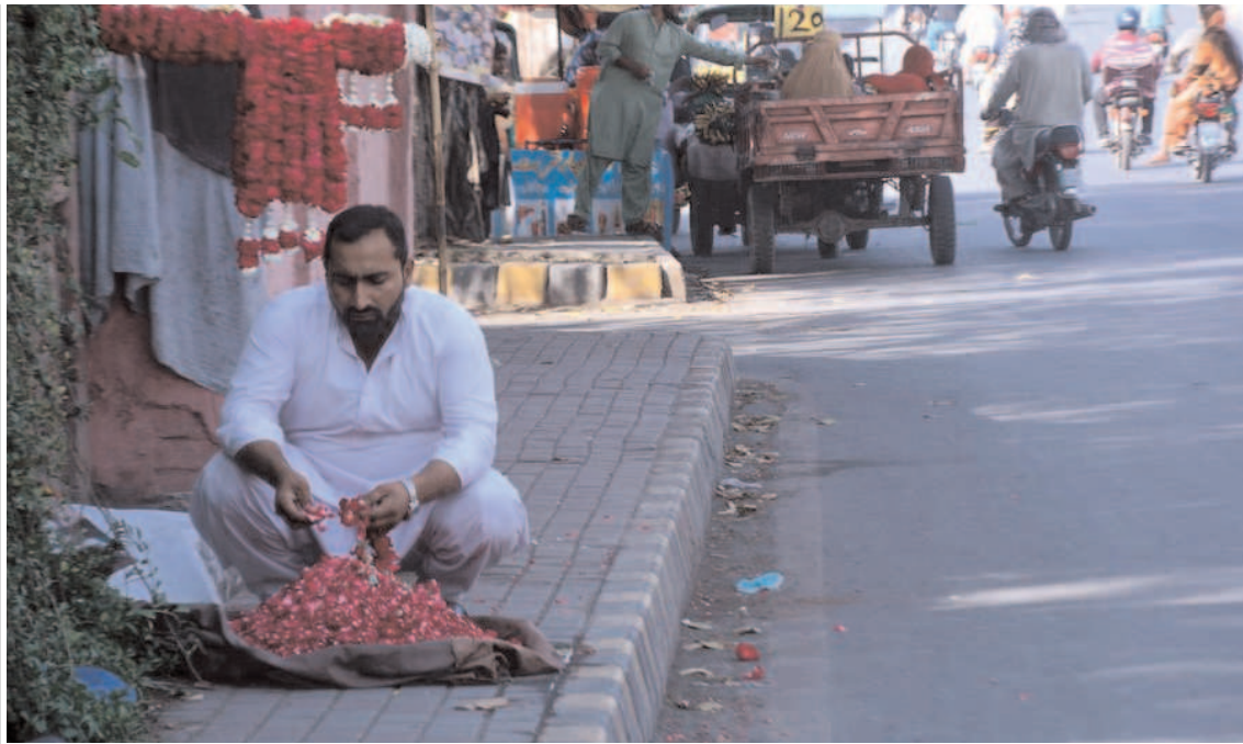
LAHORE: Vendor preparing garlands to attract customers at roadside.

The participants said production has stopped and operational expenses are also becoming difficult to meet, which has increased the fear of unemployment.