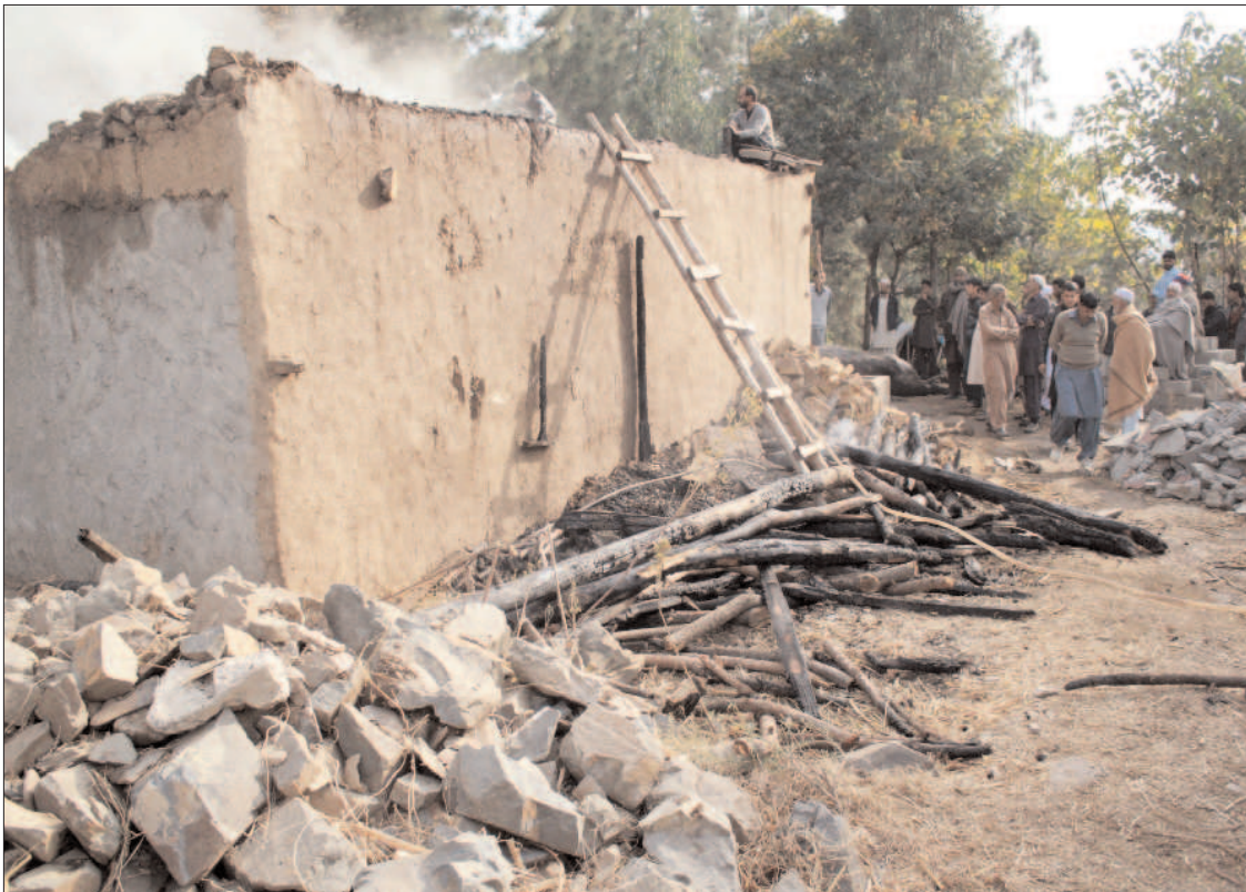
ABBOTTABAD: Locals gathered near the destroyed house after fire eruption, due to short circuit.