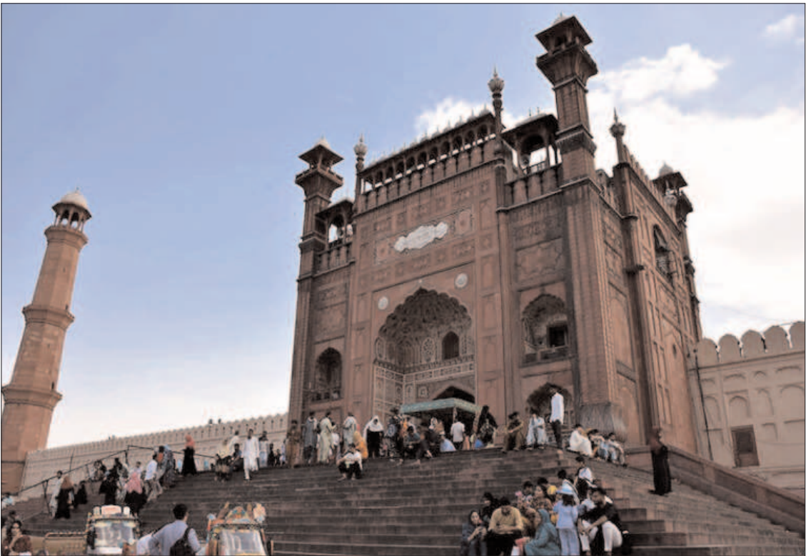
LAHORE: Visitors explore the majestic beauty of the iconic Mughal-era Badshahi Masjid in the Provincial Capital.