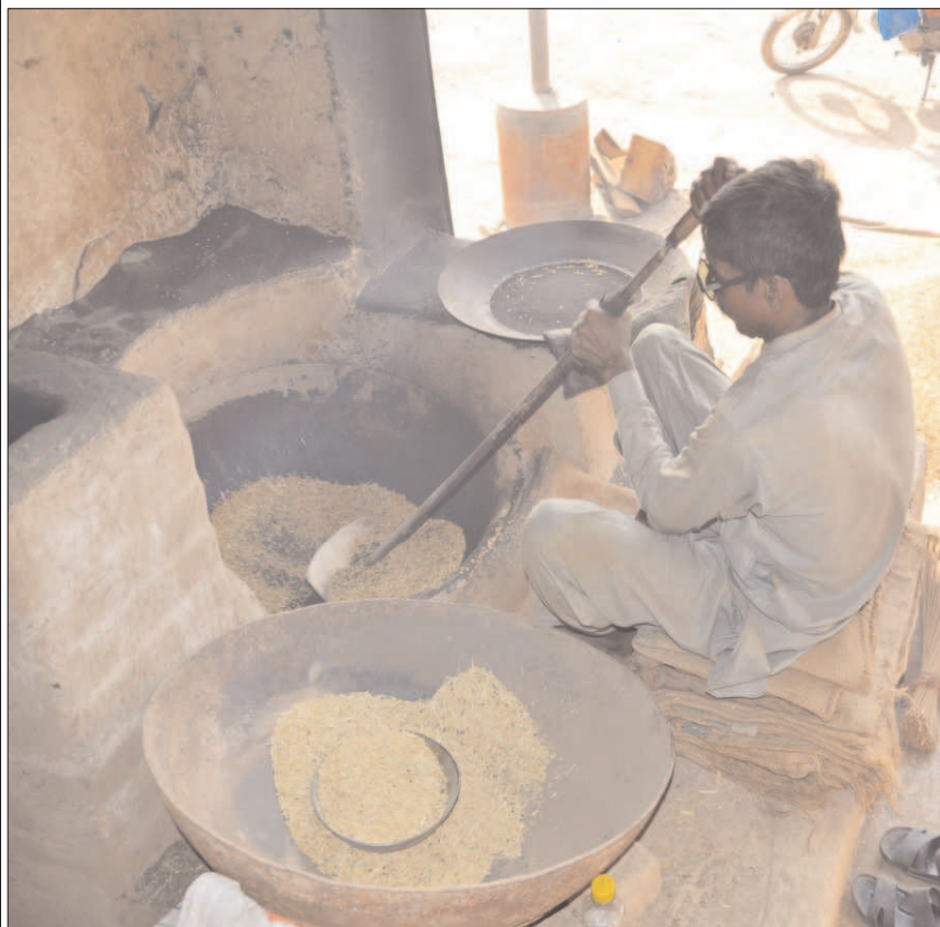
FAISALABAD: A worker preparing the 'Sattu' grain in the Ghalla Mandi.

ongoing efforts to digitize the administrative affairs of the food department to ensure accountability. Zahir Shah Toru extended that five-member committee has also been constituted, comprising officials from the agriculture department, administration, and NAB to oversee the procurement, transportation, quality control, and prevention of malpractice during the whole procurement process. Reiterating the government's zero-tolerance policy against corruption, Toru pledged exemplary punishment for anyone found involved in malpractice.