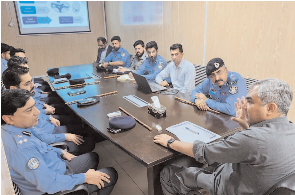
ISLAMABAD: Federal Minister for Interior Mohsin Naqvi chairing a meeting regarding improving Law & order situation and crackdown against criminals in the capital.

RAWALPINDI (APP): Provincial Minister for Transport Bilal Akbar Khan said that parking plazas would be constructed soon to curb traffic and parking issues in Murree. Punjab government will take all possible measures for tourist facilities. He expressed these views while talking to the media during his visit to Murree on Saturday. The minister visited the Murree on the directions of Chief Minister Maryam Nawaz Sharif as a follow-up to 'Murree expansion plan'. The minister examined the proposed sites for parking and discussed possibilities and opportunities for the construction of parking plazas. He also visited Murree's General Bus Stand and exchanged views with transporters on prevailing traffic issues and possible solutions. In his media interaction, the minister informed that the rush would be reduced after the placement of the parking lot. The Punjab government will take all possible measures to facilitate tourists along with providing quality travel facilities in Murree. The Secretary Transport Authority Murree will also be appointed soon, he said adding that strict action would be taken against all illegal bus stands in Murree. Earlier, DC Agha Zaeer Abbas Shirazi briefed the minister regarding traffic and parking issues. Secretary Transport Punjab, Ahmed Javed Qazi and AC Captain (Rtd) Abdul Wahab Khan were also present during the visit by the minister.