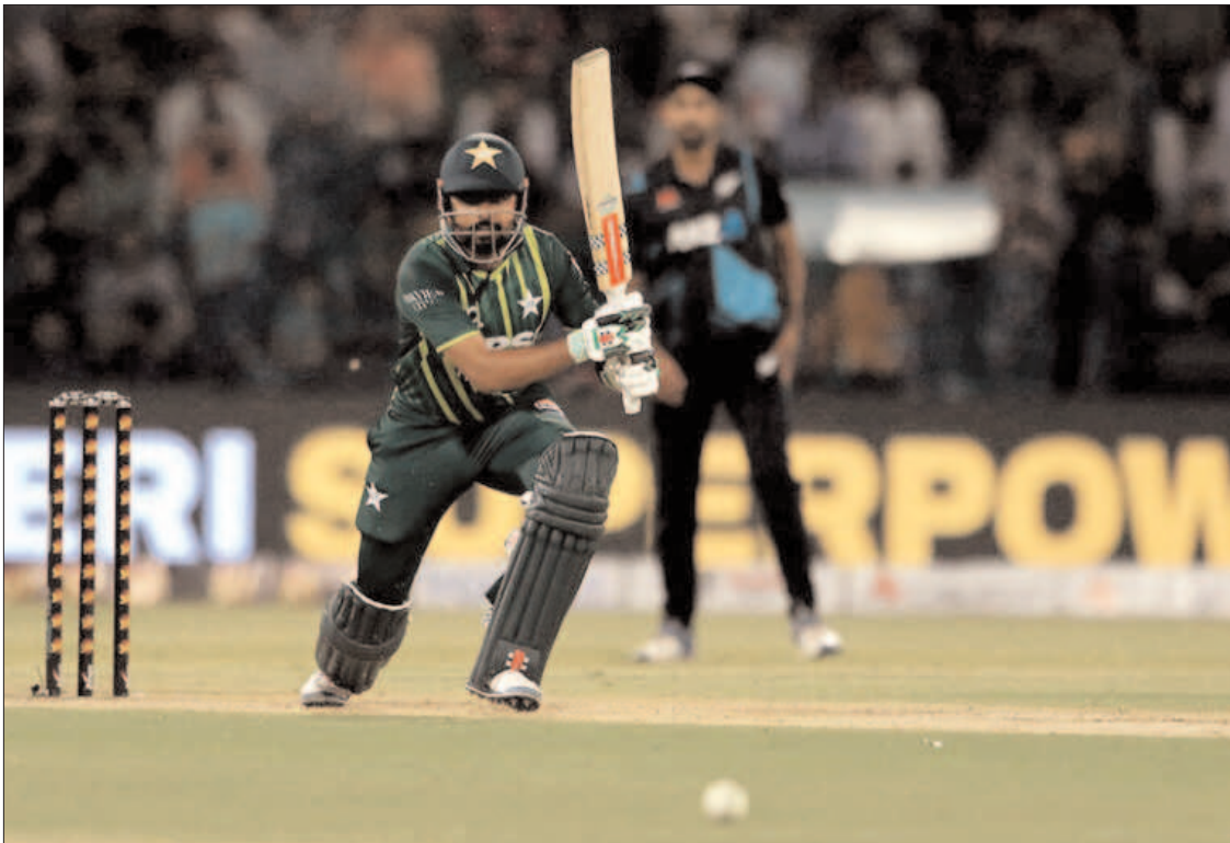
LAHORE: Pakistan's batter Babar Azam plays a shot during the fifth Twenty20 International cricket match between Pakistan and New Zealand at the Qaddafi cricket stadium.

JEREZ DE LA FRONTERA (APP): Jorge Martin extended his lead in the MotoGP standings as he won the Spanish Grand Prix sprint in Jerez on Saturday after Marc Marquez crashed out while leading late in the race. Teenaged rookie Pedro Acosta was runner up to take second in the championship race as nine riders failed to finish. Former world champion Fabio Quartararo started in 23rd of 25 but so spread out was the crash-shattered field that he managed to cross the line third. But the Frenchman was later penalised eight seconds and relegated to fifth for low tyre pressure which cost Yamaha their first podium place of the season. Dani Pedrosa, the 38-year-old Spanish veteran racing as a wild card for KTM moved up to third place, ahead of Italian Franco Morbidelli of Ducati-Pramac in fourth. Riders repeatedly described the track, dappled with damp after morning rain, as tricky. "A difficult race, the track conditions were super hard," said Martin in his on-track interview. Marquez, with his first pole since joining Ducati Gresini, and Martin started on the front row, but South African Brad Binder shot off from the second row to grab the lead on his KTM.