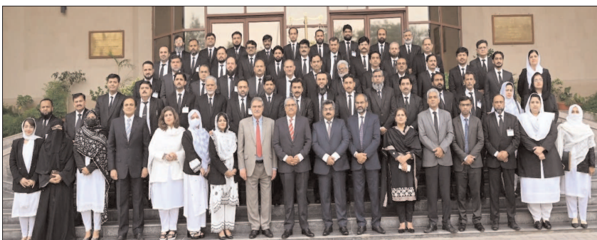
ISLAMABAD: District judiciary judges in a group photo with Justice Athar Minallah at the Federal Judicial Academy.

The judges would inform the inspection judge about the alleged meddling, it added. The inspection judge will bring the matter to the knowledge of the chief justice of the high court concerned. A judge who will not report the alleged meddling within seven days should be considered guilty of misconduct. The sources further said the judges suggested there should be an "institutional response" to any kind of meddling.