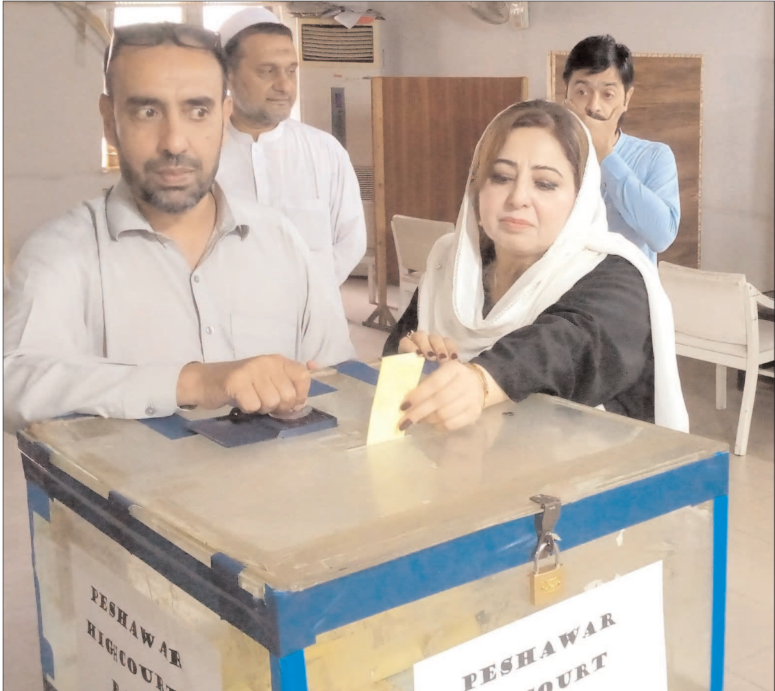
PESHAWAR: A lawyer casting her vote during High Court Bar Association election.