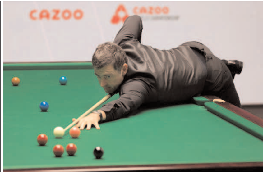
SHEFFIELD: Ronnie O'Sullivan plays a shot against Ryan Day of Wales in their round two match during day nine of the Cazoo World Snooker Championship.