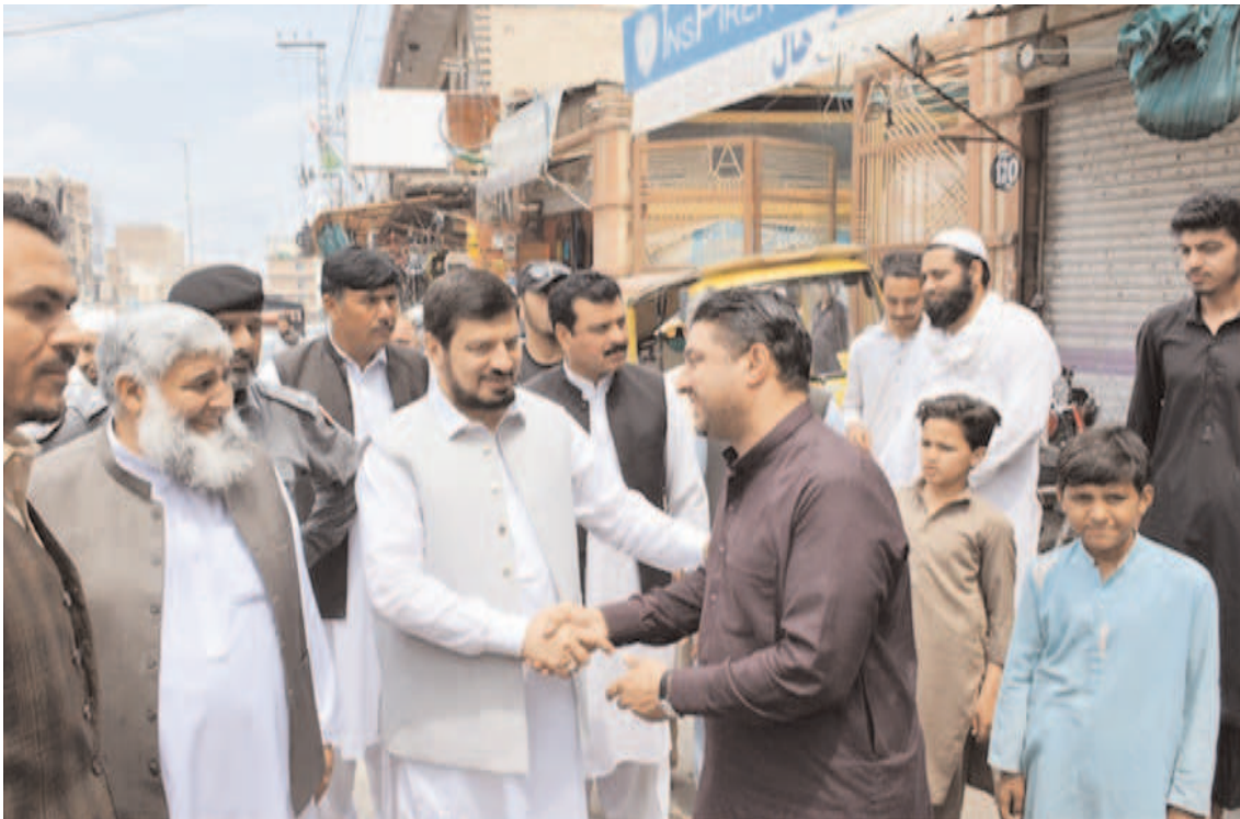
PESHAWAR: Khyber Pakhtunkhwa Governor Haji Ghulam Ali meeting people and traders during his visit to Sard Chah area of Provincial Capital on Sunday.