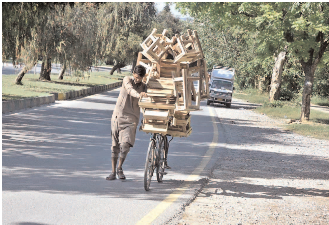
ISLAMABAD: A vendor on the way along with his bicycle loaded with wooden stools for selling in Federal Capital.