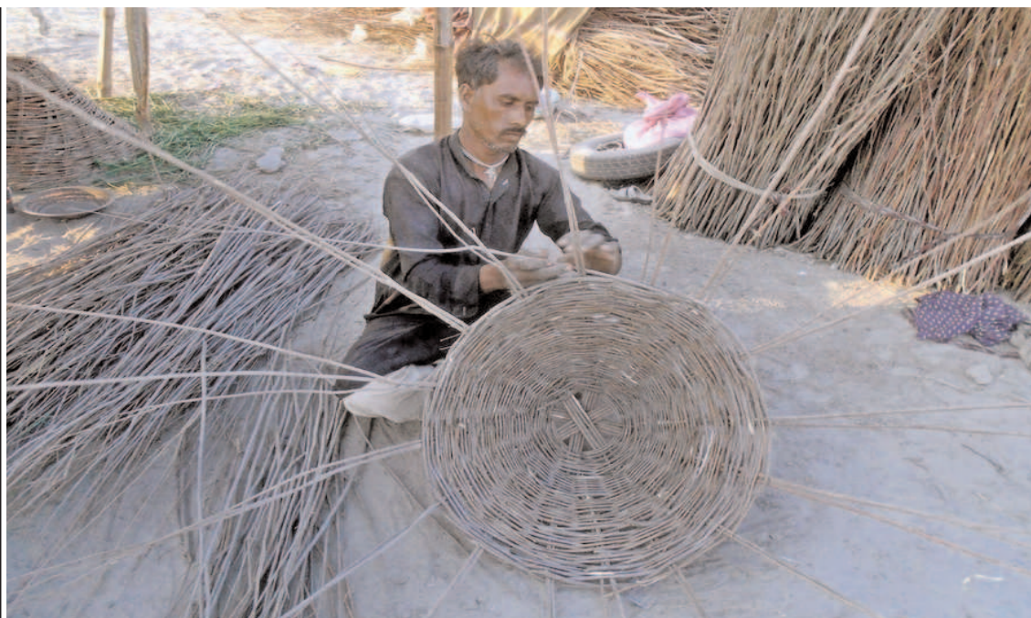
CHINIOT: A worker busy in making traditional basket with branches of tree at his workplace.

In the end, Governor SBP bestowed degrees upon the graduating CMAs.