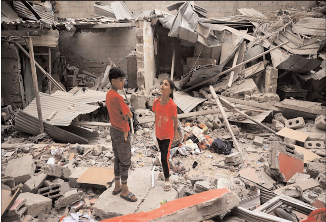
RAFAH: Palestinian kids stands amid the debris of a house destroyed by overnight Israeli bombardment in Rafah in the southern Gaza Strip.