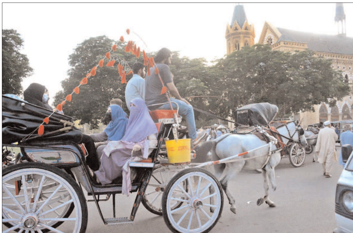
KARACHI: A horse driven cart carrying passengers arrive at Frere Hall.