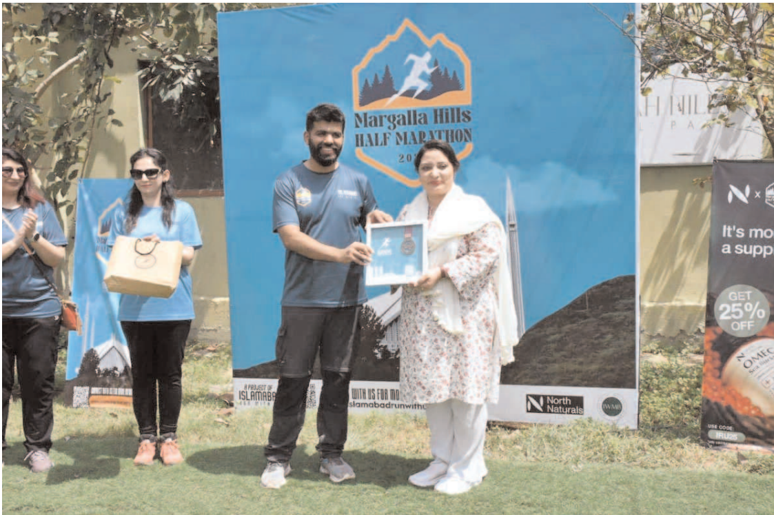
ISLAMABAD: PM'S coordinator on climate change & Environmental coordination Romina Khurshid Alam awarding medal to the winner in Margalla Hills Half Marathon, held at MHNP.