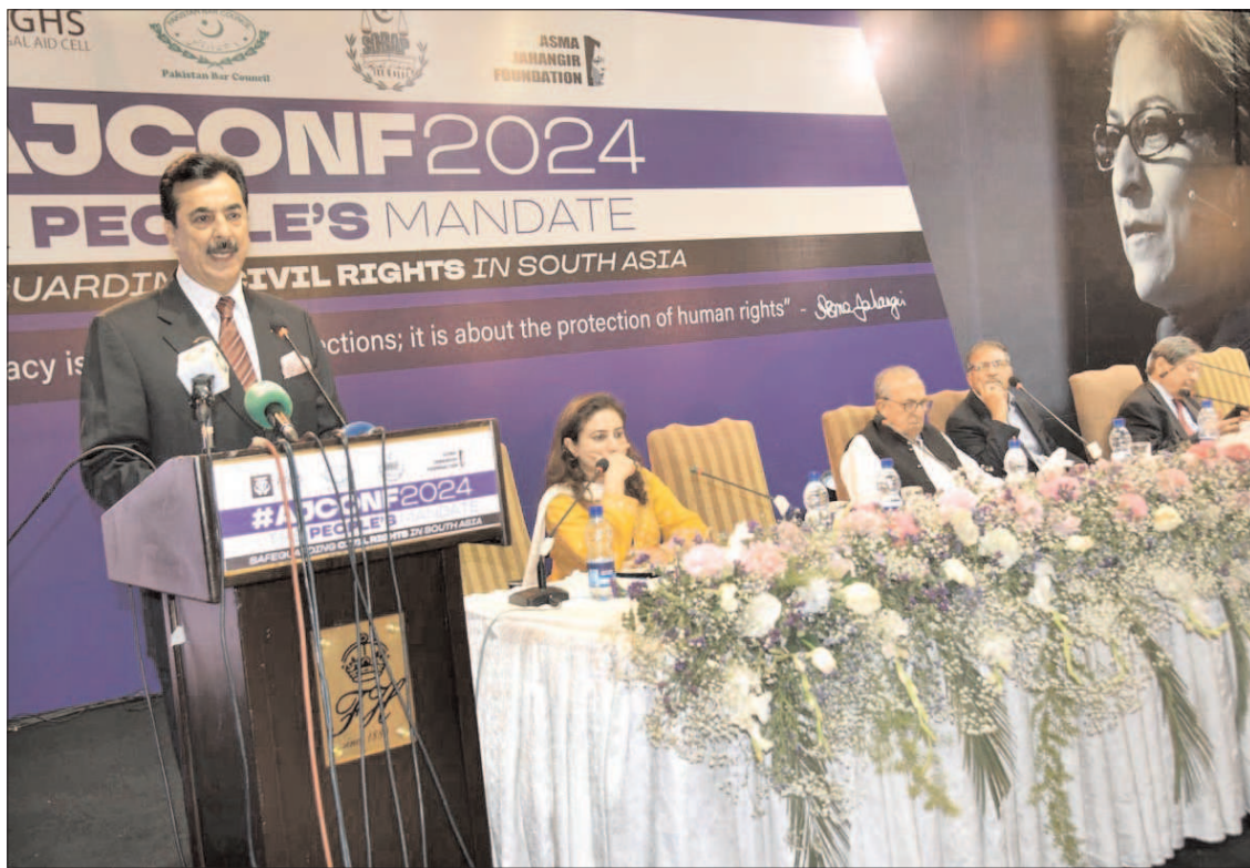
LAHORE: Chairman Senate, Syed Yusuf Raza Gillani addressing to Asma Jahangir conference.