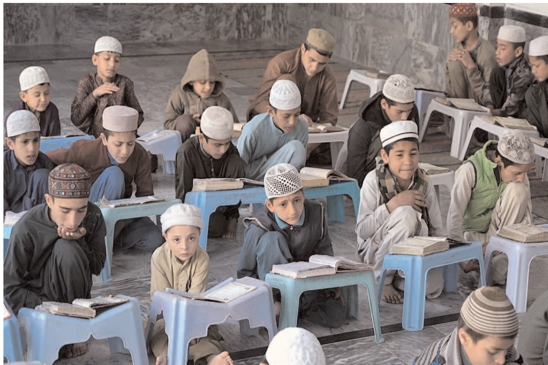
RAWALPINDI: Madrasa students reciting holy Quran during fasting month of Ramadan at Jamia Anwaar ul Aloom near Banni chowk.