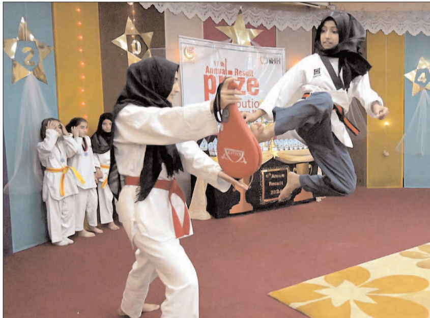
SARGODHA: Students showing their skills in Taekwondo during Annual Prize Distribution Ceremony of Khabib Girls School and College.

England begin the defence of the trophy against Scotland in Barbados on 4 June, before further group matches against Australia, Oman, and Namibia.