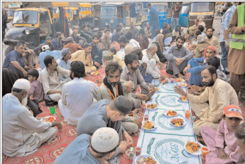
HYDERABAD: People break their fast on iftar during holy fasting month of Ramazan at Hyder Chowk.

According to a police report, the robbers were looting people in the city when a Kandhkot A-section police team rushed to the scene, where encounter took place there. During crossfire for some time, the police succeeded to capture two robbers in injured condition, however, their one accomplice escaped from the scene.