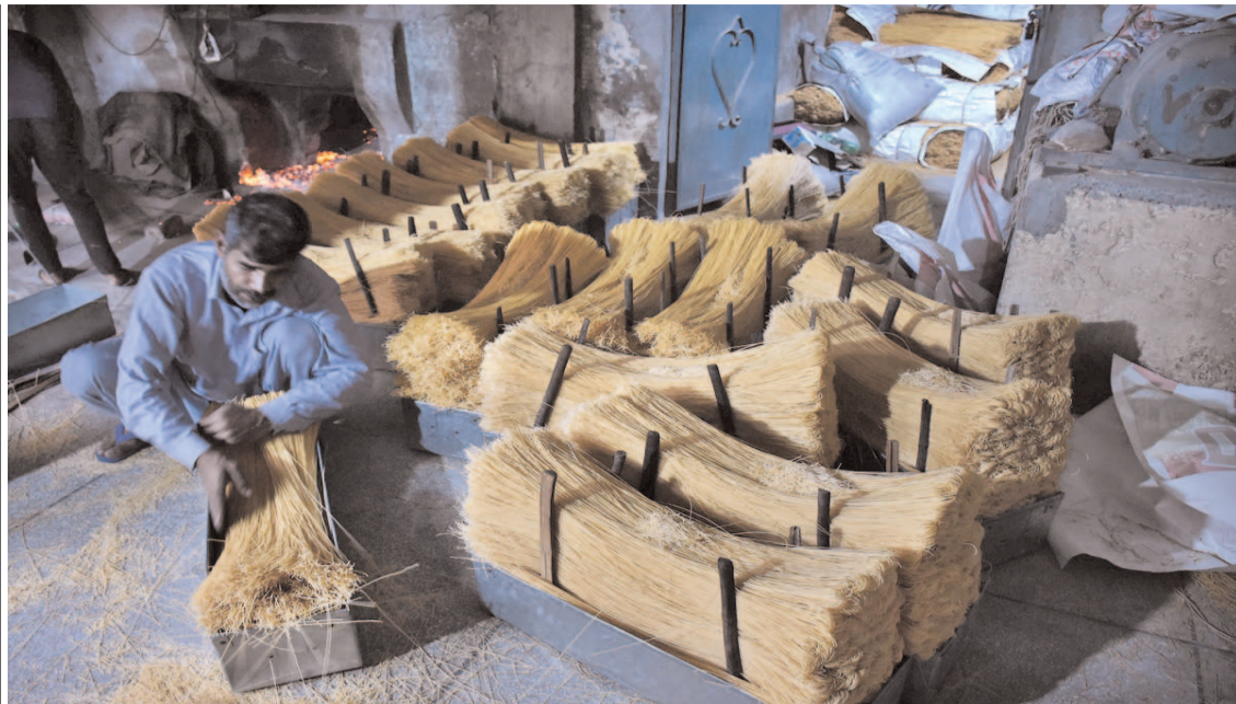
LAHORE: Worker packing vermicelli at his workplace for supply as per increasing demand for upcoming Eidul Fitr festive.