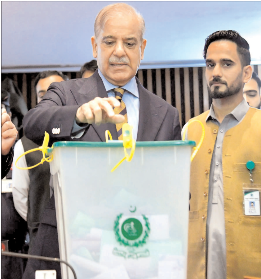
ISLAMABAD: Prime Minister Shehbaz Sharif casting his vote at the Senate elections at Parliament House.