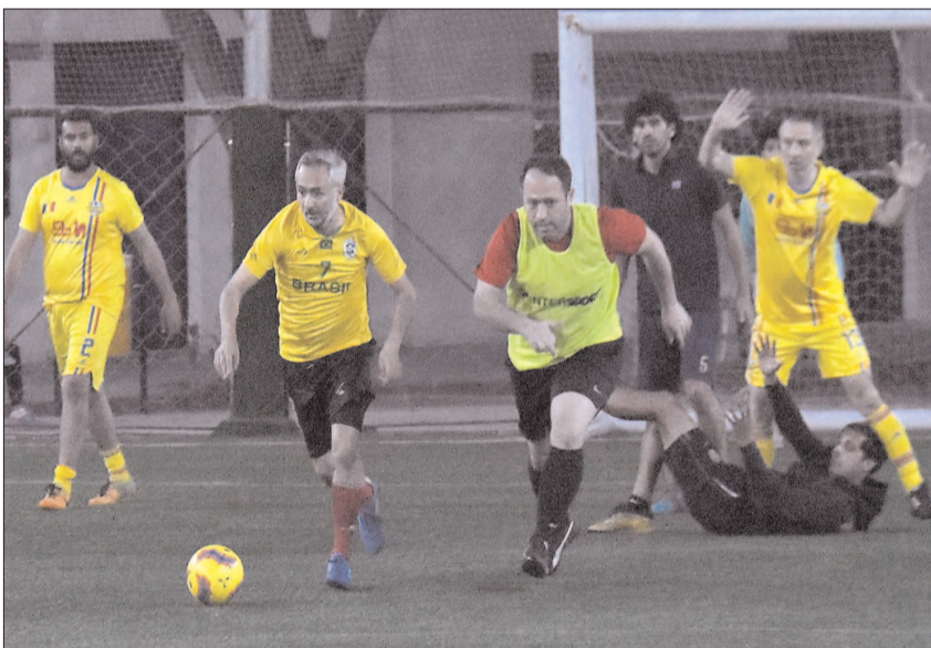
ISLAMABAD: A view of the final match between Romina and KB during Diplomatic Ramadan Tournament at Iqra University.

Jayasuriya was unbeaten on 28 when the declaration came, along with Vishwa Fernando, who was eight not out. Debutant pace bowler Hasan Mahmud finished with 4-65 for Bangladesh. Sri Lanka were missing Dinesh Chandimal in the field after he returned home for a family emergency. Sri Lanka, who have never lost a Test series to Bangladesh, thrashed the hosts by 328 runs in the first Test at Sylhet.