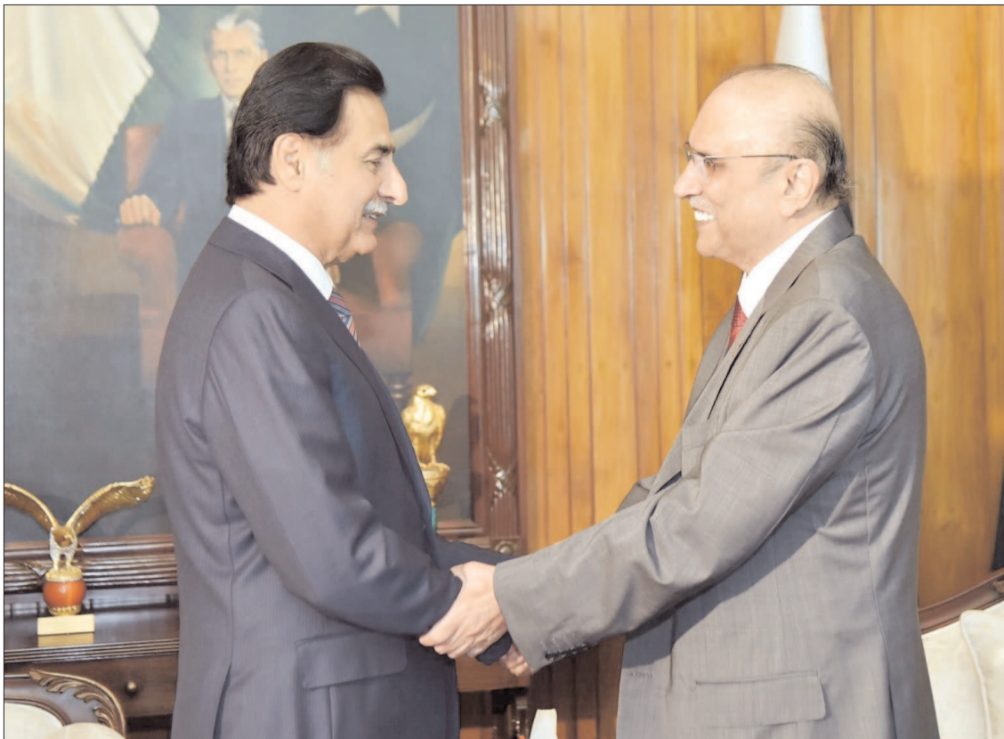
ISLAMABAD: Speaker National Assembly, Sardar Ayaz Sadiq shaking hands with President Asif Ali Zardari prior to a meeting.