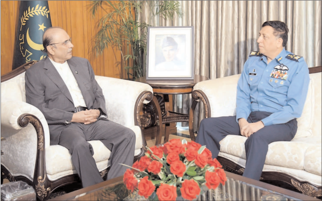
ISLAMABAD: Chief of the Air Staff, Air Chief Marshal Zaheer Ahmed Baber Sidhu, called on President Asif Ali Zardari, at Aiwan-e-Sadr.