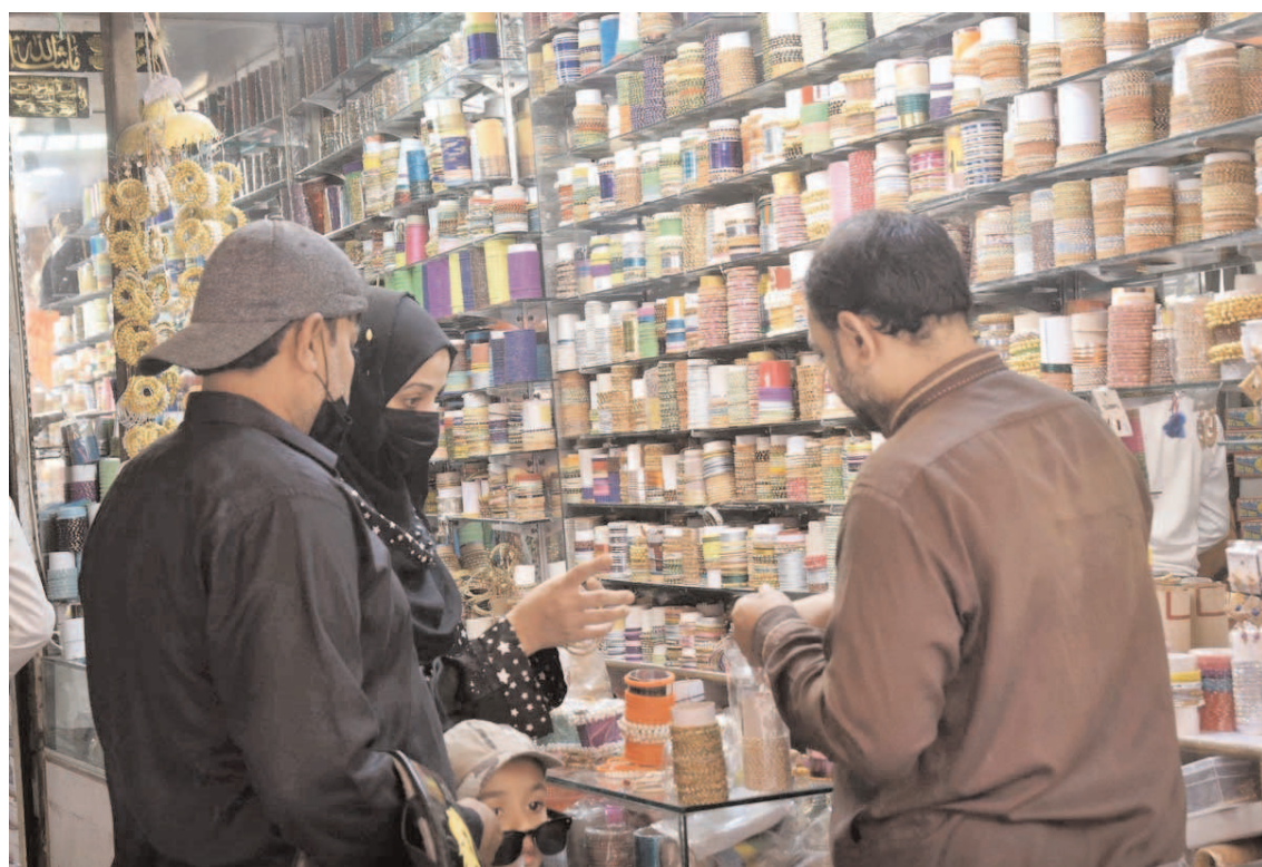
LAHORE: In preparations for Eid-ul-Fitr, women selecting bangles to buy.