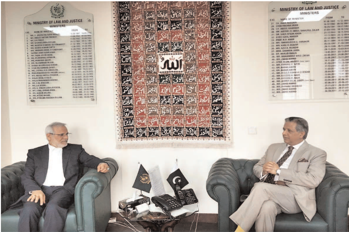
ISLAMABAD: Meeting of the Iranian delegation with the Minister for Law and Justice, Senator Azam Nazeer Tarar at Law Ministry.