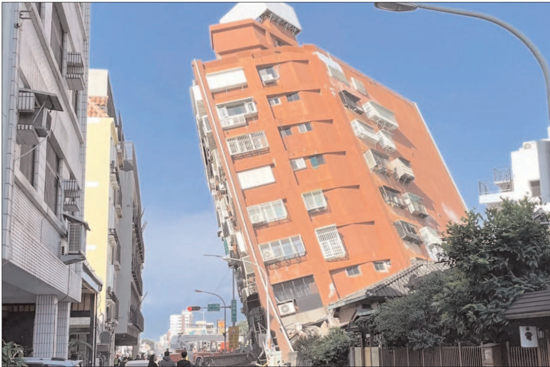
BANGKOK: A damaged building in Hualien, after a major earthquake hit Taiwan's east.