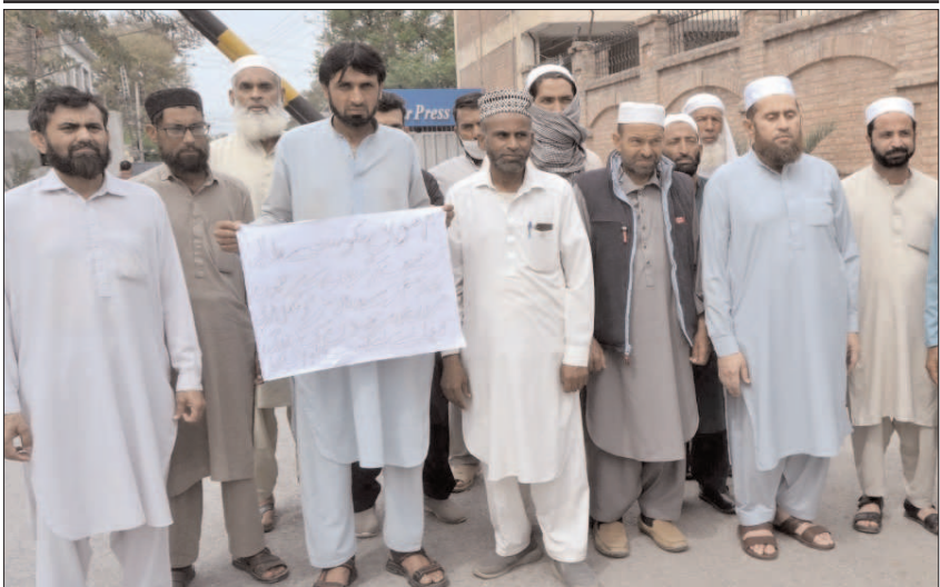
PESHAWAR: Kidney patients holding a placard during a protest in favour of their demands.

He said, during the last 24 hours, the lowest temperature in Kalam was minus 1 centigrade recorded with Malam Jabba 3, Dir 6, Darosh 7, Charat 9 while Chitral recorded 7 degrees Celsius, Peshawar recorded a minimum of 16 and a maximum of 27 degrees Celsius.