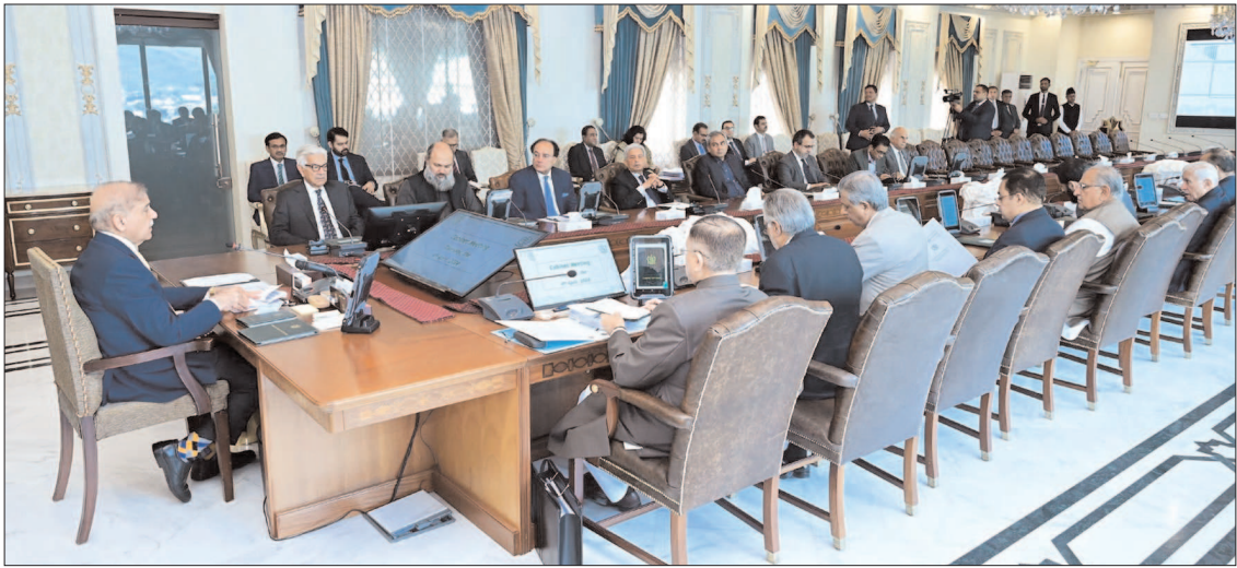
ISLAMABAD: Prime Minister Shehbaz Sharif chairing a meeting of federal cabinet.

Vol. XXXIXI No. 74 Regd. No. 241 RAMAZAN 25 1445 – FRIDAY, APRIL 05 2024 PESHAWAR EDITION 12 PAGES PRICE. 30