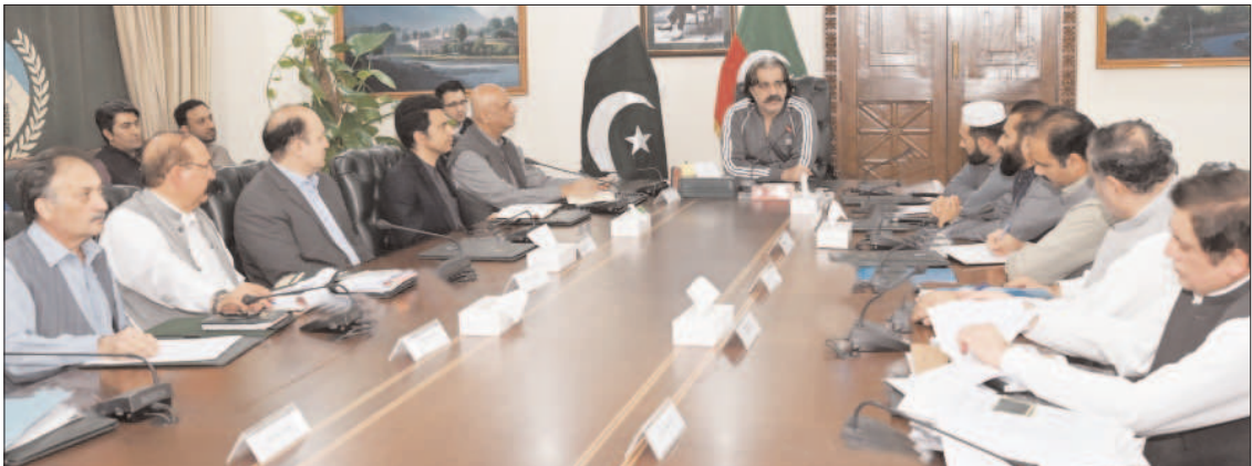
PESHAWAR: Chief Minister of Khyber Pakhtunkhwa, Ali Amin Gandapur chairing a meeting of Irrigation Department.