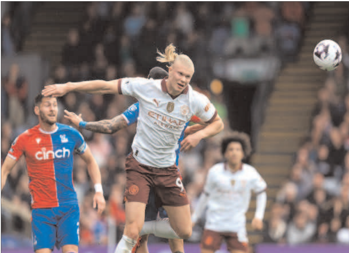
LONDON: Erling Haaland of Manchester City during the Premier League match between Crystal Palace and Manchester City at Selhurst Park.

LAHORE (Monitoring Desk): The Pakistan Cricket Board (PCB) has decided to appoint local coaches for the upcoming T20 series against New Zealand. Sources within the PCB revealed that Muhammad Yousaf is being considered for the role of head coach for the national team. Muhammad Yousaf, a former captain, currently serves as the head coach of the national under-19 and under-10 teams. His extensive experience both as a player and a coach makes him a strong contender for the coveted position.