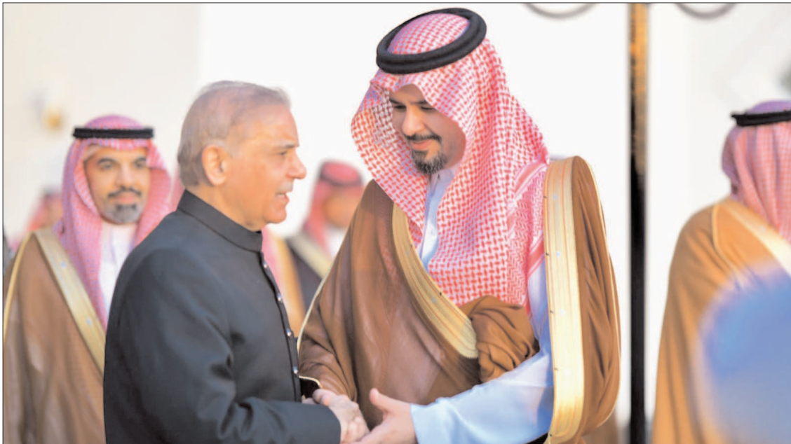
MADINAH MUNAWARAH: Prime Minister Shehbaz Sharif being received by Governor of Madinah Prince Salman bin Sultan Al Saud at Airport.