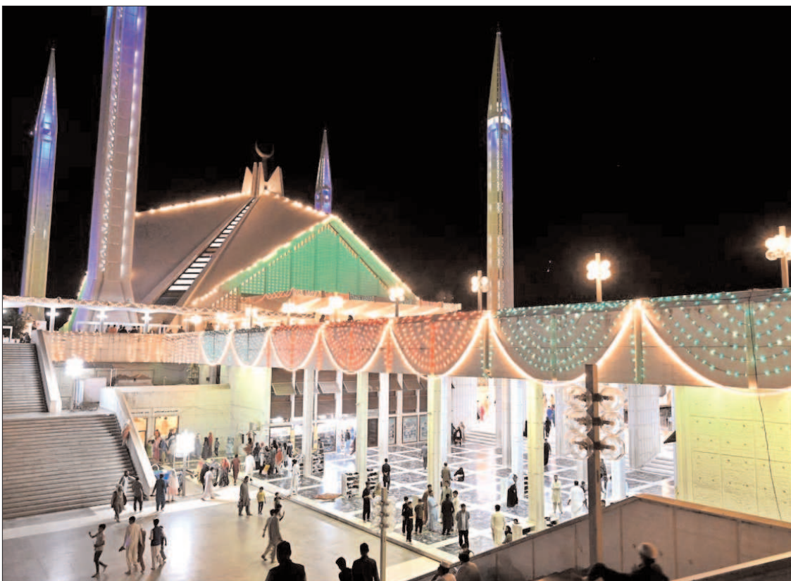
ISLAMABAD: An illuminated view of Faisal Masjid decorated with colourful lights in connection with Shab-e-Qadar on 27th day of Holy fasting month of Ramzanul Mubarak.

Punjab Police Spokesman said that 43 ASIs were promoted to sub-inspector rank while 24 head constables were promoted to ASI rank in Rawalpindi region. In DG Khan region, 27 ASIs were promoted to sub-inspector and 27 constables were promoted to the rank of head constable, the cases of 64 ASIs and 50 constables were considered in DG Khan Promotion Board.