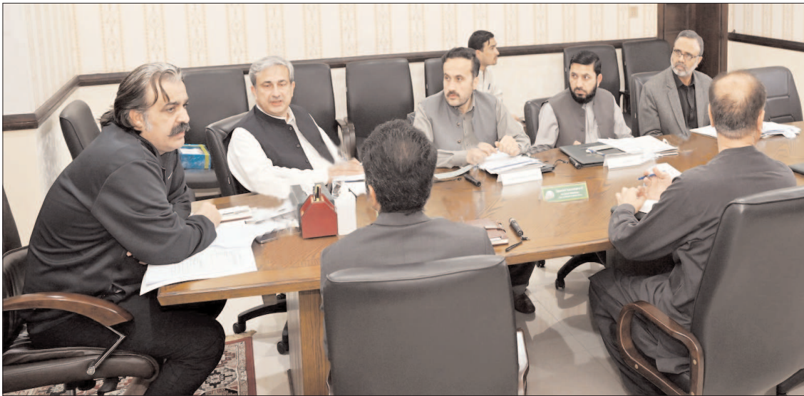
PESHAWAR: Chief Minister of Khyber Pakhtunkhwa, Ali Amin Khan Gandapur chairing a meeting of Prisons Department.