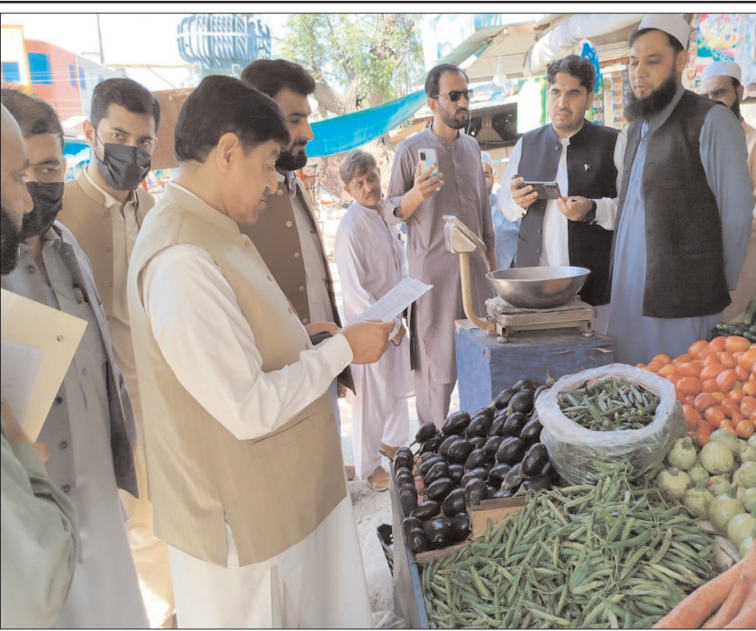
PESHAWAR: KP Minister for Food inspecting price list during his visit to local market.

Additionally, promoting greater collaboration and knowledge sharing between international and local researchers can facilitate the development of holistic and contextually relevant solutions to the challenges of forced migration in Pakistan.