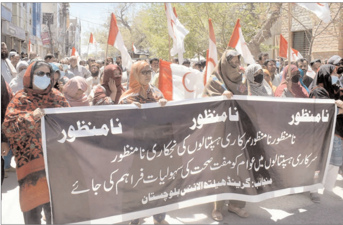
QUETTA: Activists of Grand Health Alliance holding a banner during a protest for acceptance of their demands.