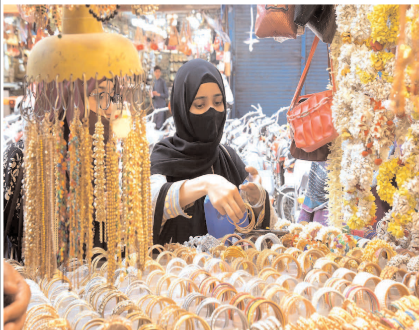
LAHORE: Waomen selecting Artificial jewelry in connection with preparations for Eid-ul-Fitr.