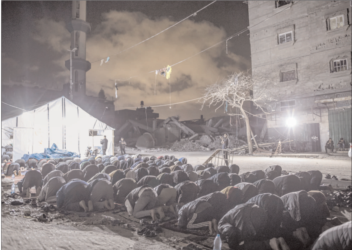
GAZA: Palestinians gather to pray on the night of Laylat Ul-Qadr near the debris of al-Faruq Mosque in Rafah.