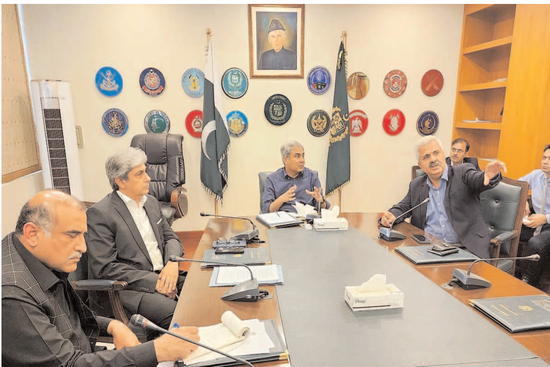
ISLAMABAD: Federal Minister for Interior Mohsin Naqvi chairing a meeting regarding security of foreign nationals.

ISLAMABAD (APP): Indus River System Authority (IRSA) on Saturday released 85,000 cusecs water from various rim stations with inflow of 84,500 cusecs. According to the data released by IRSA, the water level in River Indus at Tarbela Dam was 1420.31 feet and was 22.31 feet higher than its dead level of 1,398 feet. The water inflow and outflow in the dam was recorded as 19,100 cusecs and 30,000 cusecs respectively. The water level in River Jhelum at Mangla Dam was 1099.80 feet, which was 49.80 feet higher than its dead level of 1,050 feet. The inflow and outflow of water was recorded 30,500 cusecs and 20,000 cusecs respectively.