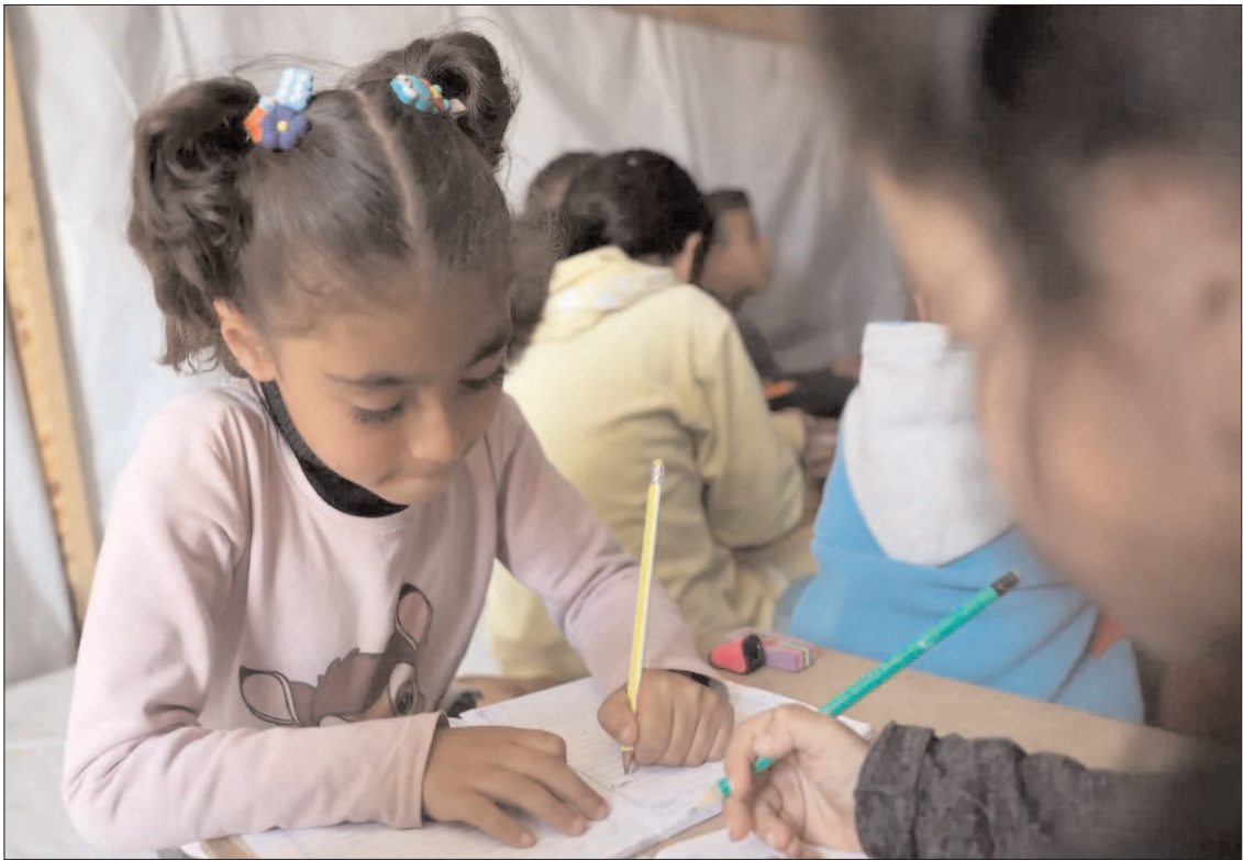
GAZA: Children studing in a makeshift classroom at a camp for displaced Palestinians in Rafah.