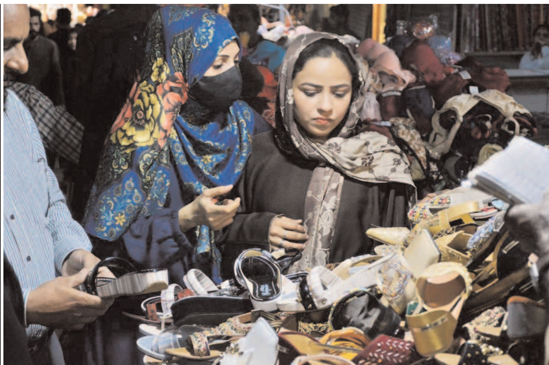
HYDERABAD: Women selecting and purchasing sandals from vendor in preparations of upcoming Eidul Fitr.