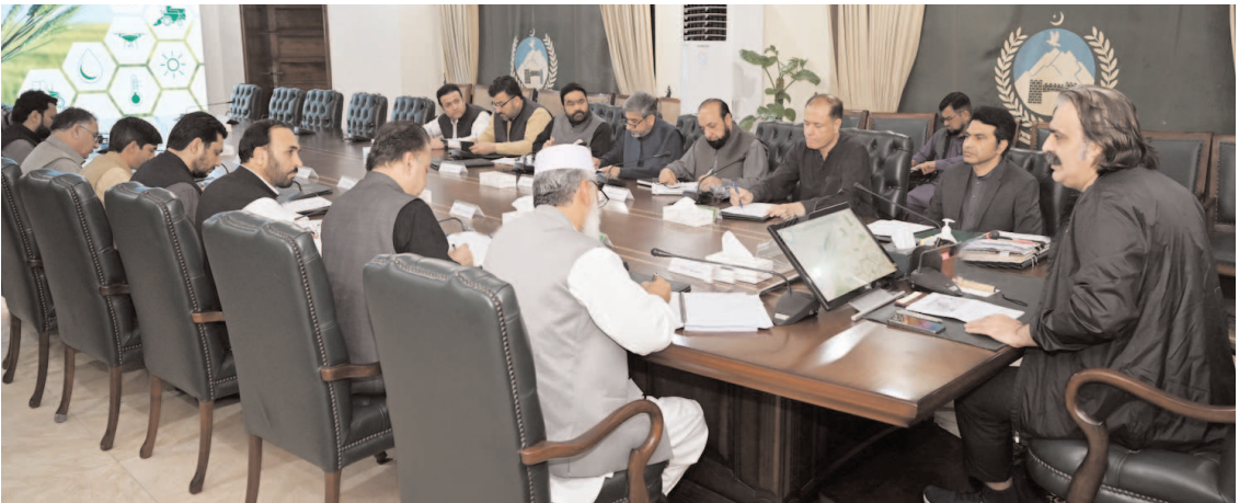
PESHAWAR: Chief Minister Khyber Pakhtunkhwa Ali Amin Khan Gandapur chairing a meeting of Agriculture Department.

"The selection of quality bangles and henna are very difficult task as new brands and variety comes to markets. "I finally purchased 10 sets of bangles and henna for myself and family following my three hours long shopping," she added. "The wearing of new and crystal bangles and decorating hands with henna on Eid Day gives me immense pleasure and joy on Eid Day," Anmol remarked. There are shops in the city, which are selling Punjabi garments with a variety of designs and colours designed locally. It appears that the shopping activities would further gain pace in the markets as Eid-ul-Fitr advent became further closer.