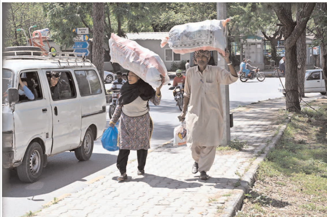
ISLAMABAD: An elderly couple on the way carrying bags on their head in Federal Capital.

The spokesman informed that more than 25 rescue personnel along with 5 fire tenders participated in successful rescue and fire fighting operation.