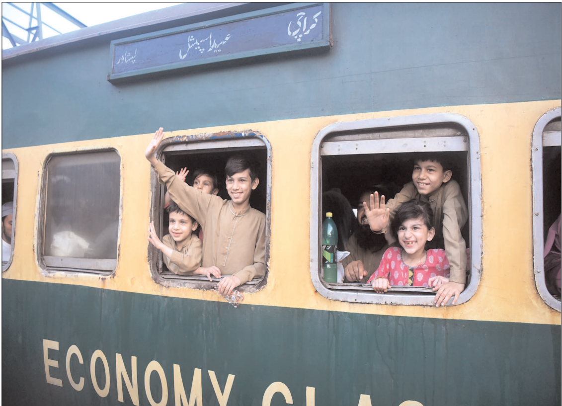
KARACHI: Children waving hands after getting board on Eid Special Train at Cantt Railway Station, departing to their home towns for celebrating Eidul Fitr, festive.