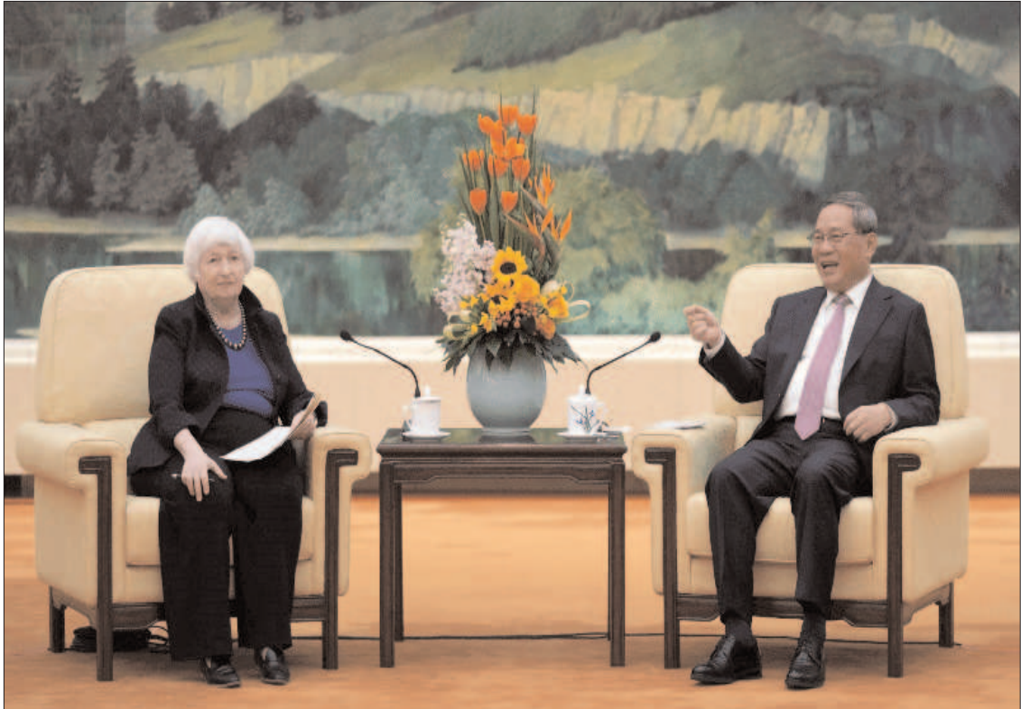
BEIJING: US Treasury Secretary Janet Yellen (L) meets with Chinese Premier Li Qiang at the Great Hall of the People in Beijing.