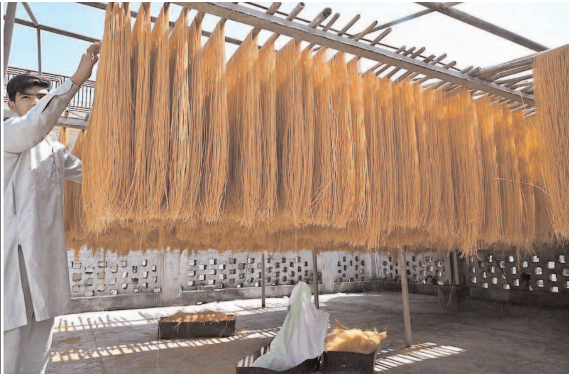
RAWALPINDI: A worker hanging vermicelli for dry at his workplace as demand increased for upcoming Eidul Fitr Festival.

govt. He has demanded the government to take back the decision of hike in gas tariff in the larger interest of national economy and to save the industries from collapse. He warned that in case, the decision is not withdrawn; the industries will close down, resulting in decline in exports and mass unemployment. In an appeal, he said that the business community was given assurance for 9 cents per KWh electricity tariff by the caretaker government. The assurance brought a sigh of relief and hope for the business community that the new tariff will help in reduction of production cost and they will be able to continue production unabated and deliver export orders on time. However, contrary to the assurance given, POL, electricity and gas tariff are being increased constantly by the caretaker government. He said that current-