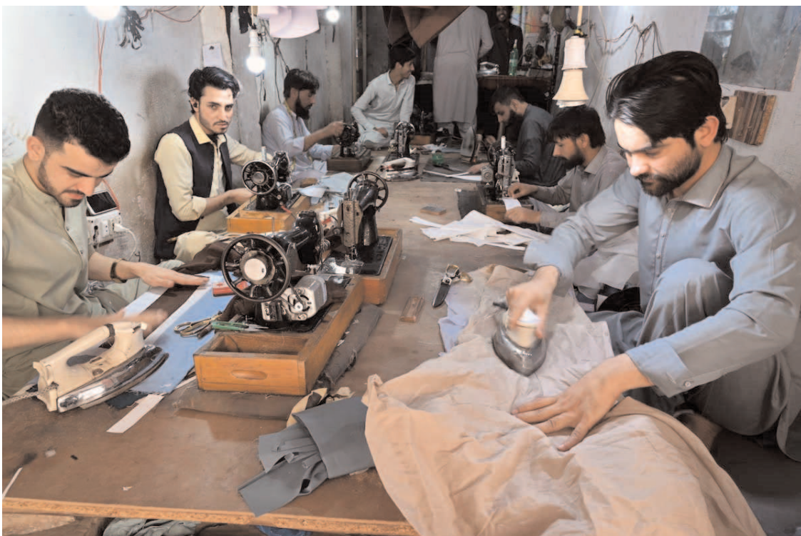
ISLAMABAD: Tailors are busy in stitching clothes at their workplace in Islampura in connection with upcoming Eidul Fitr.

RAWALPINDI (APP): Waste Management Company had finalized a comprehensive plan to make the city neat and clean during Eid-ul-Fitr days. According to the RWMC spokesman, the department has cancelled the Eid holidays of sanitary workers and officials of the department to ensure cleanliness during the three days of Eid from Chand Raat. He said that a special cleaning campaign had been started around all the mosques, and Eidgahs while mechanical sweeping and washing of roads was being done. He said that all graveyards of Rawalpindi and its tehsils would be provided special services and the surroundings would be kept free from waste during these days while sanitary workers would be deployed in parks and recreational places across the city to ensure the waste picking, adding lime powder would also be sprinkled around all masjids, Eidgahs and public places. He said the cleanliness of bazaars and commercial areas would also be maintained on Chand Raat and Eid days. The spokesman informed that all collected waste would be lifted before the Eid prayers. He said after completion of the cleanliness task, all collection points and other areas would be cleaned properly and sprayed. He appealed to the citizens not to throw garbage and plastic bags in nullahs, drains and open, which cause obstruction.