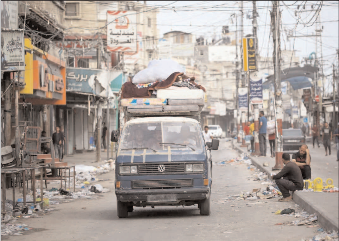
GAZA STRIP: Palestinians transport their belongings on the back of a van as they flee Rafah to a safer location.