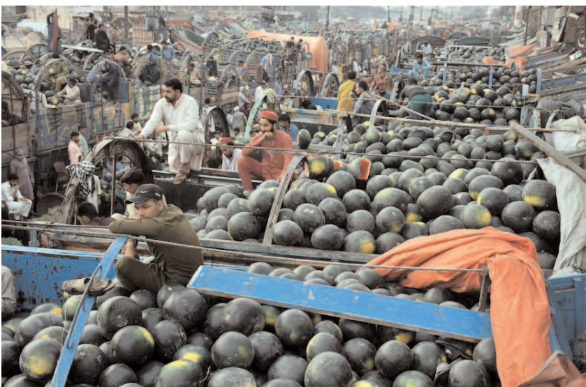
LAHORE: Traders and farmers sit on trucks loaded with watermelon as they bargain with dealers during auction as shopkeepers participating in bidding of fruit (watermelon) at fruit market.

"However, consumer prices remain low and the industrial manufacturing sector is still under pressure, reflecting insufficient effective demand and that recovery in the sector is still not sufficiently balanced."