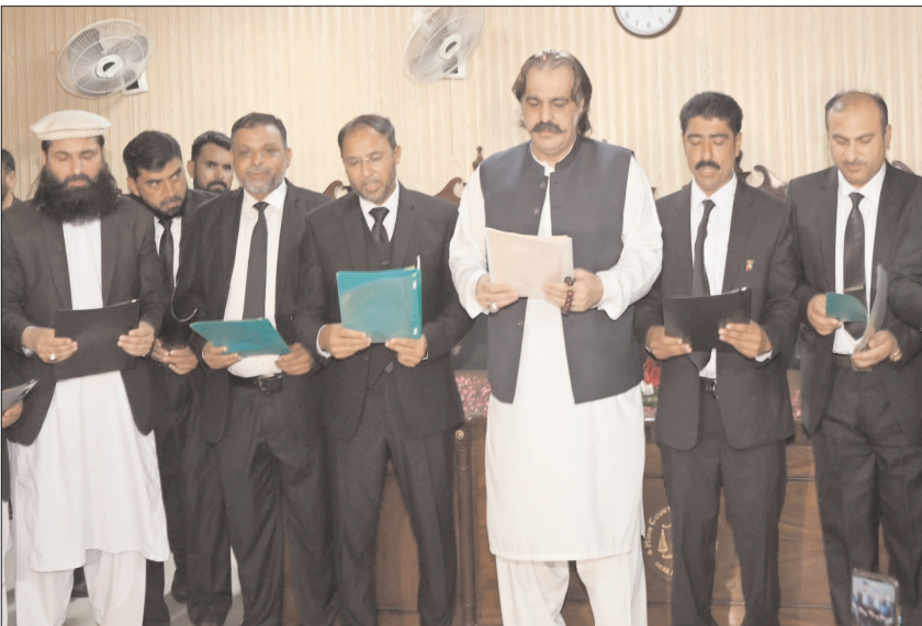
D I KHAN: Chief Minister of Khyber Pakhtunkhwa, Ali Amin Gandapur administering oath to newly elected cabinet of High Court Bar Association D I Khan.

well how to deal with the people like Gandapur. "The security of Governor House is my responsibility and I'll protect it at any cost," said Kundi. A day earlier, Kundi has said that he would not impose the governor's rule in KP. "I'll not make him a political orphan by imposing the governor's rule," he said. I want to talk about the rights of KP with the centre and the provincial government should support me in this cause, he added.