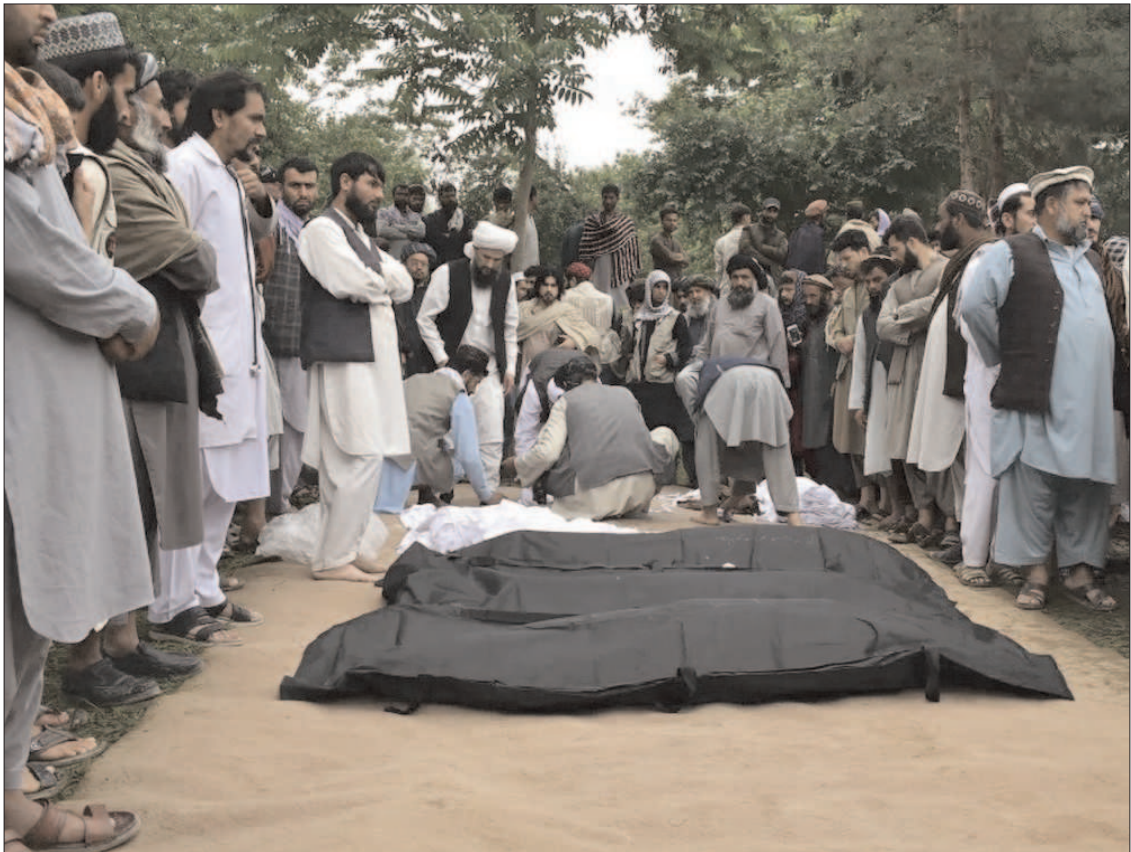
BAGHLAN: Dead bodies of Afghan people are placed on the ground after heavy flooding in northern Afghanistan.

Vol. XXXIXI No. 109 Regd. No. 241 ZIQAAD 03 1445 -- SUNDAY, MAY 12 2024 PESHAWAR EDITION 12 PAGES PRICE. 30