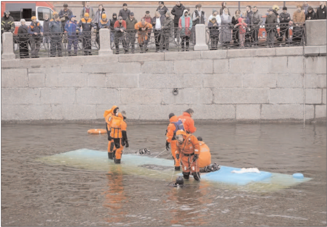
ST. PETERSBURG: Emergency responders work to recover victims of a bus crash in this Russia city.