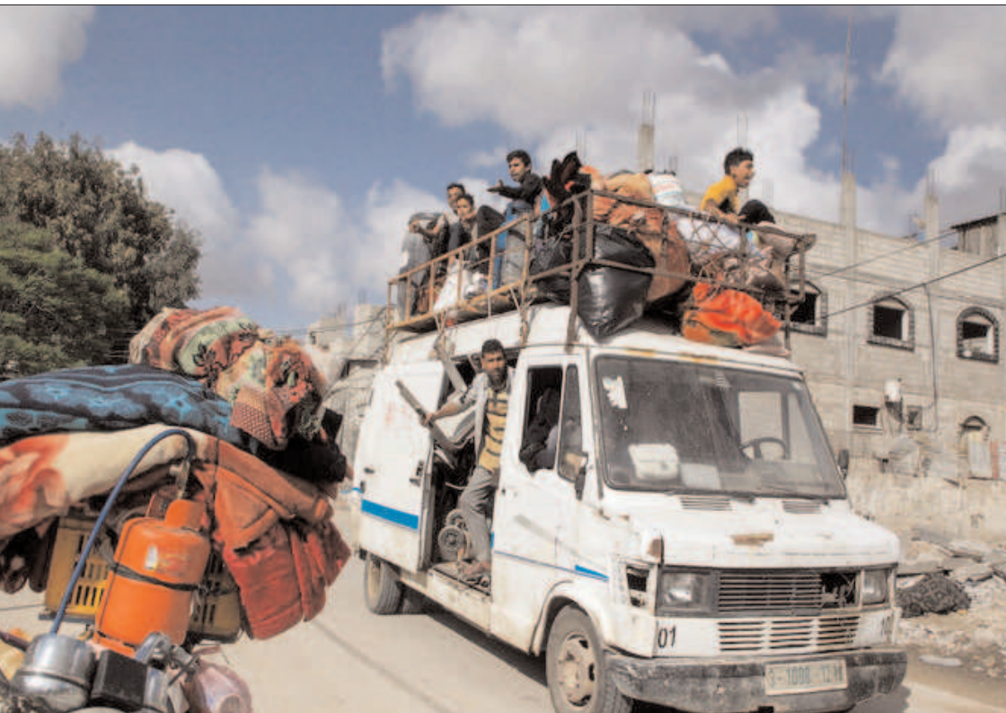
RAFAH: Israeli strikes on Gaza continued on Sunday after it expanded an evacuation order for Rafah despite international outcry over its military incursion into eastern areas of the city.

In case of critical condition, the patient is referred to Saudi hospitals where they are provided with all kinds of treatment and even surgeries free of cost, in addition to making arrangements to complete their obligatory Hajj acts through different means, including air ambulance.