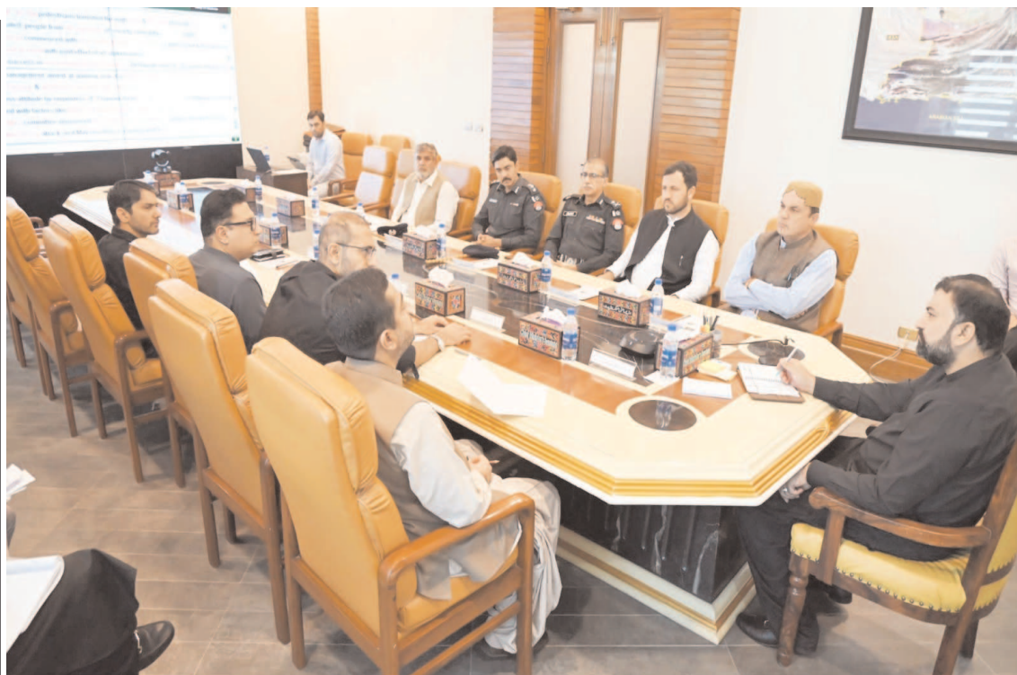
QUETTA: Chief Minister Balochistan Mir Sarfraz Bugti chairing high level meeting on security at Afghan border.

MARDAN: Severe differences surfaced in Awami National Party (Mardan chapter) as one the party tehsil urban general secretary has resigned from party basic membership and his office here on Sunday.