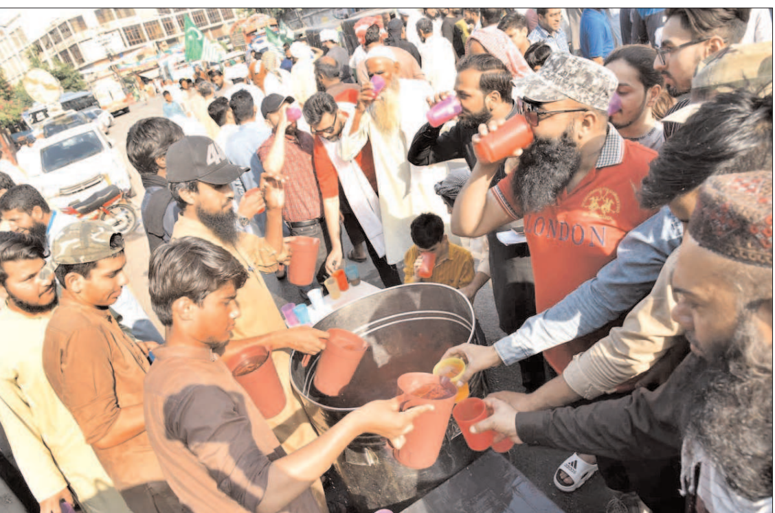
LAHORE: People drinking thirst-quenching cold drinks outside the press club to reduce the intensity of the heat.

more nurses still needed, especially in low- and middle-income countries. Sharmila said that the Covid-19 pandemic is a stark reminder of the vital role nurses play. Without nurses and other health workers, we will not win the battle against outbreaks, we will not achieve the Sustainable Development Goals or universal health coverage." "By developing our nursing workforces, we can achieve the triple impact of improving health, promoting gender equality and supporting economic growth. Strengthening nursing will have the additional benefits of promoting gender equity (SDG5), contributing to economic development (SDG8) and supporting other Sustainable Development Goals," she concluded.