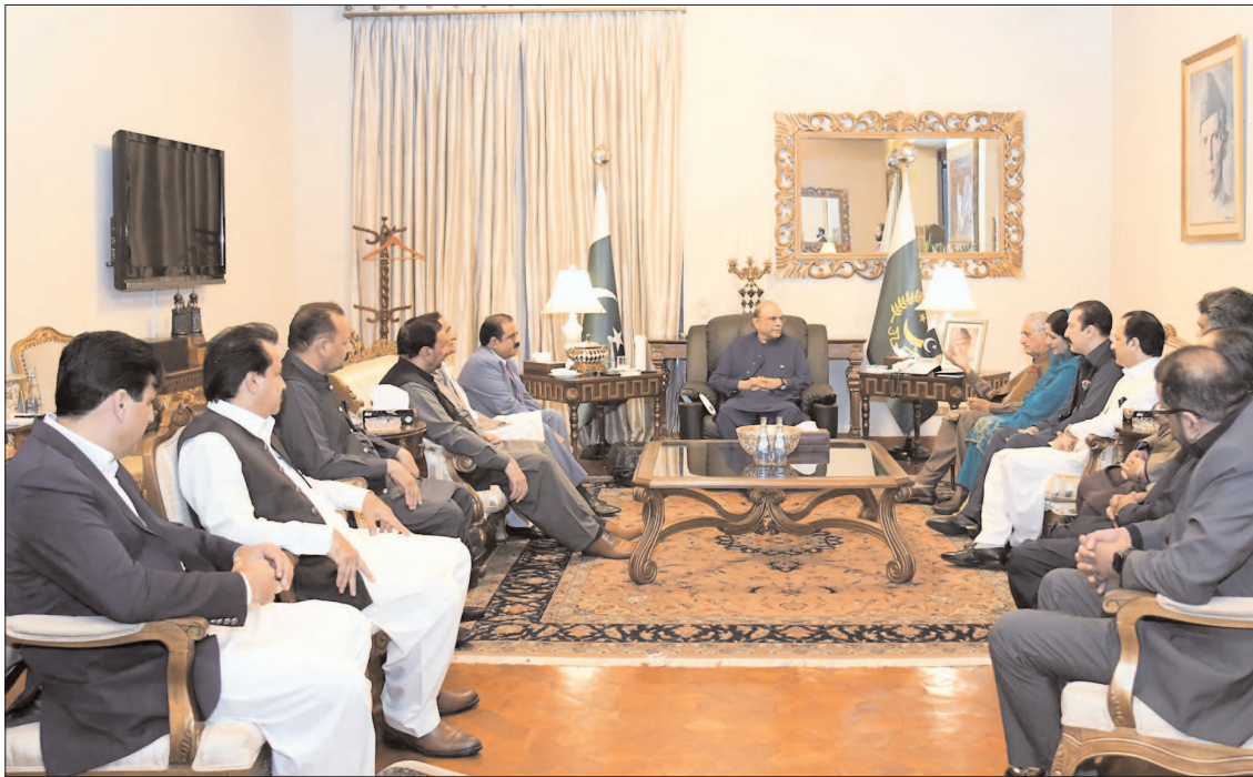
ISLAMABAD: A delegation of the Azad Jammu and Kashmir Legislative Assembly, belonging to PPP called on President Asif Ali Zardari at Aiwan-e-Sadr.