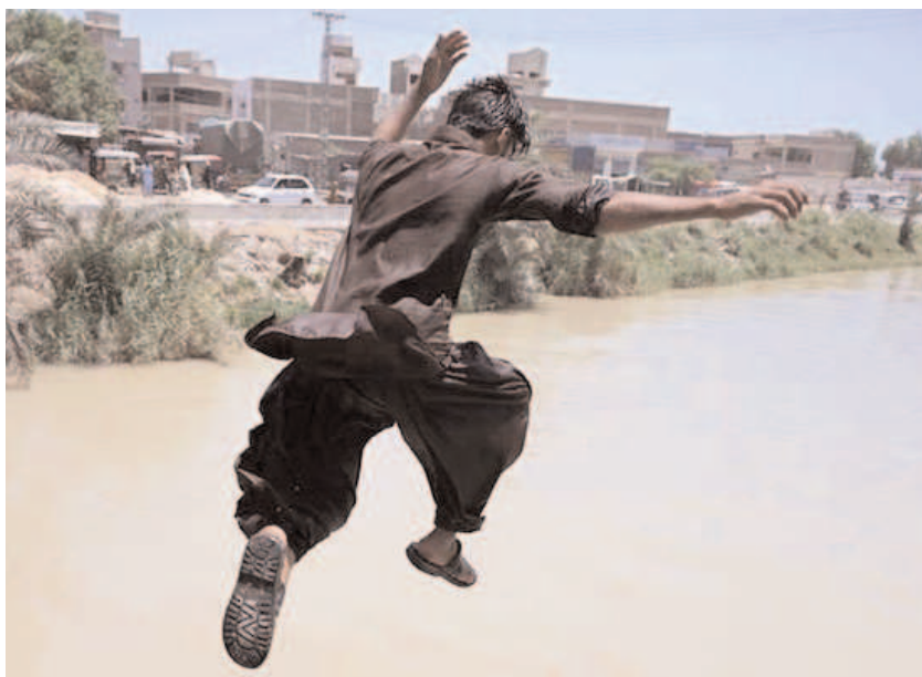
HYDERABAD: Youngsters jumping and bathing in the canal to get relief from hot weather in the city.

Long queues of vehicles were seen on the road due to road blockade. The protesters were demanding immediate arrest of the persons involved in the firing. A heavy contingent of police reached the site and registered cases against seven accused. Later the protesters dispersed peacefully.