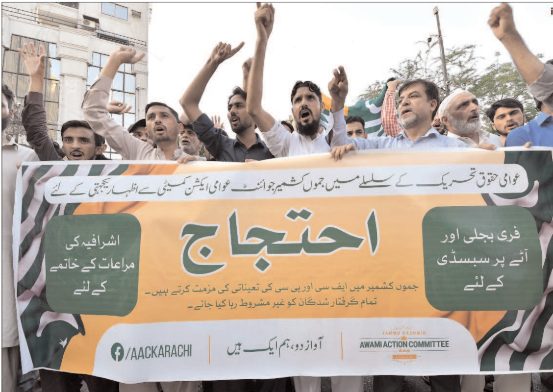
KARACHI: Kashmiri residents in Karachi hold a protest in favor of their demands outside KPC.