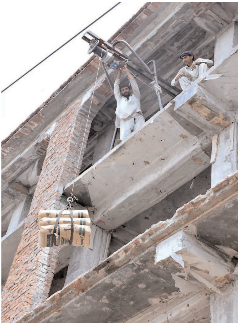
SIALKOT: Laborers busy moving building material from the ground to the third floor using lift.

Dr. Buledi urged nurses and women staff who face harassment to contact the Anti-Harassment Secretariat for support. The government will provide full assistance to affected nurses and women.