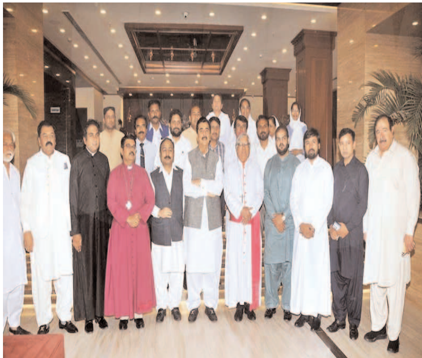
MULTAN: Chairman Senate Syed Yusuf Raza Gillani in a group photograph with Christian community after lunch.