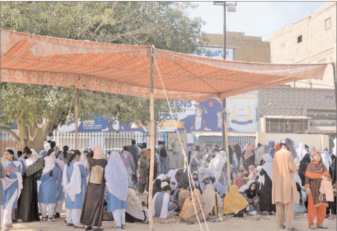
KARACHI: Students congregate outside the exam center and seeking shelter from the blistering sun beneath under the tent.