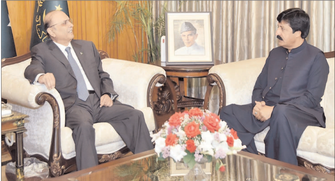
ISLAMABAD: Governor Punjab Sardar Saleem Haider Khan called on President Asif Ali Zardari, at Aiwan-e-Sadr.