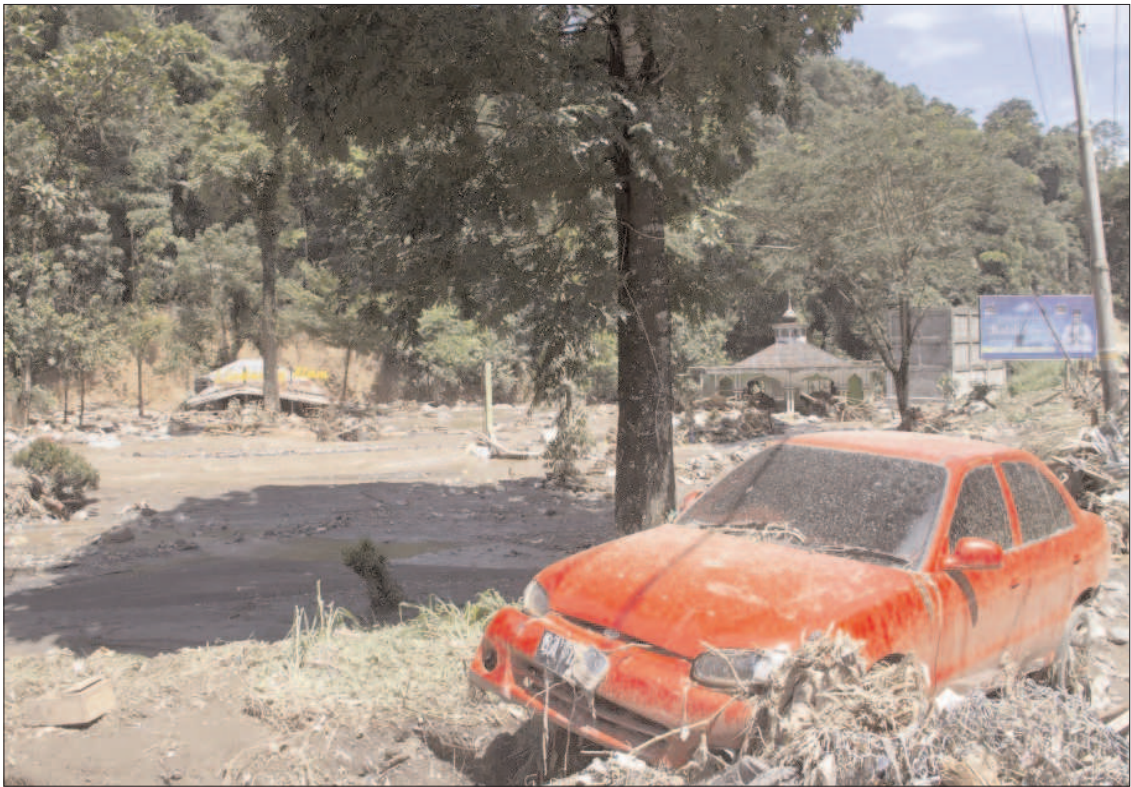
JAKARTA: Wreckage of a car lies in a village affected by a flash flood in Tanah Datar, West Sumatra, Indonesia after heavy rains.