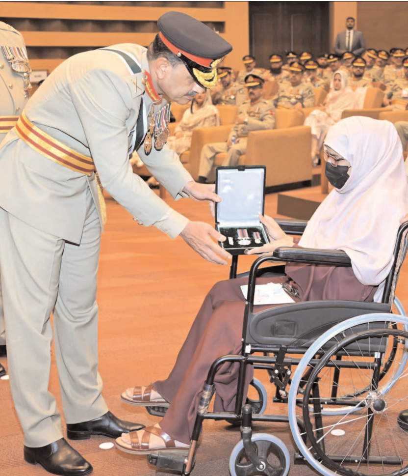
RAWALPINDI: General Syed Asim Munir, NI (M), Chief of Army Staff distributing military awards among the brave families of Shuhada.

He said Pakistan was still an agrarian economy and by using modern technologies, both countries could enhance cooperation to produce fruits, vegetables, wheat, sugarcane, and sunflower to convert them into value-added products and export to Gulf region and other countries. Similarly, Pakistan could help provide its skilled IT manpower to the Kingdom to help grow both economies. He said other countries like Kuwait, Qatar, UAE, Türkiye and China could also become partners in this fields and help bring an economic revolution in the country.