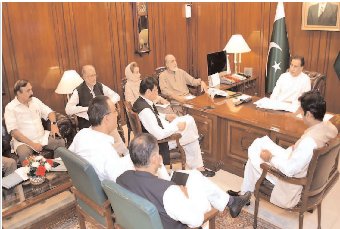
ISLAMABAD: Speaker National Assembly Sardar Ayaz Sadiq presiding the meeting to discuss matters related to present and upcoming Budget Session of National Assembly at Parliament House.

The Pakistan Army's initiatives in Darra Musa are part of its broader efforts to promote peace and stability in the region. By investing in education and healthcare, the army is helping to create a more prosperous and secure future for the people of Pakistan.