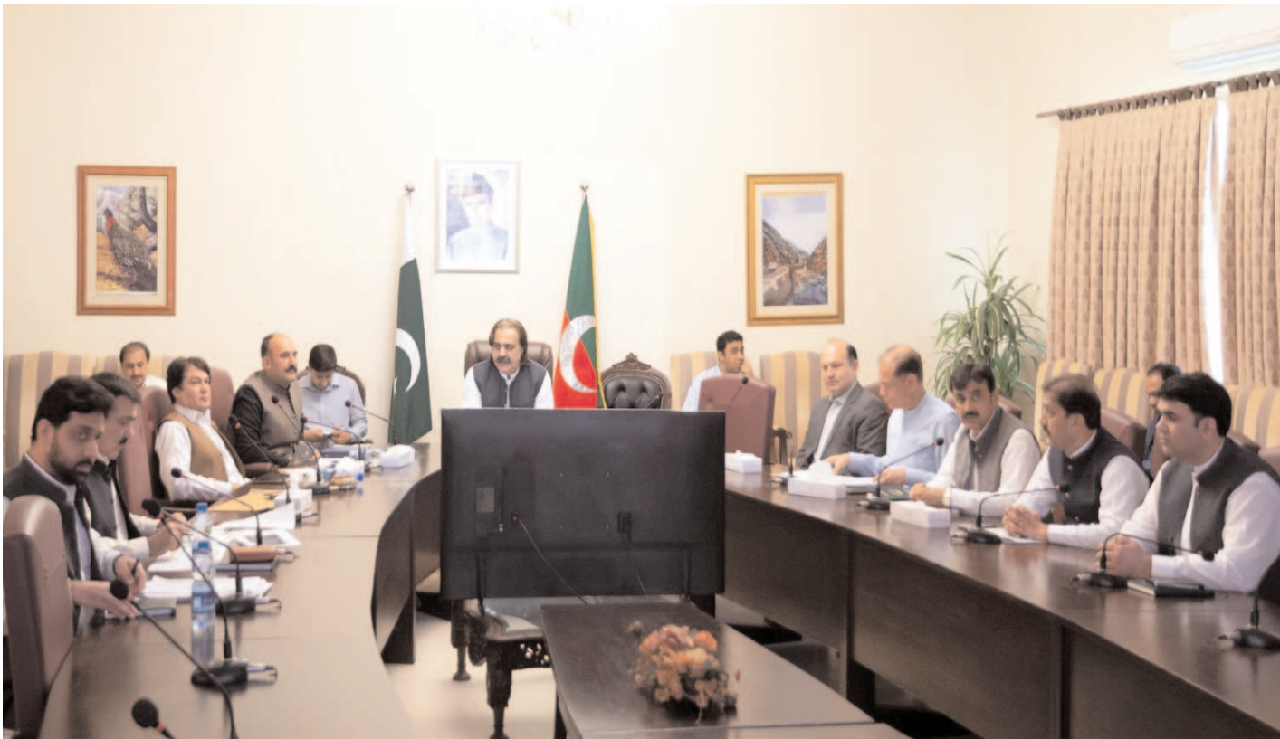
PESHAWAR: Khyber Pakhtunkhwa Chief Minister Sardar Ali Amin Gandapur chairing a meeting regarding draft Annual Development Program 2024-25