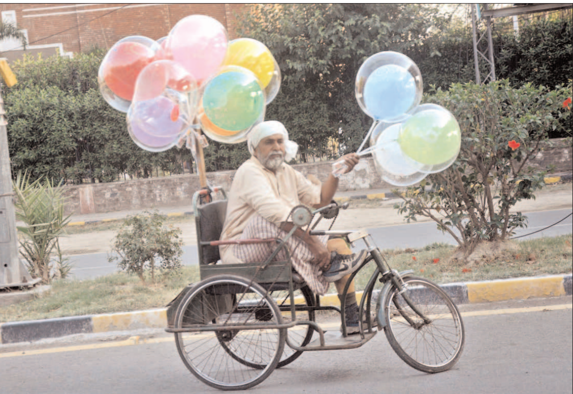
LAHORE: A disable vendor on the way on wheelchair tricycle selling balloons to earn livelihood.

LAHORE (INP): Two of a family including mother and son were shot dead by unidentified motorcycle riders who sped the scene here on Sunday, police said. According to details, unknown motorcyclists sprayed bullets at two people in Southern Cantonment of Lahore. As a result of firing, both mother and son were killed on the spot and assailants sped the scene.