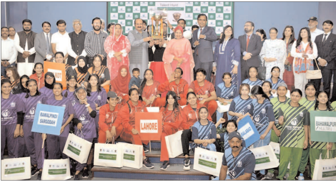
LAHORE: Chairman Prime Minister Youth Program Rana Mashhood Ahmed Khan in a group photograph with students participating in Talent Hunt Youth Sports Judo League at Lahore College for Women University.

It is worth mentioning here that Pakistan and Ireland are currently competing in a three-match series, levelled at 1-1 with a game to spare, in a build-up to the ICC Men's T20 World Cup 2024. The two sides will also lock horns in the mega event on June 16 at Central Broward Regional Park in Lauderdale.