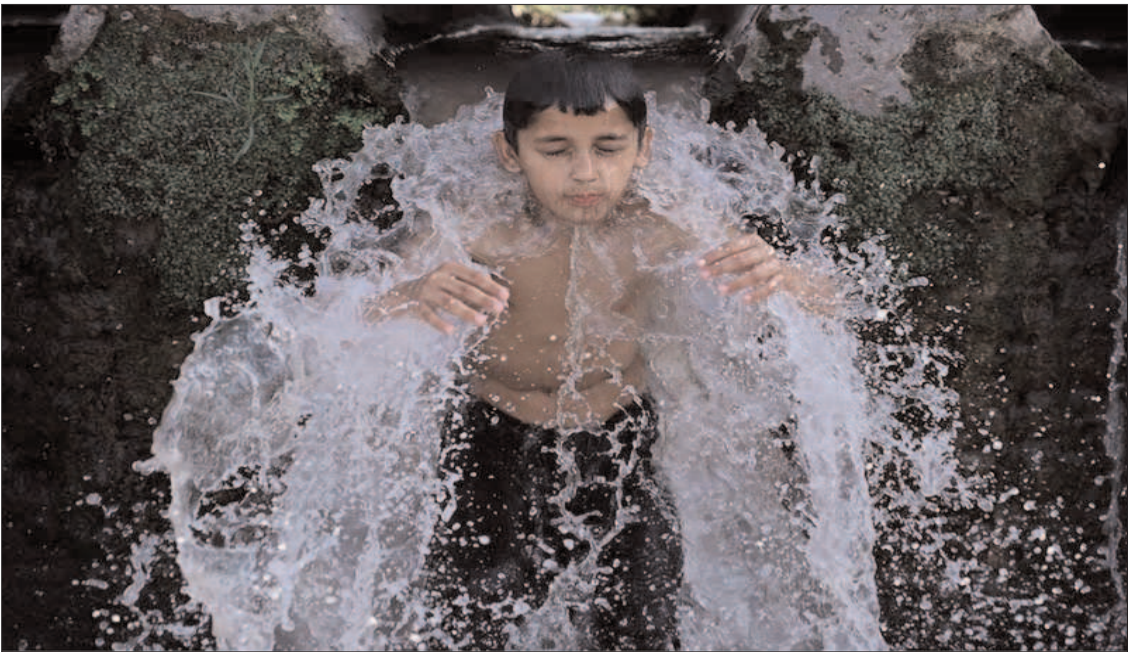
PESHAWAR: Youngster enjoying a bath in a stream to get some relief from hot weather at Musazai Inqilab road.