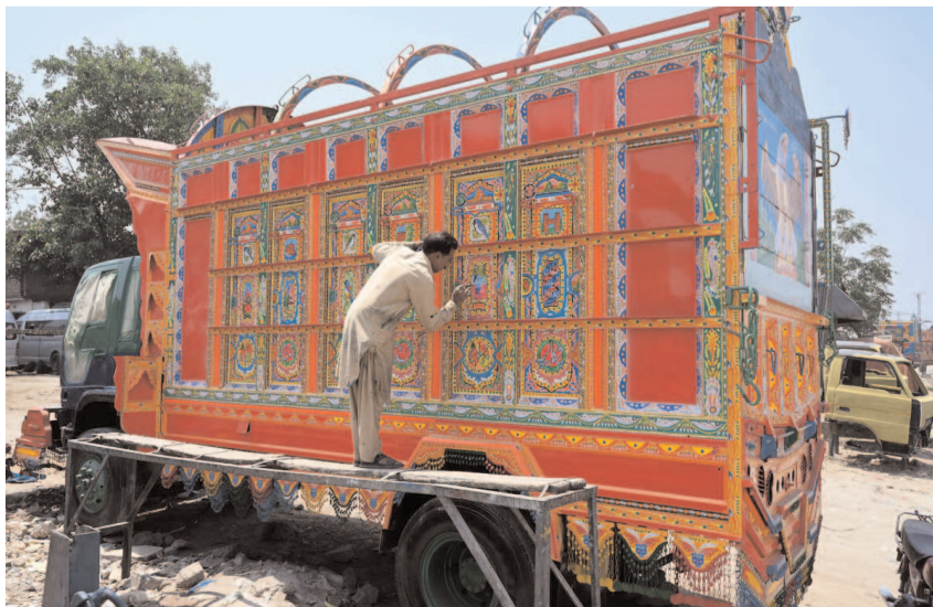
RAWALPINDI: A painter busy in painting the body of a delivery truck at his workplace at Pirwadhai IJP road.

He said that setting time limits on how long kids can stare at screens is the best way to keep them from getting eye problems. Every six months, a trained ophthalmologist should examine children's eyes, lubricant eye drops should be used, and the 20-20 rule must be followed. According to this rule, a person using a screen should shift his eyes to look at an object 20 feet away for at least 20 seconds and be repeated after a 20-minute gap.