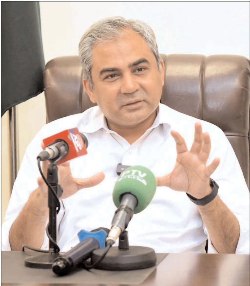
LAHORE: Federal Minister for Interior, Mohsin Naqvi talking to media at GOR.