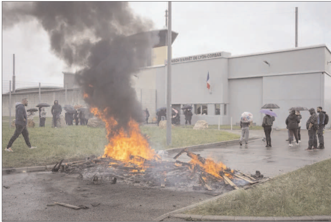
PARIS: Prison workers gathered during a protest outside the Corbas prison, outside Lyon. A massive manhunt was underway in France for an armed gang that ambushed a prison convoy, killing two prison officers, seriously injuring three others and springing the inmate they were escorting.

More than 35,000 Palestinians have been killed since the conflict began, and Israel's continued assault and siege on the territory has created a dire humanitarian crisis.