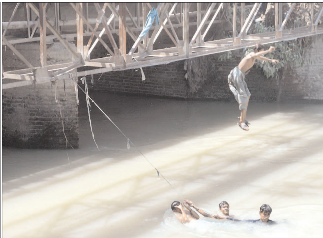
HYDERABAD: Youngsters bathing in canal to get relief from hot weather.