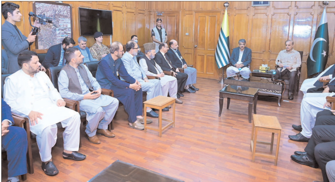
MUZAFFARABAD: A delegation of Hurreyyet leaders of Jammu and Kashmir called on Prime Minister Shehbaz Sharif.