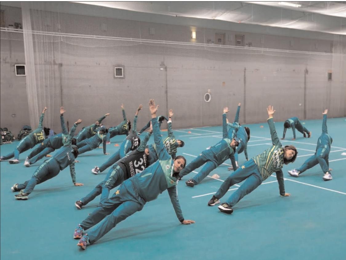
NORTHAMPTON: Pakistan's players work on their flexibility, England Women vs Pakistan Women.