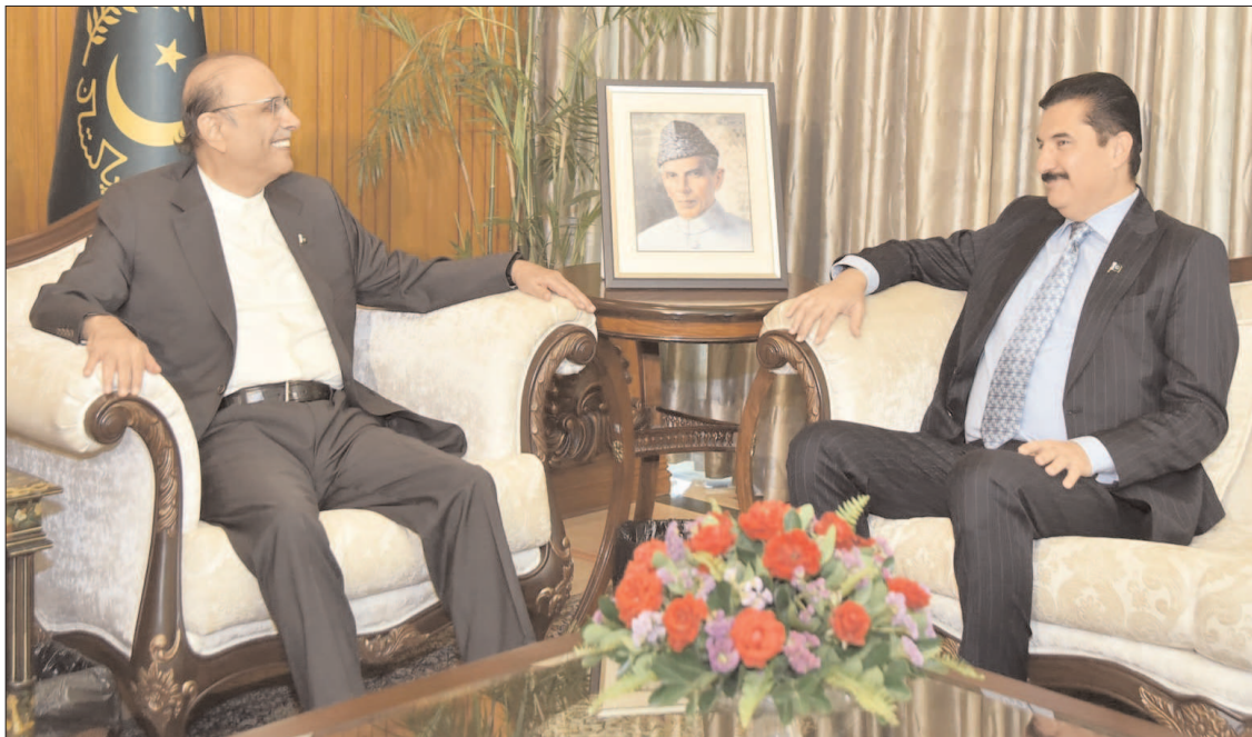
ISLAMABAD: KP Governor, Faisal Karim Kundi, called on President Asif Ali Zardari, at Aiwan-e-Sadr.

The prime minister, in a meeting with a delegation of Hurriyat leaders of Jammu and Kashmir during his daylong visit here, said that Pakistan categorically rejected the Indian unilateral and illegal actions in the Indian Illegally Occupied Jammu and Kashmir (IIOJK) regarding the revocation of its special status. He said Kashmir was an internationally recognised