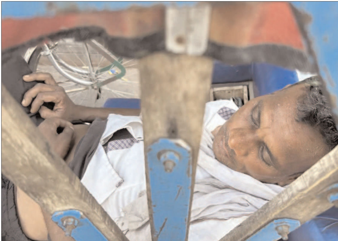
LUCKNOW: A rickshaw puller sweats while asleep as severe heat grips India.