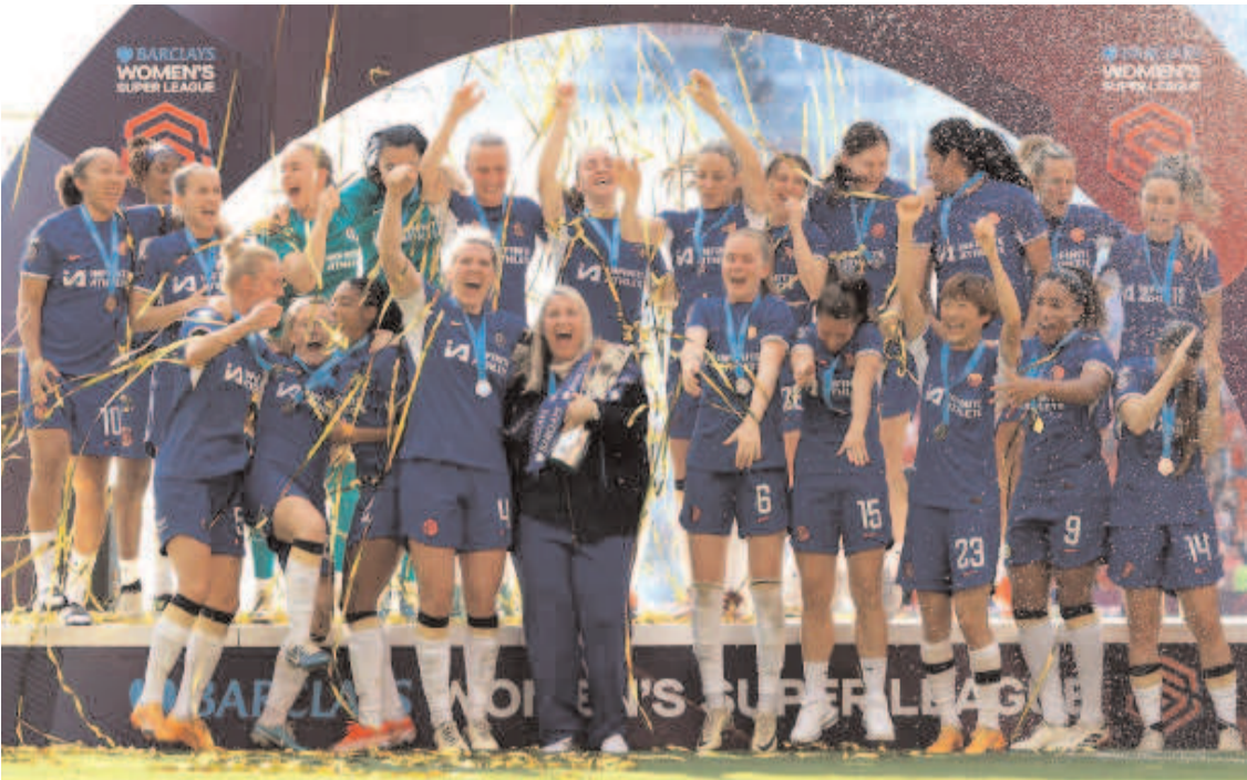
MANCHESTER, : Emma Hayes, Manager of Chelsea, celebrates as she holds the Barclays Women's Super League title trophy following the team's victory in the Barclays Women's Super League match.

"I was lapping laps today and we put fuel in the car for qualifying and just to be able to do some pit stops. Eventually I did my best lap on the very first lap with a lot of fuel in the car so I think there is more pace, but one of those days."