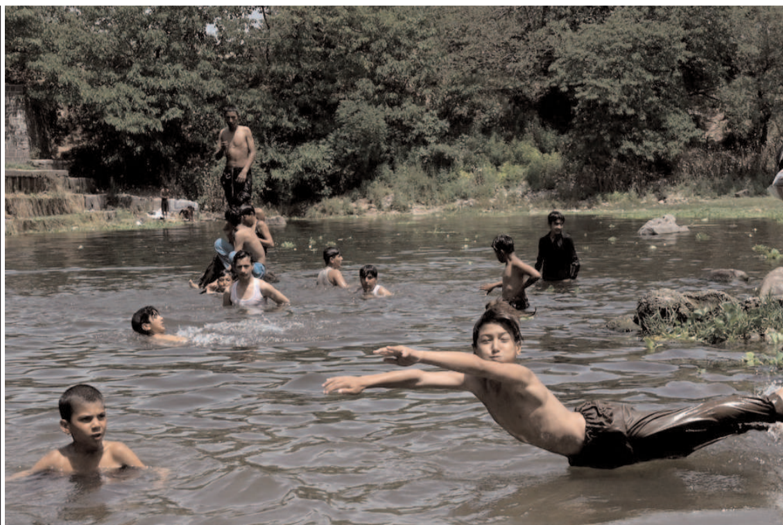
ISLAMABAD: Youngsters enjoy bathing in the pond to get some relief from hot weather in the Federal Capital.

"The absence of civic education in Pakistan has contributed to a toxic political culture that undermines democracy. This deficiency in awareness about national issues and interests has led many Pakistanis to blindly align with some specific political party/parties, disregarding rational and logical political engagement. Consequently, this blind allegiance fosters discord and division within the society," he further added.