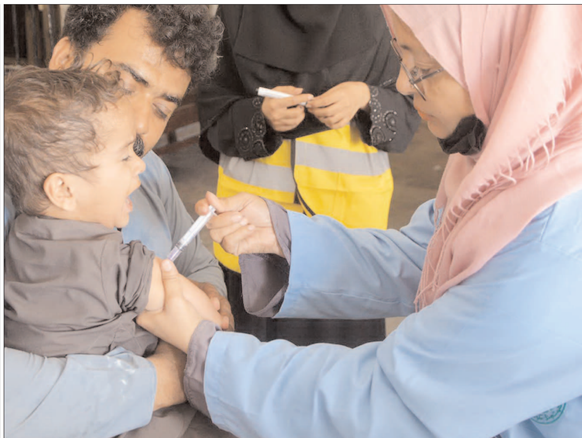
HYDERABAD: Health workers administering anti-typhoid epidemic vaccination to a child during campaign.