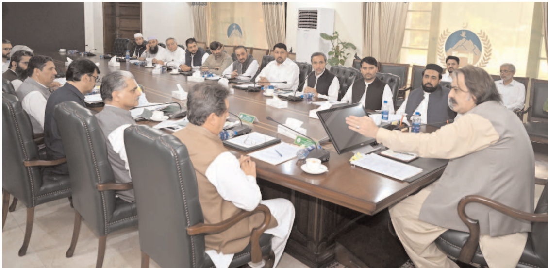
PESHAWAR: Chief Minister Khyber Pakhtunkhwa Sardar Ali Amin Gandapur chairing a meeting regarding issues of local governments.

Emphasizing the need of broadening tax-base through reforms, Fuad said according to rough estimates, nearly 30million people were paid various taxes in which salaried class also included and it is quite visible that only 120,000 members of the business community were paid over Rs 1 Million taxes every year. The SCCI chief called for reviewing IPPs to overcome the current economic crisis. He gave a proposal of issuance of all vehicle number plates at national level and to make distribution of income and tax-revenue as per population of the province. He informed KP is earning a revenue of Rs 1 Billion on head of vehicle registration and taxes while Islamabad is gaining Rs 20 Billion annually. Earlier, the participants of the conference thoroughly deliberated on various proposals for FY budget 2024-25 and expressed grave concern over the huge burden of loans on the country.