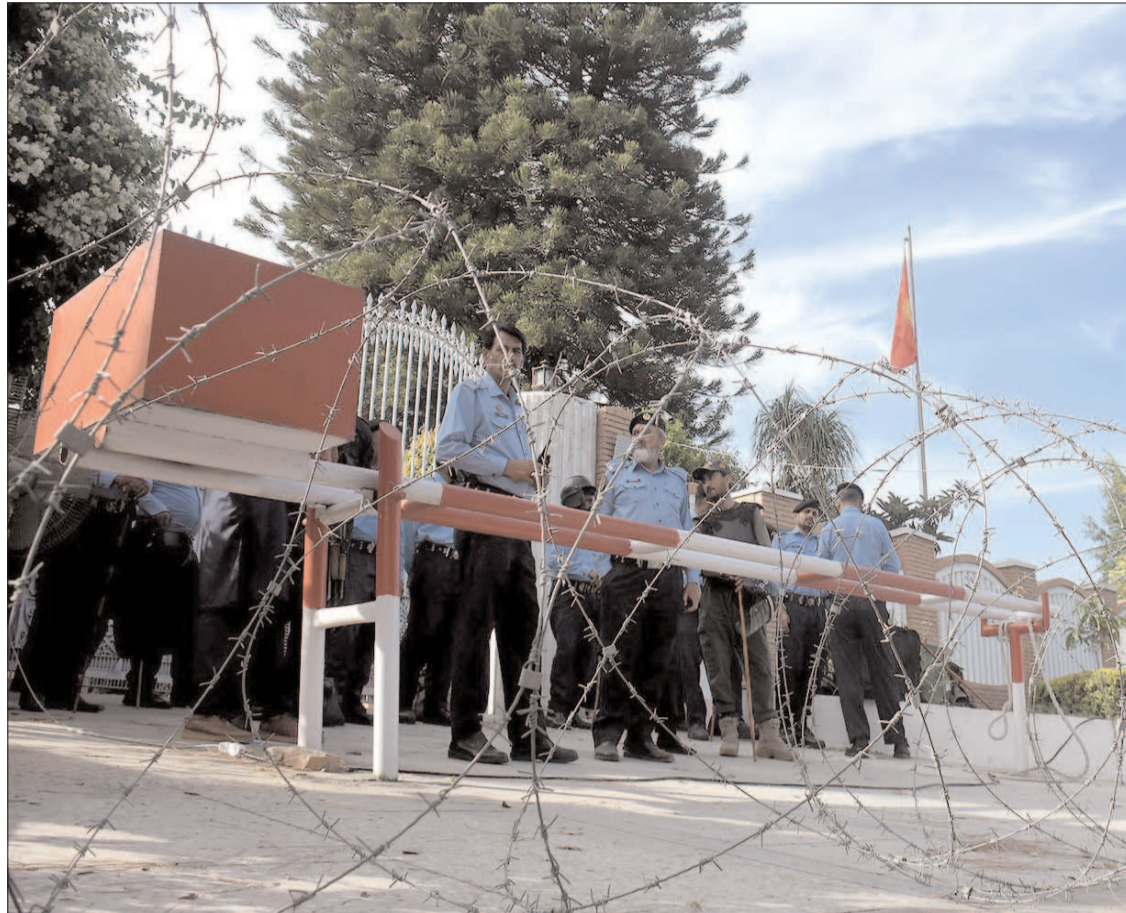
ISLAMABAD: Police officials standing alert in front of Kyrgyzstan's embassy during Islami Jamiat-e-Tulba protest against Bishkek incident.

He said that Shaheed Bhutto's policies upheld the rights of the underprivileged and the independence of the judiciary, and that Shaheed Bibi introduced several reforms to strengthen the judiciary and support the legal profession.