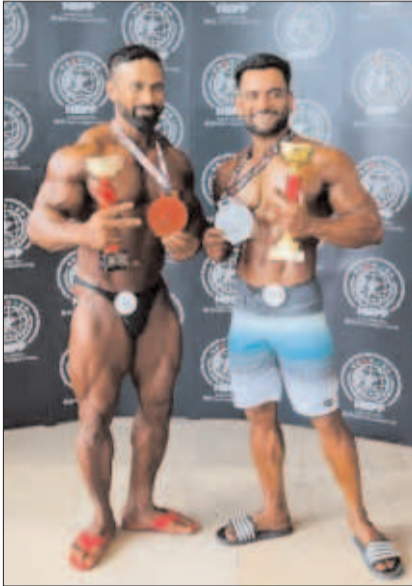
HUNGARY (Monitoring Desk): Pakistan has won two medals in the European Bodybuilding and Physique

Championship 2024, held in Hungary, marking a historic moment for the nation in this sport.