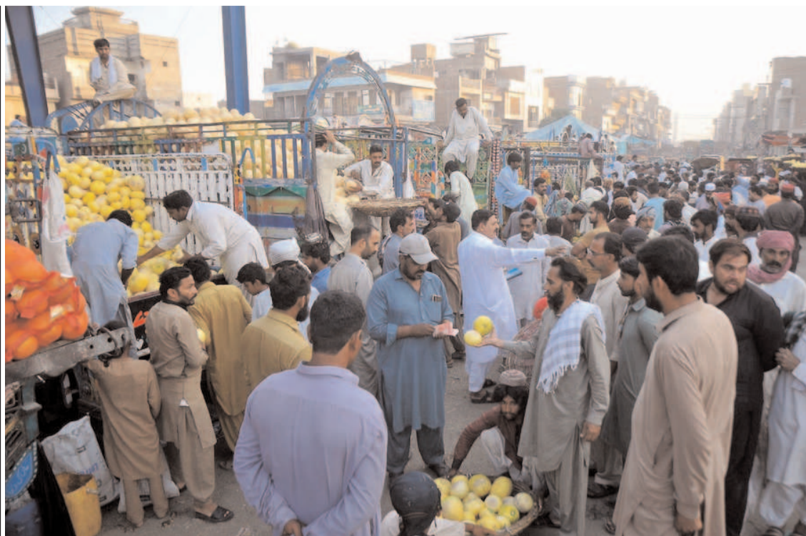
MULTAN: A large number of traders participating in bidding of seasonal fruit Melons at fruit market.

ICT sector exports of US$ 2.593 billion are the highest among all Services (40.25% of total export of services) with ‘Other Business Services’ trailing at US$ 1.308 billion.