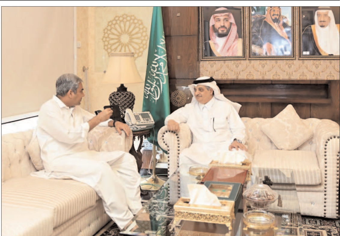
ISLAMABAD: Federal Minister for Interior Mohsin Naqvi in a meeting with Ambassador of Saudi Arabia Nawaf Bin Saeed Ahmed Al-Maliki.