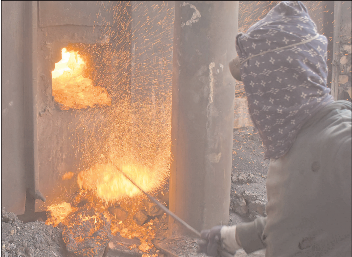
LAHORE: A Labour busy in his work at iron factory, as people enjoying World Labour Day.