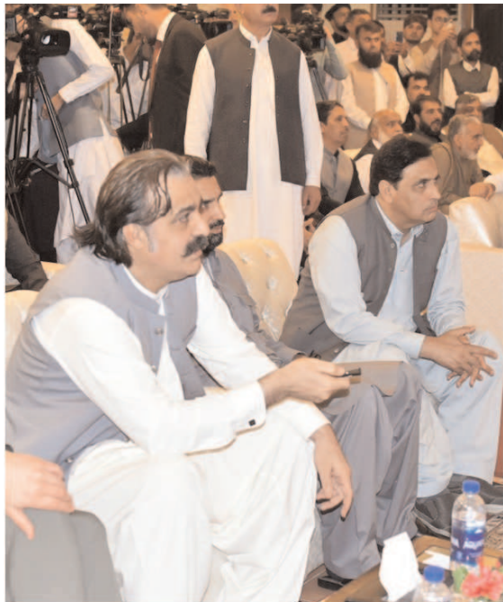
PESHAWAR: Khyber Pakhtunkhwa Chief Minister Sardar Ali Amin Gandapur witnessing the transfer of amount for the industrial workers and their children.

areas. It is also noteworthy here that the Pakistan Inter Board Chairman Committee has awarded special commendatory certificates to all educational boards of Khyber Pakhtunkhwa for conducting examinations based on the Student Learning Outcomes (SLO) system, and some complaints have been received by the education department and educational boards regarding the creation of images of papers and student cheating from some examination halls.