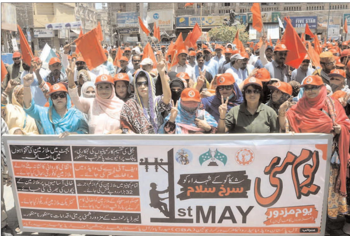
HYDERABAD: Workers of Pakistan WAPDA Hydroelectric Workers Union holing a rally on the eve of International Labour Day.