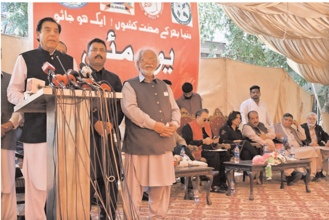
ISLAMABAD: Former Prime Minister Raja Pervaiz Ashraf addressing during function to mark the International Labour Day at National Press Club.

ISLAMABAD (APP): The Motorway Police on Wednesday fined the female driver, who was driving the vehicle recklessly and high speed at Kallar Kahar and also reported involved in misbehavior with the Motorway police officers.