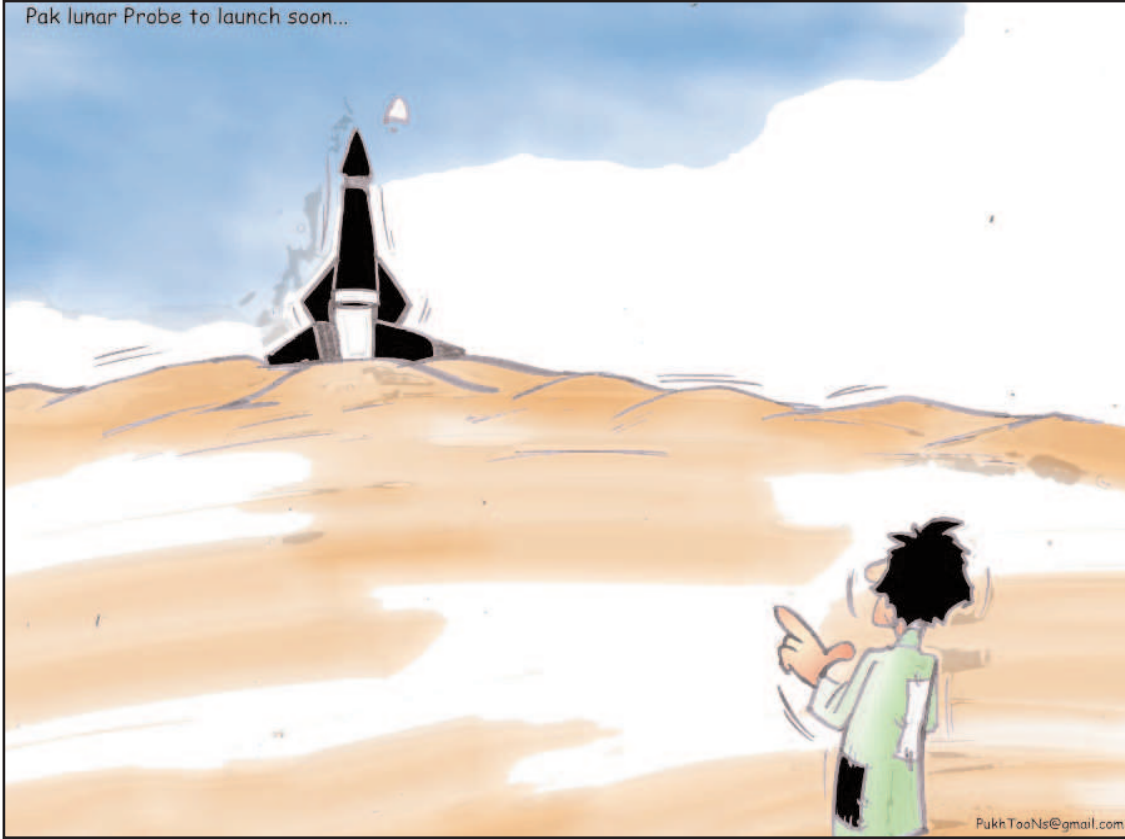
Pak lunar Probe to launch soon...

The Frontier Post will not be responsible for the comments in the articles and letters. The Frontier Post requests the writers of articles and letters to please make sure that they write their email addresses and mention the names of the cities, towns, districts or tehsil of their residences at the bottom of their articles and letters.