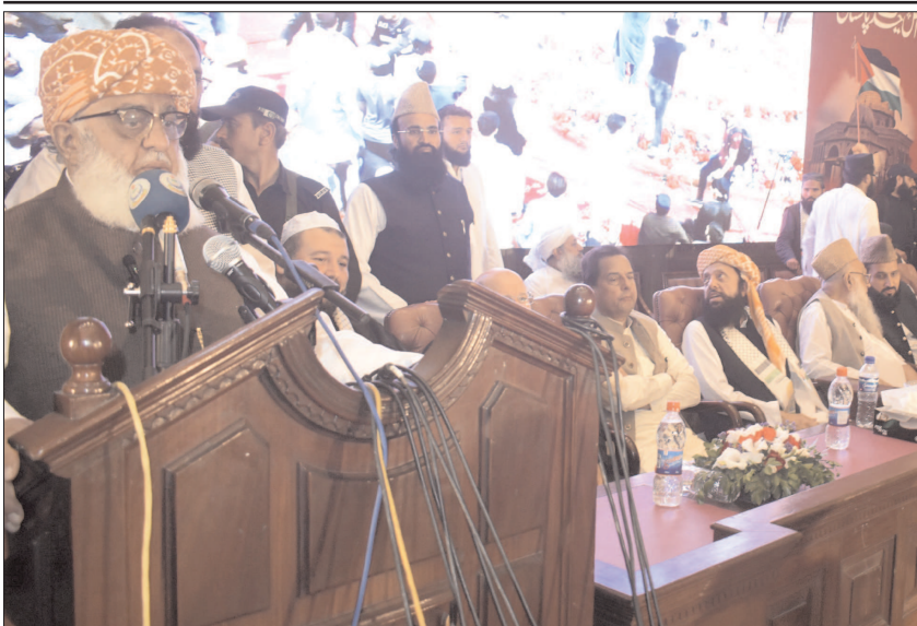
LAHORE: JUI-F chief Maulana Fazlur Rehman addressing National Palestine Conference.

The statement further emphasises, "He will underline the need to find collective solutions to challenges confronting the Muslim Ummah." On the sidelines of the summit, the deputy prime minister and foreign minister will hold bilateral meetings with leaders and foreign ministers in attendance, concluded the statement.