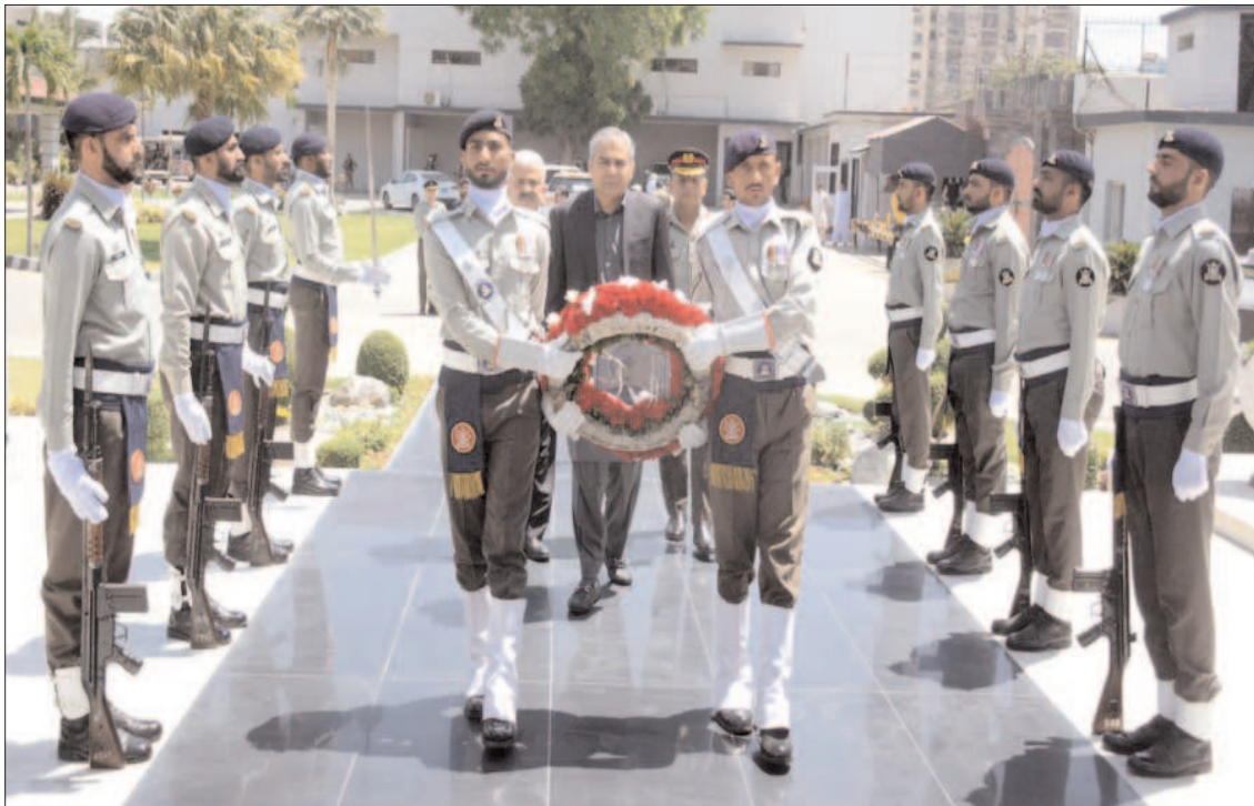
KARACHI: Interior Minister Syed Mohsin Naqvi visiting the martyr's monument (Yadgar-e-Shuhada) at the Pakistan Coast Guards Headquarters.

the well-being of their workers. He emphasized the necessity of ensuring that laborers are accorded their rightful rights and that stringent safety protocols are enforced across all workplaces.