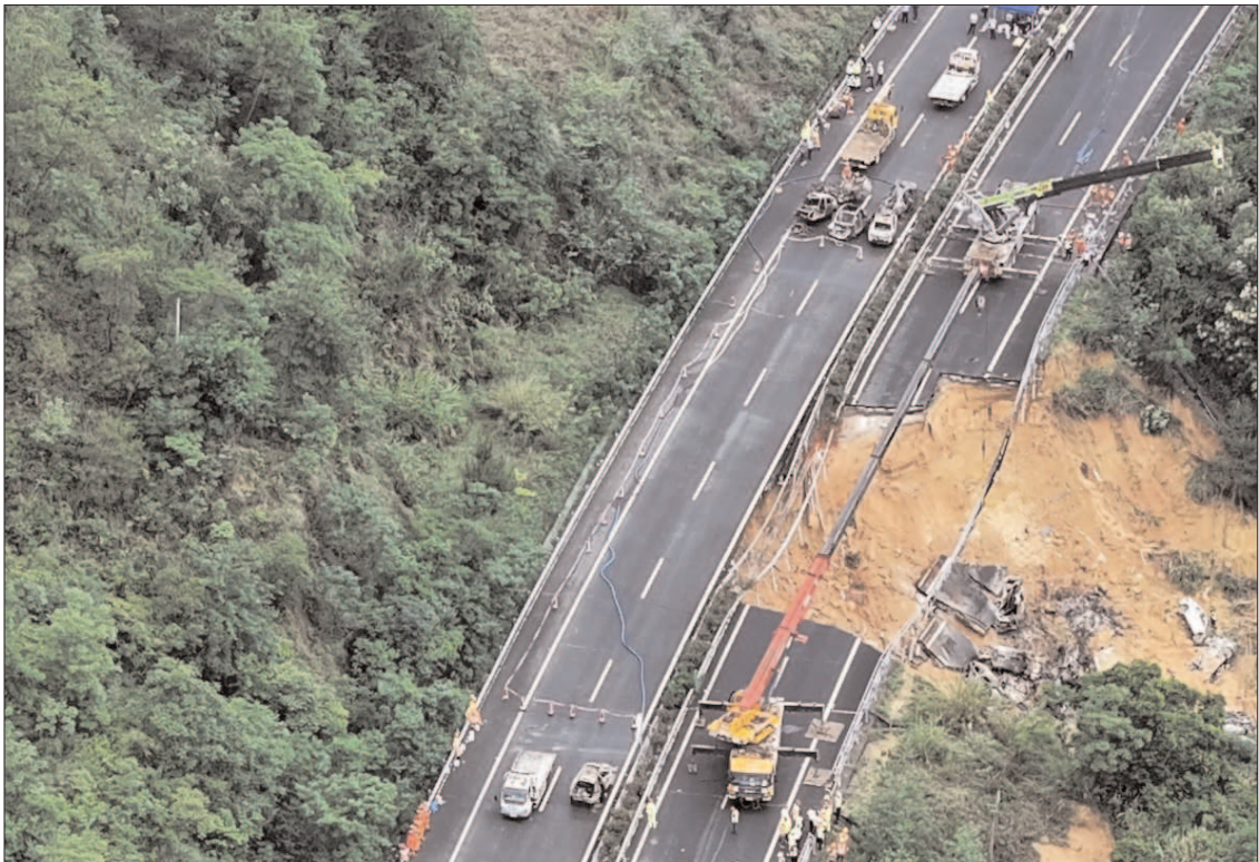
BEIJING: An aerial photo showing rescuers work at the site of a collapsed road section of the Meizhou-Dabu Expressway in Meizhou, south China's Guangdong Province.