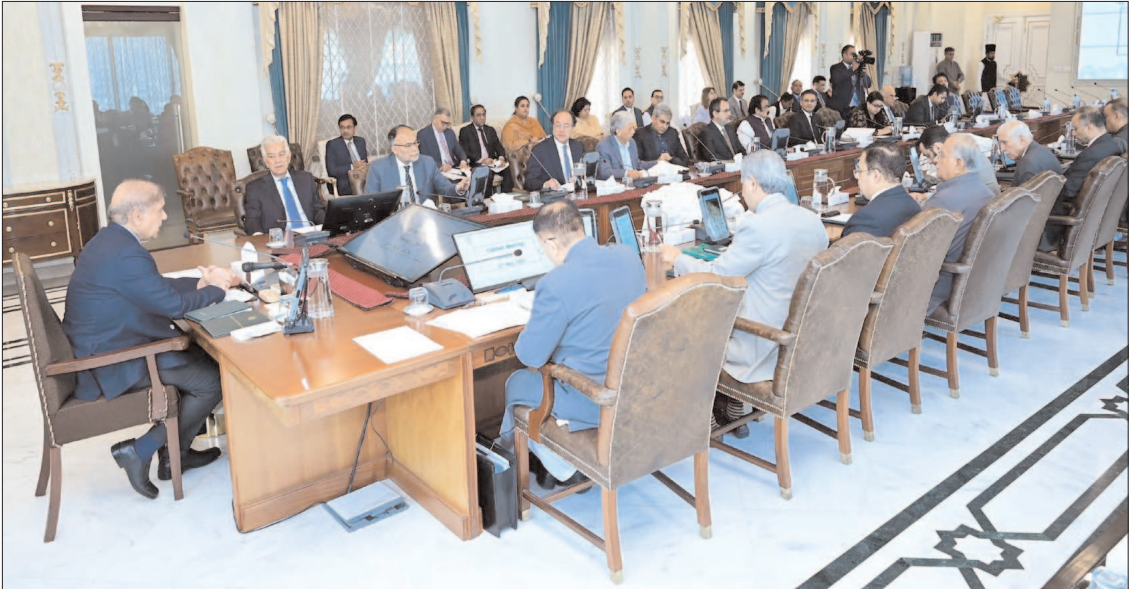
ISLAMABAD: Prime Minister Shehbaz Sharif chairing a meeting of federal cabinet.