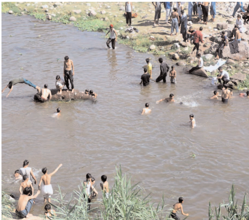
ISLAMABAD: Youngsters jumping and bathing in nullah korang to get relief from scorching hot weather in Federal Capital.

As part of the celebrations, tea companies and organizations hosted events and initiatives to promote women's empowerment in the tea sector. These include training programs, workshops, and awareness campaigns aimed at promoting gender equality and inclusivity.