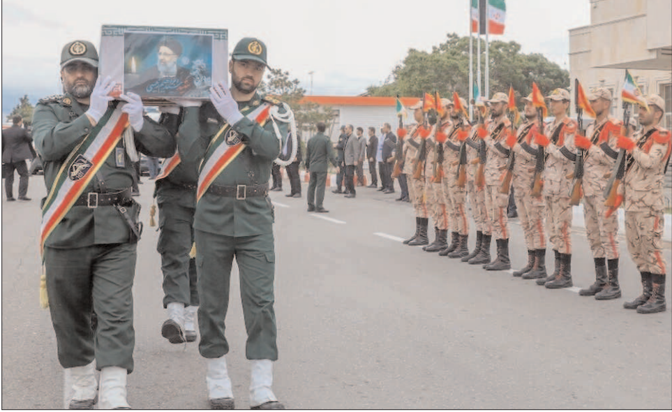
TEHRAN: Guards carrying coffin of late president Ebrahim Raisi during a funeral procession in Tabriz, capital of Iran's East Azerbaijan province.

Iran's armed forces chief of staff Mohammad Bagheri ordered an investigation into the