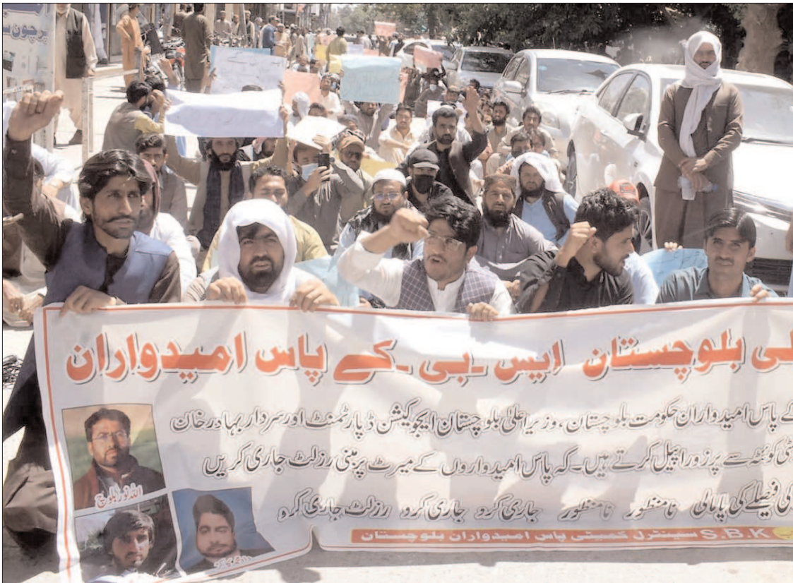
QUETTA: SB passed candidates holding a protest for acceptance of their demands.