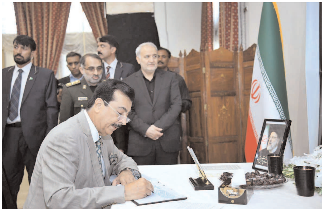
ISLAMABAD: Acting President Syed Yousuf Raza Gillani penned down condolatory remarks over the sad demise of the President of Iran Dr. Seyyed Ebrahim Raisi in the visitor's book during his visit to the Embassy of Iran.