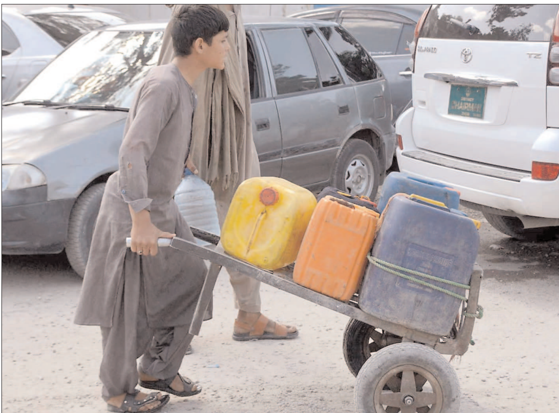
QUETTA: A boy pushing wheelbarrow loaded with empty water cans going to water filtration plant due to shortage of water supply in the City.

LARKANA: Mayor Larkana Anwar Ali Luhar met with Sindh Local Government Minister Saeed Ghani in the Sindh Assembly. According to details, Mayor Larkana discussed various issues including providing development scheme funds for the city to Local Government Minister Saeed Ghani, Mayor Larkana Anwar Ali Luhar also emphasized on new budget and increasing OZT share to strengthen the council while the Corporation. The Minister of Municipalities Sindh Saeed Ghani also gave a briefing for the welfare schemes of the employees and the office structure.