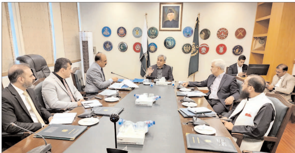
ISLAMABAD: Interior Minister Mohsin Naqvi chairing a meeting regarding NADRA.