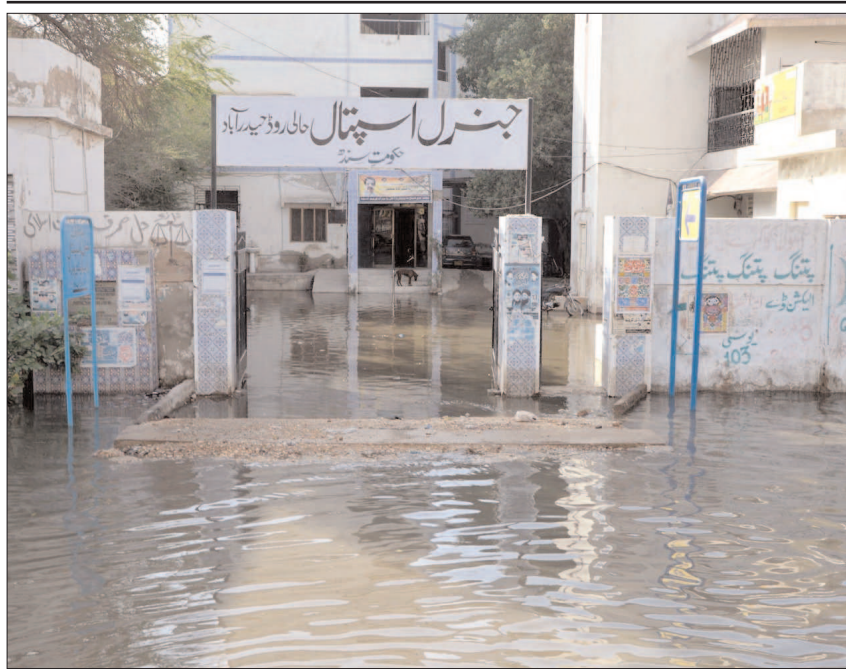
HYDERABAD: A view of accumulated sewerage water in front of General Hospital creating problems for people.

The journalists have always raised the voice of the voiceless persons in Khyber. They threatened that if the harassment of the journalists was continued then they would seek assistance from the country wide journalist communities for stern agitation.