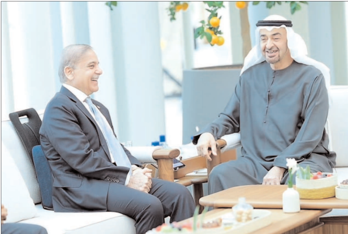
ABU DHABI: Prime Minister Shehbaz Sharif exchanging views with President of UAE Sheikh Muhammad bin Zayed Al Nahyan during a meeting.

It will be early to comment on the alliance with the other opposition parties, he replied to a question. The JUI-F leader said JUI-F would organise a ‘People’s Assembly’ in Muzzaffargarh on June 1. On meetings with the Pakistan Tehreek-e-Insaf leaders, the JUI-F leader said the party’s delegation visited Maulana Fazlur Rehman thrice. TORs needed to move forward with PTI, he added.