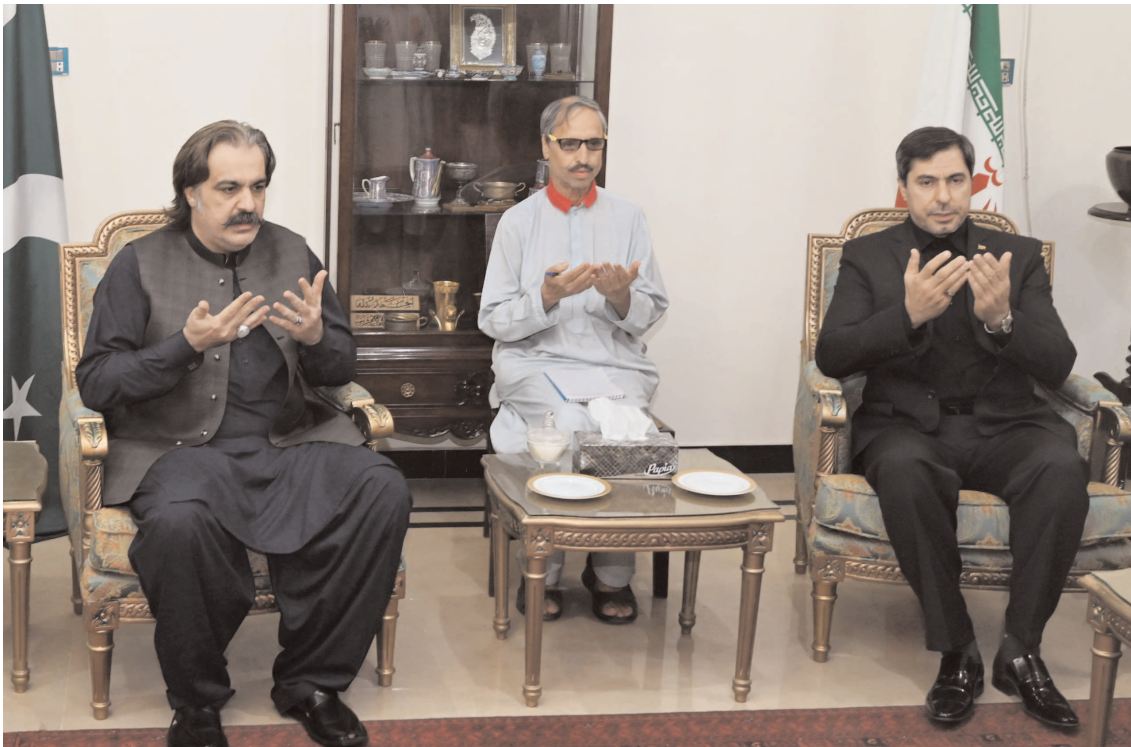
PESHAWAR: Khyber Pakhtunkhwa Chief Minsiter Sardar Ali Amin Gandapur offering fateha for the departed soul of Iranian President during his visit to Iranian Consulate.