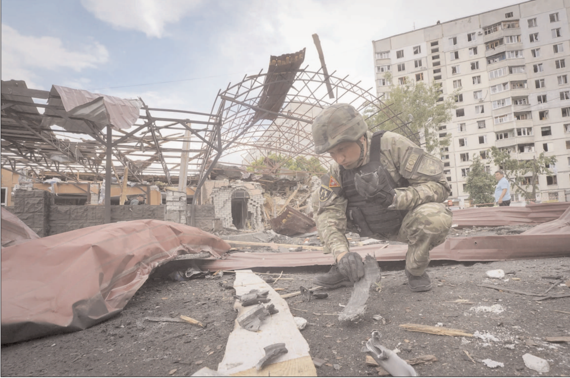
KYIV: A sapper inspects fragments of a Russian air bomb that hit a living area injuring ten in Kharkiv, Ukraine.

Organisations that do not comply with the measures will face fines of up to 25,000 lari ($9,200), followed by additional fines of 20,000 lari ($7,300) for each month of non-compliance thereafter. Critics have accused Georgian Dream, which has been in power since 2012, of taking inspiration from Russian legislation used to quash dissent. — Aljazeera