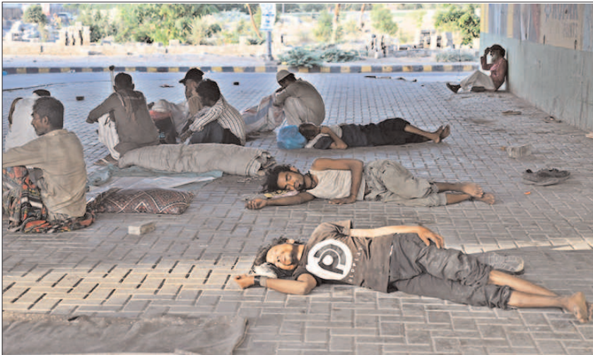
KARACHI: People taking nap under the bridge during extreme hot weather in the city.