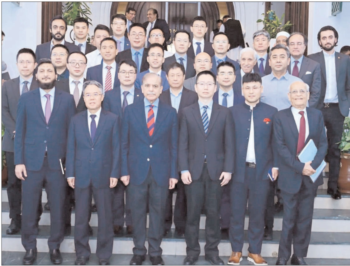
ISLAMABAD: Group photo of Prime Minister Shehbaz Sharif with Chinese Ambassador in Pakistan and representatives of Chinese companies working in Pakistan.

Responding to a calling attention notice, Minister for Power Sardar Awais Ahmad Leghari has reiterated Federal Government's commitment to fund solarization of agricultural tube-wells in Balochistan. He said as soon as the Balochistan government formulates a mechanism for distribution of funds to the consumers, the Federal Government will start implementation of the initiative.