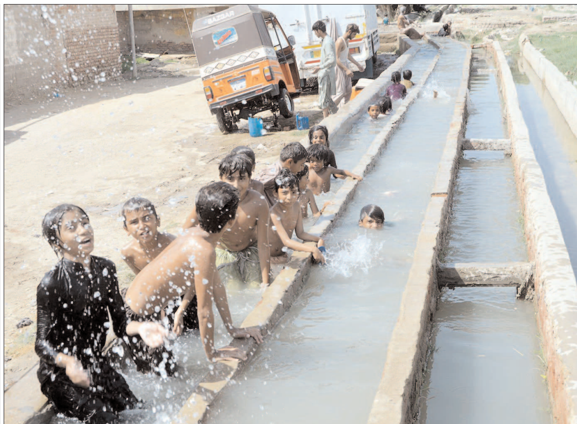
HYDERABAD: Youngsters enjoying in a tube well at Hala Naka.