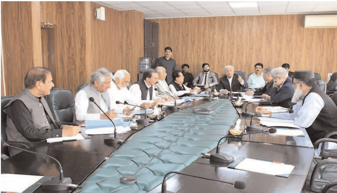
ISLAMABAD: Federal Minister Industry's production and food security Rana Tanveer chaired high level meeting regarding supply chain and prices of fertilizer.