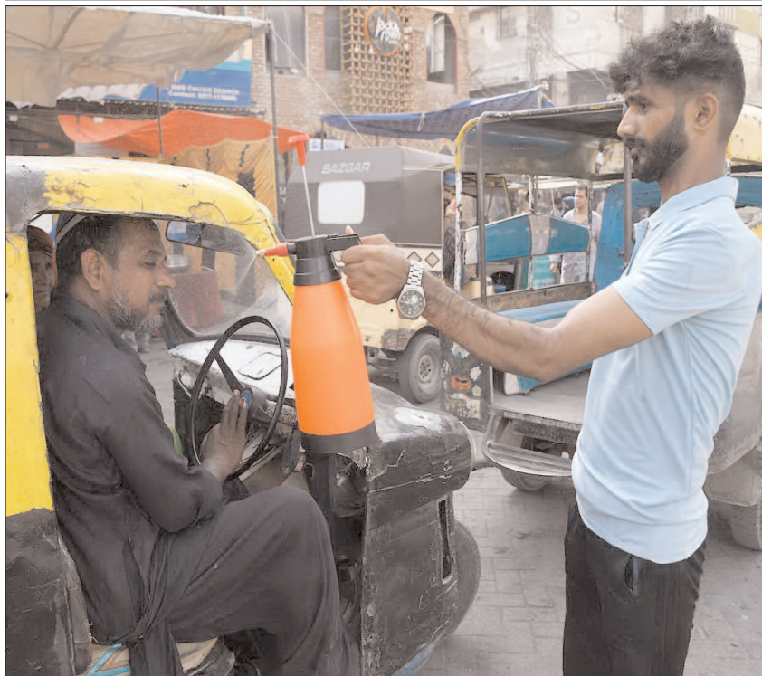
HYDERABAD: volunteer spraying water on a driver's face during very hot weather.

The detainees were wanted by police in various criminal cases. The police took the recovered arms into custody and shifted the injured robbers to hospital.