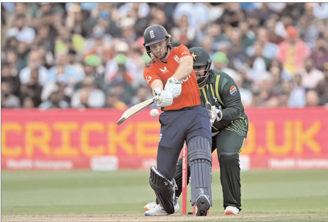
EDGBASTON: Jos Buttler bludgeoned 84 off 51 balls.

LONDON (AFP): Former England and Manchester United captain Wayne Rooney was appointed as the new manager of Championship side Plymouth on Saturday. A move to Argyle is the fourth managerial role of Rooney's coaching career, which has so far failed to live up to his stellar playing days. "Taking this role at Plymouth Argyle feels like the perfect next step in my career," said Rooney in a club statement. "This is an opportunity to be part of an exciting project. I look forward to helping to build a squad of players to play expansive football – and to entertain the Green Army." The 38-year-old was sacked after just 83 days in charge of Birmingham earlier this year. Rooney won just two of his 15 matches in charge of the Blues, which contributed to their relegation to League One. He previously had a short spell with former club DC United in Major League Soccer.