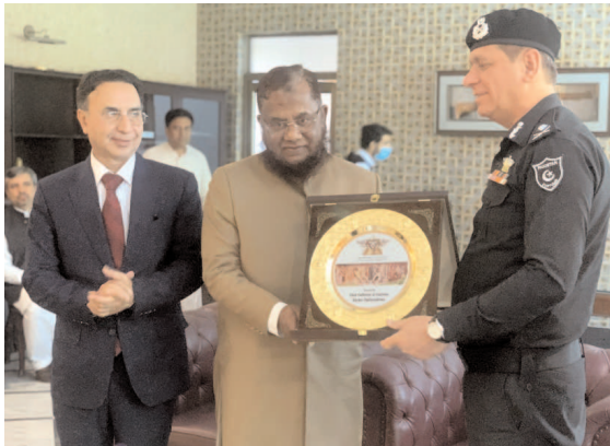
Yadgar-e-Shuhada in Customs House, Peshawar. While addressing the Customs and IRS officers the Honourable FTO advised them to always abide by law, avoid delays and try to give relief to the taxpayers as per law. Chief Collector Customs KP at the end presented a shield to the honourable FTO.