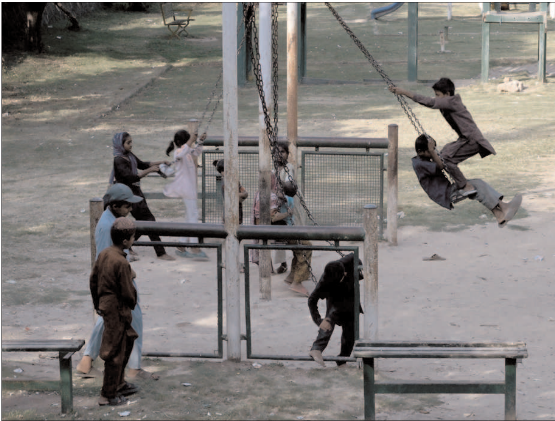
ISLAMABAD: Children enjoy swing at G 7 Park in the Federal Capital.

ISLAMABAD (APP): Renowned Urdu language poet Meeraji was remembered on the occasion of his birth anniversary on Saturday. Born on May 25, 1912 in a Kashmiri family of Gujranwala his real name was Mohammed Sanaulah Dar. He passed his childhood days in Lahore and he began composing poetry when he was at school. Later, he adopted his pen name Meeraji. Though brought up in affluent surroundings, Meeraji left his home and family and chose to lead the life of a homeless wanderer, mostly staying with his friends and making a living by selling his songs. Meeraji is considered to be one of the pioneers of symbolism in Urdu poetry, and especially introducing free verse. Along with Noon Meem Rashid, he was a leading poet of the Halqa-e Arbab-e Zauq, which broke away from the classic convention of Radeef and Qafia and explored the rich resources of blank verse and free verse.