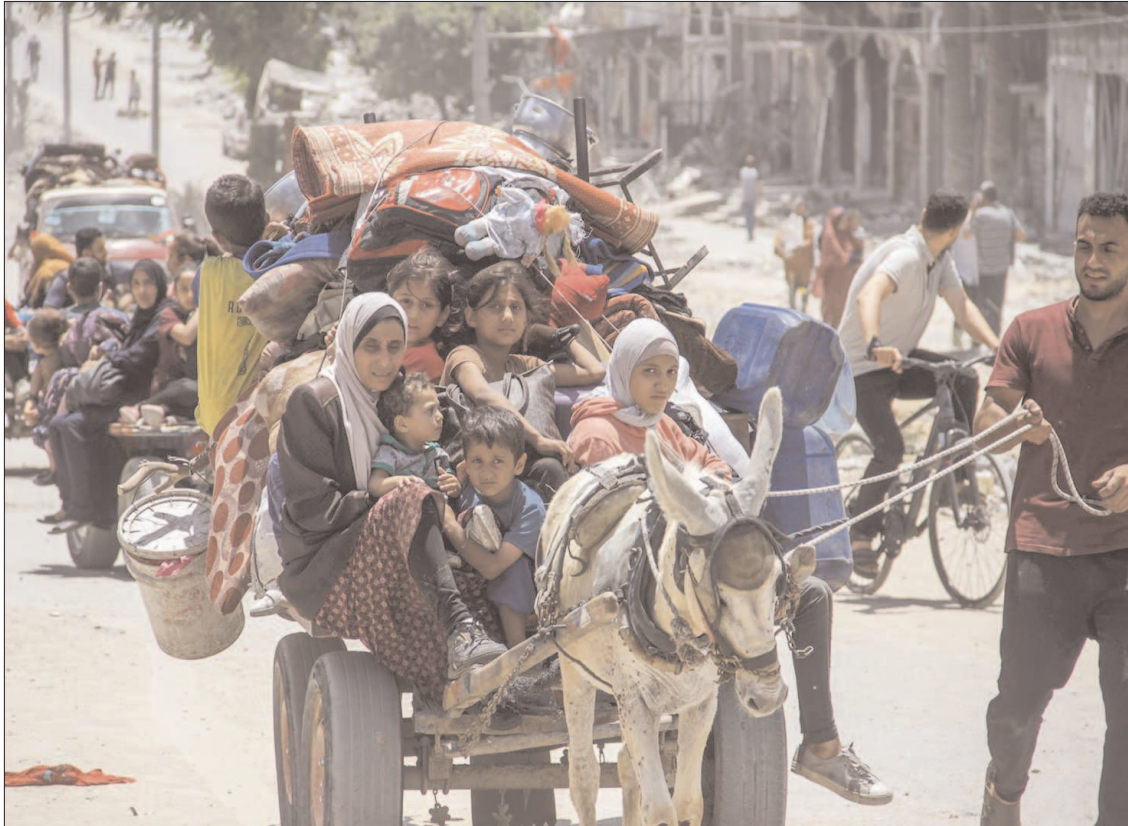
GAZA STRIP: Paestian families using donkey carts as they fleeing their areas due to continues attacks from Israeli forces.