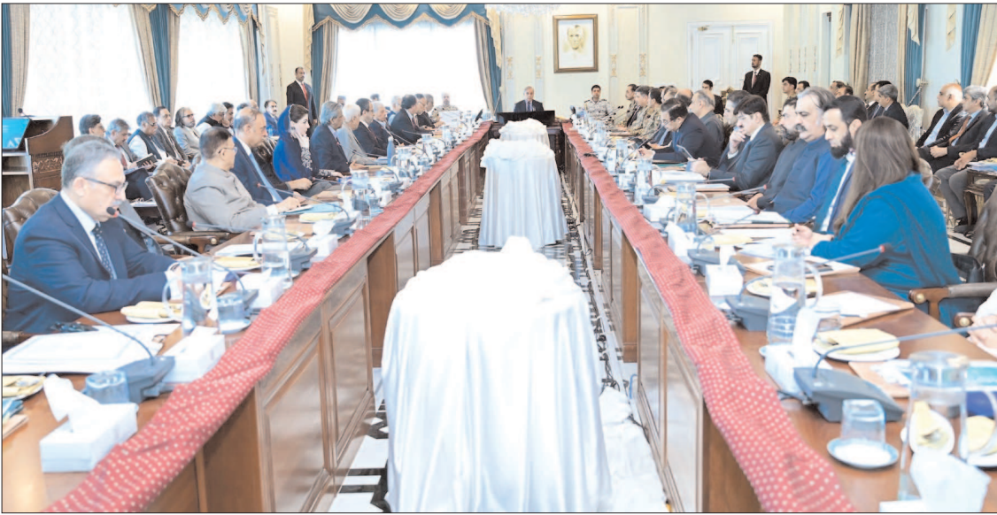
ISLAMABAD: Prime Minister Shehbaz Sharif chairing 10th meeting of the Apex Committee of Special Investment Facilitation Council.

Vol. XXXIXI No. 123 Regd. No. 241 ZIQAAD 17 1445 -- SUNDAY, MAY 26 2024 PESHAWAR EDITION 12 PAGES PRICE. 30