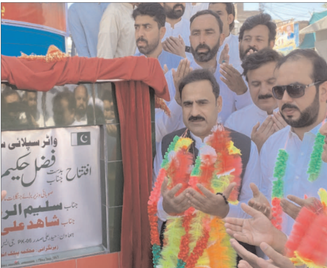
MINGORA: KP Minister for Forests, Fazal Hakeem Khan inaugurating water supply scheme in Swat.

OKARA (INP): A couple was injured when an over speeding car hit a motorcycle here on Saturday, police said. A reckless driven car knocked down a motorcycle carrying a couple in suburbs of Okara city.