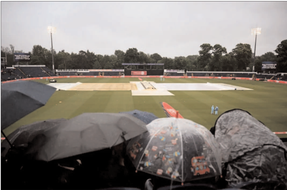
CARDIF: Rain delayed the toss in the third T20I in Cardiff, England vs Pakistan 3rd T20.

Ruud was beaten in straight sets by Novak Djokovic in last year's final following a one-sided loss to Rafael Nadal in the 2022 showpiece.