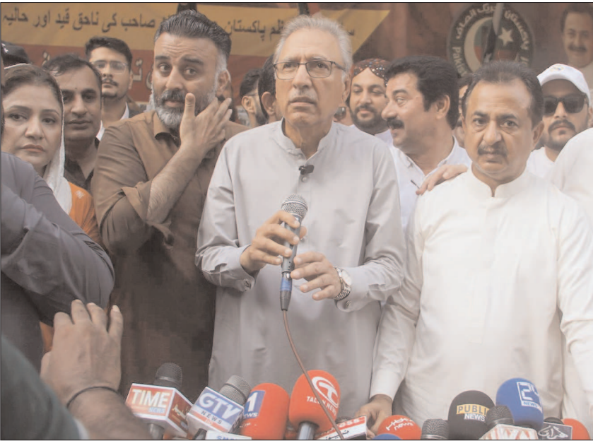
KARACHI: Former president, Dr. Arif Alvi talking to media persons during PTI protest.

Chairman PPP salutes the dedication and expertise of our scientists and all those who have been instrumental in making Pakistan a formidable nuclear power. "These heroes embody the resilience and brilliance of our nation," he added.