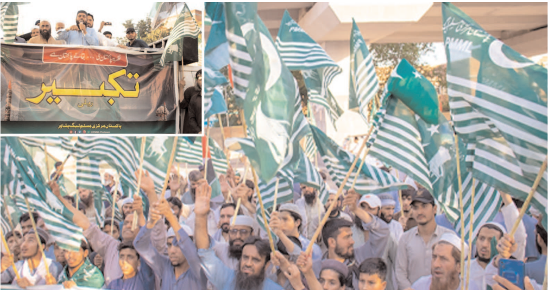
PESHAWAR: Workers of PML-N participating in a rally in front of Peshawar Press Club to celebrate Youm-e-Takbeer.