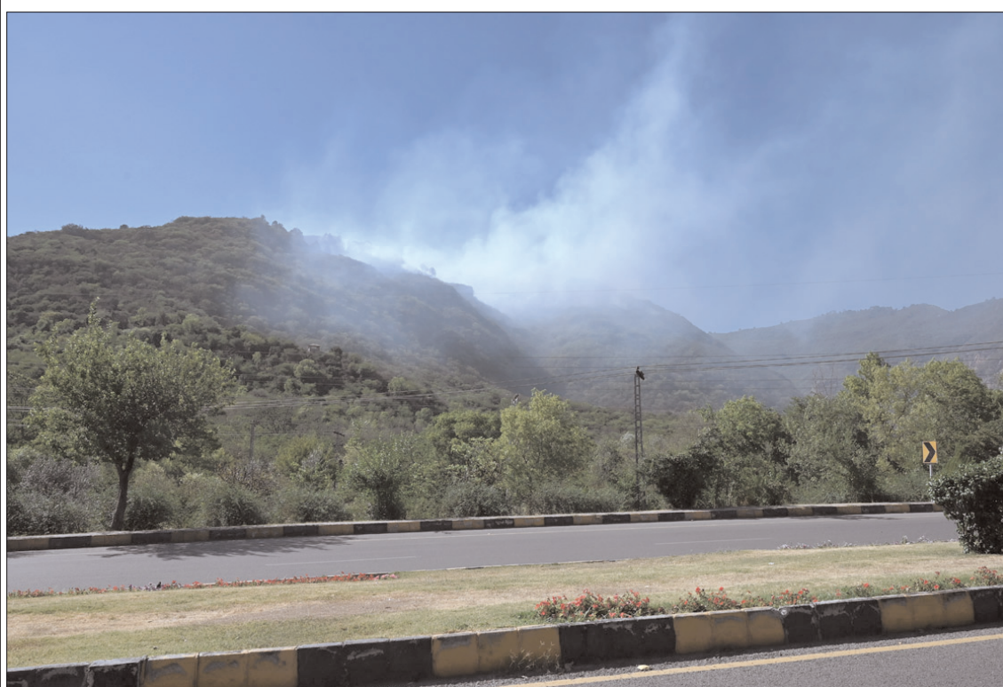
ISLAMABAD: A major fire that broke out range on Margalla Hills was extinguished heat wave in the federal Capital.

The Chairman of CDA was briefed that the Discipline Directorate is actively handling inquiries. Nearly 60 inquiries have been concluded in the last 4 to 5 months, with 55 new inquiries initiated during the same period.