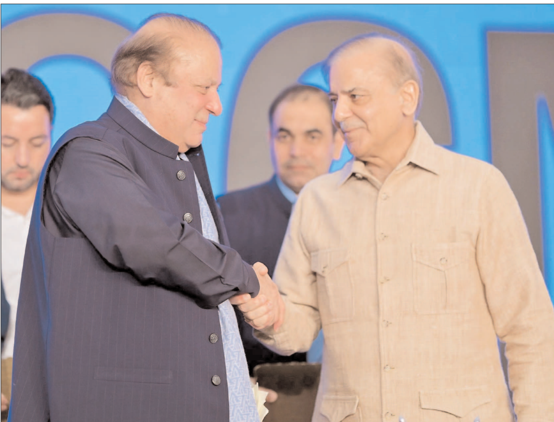
LAHORE: Prime Minister Shehbaz Sharif congratulating Nawaz Sharif on being elected unopposed as president of PML-N.