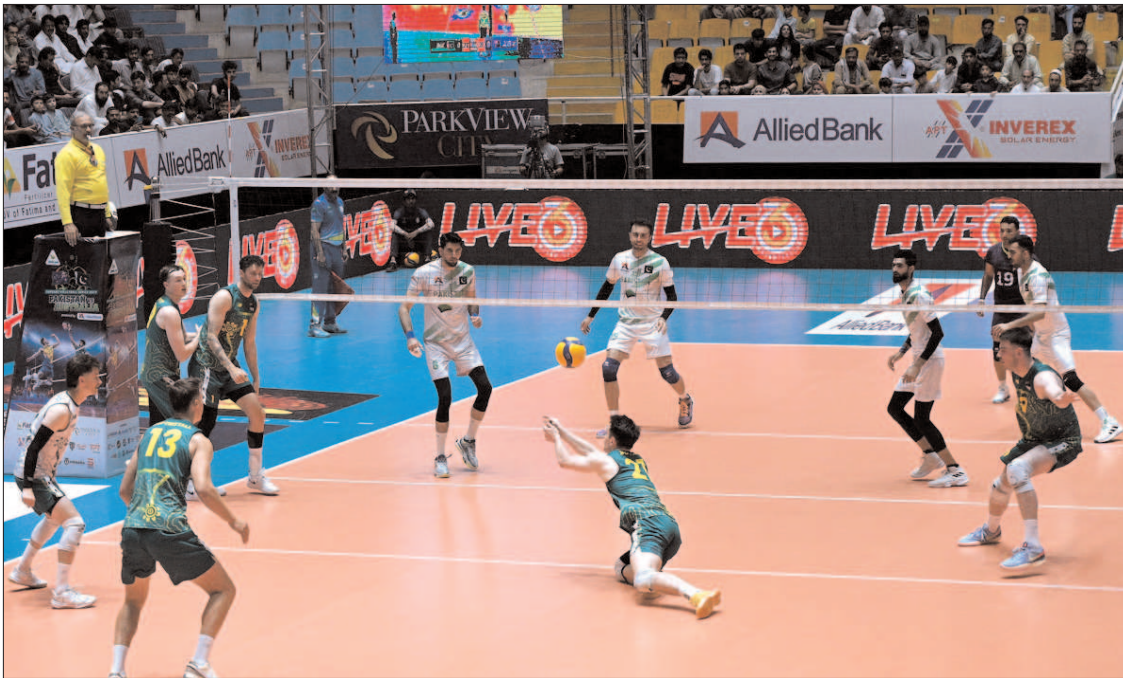
ISLAMABAD: Australian and Pakistani volleyball players compete during a volleyball match at Sarfraz Volleyball Series at sports complex.

Netherlands shock Sri Lanka in T20 WC warm-up LAUDERHILL (Web Desk): Netherlands handed a 20-run upset defeat to Sri Lanka in the ICC Men's T20 World Cup 2024 warm-up fixture at Central Broward Regional Park Stadium here on Tuesday. Put into bat first, the Netherlands registered a commendable total of 181/5 in the allotted 20 overs. Meanwhile, former champions Sri Lanka only managed 161 in response and thus succumbed to a shock loss heading into the ICC Men's T20 World Cup 2024.