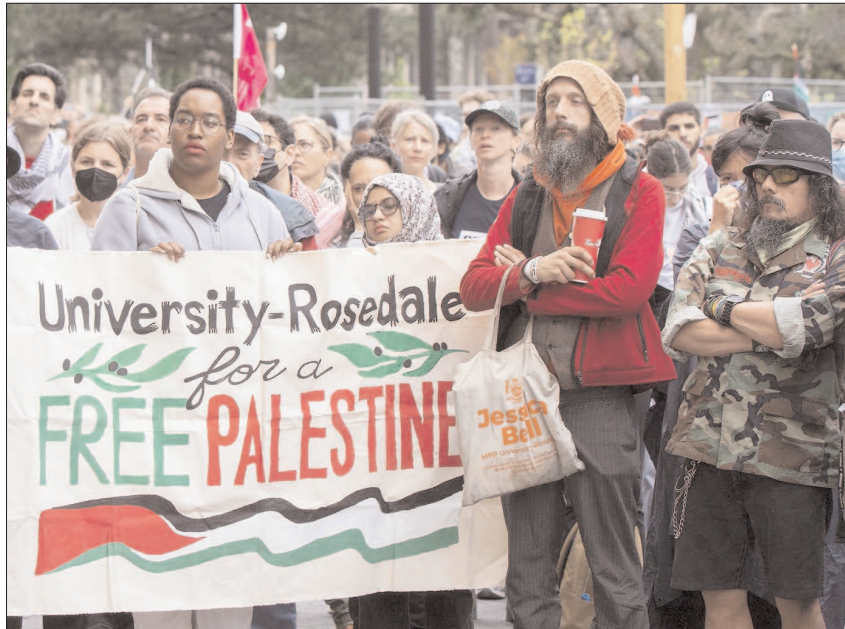
OTTAWA: Students of University of Toronto holding a protest rally against Israeli's attacks on Rafah.

The PML-N president said that he was ousted from the Prime Minister's Office in 2017 through a "conspiracy". Nawaz Sharif said a "conspiracy" against his government was hatched in London, adding that his political opponents, who had returned from London, staged a sit-in. Nawaz Sharif said that during the sit-in, a message was sent to him in which he was asked to resign or be ready for dire consequences. "I told them to do whatever they want, but Nawaz Sharif will never resign," the PML-N president said. Referring to the May 9 riots, he said that he was the one who stand with May 28th (Pakistan's nuclear tests day), not with May 9th.