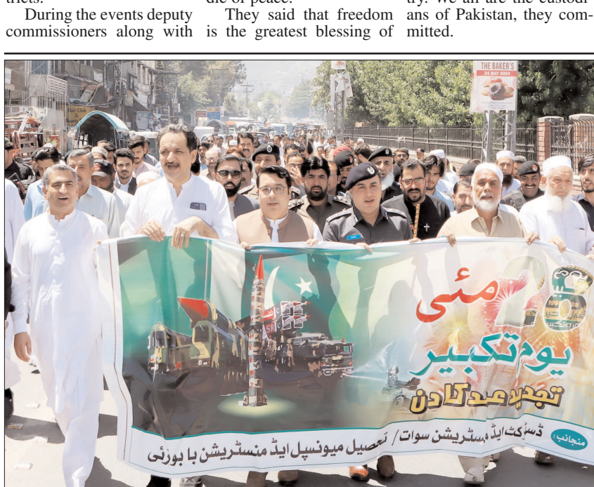
MINGORA: People and district administration officials holding a rally in connection with Youn-e-Takbeer.