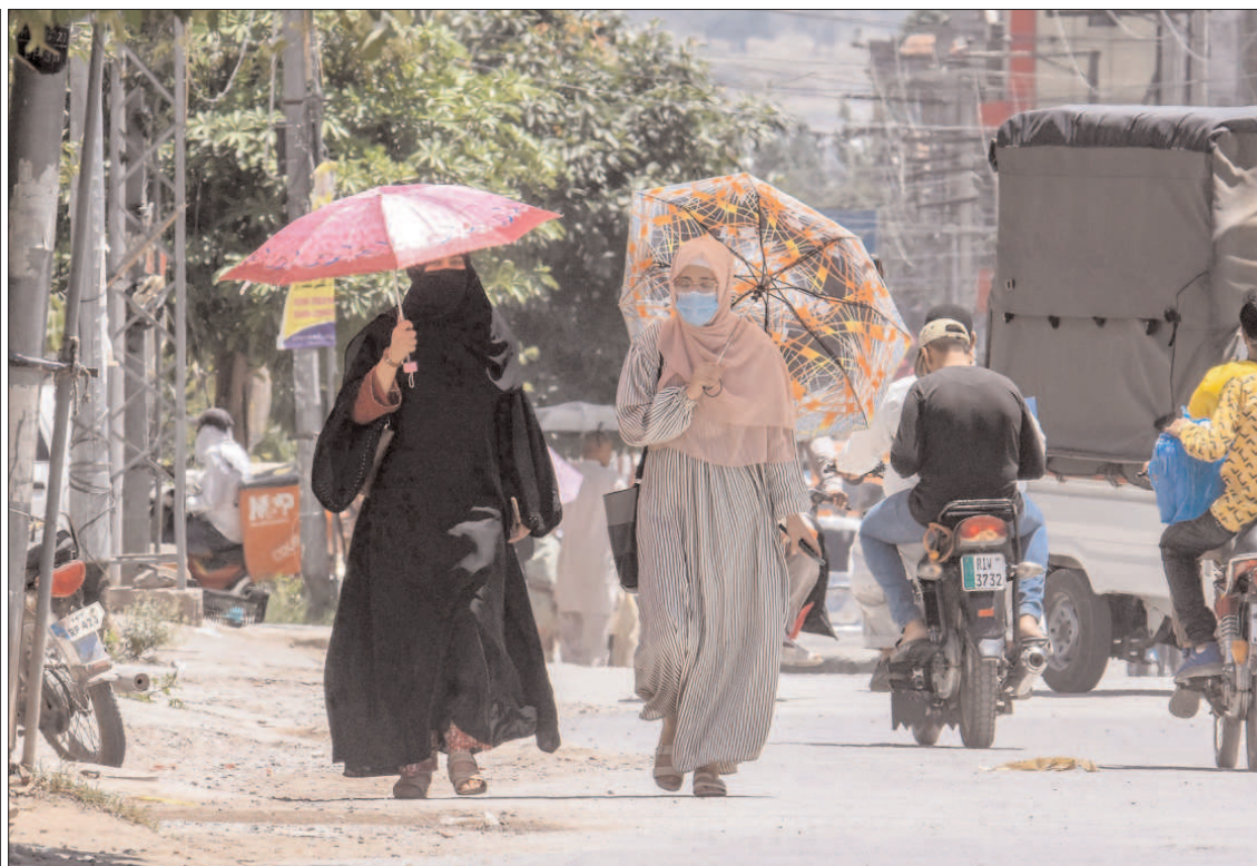
ISLAMABAD: Ladies on the way under the cover of umbrellas to protect them from sunstroke during a hot weather at Ghouri Town.

The release of water at Kalabagh, Taunsa, Guddu and Sukkur was recorded as 222,500, 158,700, 90,100 and 40,400 cusecs respectively. Similarly, from River Kabul, a total of 99,300 cusecs of water released at Nowshera and 35,900 cusecs released from River Chenab at Marala.